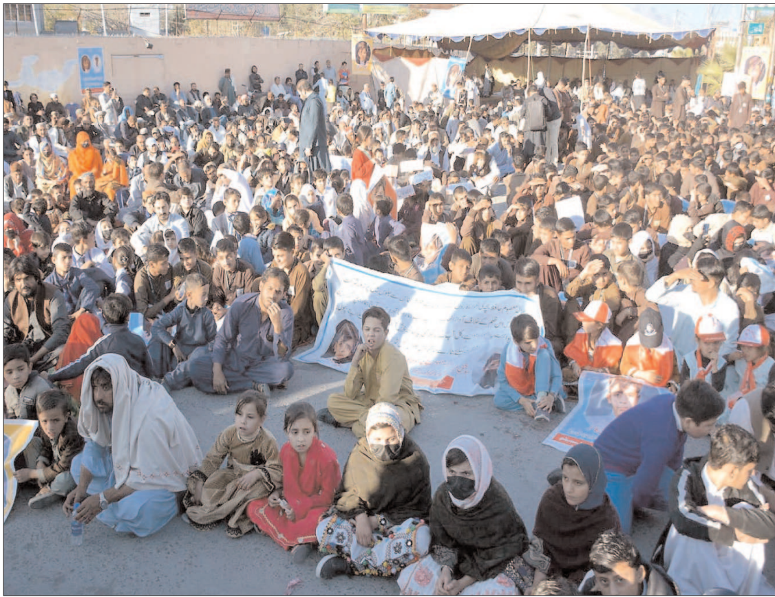
QUETTA: Students and local people participating in a protest for recovery of missing persons at Balochistan Assembly Chowk.

Biden's successor, President-elect Donald Trump, has said he will end the war, without saying how. The warring sides have interpreted this as likely to involve a push for peace talks — not known to have been held since the war's earliest months — and are trying to seize a strong position before negotiations. The Storm Shadows have a range in excess of 250 km (155 miles) and would give Ukraine the ability to hit targets far deeper into Russia than before. Kyiv says Moscow, which invaded Ukraine in February 2022, has previously taken advantage of limits on its use of weapons, particularly to strike Ukrainian cities from the air with heavy guided bombs. Western countries say the arrival of more than 10,000 North Korean troops to fight for Russia in recent weeks was an escalation that merited a response. The first use of the US ATACMS on Tuesday, fired at a Russian arsenal in the Bryansk region, prompted firm words from Moscow, which announced a change to its nuclear doctrine to lower the threshold for the use of atomic weapons.