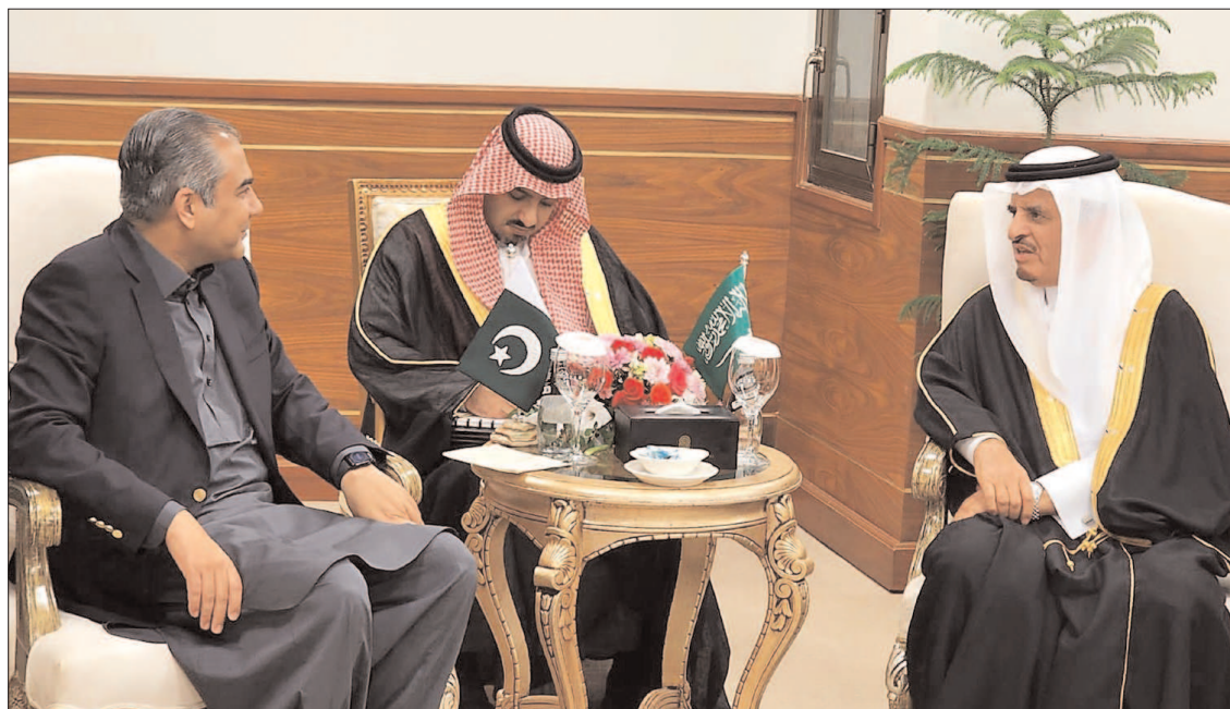
ISLAMABAD: Federal Minister for Interior Mohsin Naqvi in a meeting with Saudi Deputy Interior Minister Nasser bin Abdulaziz Al-Daoud.

The DG assured that only legally approved housing schemes would be allowed to operate in future and all such schemes would be monitored to ensure the safety and security of public investments.