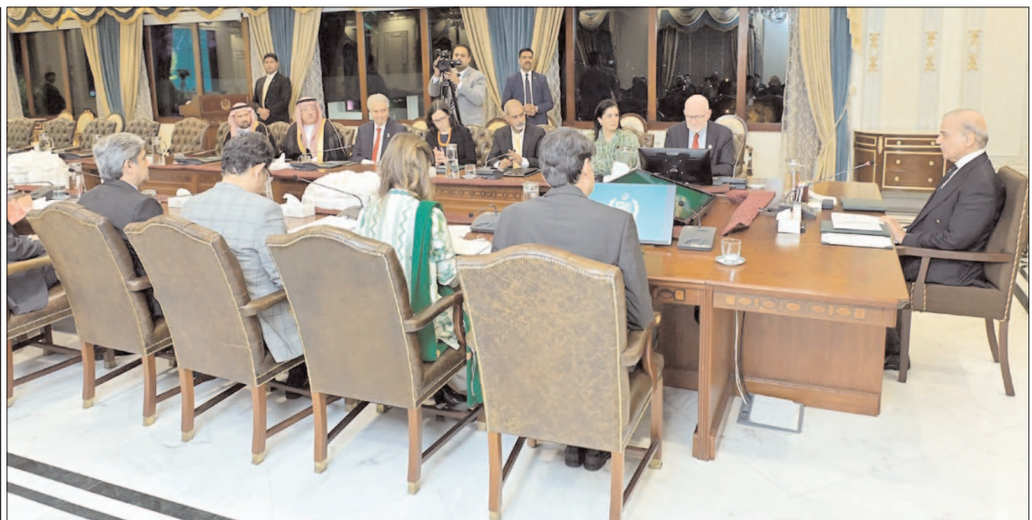
ISLAMABAD: A delegation of Polio Oversight Board called on Prime Minister Shehbaz Sharif.