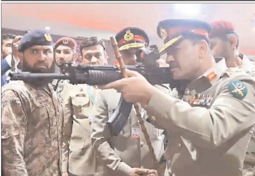
KARACHI: Chief of Army Staff, General Syed Asim Munir inspecting a latest rifle during his visit to International Defence Exhibition and Seminar (IDEAS-2024) at Expo Centre.