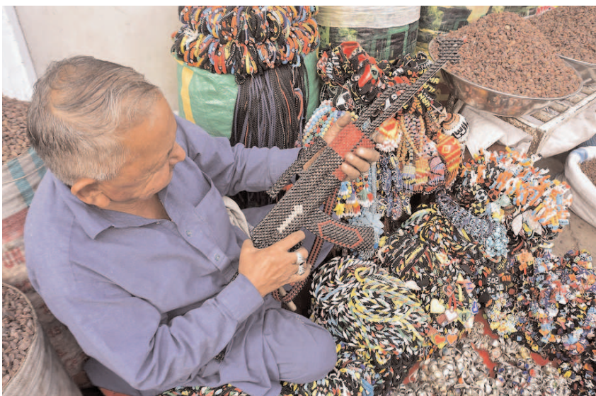
PESHAWAR: A man selling handmade decoration gun along roadside.