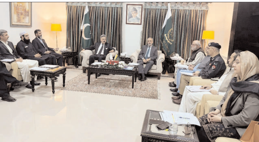
ISLAMABAD: Chief Justice of Pakistan, Justice Yahya Afridi, presiding over a meeting on jail reforms.

Sources also reveal that a blacklisted company has been reintroduced into the MCC process, and the inquiry committee has selectively focused on the 2023-2024 procurement records, ignoring earlier years, raising further questions about transparency.