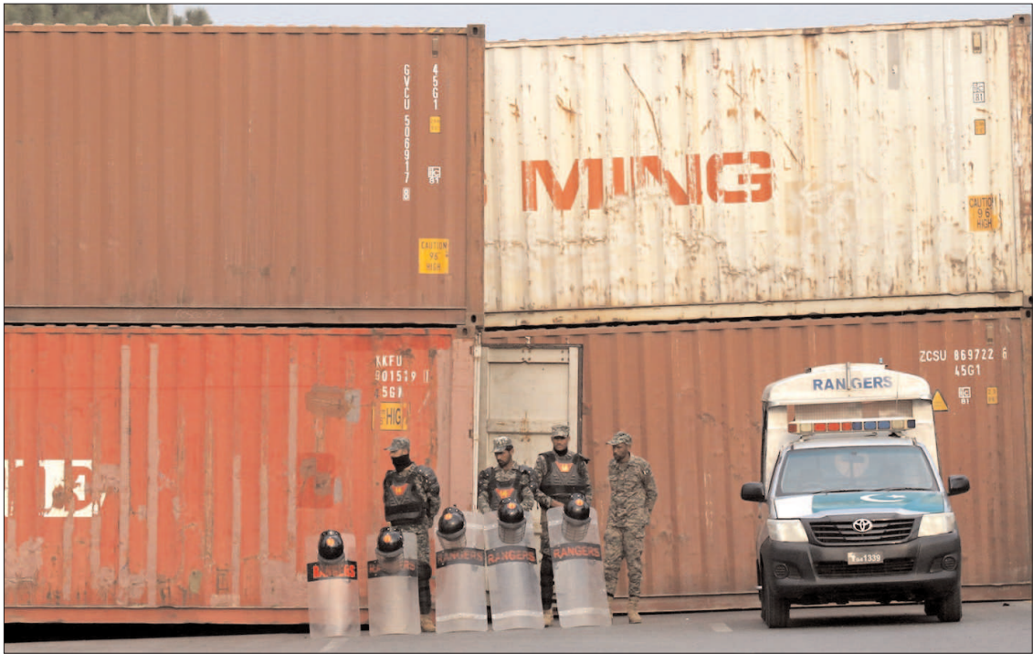
ISLAMABAD: Rangers personnel standing next to containers placed due to PTI protest.