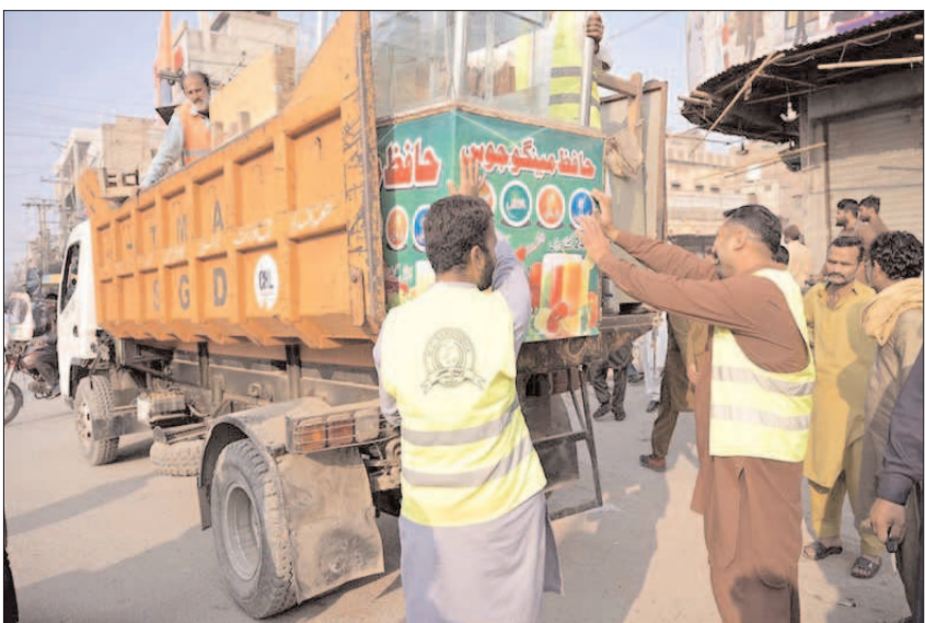
SARGODHA: Action against encroachments, Municipal workers remove unauthorized setups at Noori Gate.

"BRSP has been implementing NPGP with the financial support of IFAD and the government of Pakistan since 2020 on various poverty-alleviation initiatives to improve the livelihoods of those living in extreme poverty in Balochistan, including Zhob district.