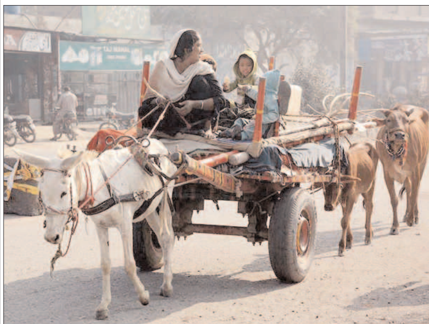
FAISALABAD: Gypsy family traveling on a donkey cart heading towards their destination.

It is worthy to mention that last night armed dacoits looted dozens of vehicles on Buner-Mardan highway while also took away Computerized National Identity Cards from passengers and told them it (CNICs) to be delivered to the victims. The victims approached nearest police post but they denied actions as they (policemen) neither unauthorized to act nor able to register First Information Report. There are three police posts on the route but to no veil.