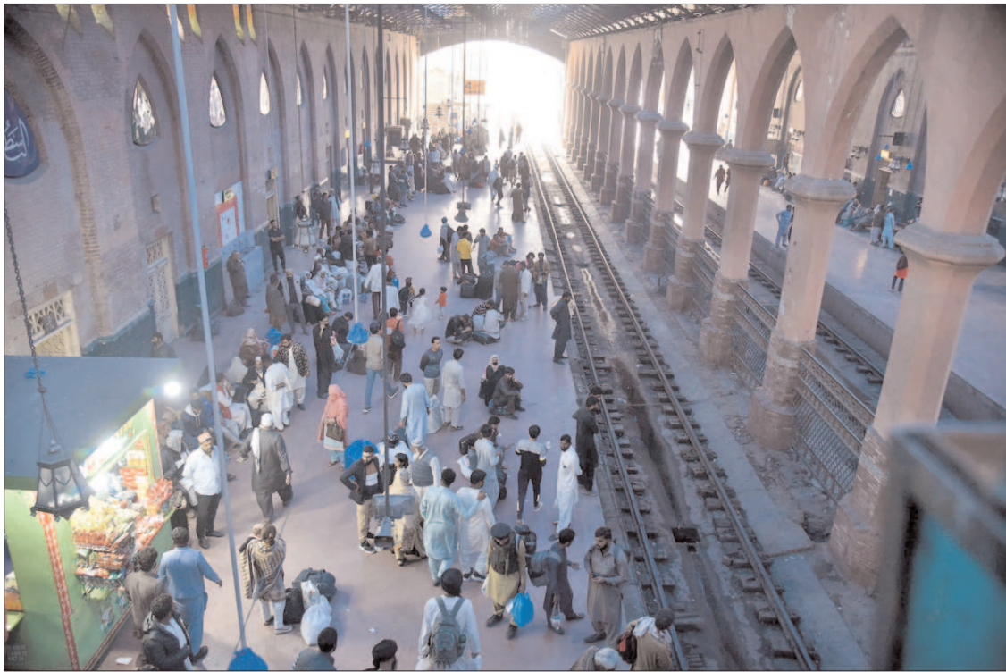
LAHORE: Passengers crowd at railway station due to closure of local transport in the City.