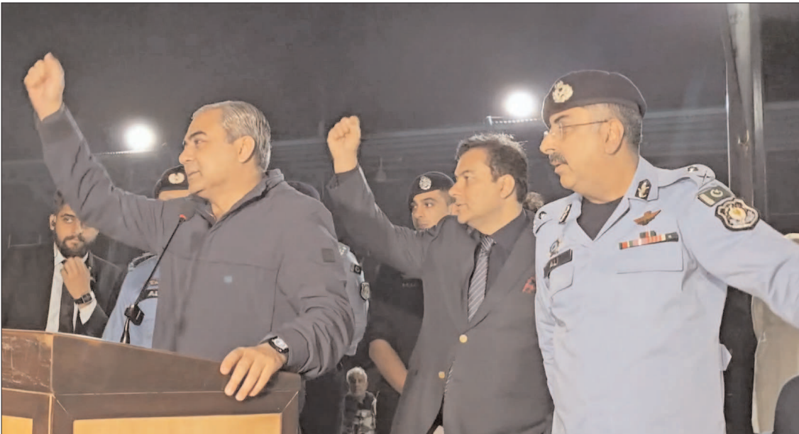
ISLAMABAD: Federal Interior Minister Mohsin Naqvi addressing ICT police to boost their morale in Police Lines.

ISLAMABAD: Interior Minister Mohsin Naqvi on Saturday said that the government cannot allow anyone to hold protest or sit-in in light of the Islamabad High Court (IHC) order.