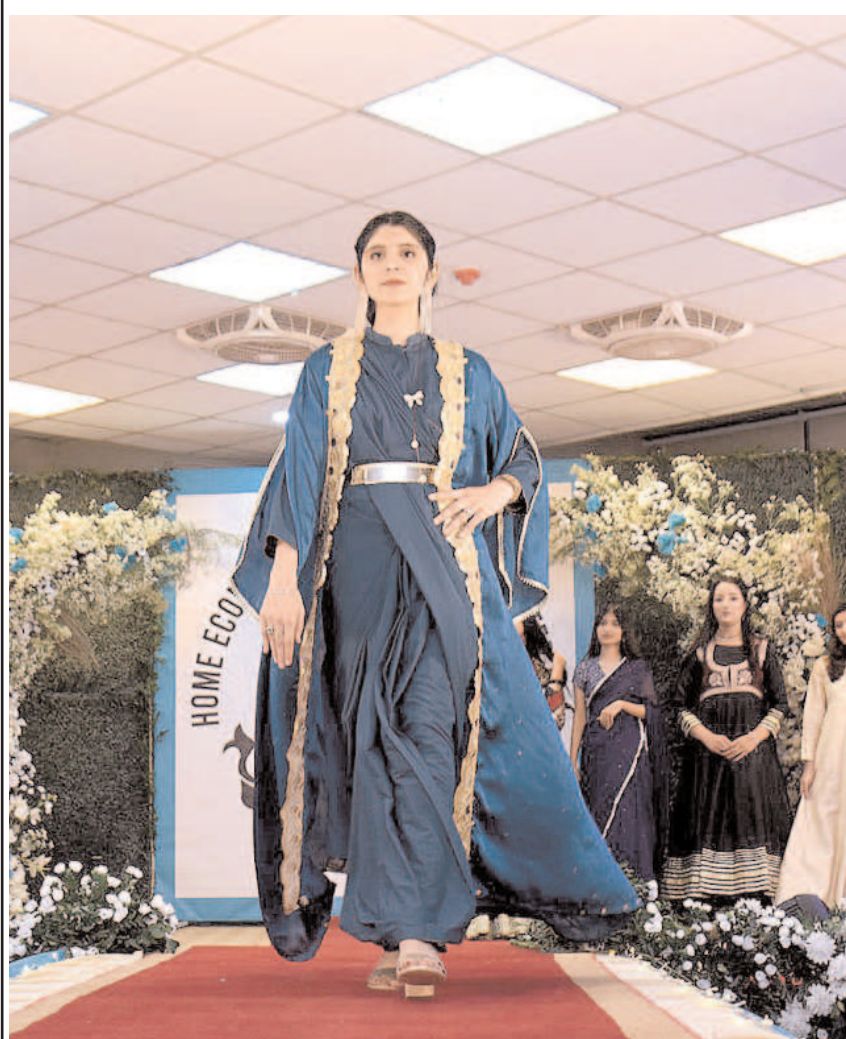
ISLAMABAD: Students taking part in a fashion show titled "Elegance of Flare" held at FG Home economics college.

Pran Feeders, Jhelum Circle, Abbaspora, F-13 Garmala, Nogra, Shikrila, Puran, F-6 Mashin Mohalla, F-9 Chak Daulat, Hamlet, Gadari, Sohan, New Domeli, Chotala, Mumtaz Shaheed, Gujar Khan, Ward No-8, Ghori Dhamek, Khalia, Chhapar, Sharif, Baba Shaheed, Kantriyala, Kangar Thatti, Qaziyan Feeders, Chakwal Circle, Bahrpur, Line Park, Jamalwal, Manara, Islamia Chowk, Daulatala, Dhedral Rural, Khanpur, Chakral, Darya Jalap, Tuba, PD Khan, Sagarpur, Dulha, DS Bilawal, Dhok Ghazan, Dharabi, Dhular, Mughala, Bhadial, Patwali, Sarpak, Islamia Chowk Feeders, GSO Circle, from 09:00 AM to 04:00 PM, Exchange, I-10 Sector, Furnace, Sir Syed Street, PTN, United Steel, Ahmednagar, KSB, Islampura, Gadwal, I&2, Karnal Sher Khan, Lala Rukh, Hussainabad, Fazal Rubber & Steel, Mong City, Mong Pattan Sher Khan, Mong Kanchan Feeders, 132KV ACL Consumer Grid Station and surrounding areas.