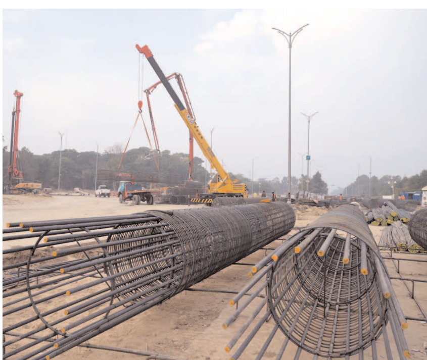
ISLAMABAD: Heavy machinery in action for the construction of 9th Avenue F-9 underpass and flyover project.

He emphasized that the government is committed to maintaining law and order, adding, we will not hesitate to take decisive action against anyone who attempts to disrupt the peace or threaten national security.