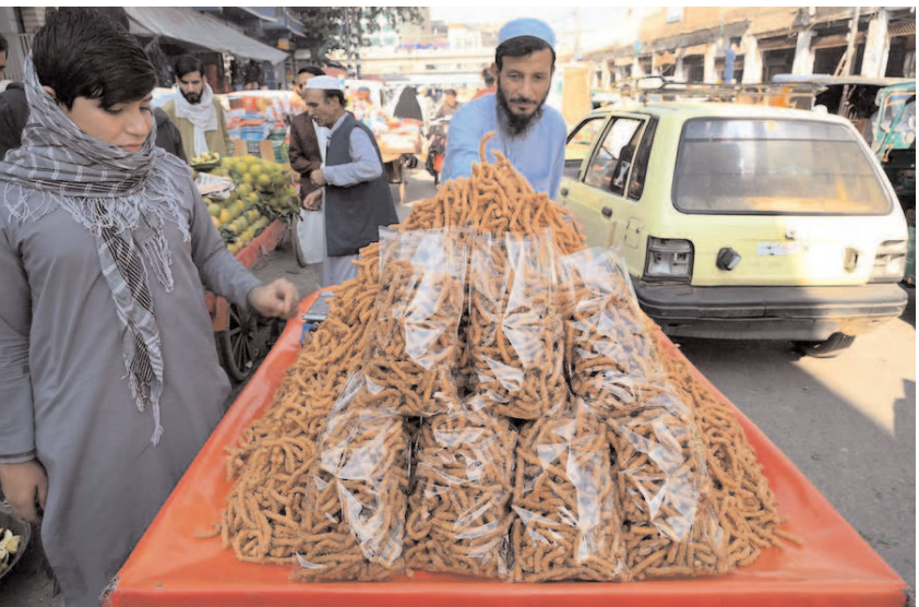
PESHAWAR: Vendor selling and displaying traditional sweet item to attract customer at Hashnagri area.