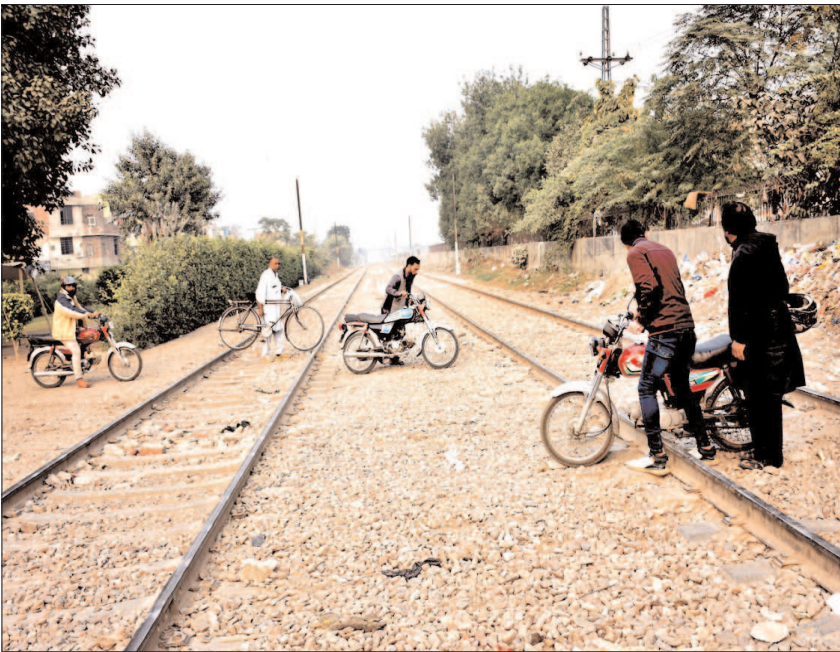
LAHORE: People cross railway tracks incorrectly, risking serious accidents.

He stressed that public health remains a top priority and called on the business community to cooperate in reducing the impact of smog and air pollution. Strict action will be taken against violators, with no exceptions. For any information or complaints, citizens can contact the DC Office Control Room at 0307-0002345 via WhatsApp or through the office's social media platforms.