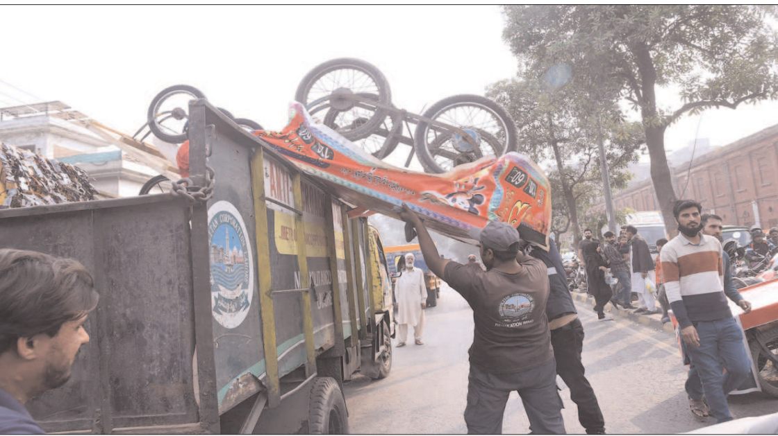
LAHORE: Corporation staff removes encroachments at Empress Road.