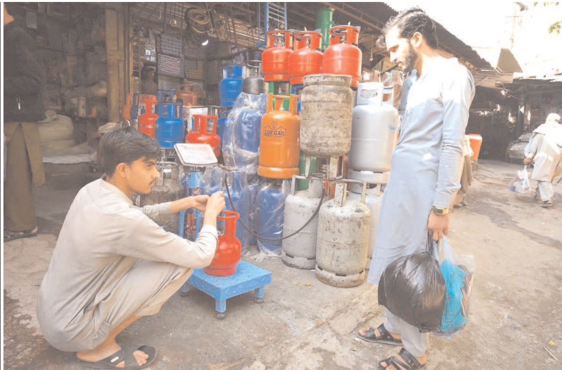
PESHAWAR: Vendor busy in filling LPG gas into a cylinder for a customers at Ashraf road.

US prosecutors say Adani, his nephew Sagar Adani and others bribed Indian officials to gain business advantages in renewable energy projects in India that benefited Adani Green and a company called Azure Power, which was listed on the New York Stock Exchange until late 2023. They are also accused of making misleading statements to the public, including US investors, despite being made aware of the US investigation in 2023.