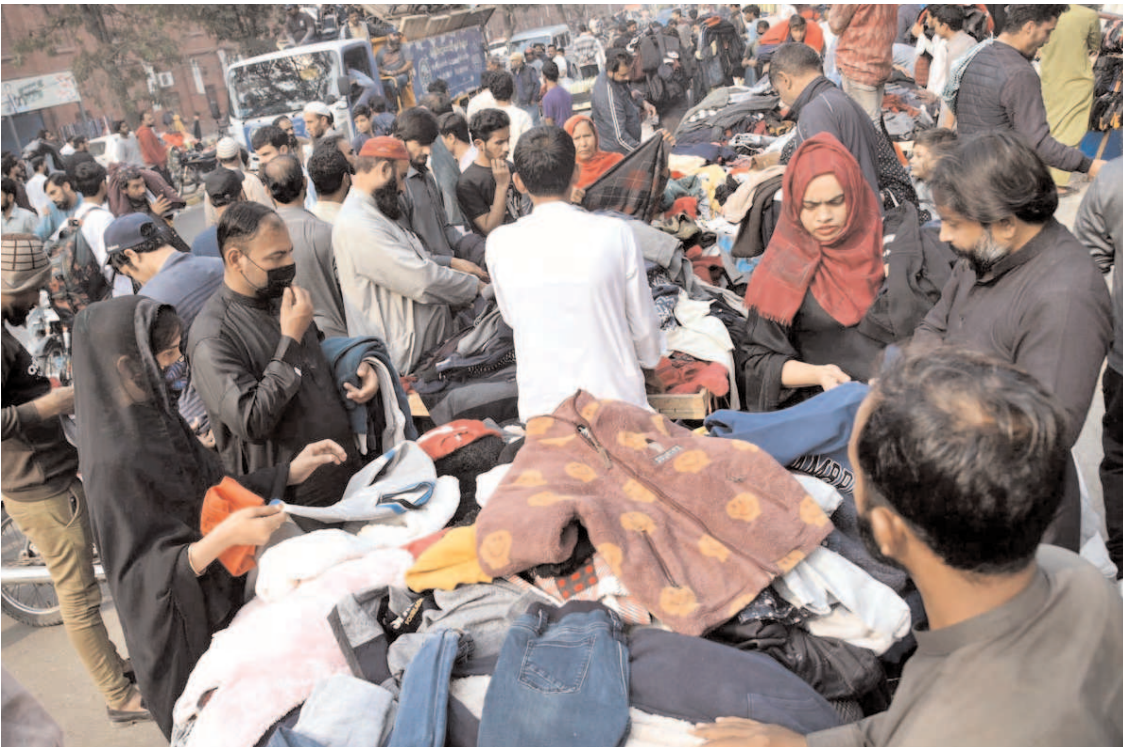
LAHORE: People selecting and purchasing old warm clothes at Empress Road.

He said that previously, foreign investors mostly poured money into the sectors which did not pose a risk to their profit margins due to rupee depreciation such as the power sector.