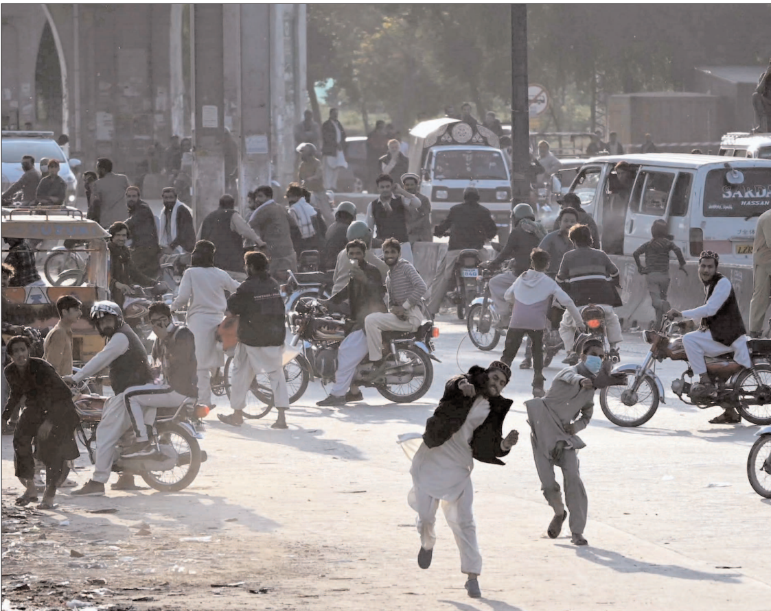
ISLAMABAD: Protesters of PTI throwing stones on police during a clash on Sunday.

"Violence against women is a gross violation of human rights and a major impediment to achieving a just and equitable society. We must commit ourselves to eliminating it from all aspects of life, be it at home, in the workplace, or public spaces," he said.