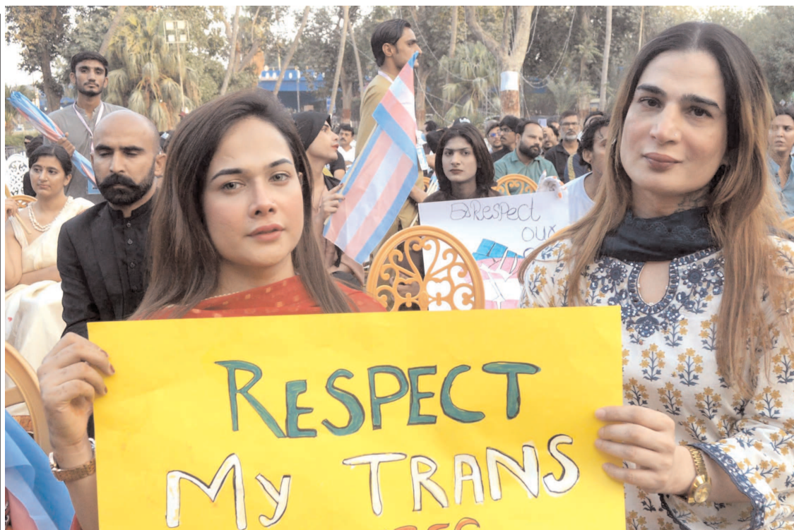
HYDERABAD: Transgender rights activists holding placards inscribe with slogans for the protection of their fundamental rights.

Special care should be taken to ensure power supply during working hours in government offices including health and education institutions, he said.