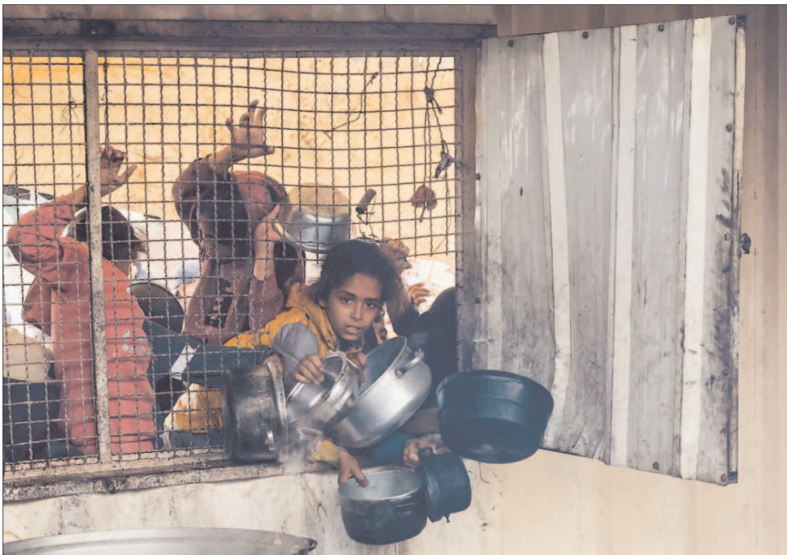
GAZA STRIP: Palestinians gather to receive food cooked by a charity kitchen, amid a hunger crisis, as the Israel-Hamas conflict continues, in Khan Younis, southern Gaza Strip on Sunday.

The gunman, who was carrying an automatic weapon, was chased for at least an hour before he was cornered and killed just before dawn, according to a security source.