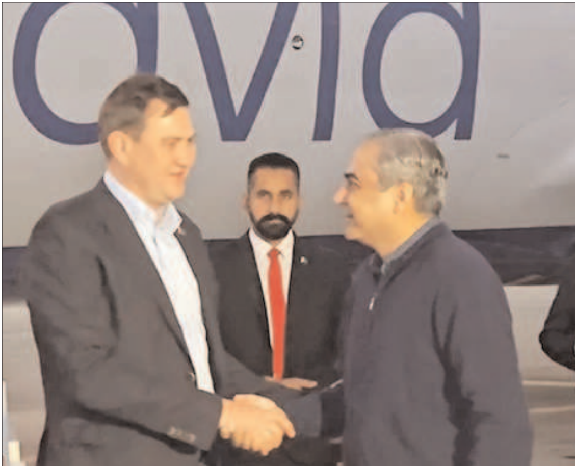
ISLAMABAD: Federal Interior Minister Mohsin Naqvi receiving Belarus Foreign Minister Maxim Ryzhenkov on Sunday.