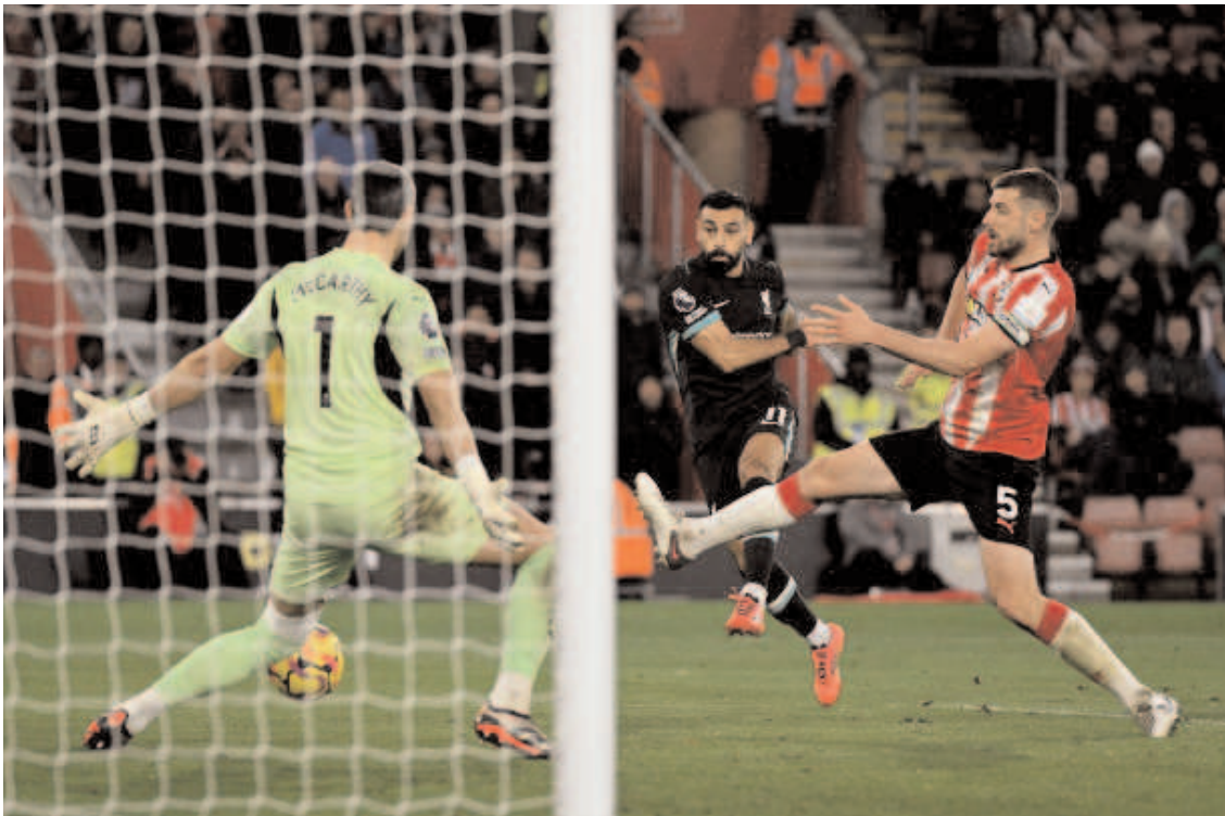
SOUTHAMPTON: Mohamed Salah of Liverpool during the Premier League match between Southampton FC and Liverpool FC at St Mary's Stadium.