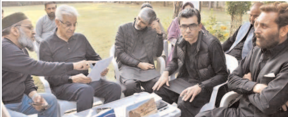
SIALKOT: Defense Minister Khawaja Muhammad Asif is listening the problems of people at his residence.