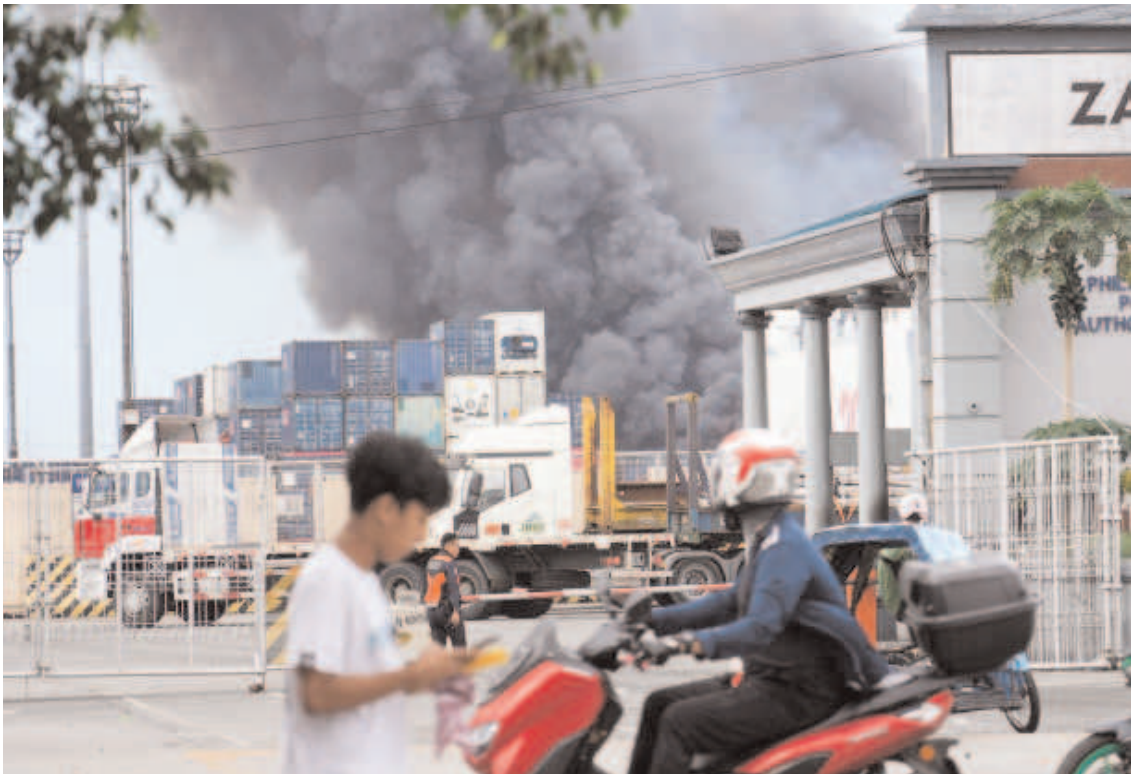
MANILA: Black smoke billow into the sky during a fire in the Isla Puting Bato residential area on November 24, 2024 in Manila, Philippines.