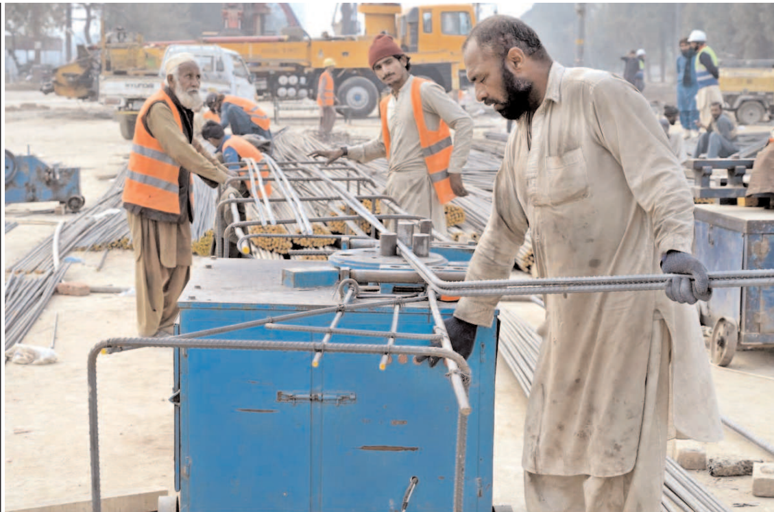
ISLAMABAD: Labourers busy in work at site of under-construction PTCL Chowk underpass project during development work in Federal Capital.

The local administration removed a significant number of encroachments from Raja Bazaar, Bara Bazaar, Commercial Market, Murree Road and surrounding areas during first week of current month, but the same cropped up again.