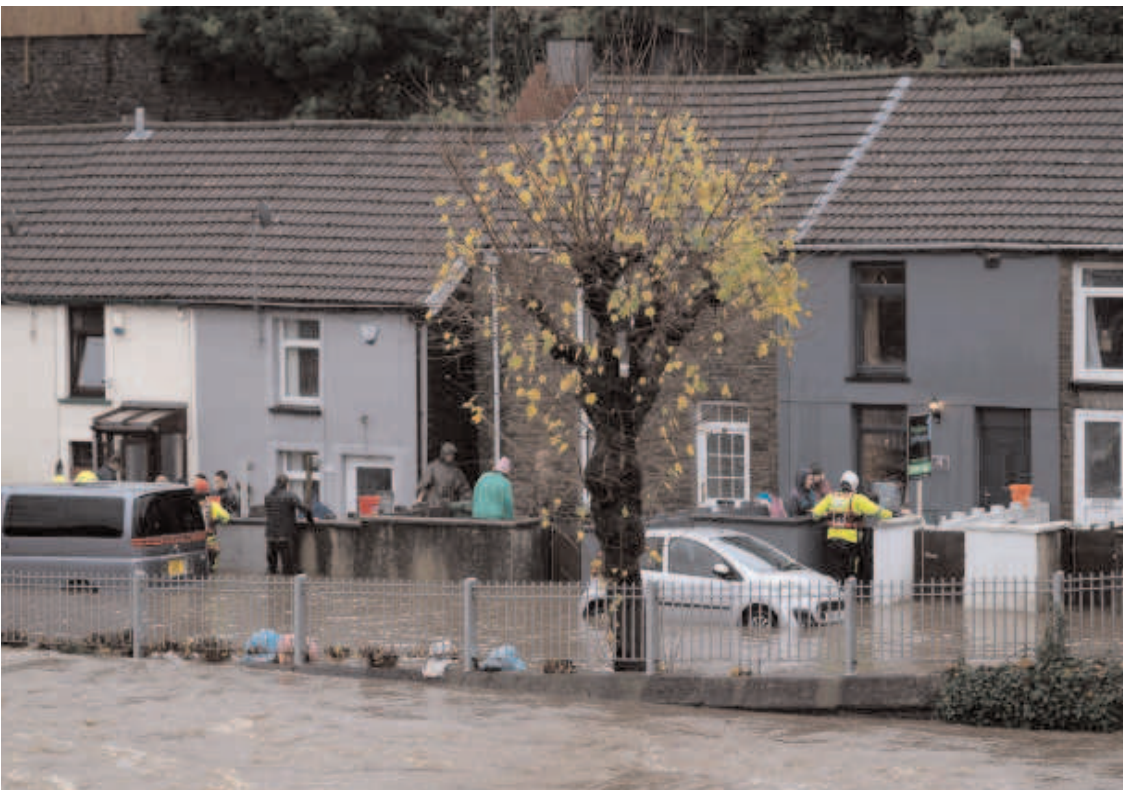
PONTYPRIDD, WALES: A general view of the scene on Sion Street on November 24, 2024 in Pontypridd, Wales. The UK Met Office issued warnings for heavy rain and snow, along with strong winds.