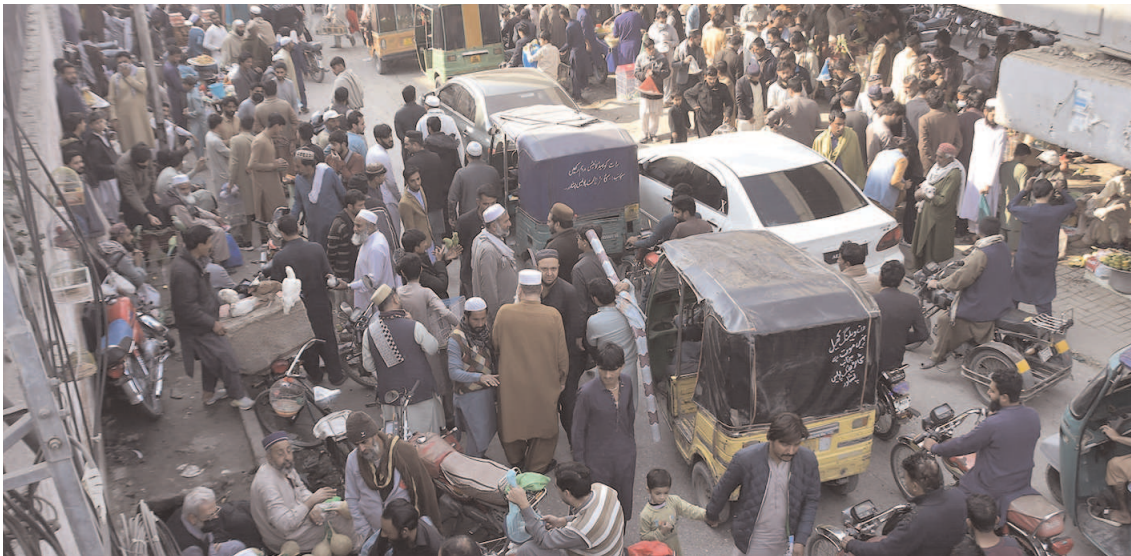
PESHAWAR: A view of illegal birds market in front of Metropolitan Office near Bacha Khan Chowk which needs attention of the authorities concerned.