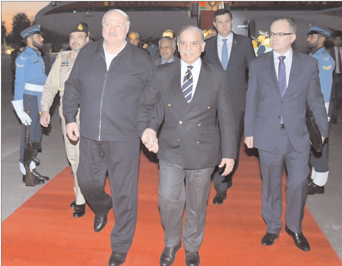
RAWALPINDI: Prime Minister Shehbaz Sharif receiving President of Belarus, Ateksandr Lukashenko at PAF Nur Khan Air Base.