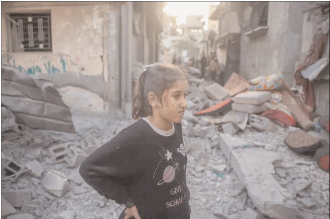
GAZA: An injured girl stands amid the rubble of a house destroyed in an Israeli attack at the Bureij refugee camp.