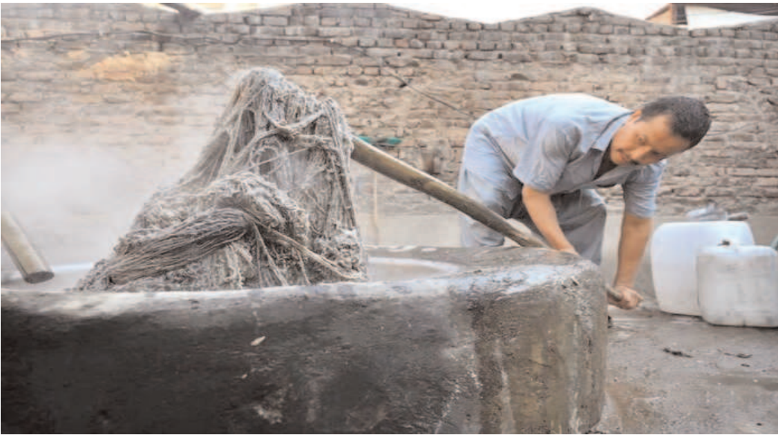
PESHAWAR: Laborer is busy dyeing the fabric threads used in making Afghan carpets at Sethi Town.