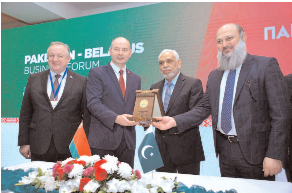
ISLAMABAD: Federal Minister for Commerce Jam Kamal Khan presents a souvenir to Belarusian Minister Alexey Kushnarenko during Pakistan-Belarus Business Forum 2024.