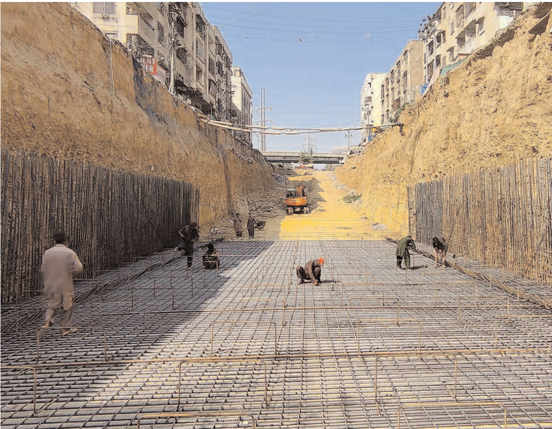
KARACHI: A view of labours busy in work on Karimabad Underpass.