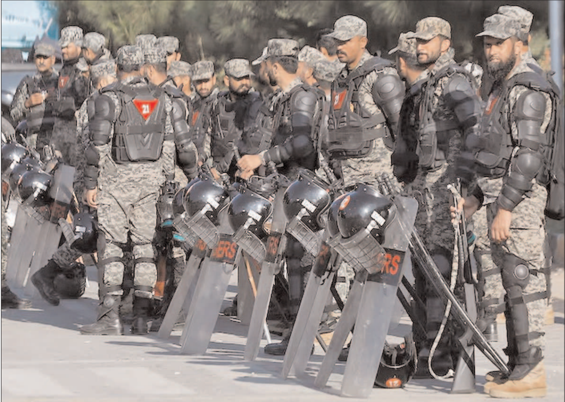
ISLAMABAD: Rangers in riot gear standing guard alongside a road to prevent PTI protest for release of party's founder.