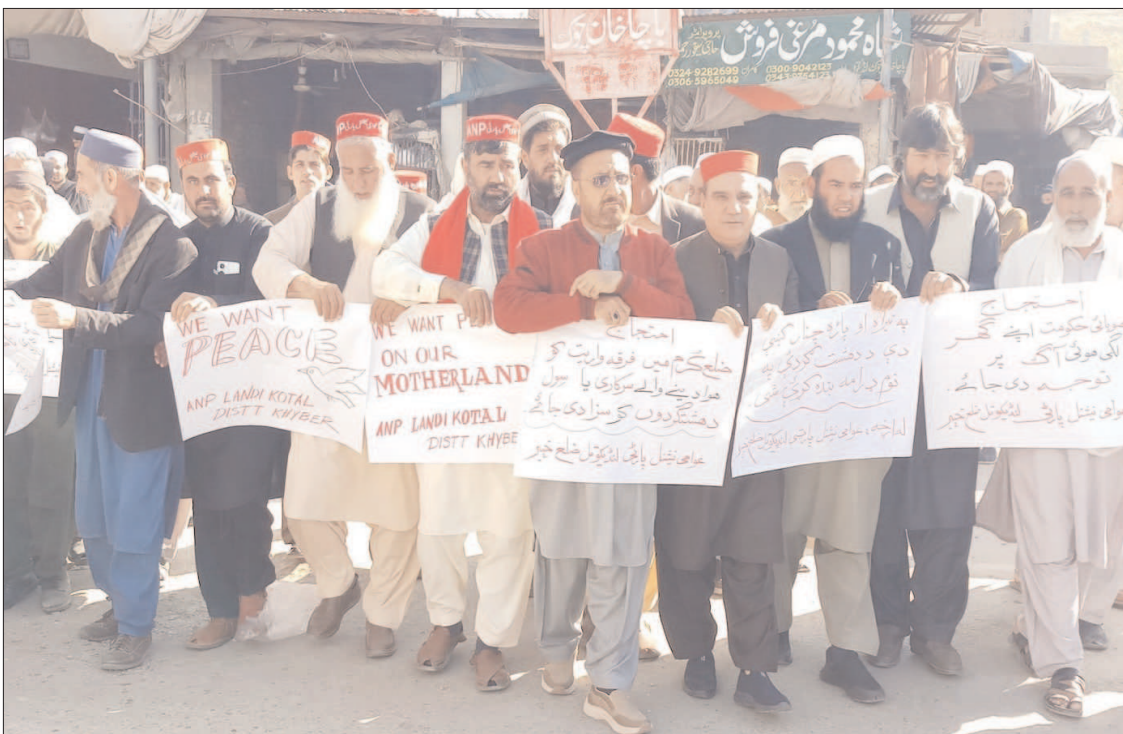
LANDI KOTAL: Leaders and workers of ANP holding placards during a rally against clashes in Kurram.

MUZAFFARABAD (INP): A massive fire broke out in Falcon Public School located in Lamiyani area of Hattian Bala in Azad Kashmir on Monday morning. The fire engulfed the entire school which was erupted as the classes were about to start. An electric short-circuit was blamed for the blaze. All the students were evacuated while adjacent buildings were also at risk due to the heavy school fire. Soon after the incident, Rescue 1122 vehicles reached Lamiyani area and started efforts to bring the fire under-control. The school building was completely destroyed as a result of the inferno. Local people also tried on their own to control the fire but their efforts became useless.