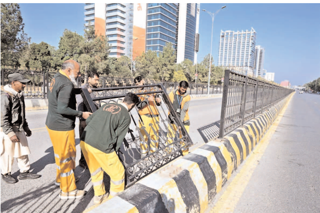
ISLAMABAD: Workers installing the grills on divider of Jinnah Avenue which damaged following PTI protest in the Federal Capital.

Feeders, Jhelum Circle, F-5 Jeddah, Zabar Shaheed, F-3 Gul Afshan, Mandi Bhalwal, Shamsabad, Akram Shaheed, F-8 Civil Line, Pakhwal, M Riaz Shaheed, Dinah, I, Bakrala, Bhagwal, New Chakiam, Chautala, Dinah, 4 City, Gujar Khan, Mitwa, Ghauri Dhamek, Kalia, Mal Awan, Kantrila, Islampura Feeders, Chakwal Circle, Tharpal, Line Park, Megan, Khairpur, Islamia Chowk, Dera Muslim, Dhadiyal Rural, Malhal Mughal, Bhikri, Darya Jalap, Tuba, PD Khan, Sagarpur, Pipli, Dharnal, Sukho, Tala Gang City, Aqwal, Bilalabad, Darut, Mail, Wanhar feeders, GSO Circle, from 06:30 am to 18:30 pm, RCCI-I, III, IV feeders, from 09:00 am to 04:00 pm, USA - A, B&C Old USA Embassy, RA Bazaar, AWT, Mall Road, AFIC, Tench Bhata, MH-3, Qasim Market, CMH-2, Sprint Mall, GHQ, Kayani Road, Army Flats, MH-1, CMH-I, MH-2, Zeeshan Colony, Haider Road, NLC feeders, DG Khan Cement Factory Grid Station and surrounding areas.