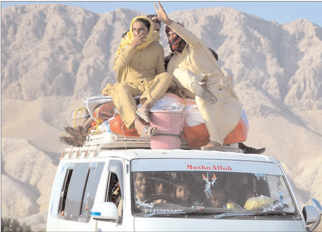
QUETTA: A view of passengers sitting on the roof top of vehicle while travelling in city area may cause any incident, needs attention of authorities concerned.