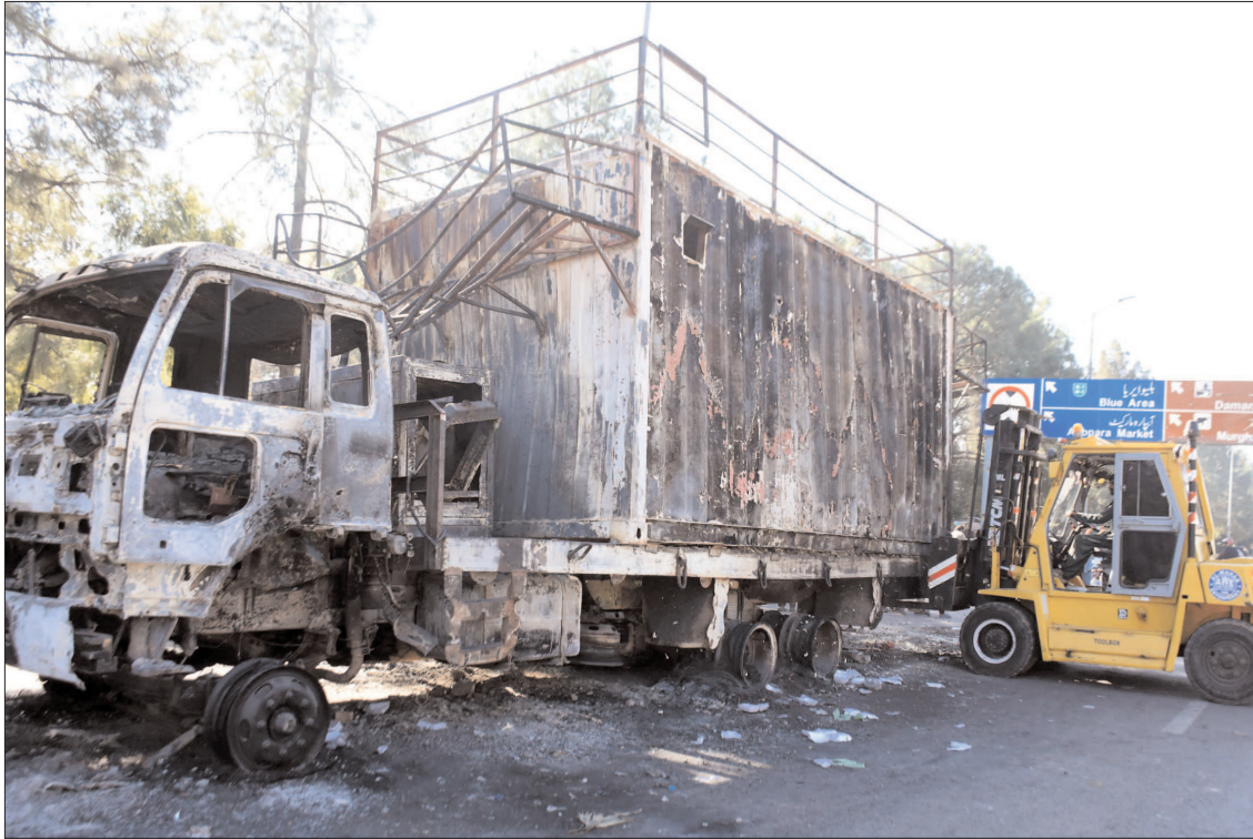
ISLAMABAD: A view of burnt container at Jinnah Avenue during PTI protest.