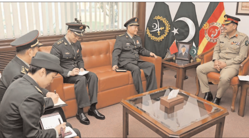
RAWALPINDI: General Zhang Youxia, Vice Chairman of Central Military Commission of People's Republic of China, along with a high-level delegation, called on Chief of Army Staff, General Asim Munir at GHQ.

Last week, the federal government released "exclusive" CCTV footage of the May 9, 2023, violent protests, showing the alleged former ruling party's protesters vandalising and torching government and military installations. Information Minister Attaullah Tarar, who played some video and audio messages of PTI leaders at a press conference in Islamabad, demanded that courts ensure "swift justice" following the "undeniable evidence" against the former ruling party.