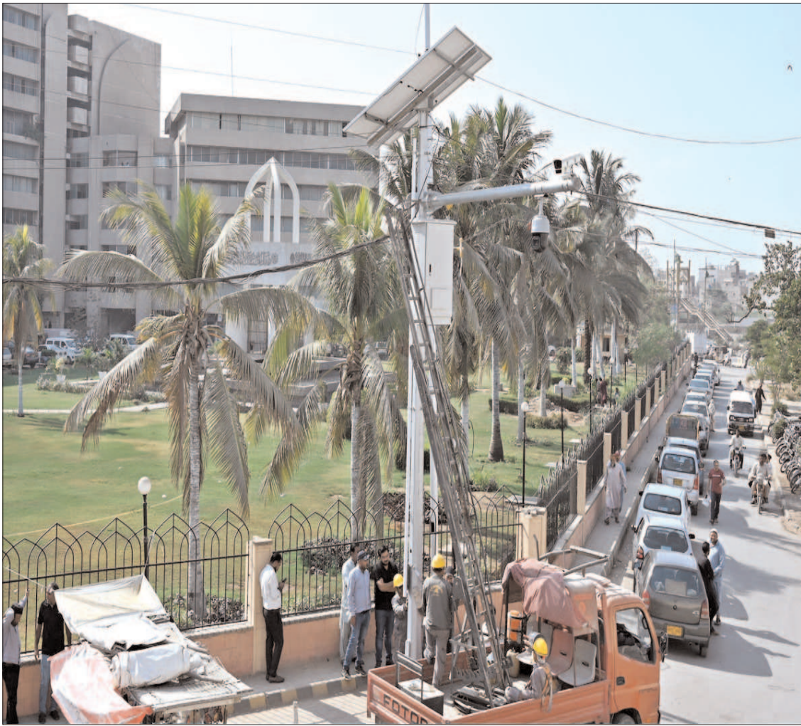
KARACHI: Workers installing a solar powered CCTV camera near the civic center.