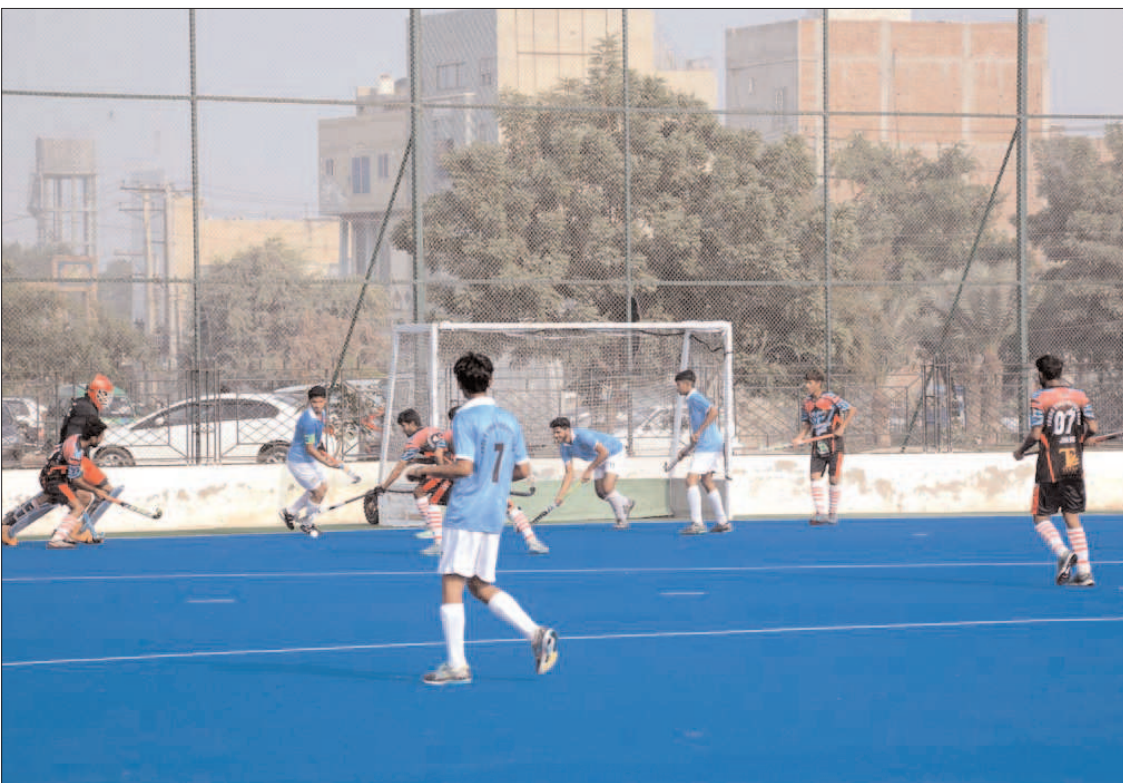
FAISALABAD: Players in action in hockey match played between Chiniot and Jhang teams during the "Khelta Punjab Games 2024" at Hockey Stadium.

Pakistan opener Saim Ayub's 62-ball 113 not out has lifted him 80 places to 90th position in the ODI batting rankings. India's victory in the Perth Test sees the two-time finalists once again reach the top of the ICC World Test Championship table with 61.11 percentage points.