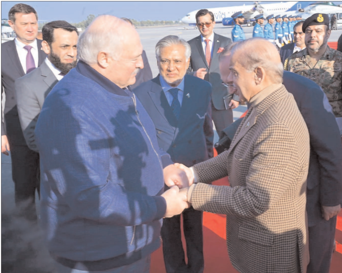
RAWALPINDI: Prime Minister Shehbaz Sharif sees off President of Belarus, Aleksandra Lukashenko at PAF Nur Khan Airbase.