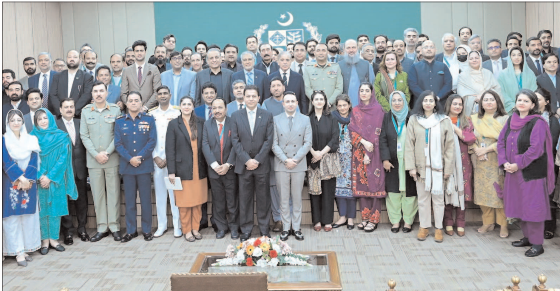
ISLAMABAD: Prime Minister Shehbaz Sharif in a group photo with participants of 26th National Security Workshop.

PESHAWAR: An earthquake measuring 5.2 magnitude on the International Richter Scale jolted several districts of Khyber Pakhtunkhwa on Thursday. According to the Met Office, the magnitude of the earthquake was recorded at 5.2 and its epicenter was the bordering area of Afghanistan and Tajikistan with a depth of 212 kilometers.