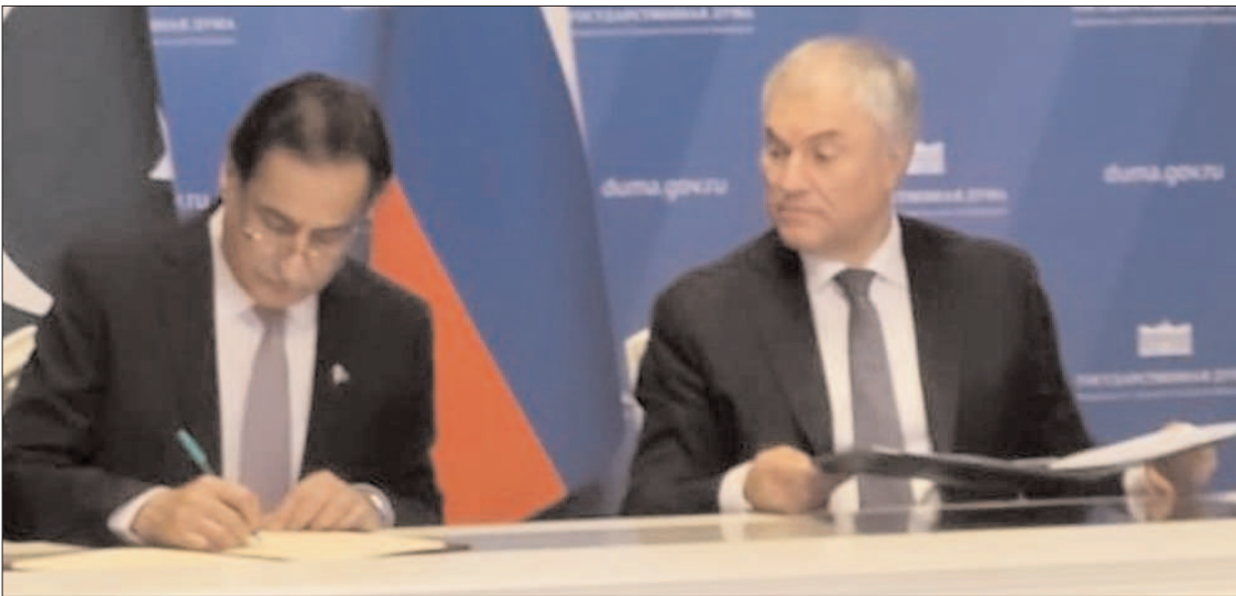
MOSCOW: Speaker National Assembly, Sardar Ayaz Sadiq and Chairman Russian State Duma, Vyacheslav Voldodin signing agreement on cooperation.

It was also recorded that an Israeli interceptor missile was fired toward Lebanon. The military explained that the suspicious target "may have been a bird or a small Israeli drone that was mistakenly identified as a Hezbollah drone." Israel later announced "a complete ban on movement or travel south of the Litani River from Thursday at 5 p.m. until Friday at 7 a.m." — Arab News