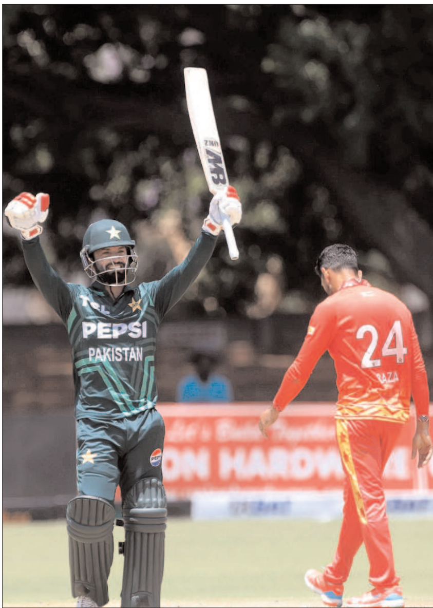
BULAWAYO: Kamran Ghulam celebrating his maiden ton in third ODI against Zimbabwe.

Clive Madande and Ngarava soldiered on for a bit, and ensured Zimbabwe crossed 200 and kept the defeat to two figures. But Pakistan would not be denied an emphatic win, Faisal Akram and Rauf removing the last two off consecutive balls either side of the 40th over to make victory official.