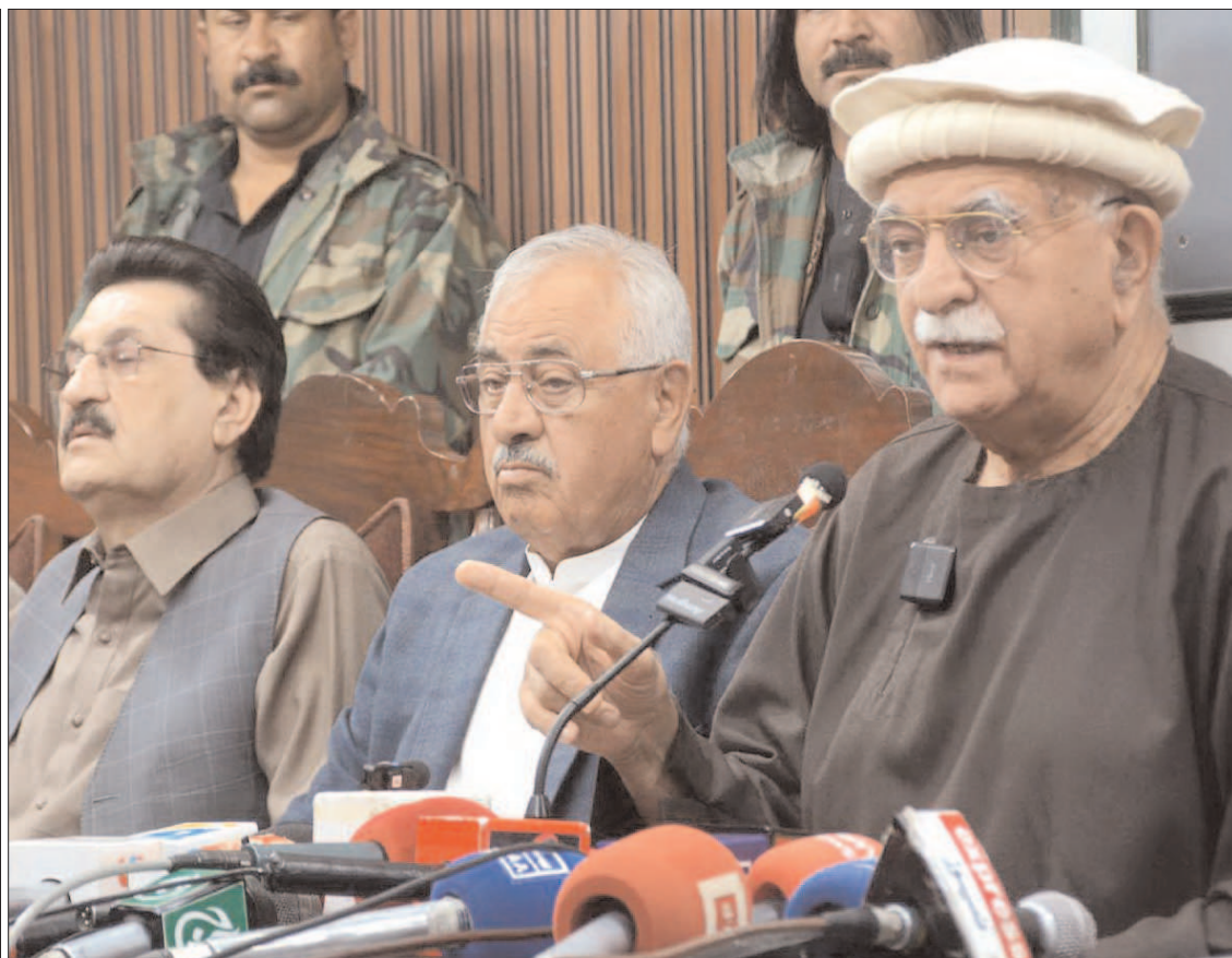
QUETTA: Chairman of Pashtunkhwa Milli Awami Party, Mehmood Khan Achakzai addressing a press conference.