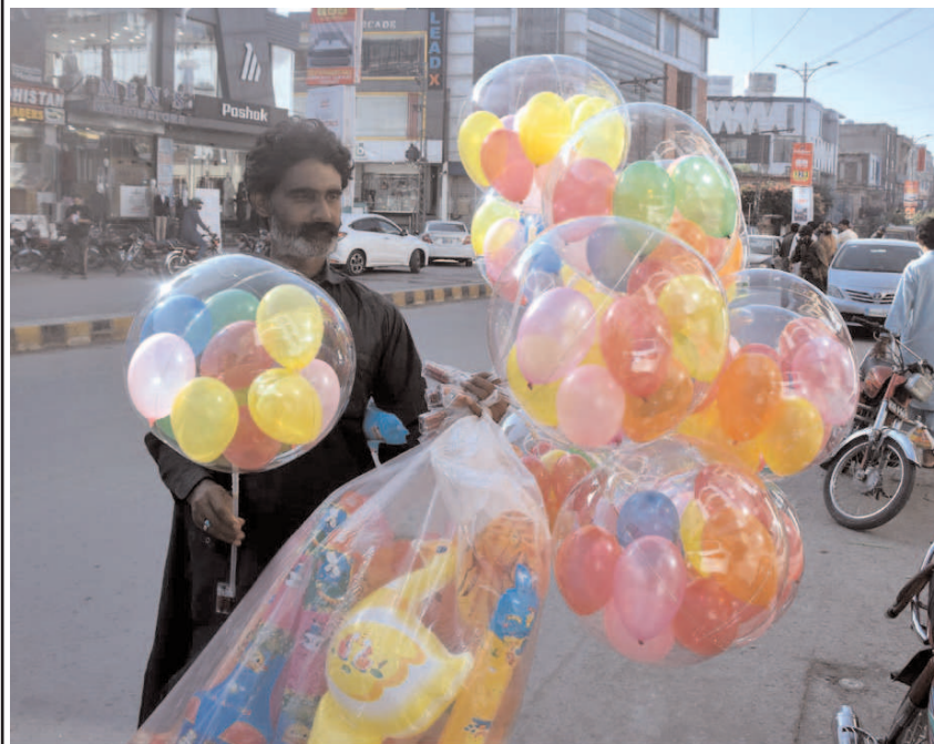
RAWALPINDI: A vendor selling colorful balloons to attract customers at roadside.

from various areas of the city during the last 24 hours. DIG Ali Raza said that the ICT Police is actively working to ensure the safety of citizens' lives and property in the federal capital, emphasizing that no elements will be allowed to disrupt citizens' peace. Protecting the lives, property, and dignity of citizens is the Islamabad Police's top priority. Citizens are urged to report any suspicious activities to the relevant police station, emergency helpline "Pukar-15" to help make the city crime-free through cooperation between the police and the public.