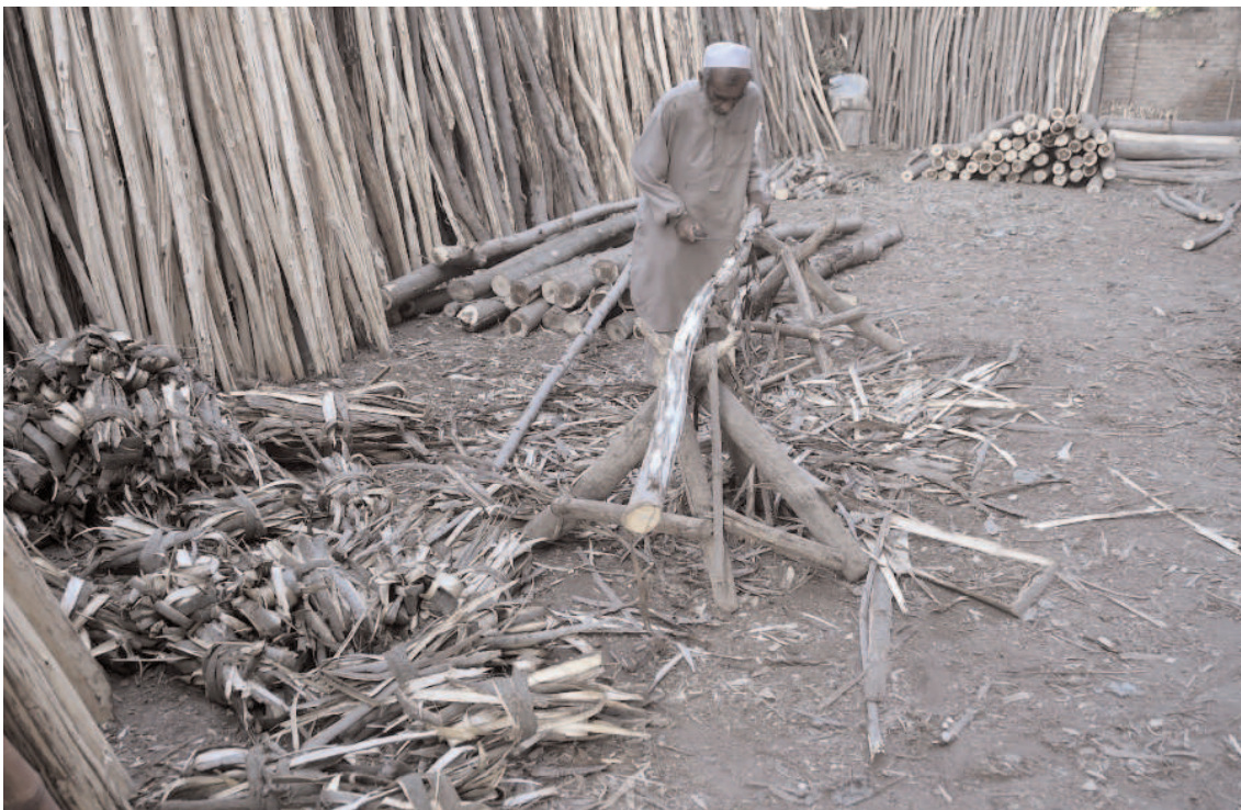
PESHAWAR: An elderly man busy in cleaning wood at his workplace near Charsadda Road.