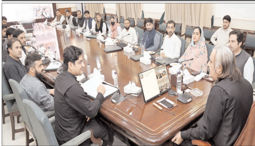
PESHAWAR: Chief Minister of Khyber Pakhtunkhwa, Ali Amin Gandapur talking to a delegation of Insaf Doctors Forum.

PM Shehbaz said health insurance for journalists was also an important initiative of the federal government for their protection. "We are committed to preventing crimes against journalists, ensuring punishment for perpetrators, and safeguarding journalists in Pakistan," the prime minister assured. He emphasized that the Constitution of Pakistan guaranteed freedom of expression, freedom of the press, and access to information, and the government of Pakistan was dedicated to ensuring these rights.