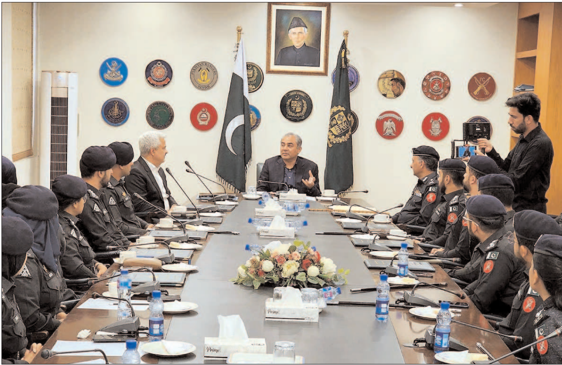
ISLAMABAD: Federal Minister for Interior Mohsin Naqvi in a meeting with police officers from 49th common who have been recently posted in frontier Constabulary.