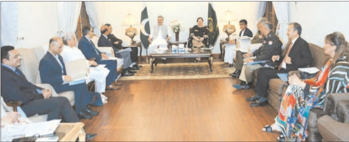
ISLAMABAD: Chief Justice of Pakistan, Justice Yahya Afridi in a meeting with other stakeholders on jail reforms.