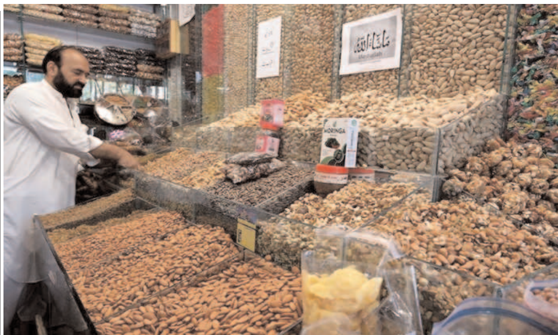
ISLAMABAD: A shopkeeper arranging and displaying dryfruit to attract the customers at Aabpara. The sale of dryfruit in Pakistan increases manifold with the arrival of winter.