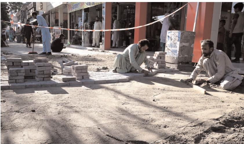
ISLAMABAD: Laborers busy fixing tough tiles on footpath at Aabpara.

pollution hours (10am-4pm). Citizens should also check smog timing before venturing out and consider staying indoors with windows and doors closed, using air purifiers, reducing physical activity, staying hydrated and monitoring air quality indexes, he suggested. Vulnerable populations, such as children, elderly individuals, pregnant women and those with pre-existing respiratory conditions should be particularly cautious. If symptoms like coughing, shortness of breath, chest tightness, irritation, headaches, or fatigue persist or worsen, seek immediate medical attention, he added.