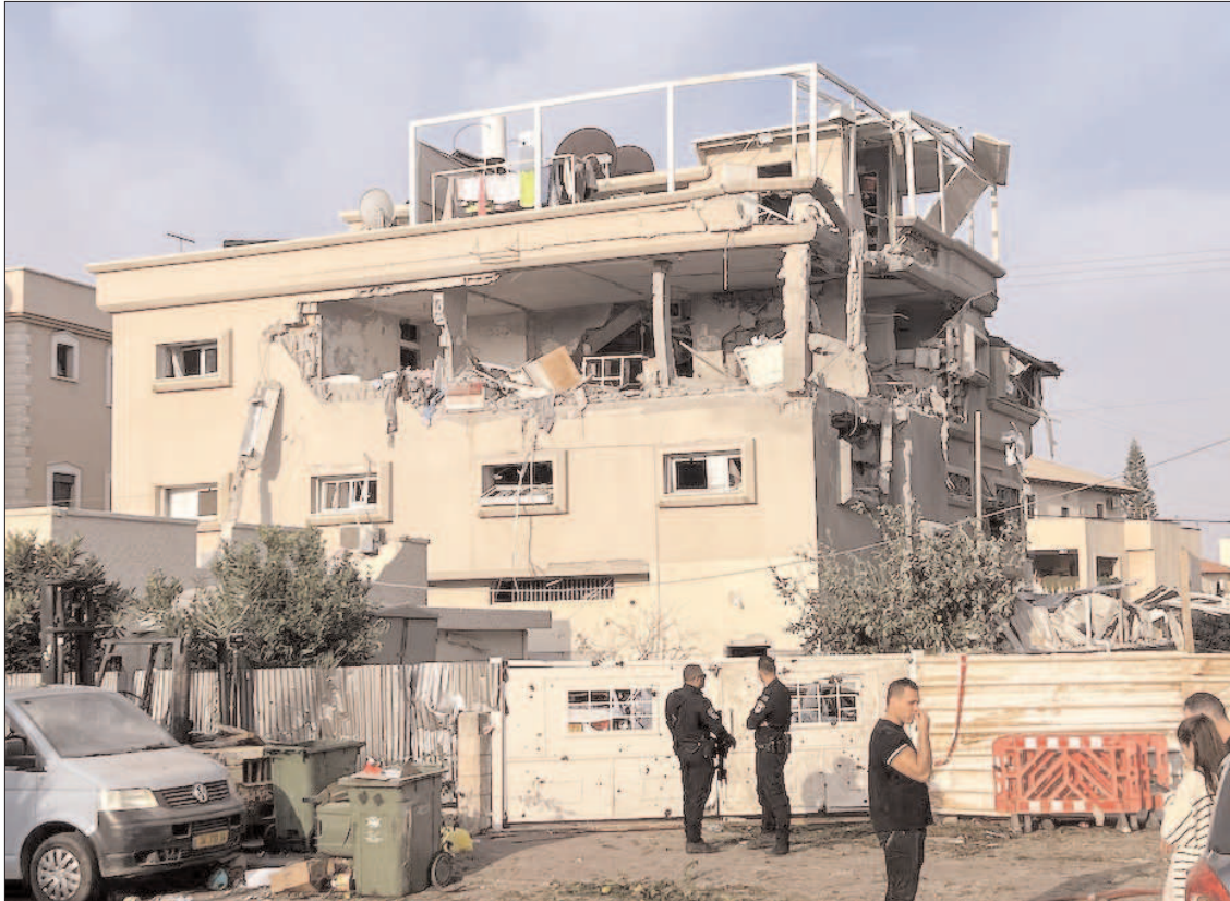
JERUSALEM: Residents and police officials gathered near a house that was hit, following a projectiles attack from Lebanon towards Israel.