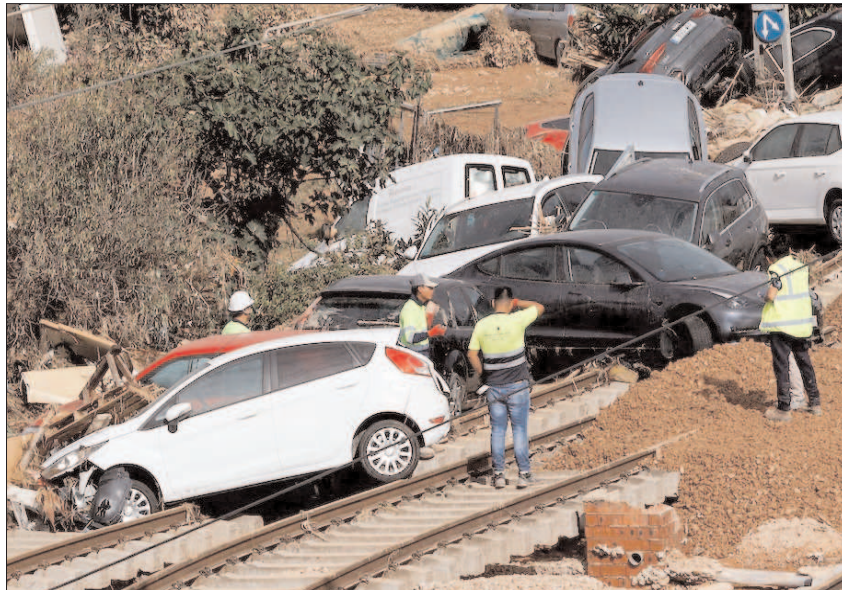
MADRID: Search and rescue team members looking for bodies, following heavy rains that caused floods, in Chiva, Spain.

Interior Minister Fernando Grande-Marlaska told Cadena Ser radio on Friday that it was "reasonable" to expect more deaths would be discovered. Authorities are hopeful that the number of missing will decline once telephone and internet services are restored. The storm that started the floods on Tuesday formed as cold air moved over the warm waters of the Mediterranean and is common for this time of year. But scientists warn that climate change driven by human activity is increasing the ferocity, length and frequency of such extreme weather events. — Aljazeera