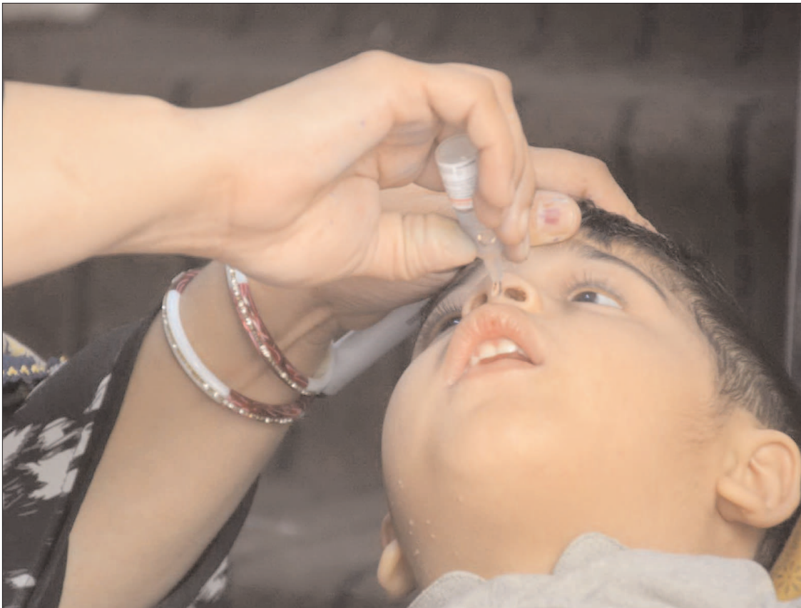
QUETTA: A polio worker administering anti-polio drops to a child during anti-polio vaccination campaign.

TURBAT (INP): A Convention was organized in Turbat under the auspices of FC Balochistan (South) at Government Girls Cadet College Turbat to create awareness among the women about deadly and contagious diseases like breast cancer. Posters and banners were also displayed at different places in Turbat city to create awareness about this disease under awareness campaign about breast cancer. Students from various colleges participated in the convention, in which a question and answer session on breast cancer was held, while a detailed briefing was also given about the disease.