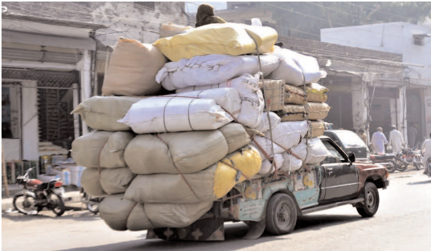
PESHAWAR: A view of overloaded vehicle plying on city roads.

Chief Minister of C&W Sohail Afridi said that the doors of my office are open to the people at all times, along with this he said that we are following a zero tolerance policy for corruption, all government employees should perform government work transparently, we are sitting here to provide the best facilities to the people of Khyber Pakhtunkhwa.