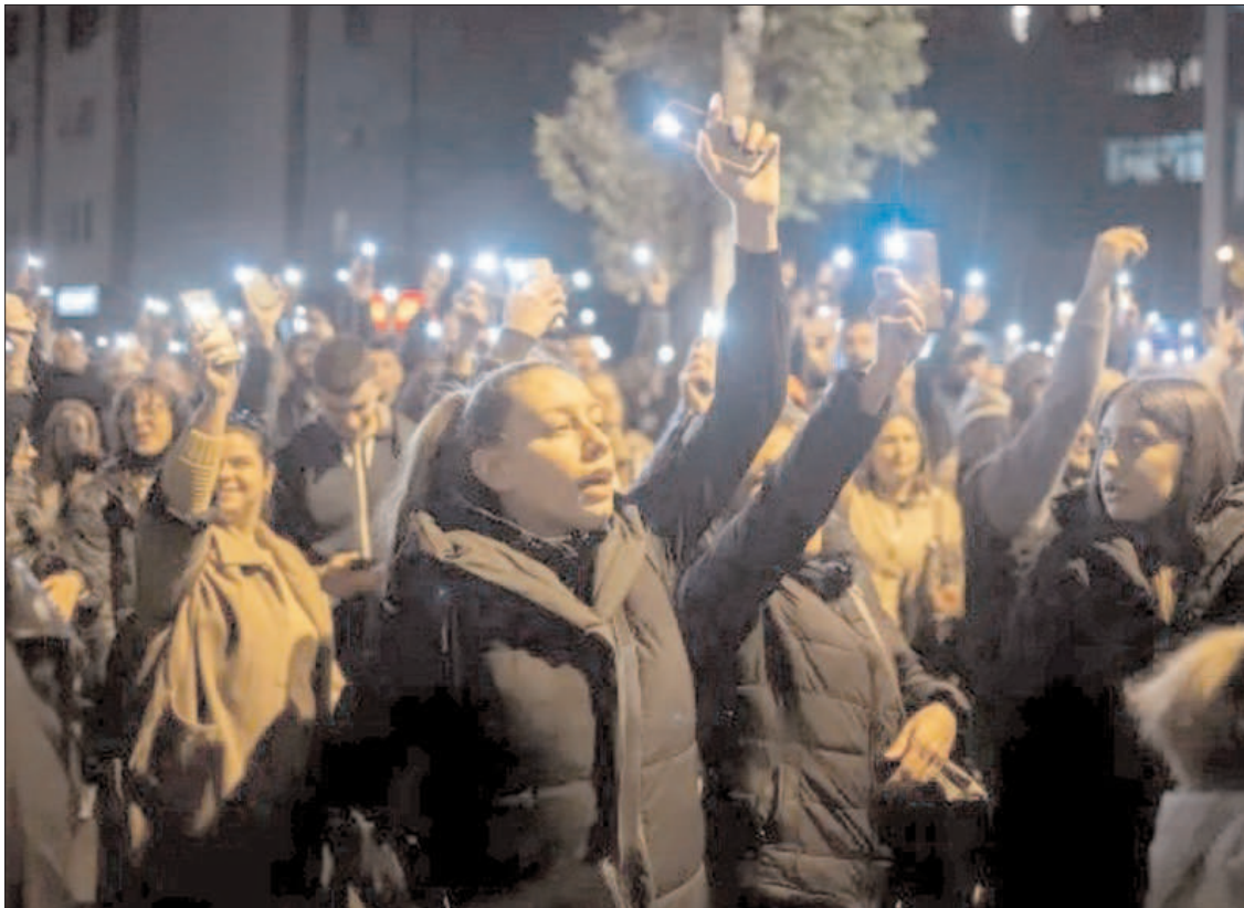
BELGRADE: Protests rock the Serbian city of Novi Sad, where a train station roof collapsed last week, killing 14 people.

The spokesman for United Nations chief Antonio Guterres said he condemned attacks by paramilitaries in al-Jazira, after the United States made a similar call over the violence against civilians. Among the key government changes, Ambassador Ali Youssef al-Sharif, a retired diplomat who previously served as Sudan's ambassador to China and South Africa, was appointed foreign minister.