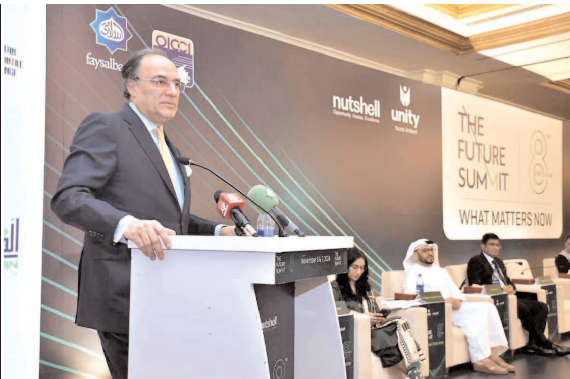
KARACHI: Federal Minister for Finance and Revenue Senator Muhammad Aurangzeb addresses 8th Edition of The Future Summit, discussing Pakistan's economic prospects and future financial strategies.

The price of gold in the international market decreased by $10 to $2,727 from $2,727 last day, the Association reported.