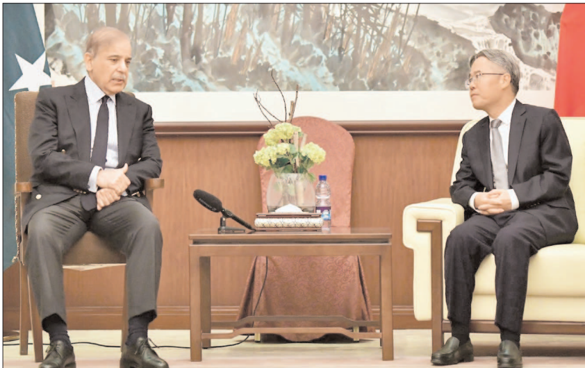
GHIZER: Prime Minister Shehbaz Sharif meeting with Chinese Ambassador to Pakistan, Jiang Zaidong during his visit to Chinese Embassy.

When he arrived in Washington 2017, Trump knew little about the levers of federal power. His agenda was stymied by Congress and the courts, as well as senior staff members who took it upon themselves to serve as guardrails. This time, Trump has said he would surround himself with loyalists who will enact his agenda, no questions asked, and who will arrive with hundreds of draft executive orders, legislative proposals and in-depth policy papers in hand. — Arab News