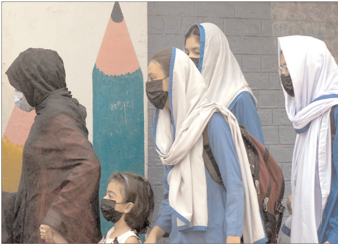
LAHORE: Students wearing facemasks amid smoggy conditions.

“At this point, we are not currently tracking any national level significant incidents impacting security of our election infrastructure,” said Conley, whose agency is responsible for protecting critical American infrastructure, including election infrastructure. — Aljazeera