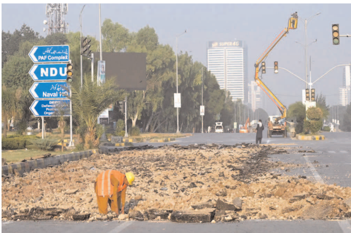
ISLAMABAD: A view of the ongoing development project as heavy machinery is being used in the construction of the PTCL Chowk Underpass in the Federal Capital.

He appreciated PAC Rawalpindi's commitment to providing a platform for artists, where young painters can exhibit their work without any fee.