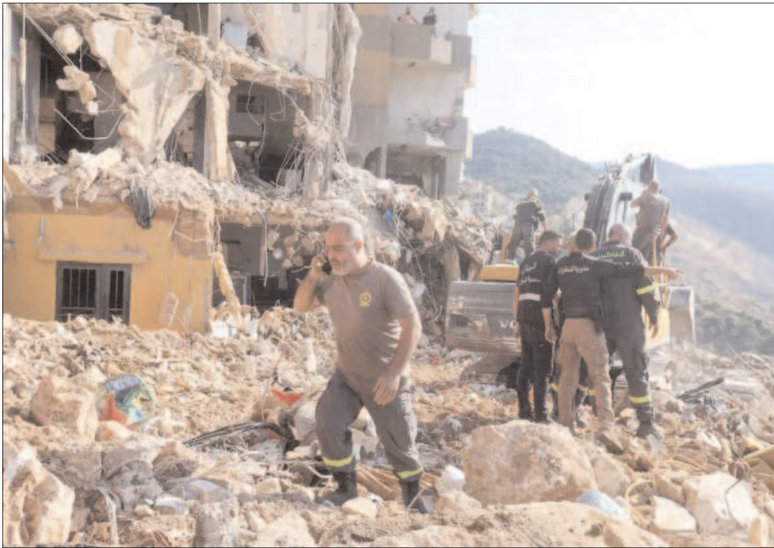
BEIRUT: Lebanese members working at a site damaged in an Israeli air strike in Barja.