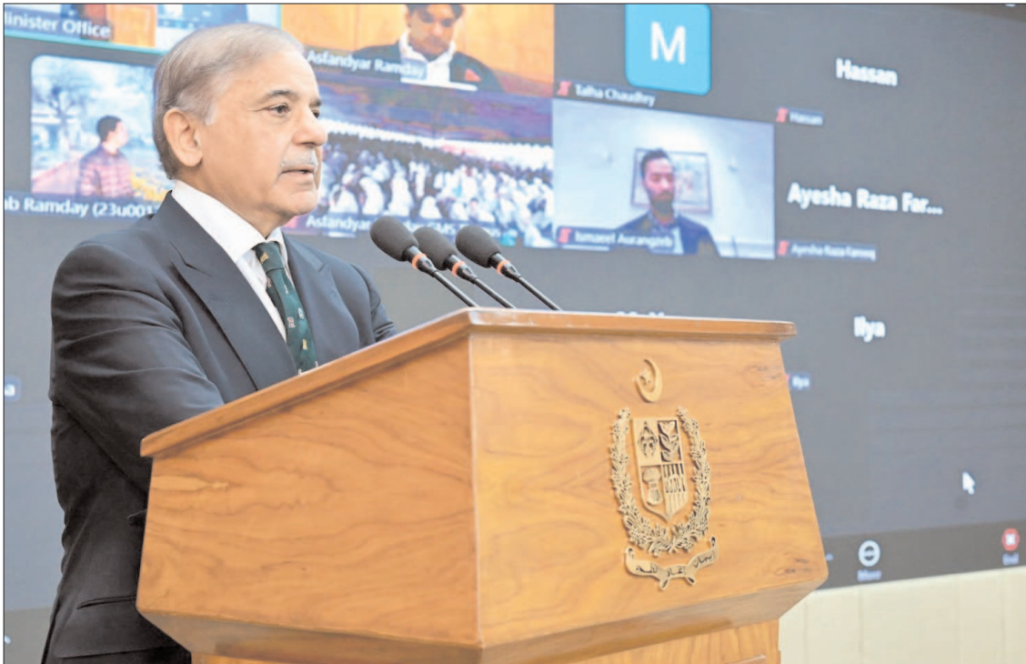
ISLAMABAD: Prime Minister Shehbaz Sharif addressing a ceremony of laying a foundation stone of Ramday University, Thogas, Ghanche.