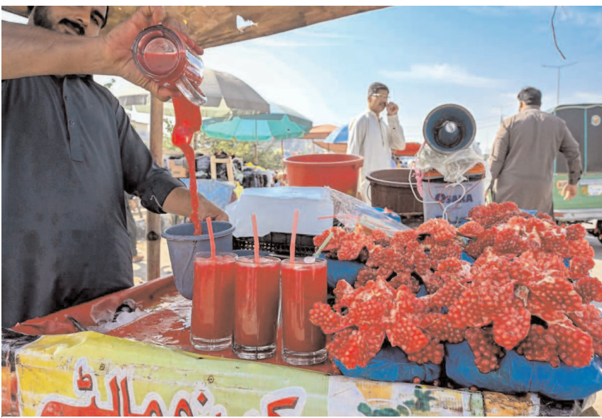
RAWALPINDI: A street vendor prepares glasses of fresh pomegranate juice to attract customers at his stall.

The administration is determined to maintain a transparent and efficient process for citizens seeking services at the excise office, working to root out any agents who interfere in official matters for personal gain.