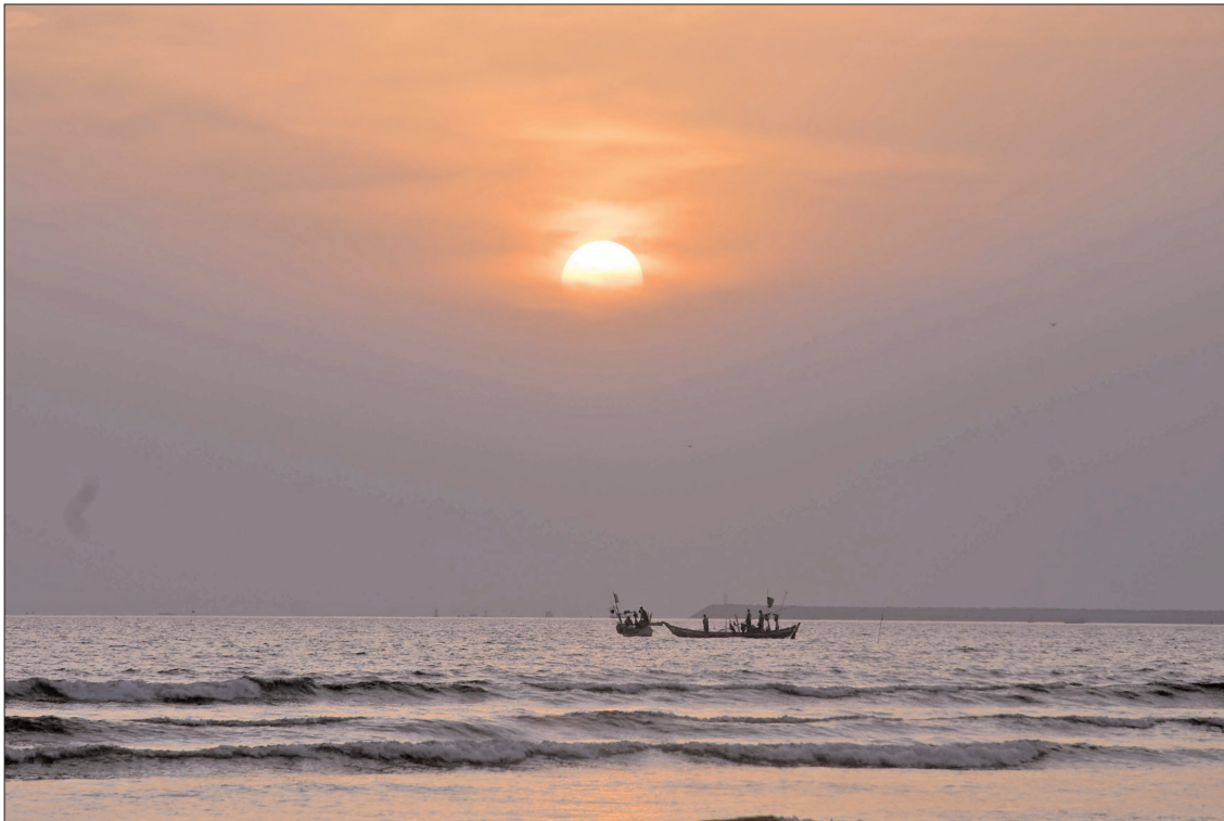
KARACHI: A stunning view of the last sunset of the year2024 at Sea view.