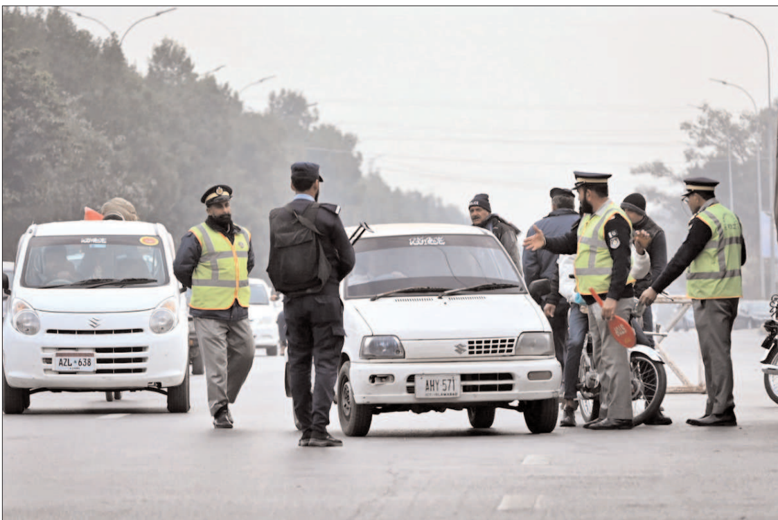
ISLAMABAD: ICT Police deploys 3,000 security personnel to uphold law and order, ensuring public safety on New Year's Eve in the Federal Capital.