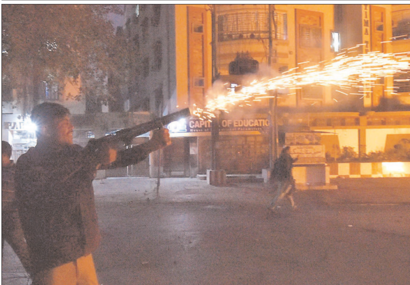
KARACHI: Police officials firing tear gas shell after clash between police and Shia community members.