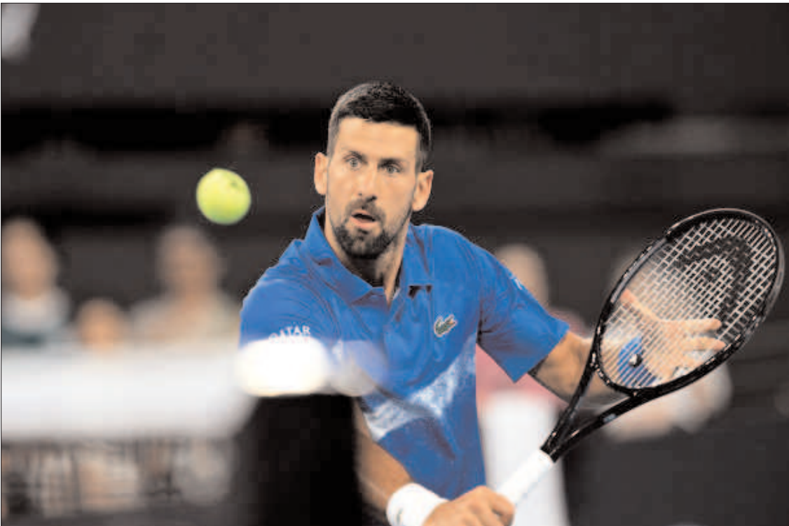
BRISBANE: Novak Djokovic of Serbia plays a backhand in his match against Rinky Hijikata of Australia during day three of the 2025 Brisbane International at Pat Rafter Arena.

AUCKLAND (AFP): Former US Open champion Emma Raducanu pulled out of the Auckland Classic on Tuesday with a "back niggle" in a blow to her Australian Open preparations. Britain's Raducanu will now fly to Melbourne to begin rehabilitation ahead of the year's first major starting on January 12. The 22-year-old has suffered a series of injuries since bursting onto the scene with her New York triumph in 2021. "I've tried my best to be ready. I love Auckland and the fans here," the 56th-ranked Raducanu said.