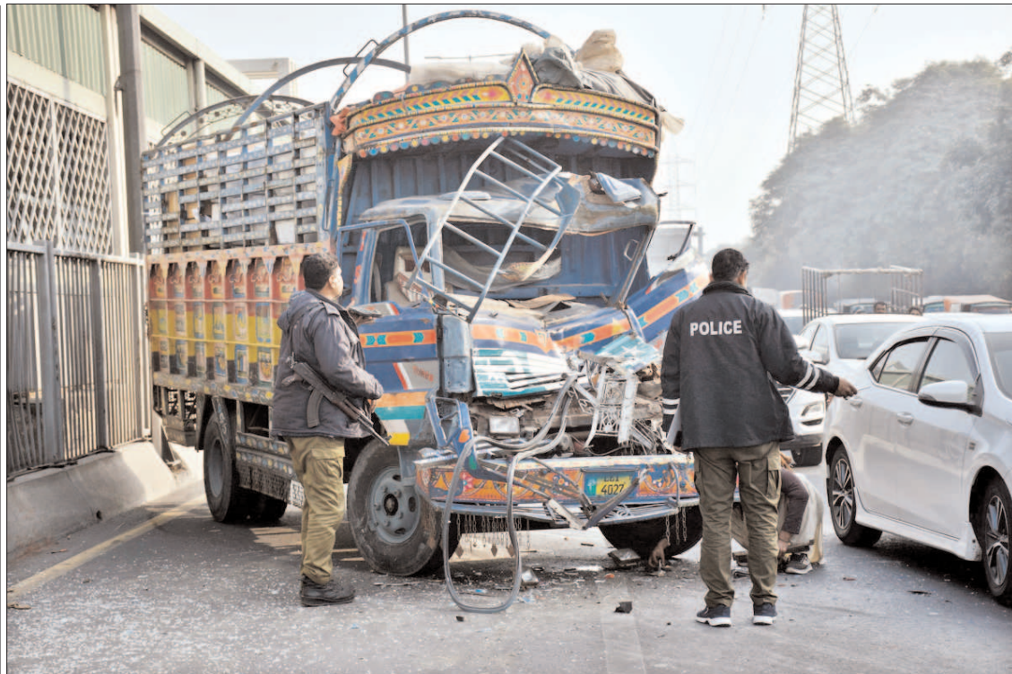
LAHORE: A view of a damaged truck after it overturned on Ferozepur Road.

The CM said that action will be taken against those who fail to implement the SOPs with regard to buying and selling alcohol. The New Year should be started in a safe and peaceful environment. Punjab's journey to development and prosperity will be further strengthened, she maintained.