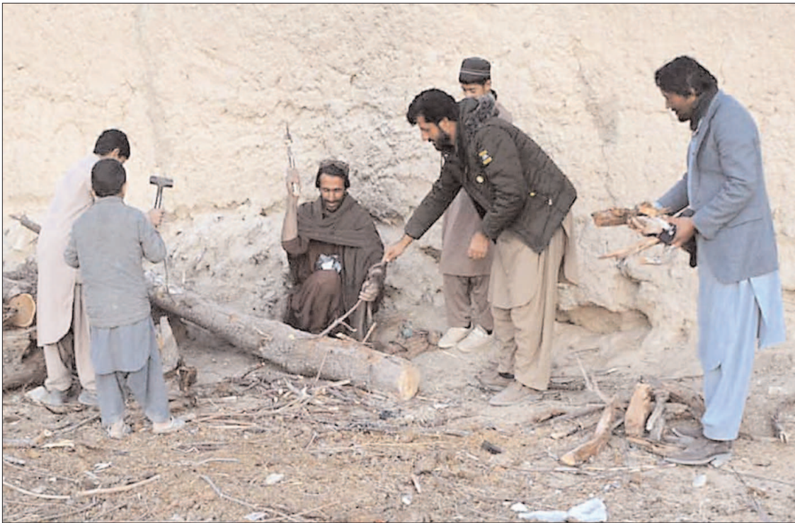
QUETTA: People collecting dry wood for domestic use due to shortage of Sui gas supply.

BUNER: A two-day's workshop held at University of Buner in collaboration with the support of European Union, United Nations and NACTA on Interfaith Harmony Countering Violent Extremism and promoting peace, on Tuesday. The workshop was attended by various communities including representatives of the Sikh community, students, scholars of Madrassas and members of civil society.