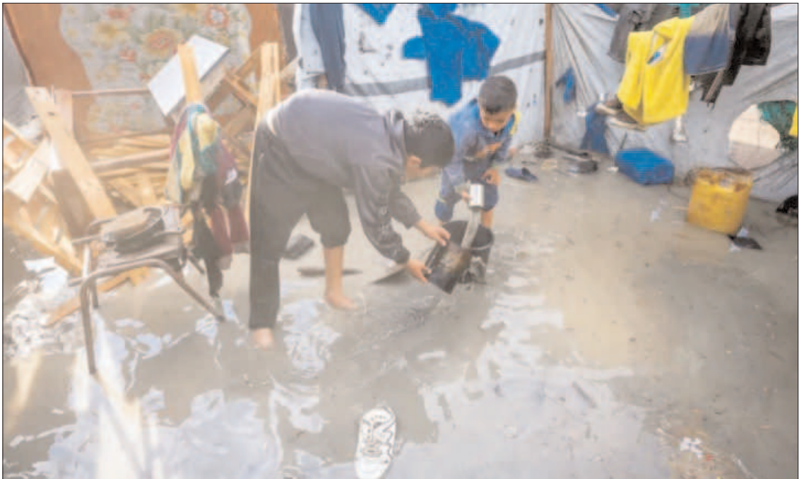
GAZA: Forcibly displaced Palestinians taking shelter in tent camps are battling harsh weather as heavy rainfall flooded their tents in Deir el-Balah.