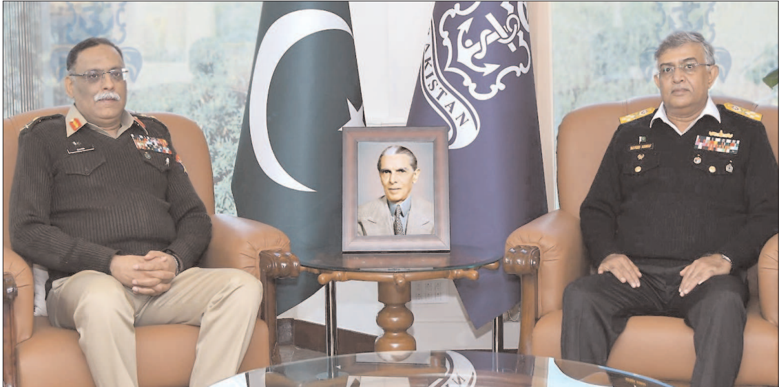
ISLAMABAD: Chairman Joint Chiefs of Staff Committee General Sahir Shamshad Mirza exchanging views with Chief of the Naval Staff Admiral Naveed Ashraf at Naval Headquarters.