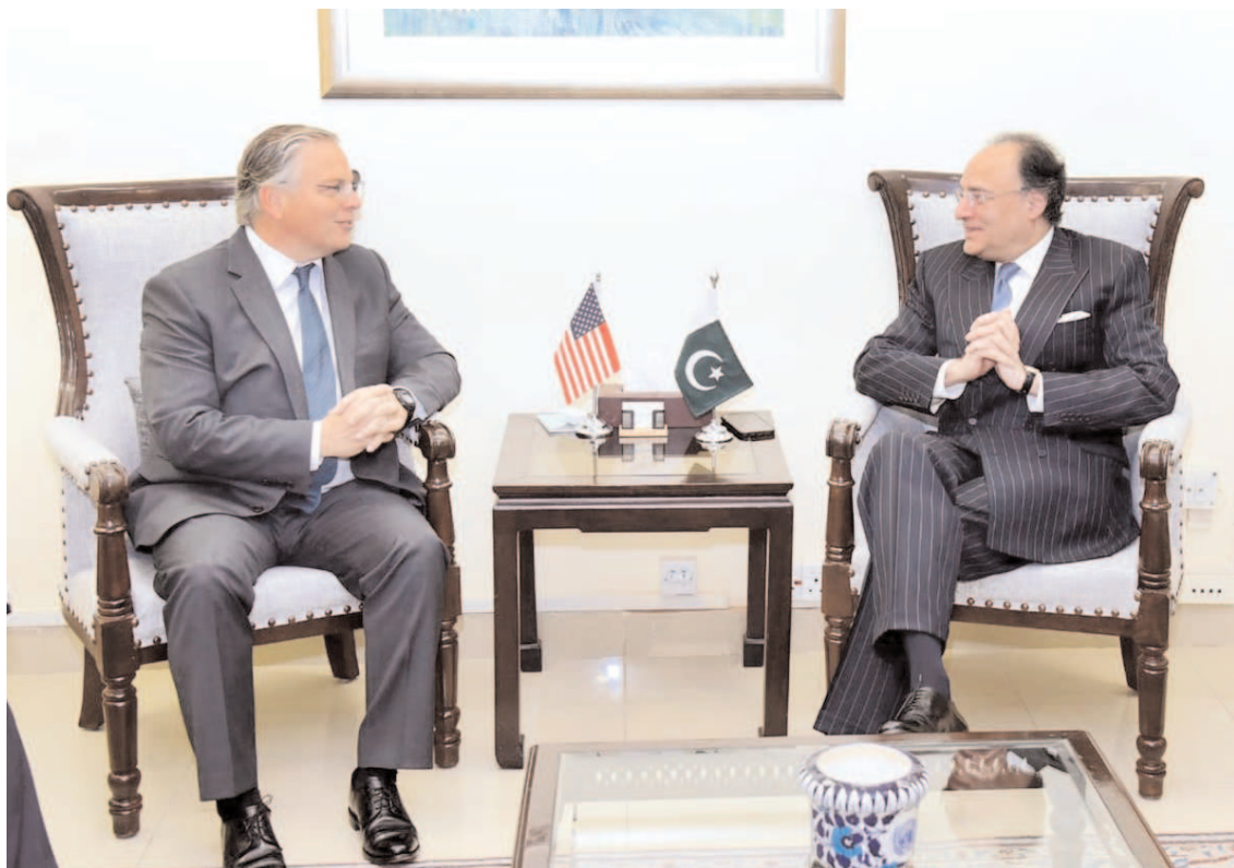
ISLAMABAD: US Ambassador Donald Blome meeting with Federal Minister for Finance and Revenue Senator Muhammad Aurangzeb at Finance Division.