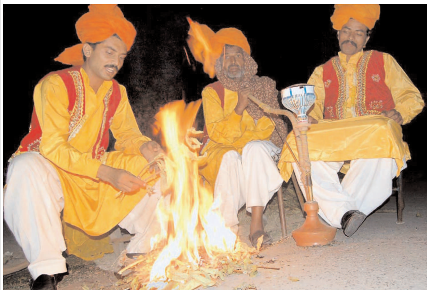
RAWALPINDI: Drum performer sitting around fire to warm themselves at Muree road due to cold weather in city.

He said that the smugglers continue to use modern methods to smuggle drugs. ANF is vigilant and determined to combat drug smuggling at the national and international levels, the spokesman added.