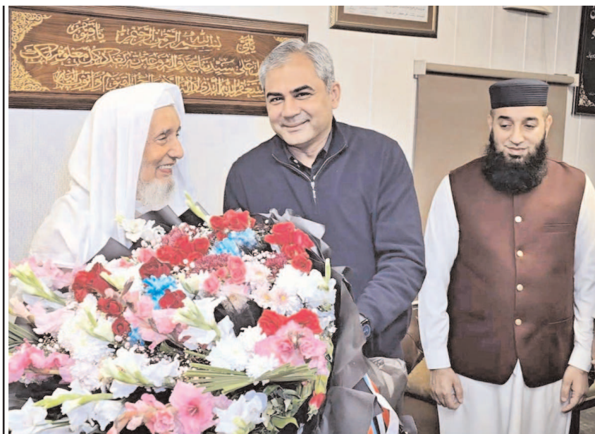
ISLAMABAD: Interior Minister Mohsin Naqvi presenting a bouquet to Wafaqul Madaris' Patron-in-Chief Maulana Fazl Rahim Ashrafi.

Mushaal urged the UN and global powers to hold India accountable and take concrete steps to resolve the Kashmir dispute, ending the suffering of Kashmiris once and for all.