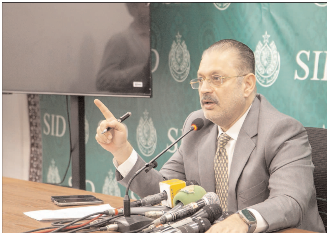
KARACHI: Senior Minister Sindh Sharjeel Inam Memon addressing a press conference in Karachi.

This visit is being hailed as a key milestone in promoting technology in Pakistan and ensuring the success of the Karachi Safe City Project.