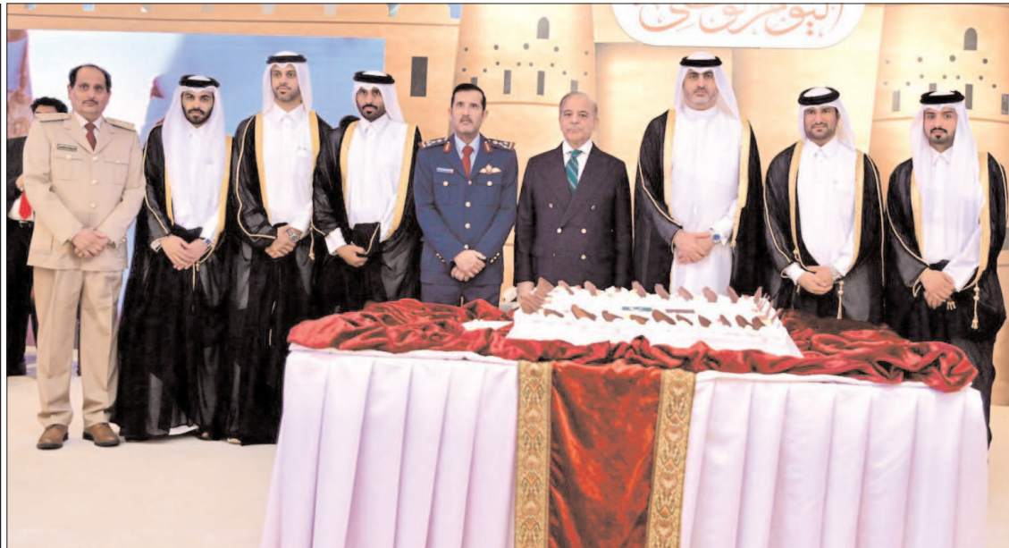
ISLAMABAD: Prime Minister Shehbaz Sharif and Ambassador of Qatar to Pakistan, Ali Mubarak ali Essa Al-Khater cutting cake to celebrate, Qatar's National Day.

In his message on International Human Rights Day, the prime minister said that since the adoption of the Universal Declaration of Human Rights by the United Nations in 1948, the commemoration of International Human Rights Day on 10th December every year, reminded all nations of the world to adhere to protecting inviolable human rights and preserve human values. He mentioned that much before the adoption of the Human Rights Declaration by the UN; the sacred religion Islam had exhorted human beings to follow tenets of human values.