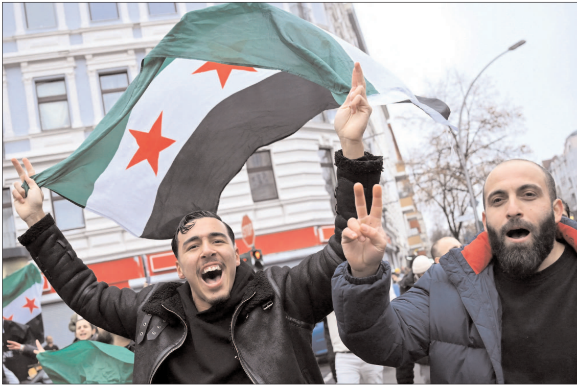
BERLIN: A man waving Syrian flag as people gather on the streets in Germany.