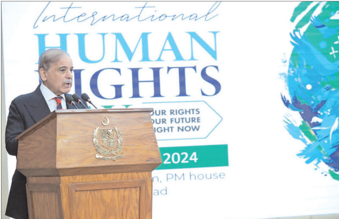
ISLAMABAD: Prime Minister Shehbaz Sharif addressing a ceremony to mark International Rights Day.