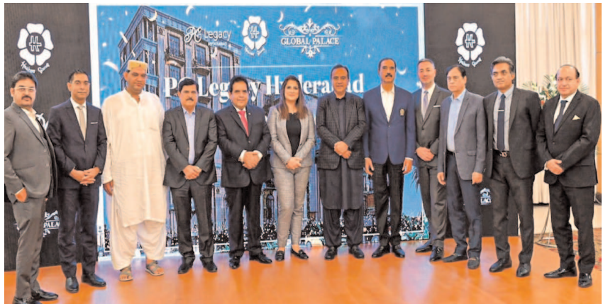
KARACHI: Senior officials from Hashoo Group and Global Palace during a signing ceremony held at Pearl-Continental Hotel.

Hong Kong stocks surged more than three percent at Tuesday's open, extending a rally of 2.8 percent Monday. Shanghai, which had closed before the news, gained more than two percent in early trade Tuesday.