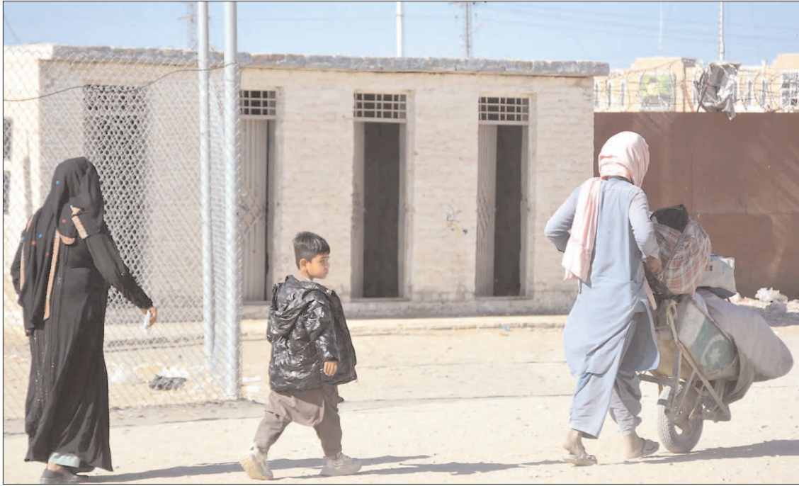
QUETTA: Illegal migrants going back to Afghanistan.