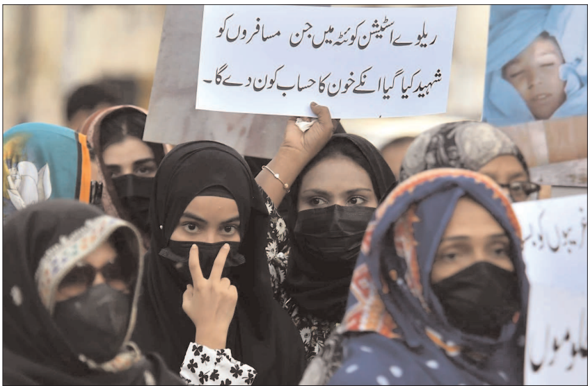
KARACHI: Members of Civil Society hold pycard during protest rally outside KPC.

approach to promoting interfaith harmony and safeguarding minority rights. Both officials expressed their desire to further strengthen the diplomatic and cultural ties between Pakistan and Belarus. Minister Arora and Ambassador Metelitsa also discussed ways to deepen cooperation in sectors such as education, trade, and cultural exchanges, with an emphasis on fostering mutual understanding and collaboration. The meeting concluded with both sides agreeing to continue dialogues on enhancing bilateral relations, ensuring a positive and progressive future for both nations.