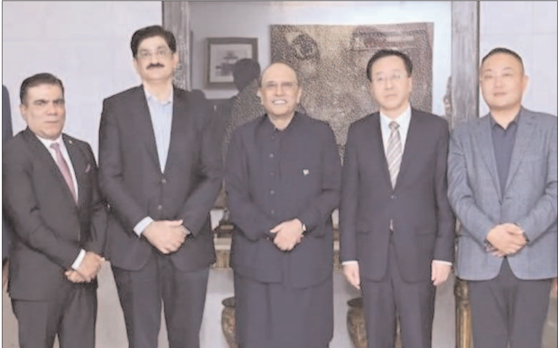
KARACHI: President Asif Ali Zardari in a group photo with Chinese business delegation, who called on him.