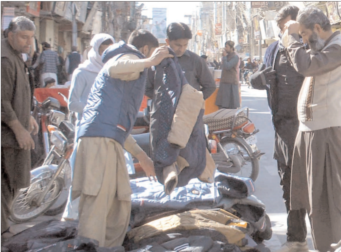
QUETTA: People selecting and purchasing warm clothes from a roadside vendor.