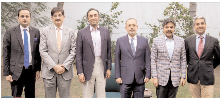
KARACHI: Chief Minister of Sindh, Syed Murad Ali Shah, Sindh Senior Minister Sharjeel Inam Memon and others in a group photo with PPP Chairman, Bilawal Bhutto Zardari.

Syed Nasir Hussain Shah said, "Sindh offers investment opportunities in the energy, industrial, agricultural, and transport sectors." The Sindh government welcomes not only Chinese investors but also all the international investors and offers full cooperation and facilities to all investors.