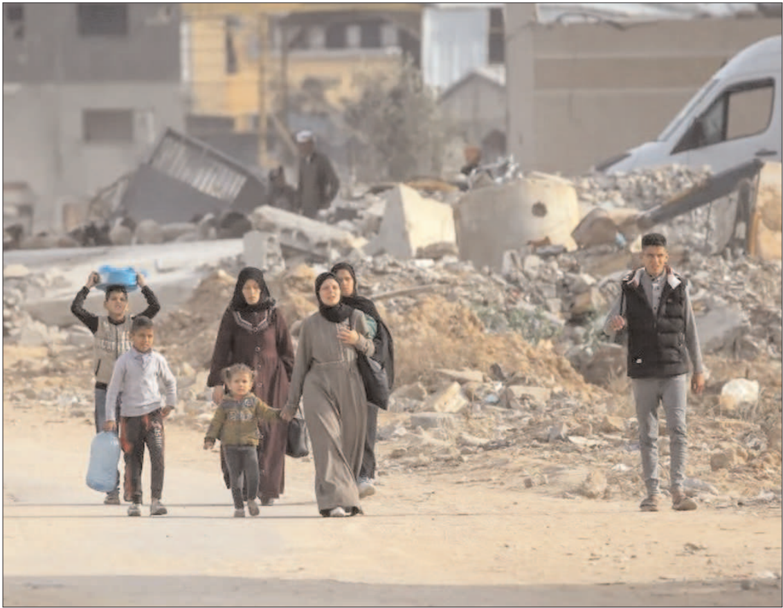
GAZA: Palestinian families fleeing Maghazi refugee camp following Israel's leave-or-die threats.

Tarar reaches Istanbul ISLAMABAD (APP): Federal Minister for Information, Broadcasting, National Heritage and Culture Attaullah Tarar on Thursday arrived in Istanbul, Turkiye on a three-day visit. He will represent Pakistan at Stratcom Summit 2024 being held in Istanbul. During his stay in Istanbul, the minister for information will meet the Head of Media and Communications of Turkish Presidency, Prof. Fahrettin Altun.