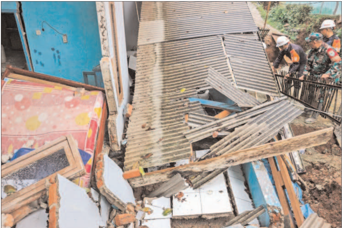
JAKARTA: Rescuers clearing rubble from damaged houses at a neighbourhood affected by a landslide in Sukabumi, West Java, Indonesia.