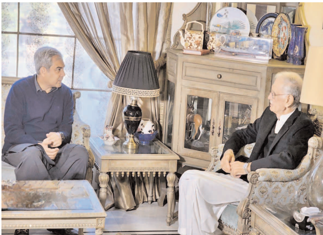
ISLAMABAD: Interior Minister Mohsin Naqvi in a meeting with Pervez Khattak, founder of the PTI Parliamentarians.