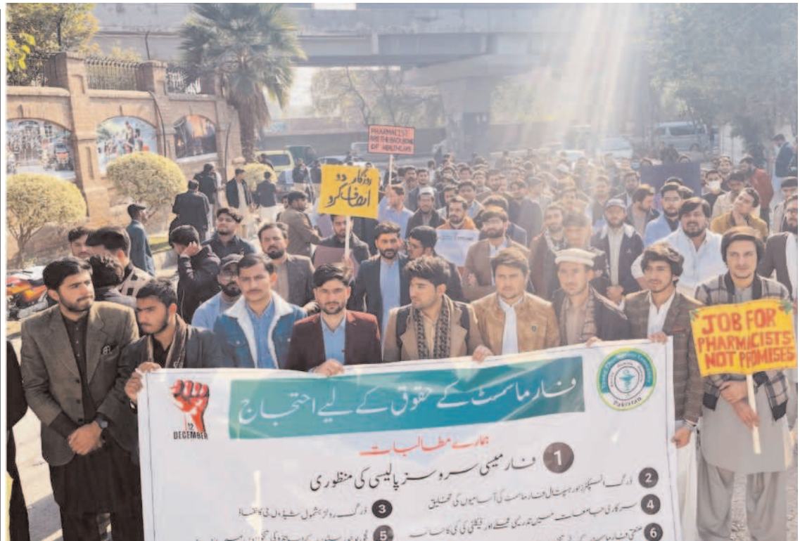
PESHAWAR: Members of Young Pharmacists Association protesting against government's pharmacy services policy.