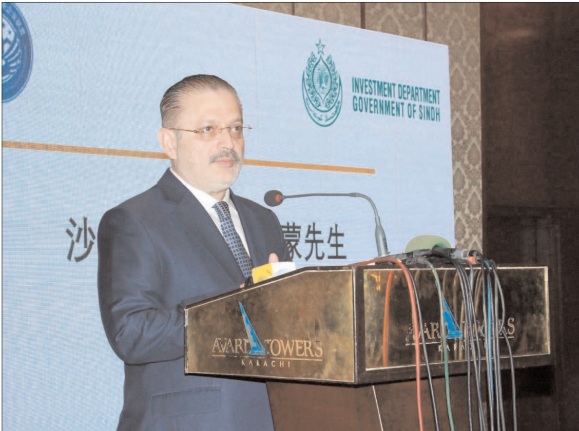
KARACHI: Sindh Senior Minister Sharjeel Inam Memon addressing the Sindh Investment Conference in Karachi.