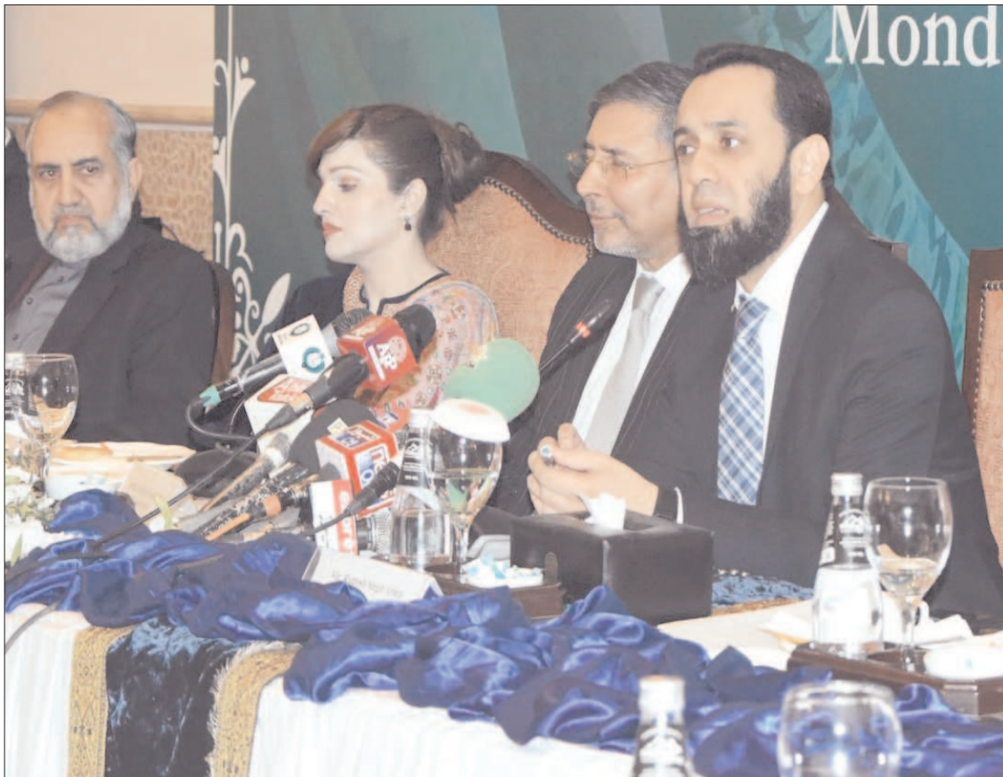
ISLAMABAD: Federal Minister for Information, Attaullah Tarar addressing an IRD dialogue titled 'Leveraging Pakistan's cultural diversity to foster peace within and without.'

Chief Minister Ali Amin Khan Gandapur has directed the acceleration of digitization process in the provincial government departments and said that it was the policy and priority of his government to enhance the capacity of government departments and improve transparency, good governance, and service delivery across the sectors. He directed the quarters concerned to immediately complete the remaining work of Digital City Haripur and initiate work the project for establishing IT Park in Peshawar. He termed this development as a testament to the KPITB's commitment to driving digital growth and empowering the youth of Khyber Pakhtunkhwa, adding that the KPITB is playing a pivotal role in shaping the province's digital future.