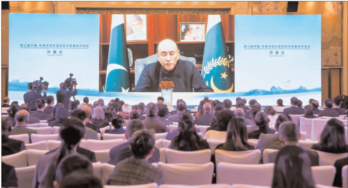
ISLAMABAD: President Asif Ali Zardari addressing the 3rd China-Indian Ocean Region Forum on Blue Economy held in Kunming, China.