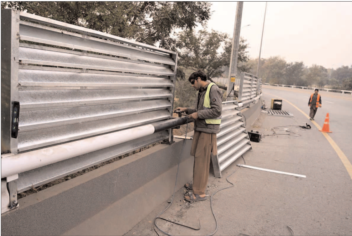
ISLAMABAD: A welder busy reinforcing the roadside fence on Zero Point Flyover in the Federal Capital.