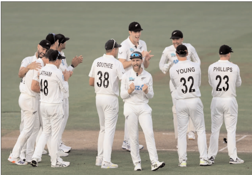
HAMILTON: Kane Williamson and New Zealand celebrate after a review couldn't overturn Zak Crawley's dismissal.

New Zealand resumed on 136-3, holding a 340-run advantage after the tourists were skittled for 143 on Sunday.