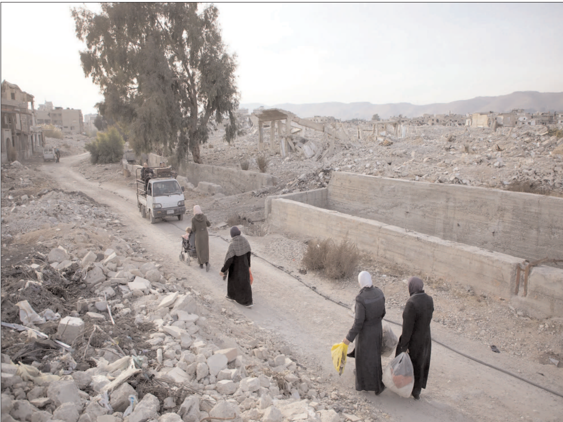
DAMASCUS: Syrian residents returned to see what had been done to their neighbourhoods. Some could hardly believe that they were finally able to come back.

Honduras' Deputy Foreign Minister García expressed skepticism about Trump's threat, citing the economic benefits immigrants provide to the US economy and the logistical challenges of mass deportations. Aid leaders like Muñoz say Honduras isn't sufficiently preparing for a potential surge in deportations. Even with a crackdown by Trump it would be "impossible" to stop people from migrating, García said. Driven by poverty, violence and the hope for a better life, clusters of deportees climb aboard buses on their way back to the US.