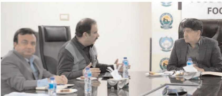
PESHAWAR: Provincial Minister for Food chairing the meeting of Provincial Committee for Food.