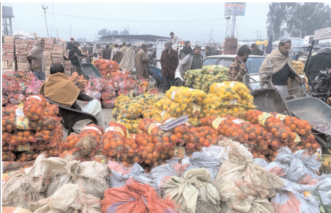
ISLAMABAD: A vendor displaying oranges to attract customers at Islamabad Fruit and Vegetables Market.

The exchange rates of the Emirates Dirham and the Saudi Riyal decline by 02 paise each to close at Rs75.74 and Rs74.02, respectively.