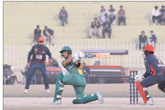
table with 10 points from six games. ABL Stallions are second with eight points in six games. Nurpur Lions are third with six points while Lake City Panthers are a rung behind with six points but inferior net run-rate. Engro Dolphins have lost all their six matches and are out of the race for the 25 December final.

The win lifted UMT Markhors to the top of the