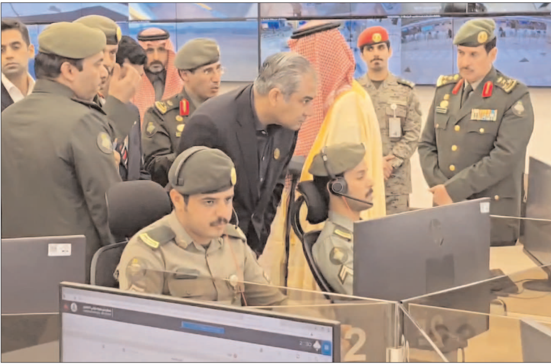
RIYADH: Federal Minister for Interior, Mohsin Naqvi visiting Directorate of Passports of Saudi Arabia.

"An Indian Navy craft lost control while undertaking engine trials in Mumbai Harbour due to engine malfunction. As a result, the boat collided with a passenger ferry which subsequently capsized," the Navy said in a statement on X. Local TV channels showed a boat carrying at least five people hitting the passenger vehicle, causing the accident.