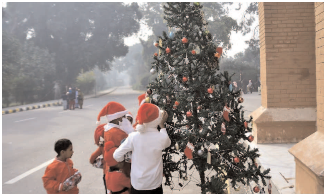
PESHAWAR: Children decorating Christmas Tree at St John Catholic Church as preparation for the upcoming Christmas celebrations.

This approval underscores ADB's confidence in the GoKP's efforts to strengthen health infrastructure, improve service delivery, and modernize equipment across secondary healthcare facilities