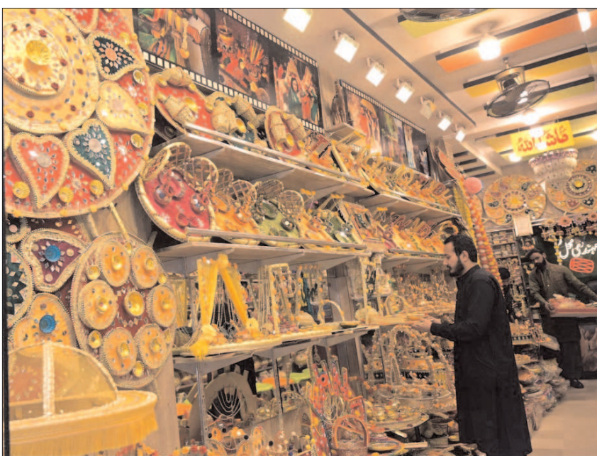
RAWALPINDI: A vendor busy in displaying henna stuffs to be used in weddings at his shop at Old Fort in the city.

In addition to this, board consented to the policy of allotment of housing apartments to the officers of PHA with fixation of permanent seniority under 1% quota besides granting permission for a mandatory management course for the mid-career officers of technical cadre in PHA.