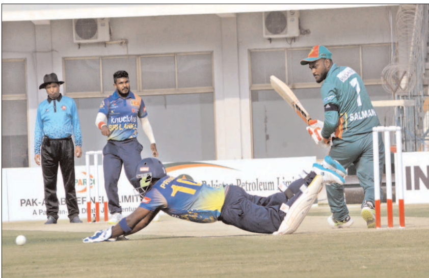
MULTAN: A view of the semifinal cricket match played between the Bangladesh Blind Cricket team and Sri Lanka Blind Cricket team.