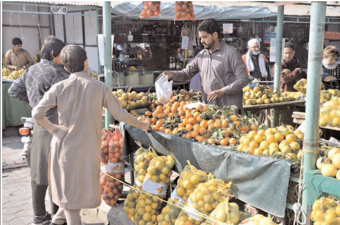
ISLAMABAD: Vendors displaying seasonal fruits to attract customers at Sunday Bazaar.

The association also presented a handmade carpet and a special shield to the Uzbek ambassador, who reciprocated with a shield for the PCMEA Chairman.