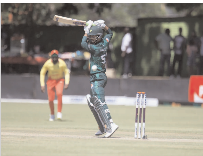
BULAWAYO: Saim Ayub punches the ball away with a high elbow.