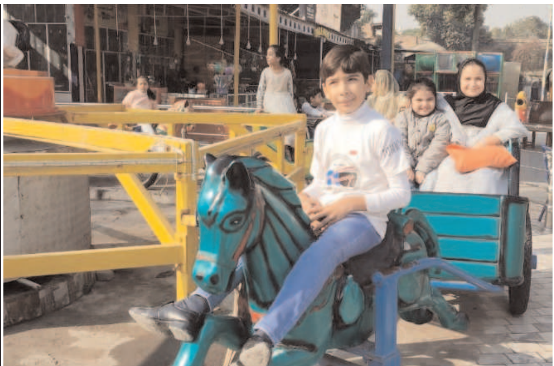
PESHAWAR: Children enjoying a ride on a swing during the Fun Fair organized by Peshawar Press Club and Khyber Union of Journalists for the children and families of the journalists.