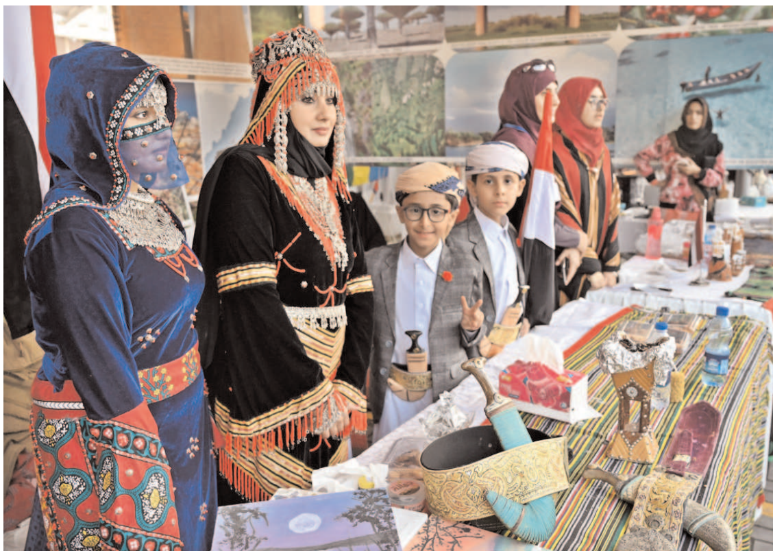
ISLAMABAD: Women visiting stalls at the Pakistan Foreign Office Women's Association (PFOWA) Annual Charity Bazaar 2024, held in collaboration with the Diplomatic Corps at the Ministry of Foreign Affairs.