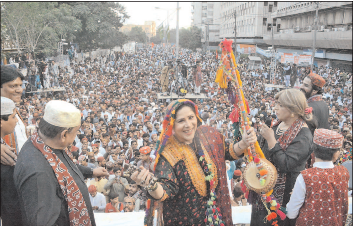
KARACHI: Renowned singer Taj Mastani performing on the occasion of Sindh Culture Day outside Karachi Press Club.