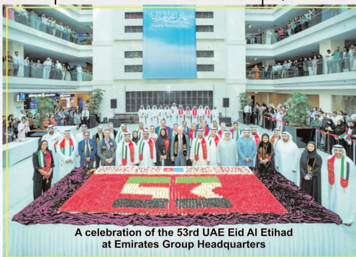
A celebration of the 53rd UAE Eid Al Etihad at Emirates Group Headquarters

In Emirates First Class Lounges in Dubai, customers can feast on traditional Emirati chicken machbous followed by an array of tempting desserts including karak profiteroles, Umm Ali spheres, lommie kabeese cheesecake and Emirati luqaimat served with date syrup and pistachio sauce. In the Business Class Lounges, Emirati style lamb ouzi made with locally sourced lamb, mint raitha and dakkus will be served, while delectable treats will be displayed including Arabic coffee delicie, loomi and rose profiteroles, guerss ugaili cardamom sesame financiers and burnt gahwa chocolate tarts. Customers in both First and Business Class lounges can also treat themselves to a refreshing ice-cream from the Emirates ice-cream cart, homemade in the locally sourced flavours of Halwa and Arabic coffee. Celebrating the sustainability ethos of the 53rd UAE Eid Al Etihad, Emirates Lounges highlights a range of locally sourced products including local luqaimat from Ajman and date syrup from Sharjah.