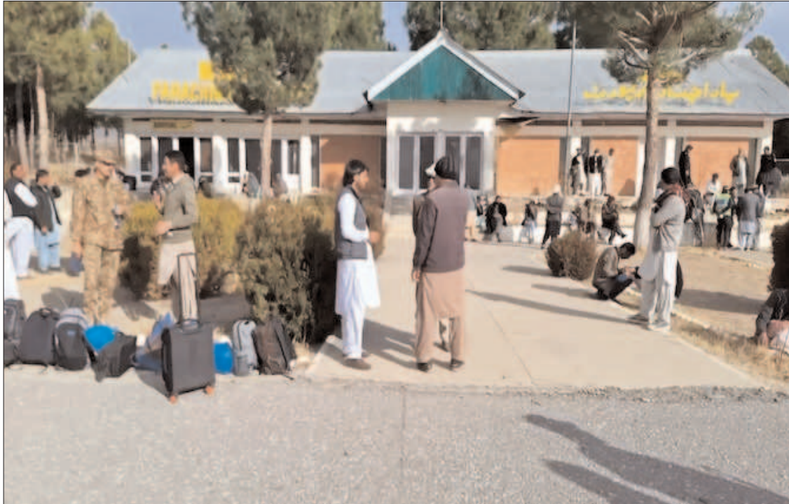
PESHAWAR: The still image taken from the video shared by Khyber Pakhtunkhwa chief minister's office on Sunday, shows people awaiting to be rescued via helicopter in Kurram district.

These committees are part of efforts to foster coordination and mutual understanding, ensuring progress and harmony in Khyber Pakhtunkhwa.