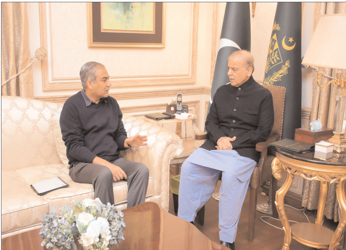
LAHORE: Federal Minister for Interior Mohsin Naqvi called on Prime Minister Muhammad Shehbaz Sharif in Lahore.