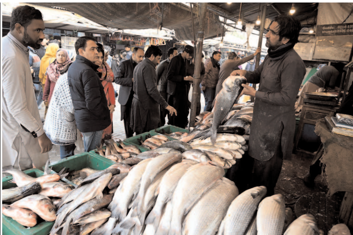
ISLAMABAD: People buy fish as demand rises despite high white meat prices during winter at H-9 Weekly Bazaar.

In conclusion, while Pakistan has made progress in tobacco control, much work remains to be done. Strengthening enforcement mechanisms, increasing public awareness, and imposing higher taxes on tobacco products are crucial steps toward a healthier, smoke-free future. Only through collective efforts can we mitigate the devastating impact of tobacco on public health and the economy.