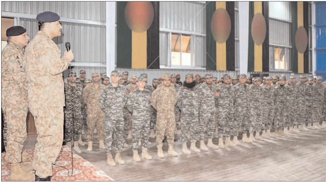
WANA: Chief of Army Staff General Syed Asim Munir addressing the troops during his visit to South Waziristan.

Upon his arrival in Wana, the COAS was received by the Corps Commander Peshawar.