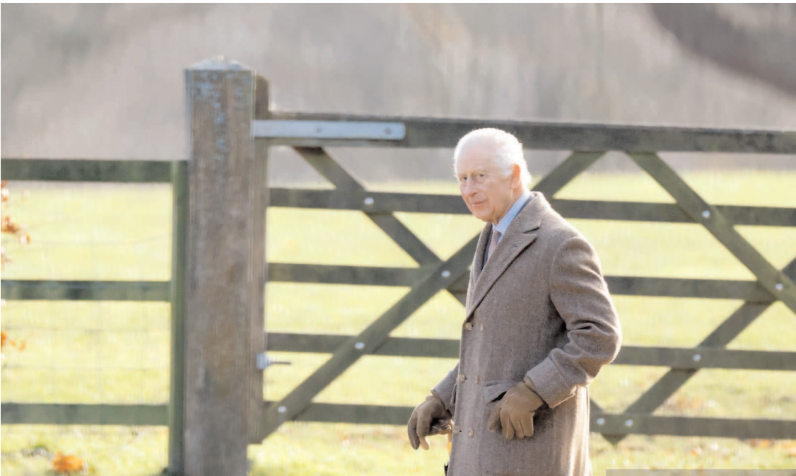
SANDRINGHAM, UNITED KINGDOM: King Charles III departs after attending the 4th Sunday of Advent service at the Church of St Mary Magdalene on the Sandringham estate on Sunday.

of elections in February. Its members, including the candidate for chancellor Alice Weidel, planned a rally in Magdeburg on Monday evening. Saudi Arabia had repeatedly flagged to Germany concerns over posts on the suspect's social media, according to a Saudi source and a German security source. The Christian Democrats, Germany's main opposition party, and the Free Democrats, who were part of the coalition government until its collapse last month, called for improvements to Germany's security apparatus, including better coordination between federal and state authorities. "The background must be clarified. But above all, we must do more to prevent such offences, especially as there were obviously specific warnings and tips in this case that were ignored," Sahra Wagenknecht, leader of the leftist BSW party, told the Welt newspaper. The BSW, a new political party with far-left roots, has also condemned unchecked immigration and has gained considerable support ahead of the Feb. 23 election. Chancellor Olaf Scholz, whose Social Democrats are trailing in opinion polls, attended a service for victims in Magdeburg's cathedral on Saturday.