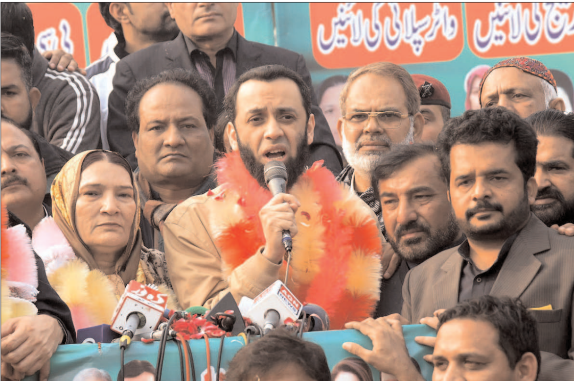
LAHORE: Federal Minister for Information and Broadcasting Attaullah Tarar addressing the ceremony after inaugurate development works at Green Town.

LAHORE (APP): The School Management Council has been given the authority by the Punjab Government to spend from Rs.4 to 25 lakhs for schools' works. Schools Department sources told APP that the school administration is no longer dependent on the C&W Department for general work expenditures. Sources said the C&W Department used to build two bathrooms for Rs11.5 million, while the School Department will build it for Rs4 lakhs. In this connection, the CEO Education of the Schools Department has been instructed to focus on the schools of 5 UCs of the district. The initiative will also help bring back out-of-school children in the 5 union councils. The Secretary School Education, in a statement, said that if even 50 percent of the children return with the decision, it will be a considerable improvement.