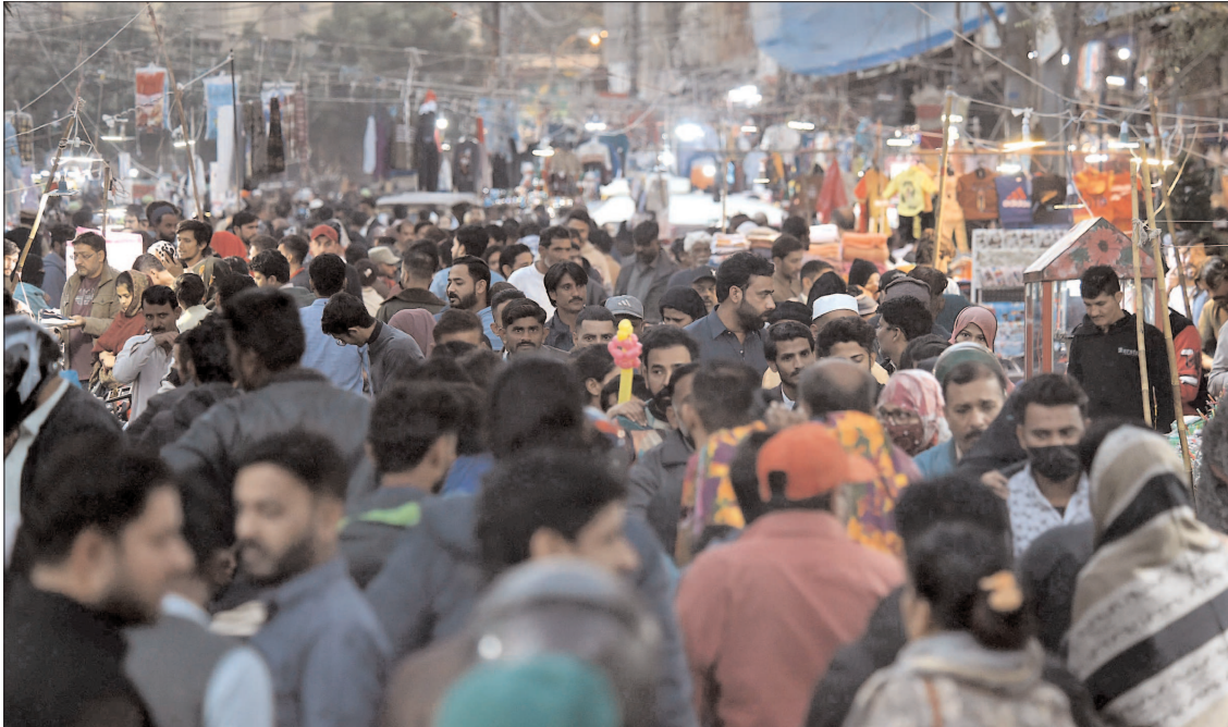
KARACHI: A view of rush at Bohri bazar ahead of upcoming Christmas celebrations.

while 3529 citizens completed employee registration (ROPE). The IG Punjab emphasized that the Police Khidmat Marakaz is a remarkable project for public service delivery with provision of 14 services to citizens. He instructed RPOs and DPOs to further enhance and streamline the delivery of services to citizens following the feedback received from citizens.