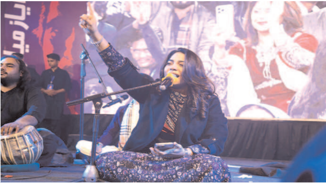
HYDERABAD: Renowned singer Sanam Marvi performs on stage at the Ayaz Festival held at Sindh Museum.

MUZAFFARGARH (APP): Police claimed on Sunday to have arrested seven people for gambling and recovered stake money from their possession. In a crackdown, Shahr Sultan police conducted a raid and arrested seven gamblers and recovered stake money of Rs 55,000, mobile phones and other paraphernalia from them.