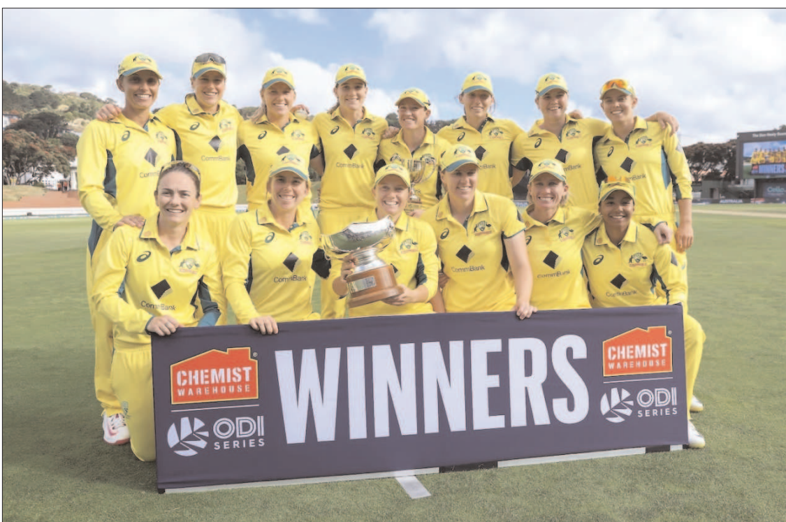
WELLINGTON: Alyssa Healy and her team won the ODI series unbeaten, New Zealand vs Australia 3rd Women ODI.