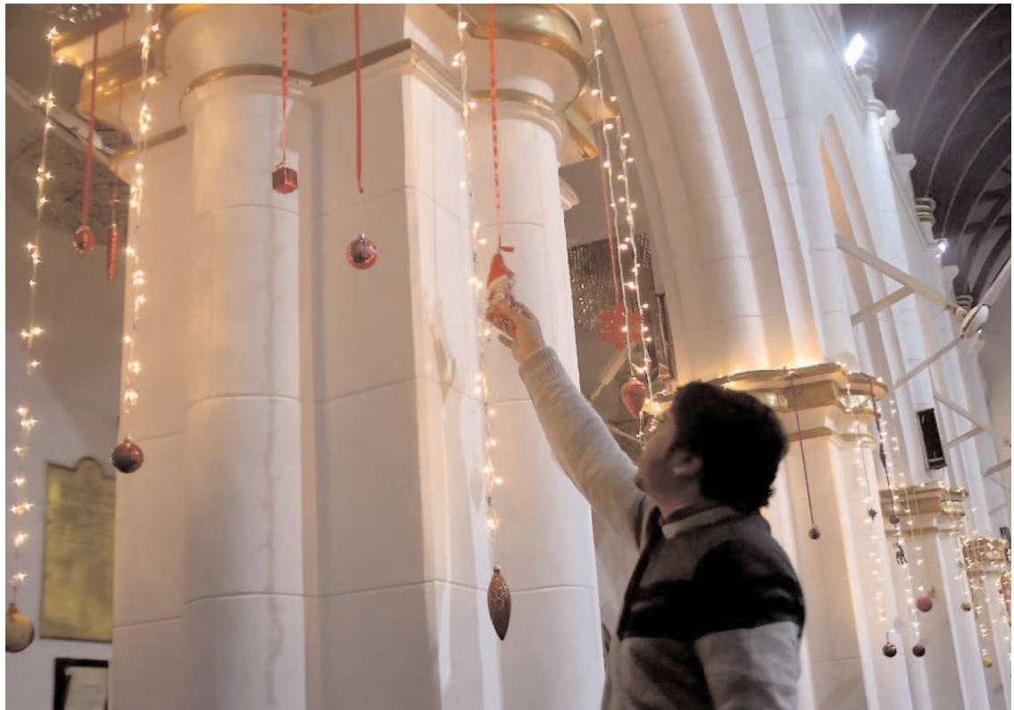
PESHAWAR: A man busy in decorating St John Catholic Church in connection with Christmas celebrations.

The Governor also expressed grief and sorrow over the demise of the mother of famous cricketer Shoaib Akhtar and prayed for the departed soul in eternal peace and grant courage to bereaved family members to bear this irreparable loss with fortitude.