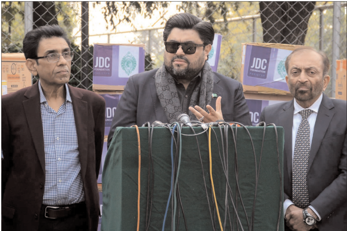
ISLAMABAD: Governor Sindh Kamran Khan Tessori addressing a press conference regarding supplies of Medicine in Kurram Agency, MNA Farooq Sattar and others present at Sindh House.

LAHORE (APP): Punjab Information Minister Azma Bokhari has said that CM Punjab Maryam Nawaz's joy at the scholarship cheque distribution ceremony was truly noticeable. The Punjab government is providing laptops to children instead of petrol bombs, she said and added that under the Maryam Nawaz leadership, the people of Punjab are experiencing a real change. Azma said that there was a past era of turmoil of the "Fitna party" in which children of the nation were urged to "kill, destroy and make petrol bombs." Now, under the leadership of Nawaz Sharif's daughter, we are seeing a new era where children are being given laptops. For the convenience of students, electric bikes are also being provided to them, interest-free loans for businesses, and scholarships are being awarded for children's education, she added. The minister said the vision of Chief Minister Maryam Nawaz was to equip children with modern education so they could play a key role in changing the country's future. Our government believes in practical politics and public service, not in propaganda. This is why, in our one-year term, improvements are visible in every sector, she added. The "Fitna group" had left no stone unturned in destroying every institution of Pakistan, she concluded.