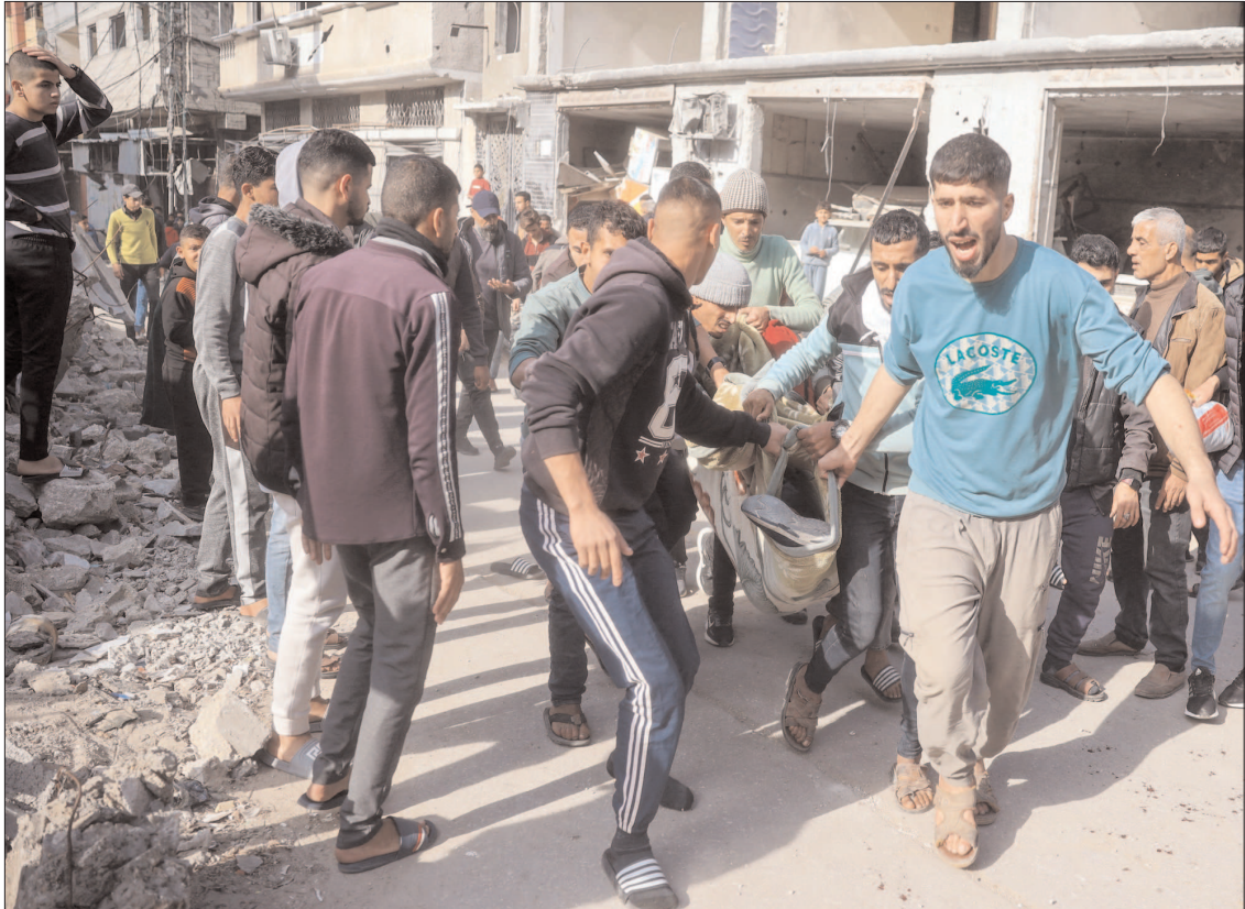
GAZA STRIP: People carrying body of a man killed in an Israeli attack on the Bureij refugee camp.