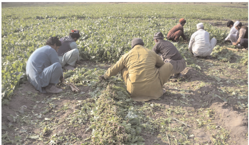
PESHAWAR: Farmers busy in harvesting spinach in their field.

During the session, Zahid Chun Zeb highlighted that the River Act implemented in Khyber Pakhtunkhwa has been copied from Punjab and that the province lacks its own tailored legislation, which is highly regrettable.