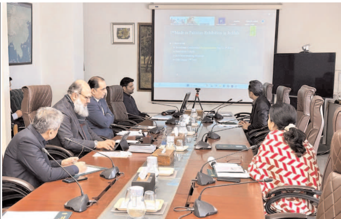
JEDDAH: Federal Minister for Commerce Jam Kamal Khan reviewing arrangements on working setup of 'Made in Pakistan' Exhibition in Jeddah.

Investors expressed optimism about future collaborations and strengthening their working relationship with the authority for lucrative investment opportunities. It was further announced that the auction of petrol pump and 19 commercial properties will be held today.