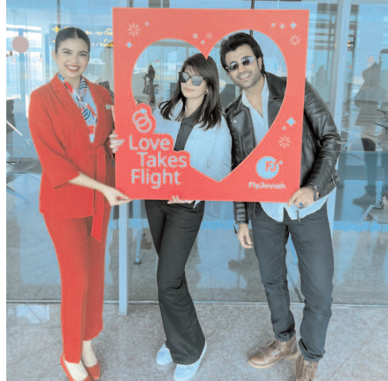
travel, making every journey extraordinary.