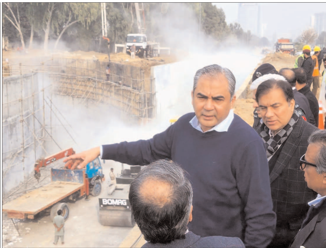
ISLAMABAD: Federal Minister for Interior Mohsin Naqvi visiting F-8 Exchange Chowk Interchange Project in Federal Capital.

Cases have been registered against the arrested accused under the Narcotics Control Act and further investigations are under process.