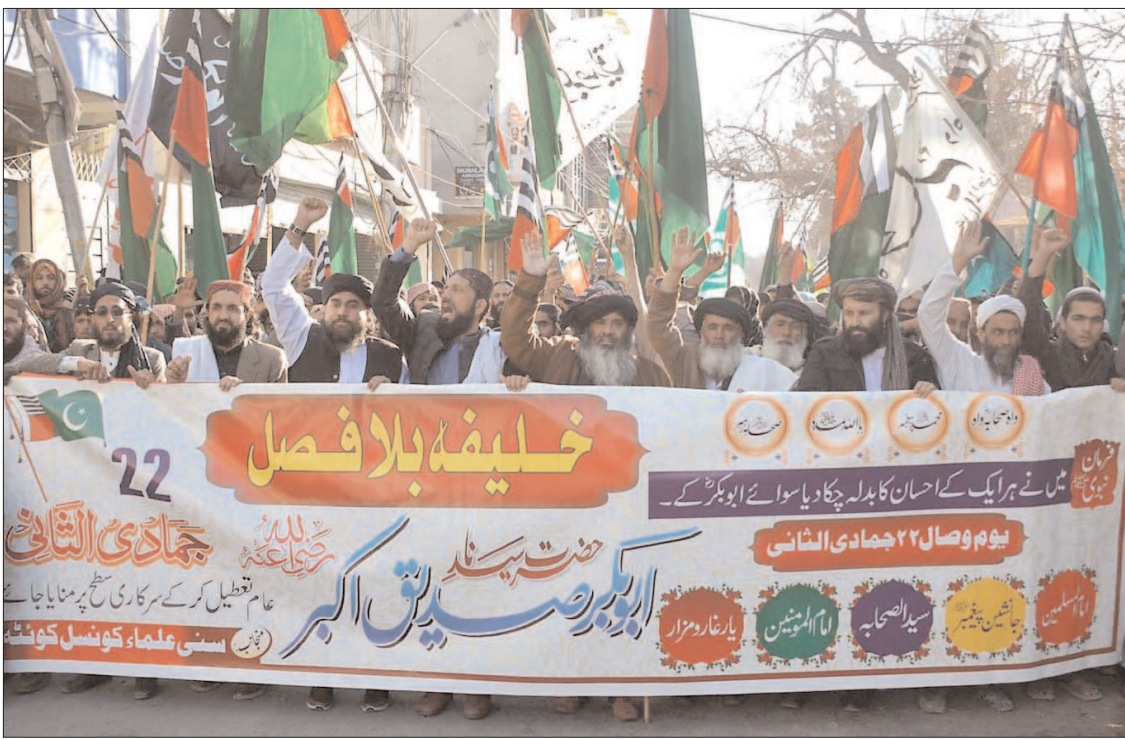
QUETTA: Activists of Sunni Ulema Council holding a protest rally.