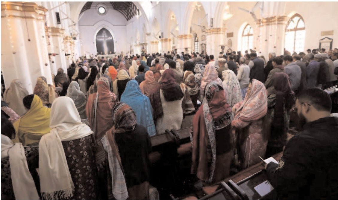
PESHAWAR: Christians attending prayers on Christmas day at St John Catholic Church.