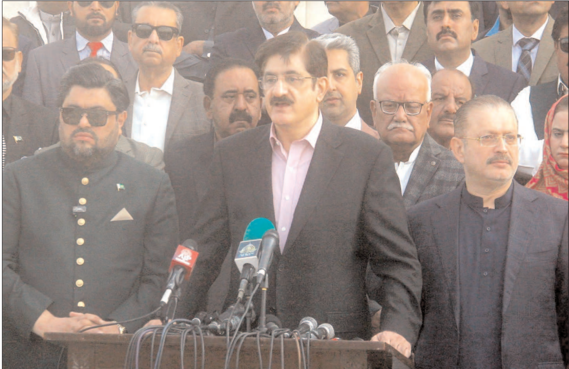
KARACHI: Sindh Chief Minister, Syed Murad Ali Shah along with Governor, Kamran Tessori talking to media persons at Mazar-e-Quaid.