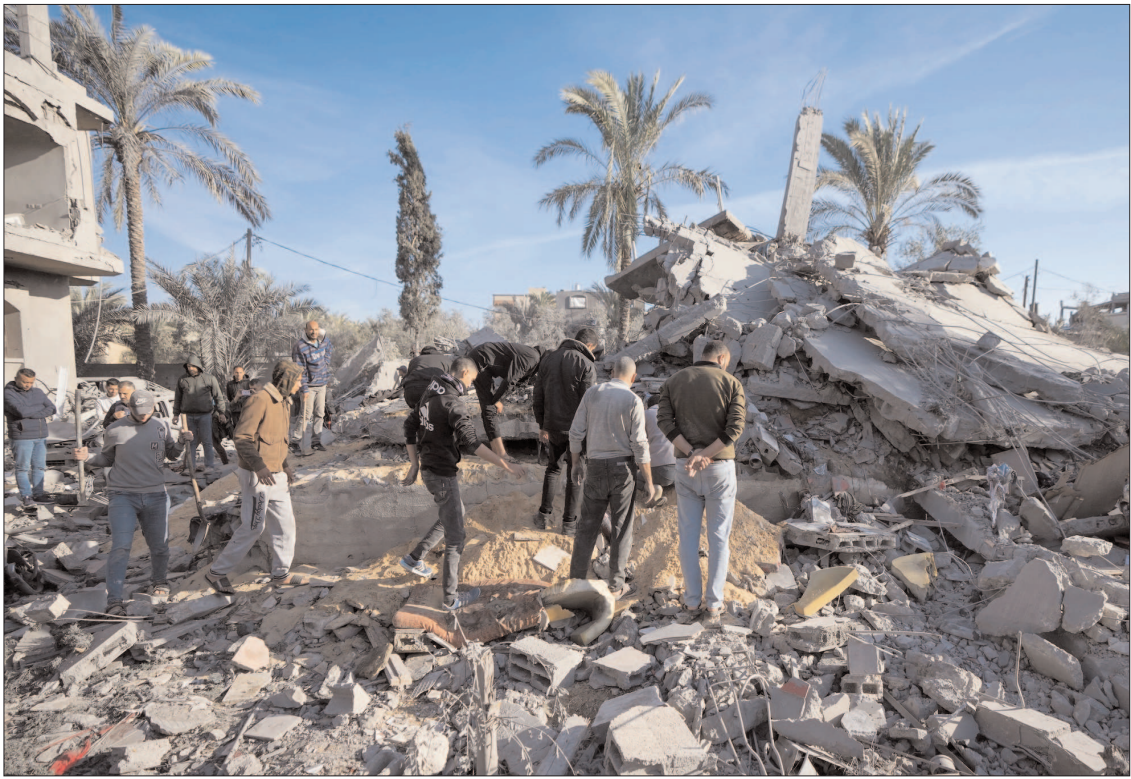
GAZA: Palestinians looking at a home destroyed by an Israeli attack in Deir el-Balah.