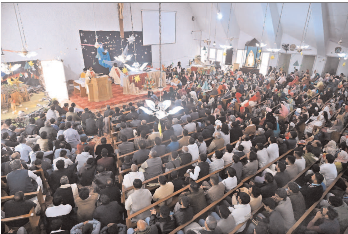
ISLAMABAD: Christian community perform religious rituals during Christmas prayer at Fatima Church F-8.

RAWALPINDI (APP): Anti-Narcotics Force (ANF) while conducting six operations across the country arrested six drug dealers and recovered over 115 kg drugs worth over Rs 10 million, said an ANF Headquarters spokesperson here on Wednesday. He informed that two different operations were conducted near Red Sun Capital Square B-17 in Islamabad and ANF recovered 14.4 kg opium, 70.8 kg hashish and 12 kg ice hidden in two vehicles while two suspects were arrested. 12 kg hashish was recovered from a vehicle intercepted near Kala Shah Kaku Interchange Lahore and a suspect was arrested during the operation. In fourth operation, 10 intoxicated tablets were recovered from a parcel sent from Peshawar at a courier office in Karachi. 6 kg of hashish was recovered from the possession of the suspect rounded up near a bus stop in Islamabad. 302 grams ice was recovered from a suspect held near Srinagar Highway Islamabad. Cases have been registered against the arrested suspects under the Narcotics Control Act and further investigations are under process.