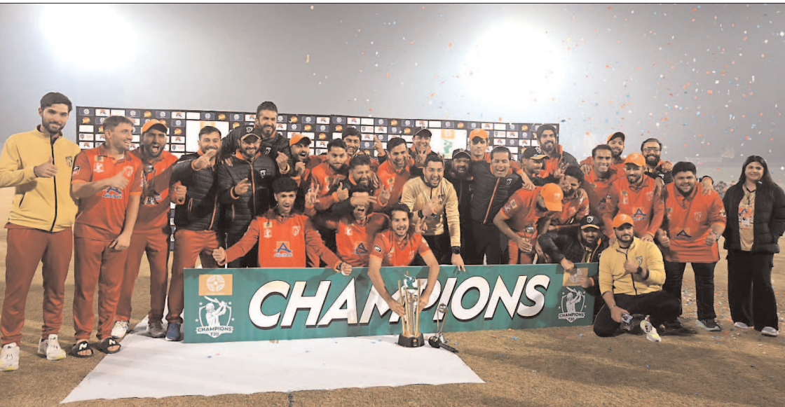
RAWALPINDI: Stallions team celebrate after winning Bahria Town Champions T20 Cup 2024-25 trophy at Pindi Cricket Stadium.