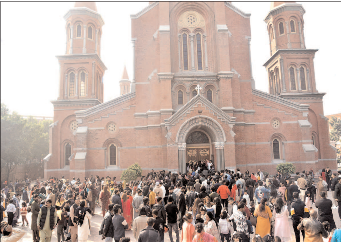
LAHORE: A large number of Christian community members gather to perform religious rituals on the occasion of Christmas Day in Sacred Heart Cathedral Church.