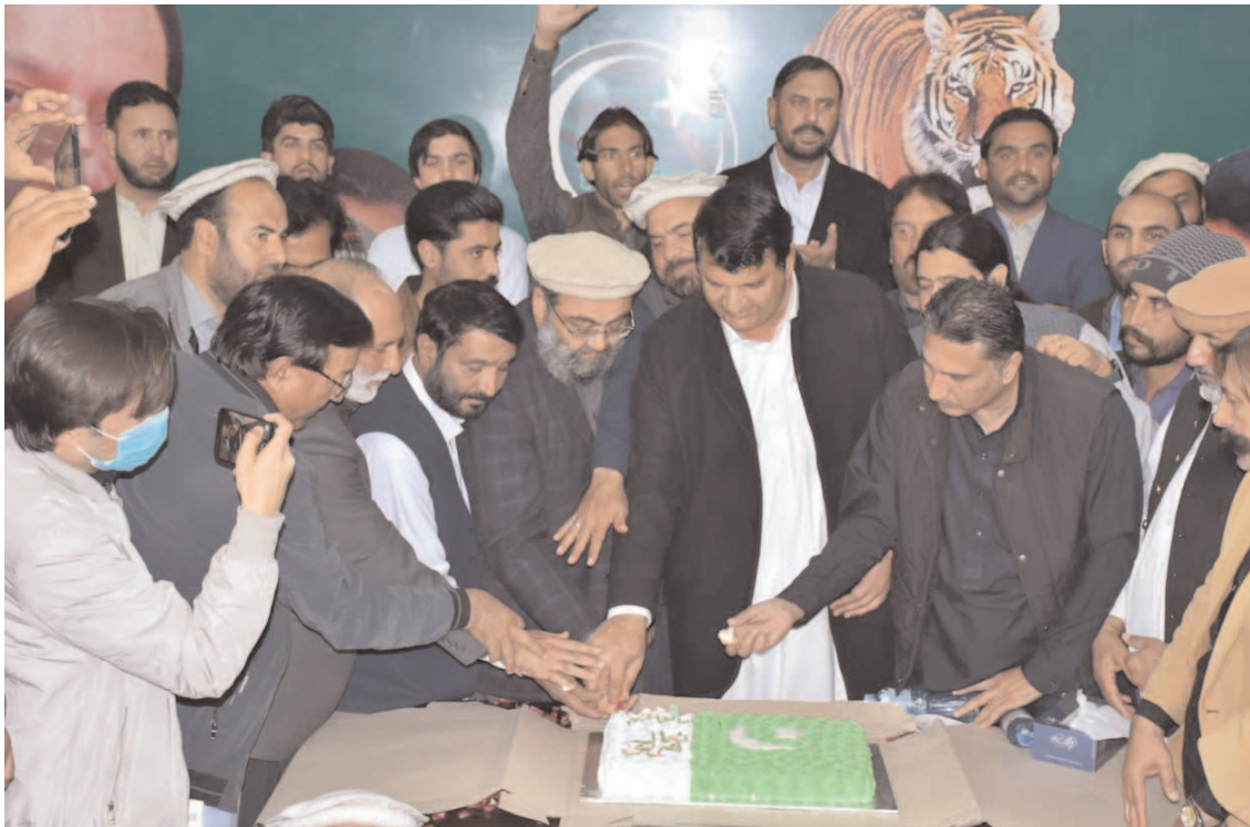
PESHAWAR: Federal Minister for States and Frontier Regions, Kashmir and Gilgit Baltistan Affairs, Engr Amir Muqam cutting the cake to celebrate the 148th birthday of Quaid-e-Azam.

lems. He said that share of NFC award given to KP should be used for welfare of people rather than agitation politics, adding KP rulers should compete with Punjab and Sindh Govt in service delivery and good governance. The irrational civil obedience call would only damage Pakistan and it's people, he said, adding KP Govt failed to restore peace in Kurram. Engr Amir Muqam reaffirmed Govt commitment to continue work for the stability and progress of Pakistan. Due to Govt successful economic policies, he said that foreign investment started coming back to the country, stock exchange achieved heights and price hike reduced to 4 digit which is a major triumph. Earlier, Engr Amir Muqam cut the cakes of the birthdays of Quaid e Azam Muhammad Ali Jinnah and PMLN Quaid Muhammad Nawaz Sharif.