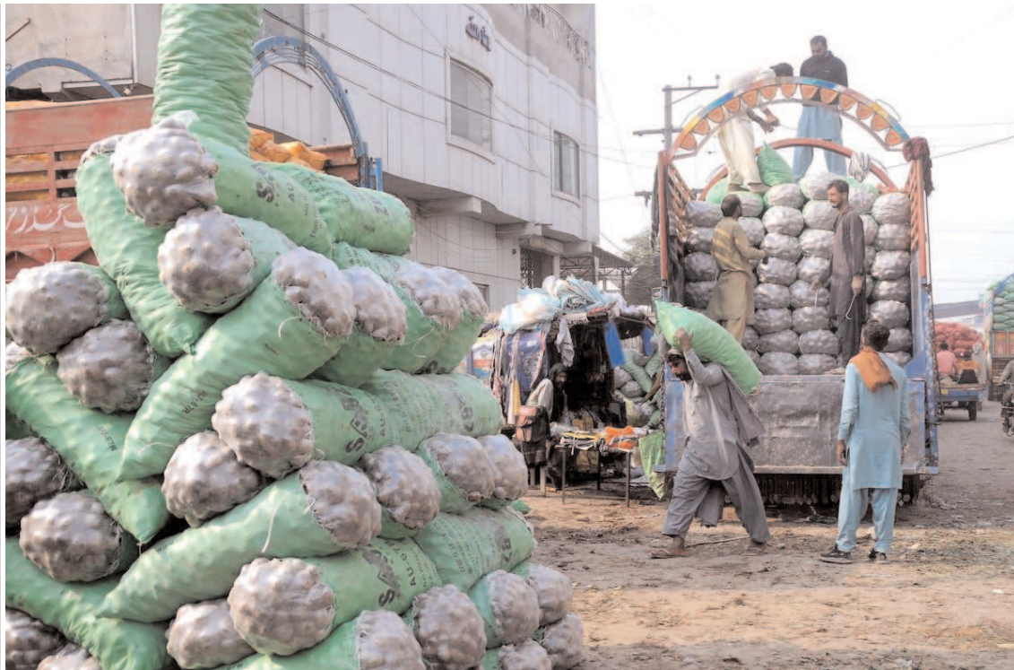
MULTAN: Labourer unloading potato bags from a delivery truck at Vegetable Market.

the Saudi Riyal decreased by 03 and 01 paisa which closed at Rs75.78 and Rs74.12, respectively. Gold rates up by Rs1,400 per tola The price of 24 karat per tola gold increased by Rs1,400 and was sold at Rs274,000 on Thursday against its sale at Rs272,600 the previous day. The price of 10 grams of 24 karat gold also increased by Rs1,200 to Rs234,911 from Rs233,711 whereas that of 10 gram 22 karat gold went up to Rs215,335 from Rs214,235, All Sindh Sarafa Jewellers Association reported. The prices of per tola and ten gram silver remained constant at Rs3,350 and Rs2,872.08 respectively. The price of gold in the international market increased by $14 to $2,628 from $2,614, the Association reported.