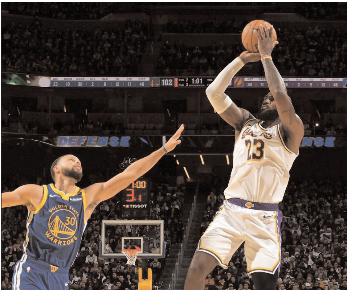
SAN FRANCISCO, CA: LeBron James #23 of the Los Angeles Lakers shoots the ball during the game against the Golden State Warriors at Chase Center in San Francisco, California.

They could have snatched it late on when Orel Mangala's deflected strike wrong-footed Stefan Ortega but the ball drifted the wrong side of the post, leaving Everton the happier side with the result but without a victory against City in their past 16 meetings.