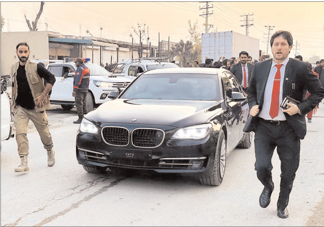
RAWALPINDI: Security officials escorting vehicle of KP Chief Minister, Ali Amin Gandapur, arrived at Adiala jail to meet PTI founder, Imran Khan.

Shaheed Mohtarma Benazir Bhutto and our family sacrificed their lives for the cause of democracy and Pakistan. It is my firm belief that we, as a nation, need to draw inspiration from her vision to steer the country out of its current challenges. Let us work together to ensure that her dream of a peaceful, progressive, and democratic Pakistan becomes a reality. Her legacy is eternal, her courage unmatched, and her vision our guiding star. Pakistan Khappay!