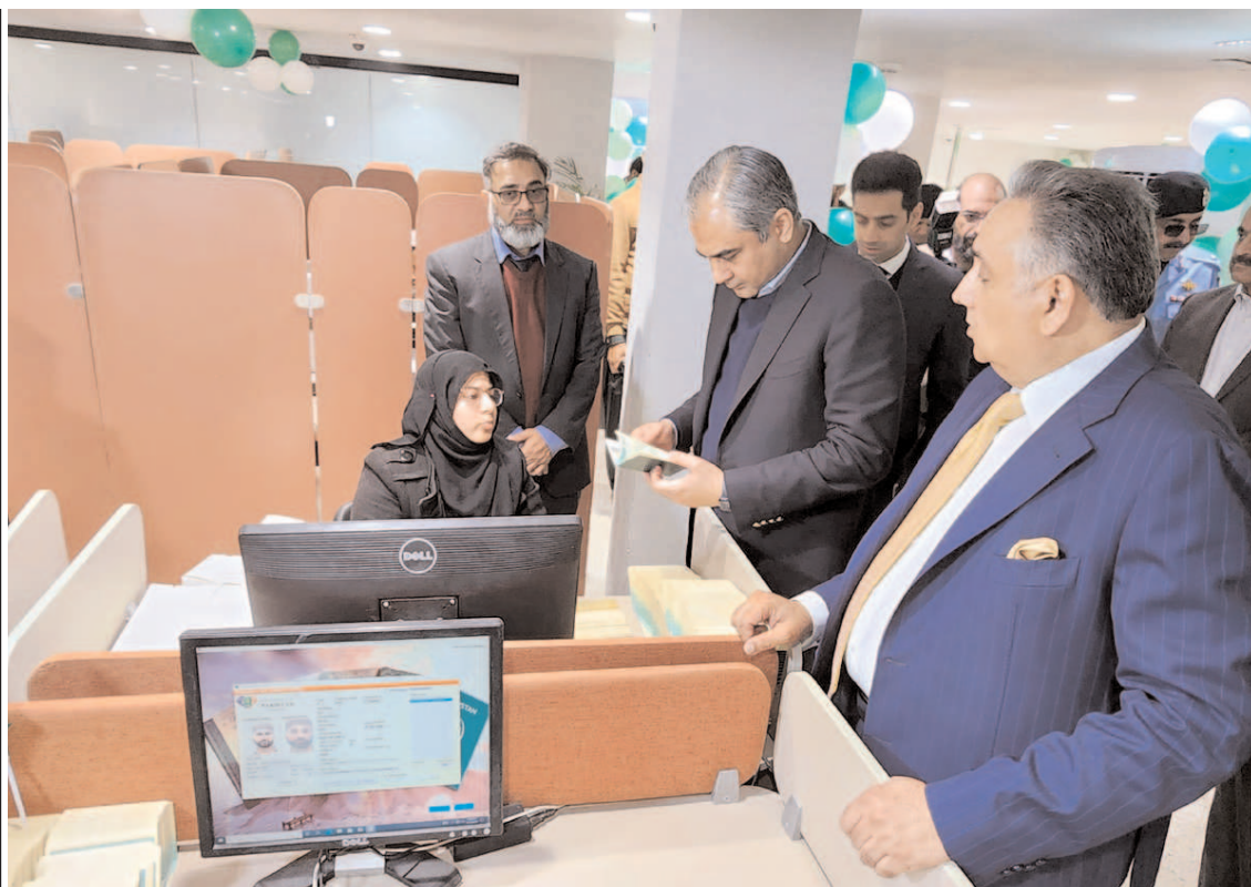
ISLAMABAD: Federal Minister for Interior Mohsin Naqvi visiting State-of-the-Art Immigration and Passports Headquarters.

The district administration has appealed to the public for cooperation in reporting areas where begging is prevalent.