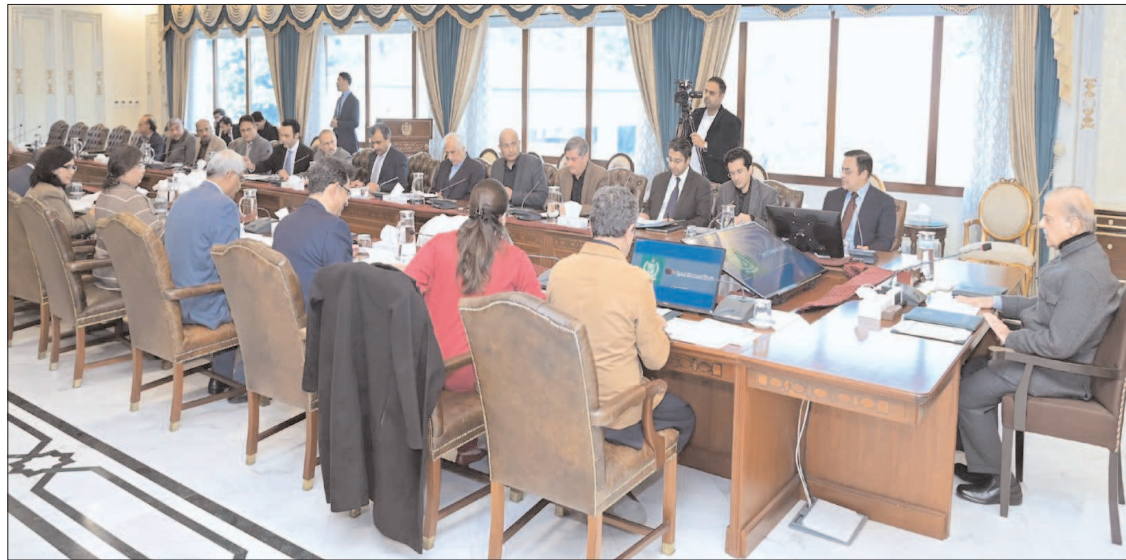
ISLAMABAD: Prime Minister Shehbaz Sharif chairing a review meeting on performance of electricity distribution companies.

Moreover, free access to the 118 helpline from all mobile operators was being ensured for complaints related to electricity transmission, it was further added. The complaint resolution (up to November) stood at: LESCO: 99.2 percent, PESCO: 99.9 percent and FESCO: 99.7 percent.