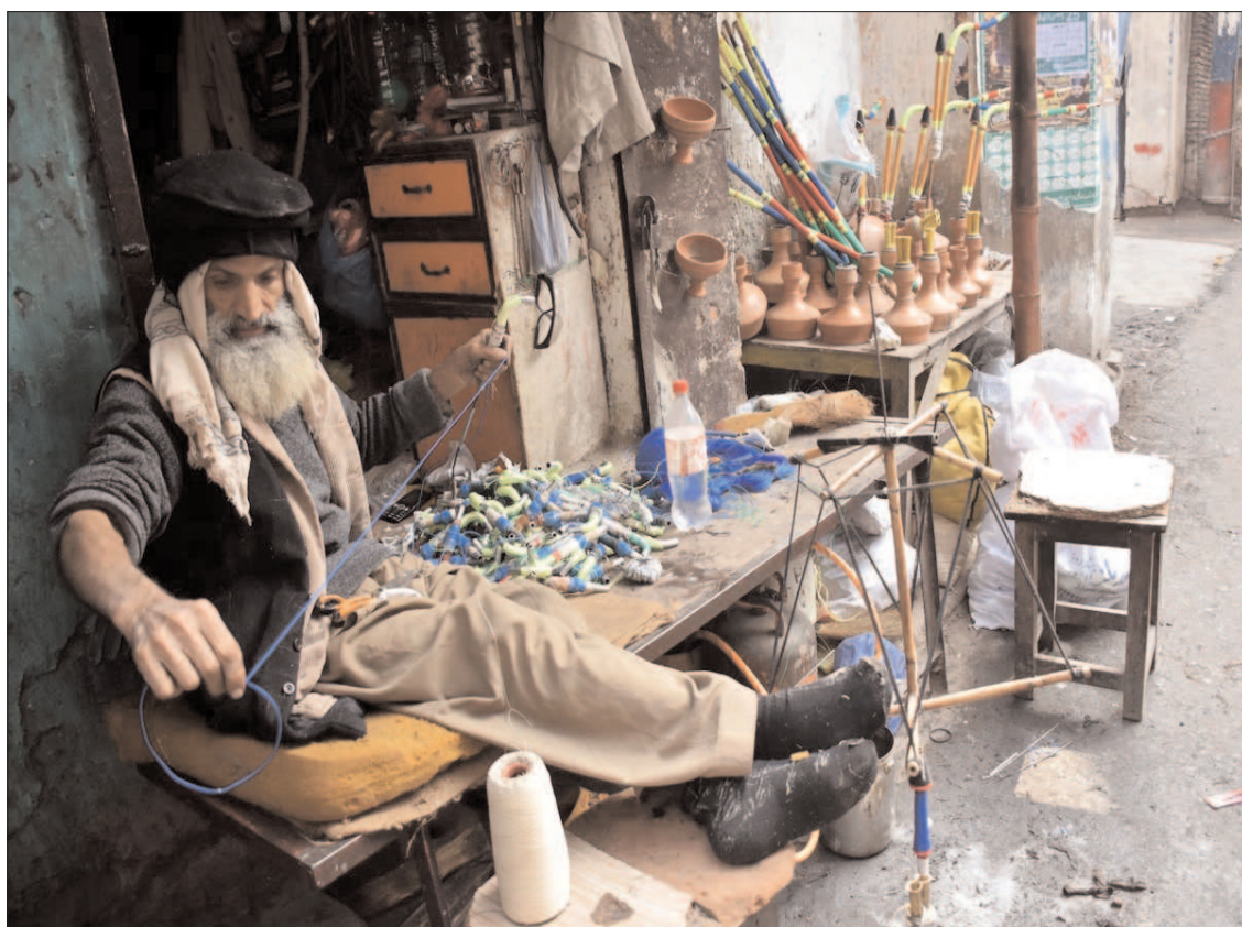
LAHORE: A vendor preparing upper parts of the traditional smoking Hookah at his shop in the Provincial Capital.

The NICVD's achievements in 2024 underscore its role as a global leader in free cardiac healthcare, made possible through the generous support of the Government of Sindh, unwavering dedication of NICVD's staff, and the institution's commitment to excellence.