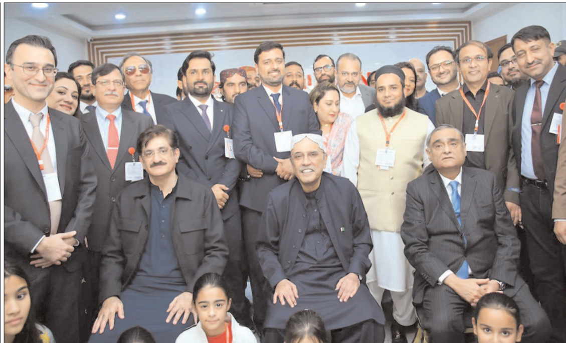
SUKKUR: President Asif Ali Zardari in a group photo at inauguration ceremony of Dr. Ziauddin Hospital Sukkur campus.

Statements by Azerbaijani officials suggest Baku believes the plane was hit mid-air, while the US has said it had "early indications" Russian air defence may have been responsible for the crash.