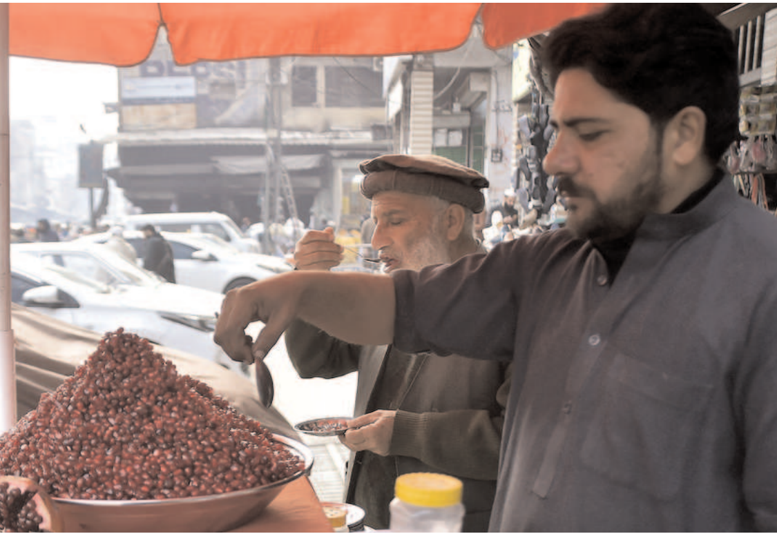
PESHAWAR: A man eating pomegranate from roadside vendor at Ashraf Road.