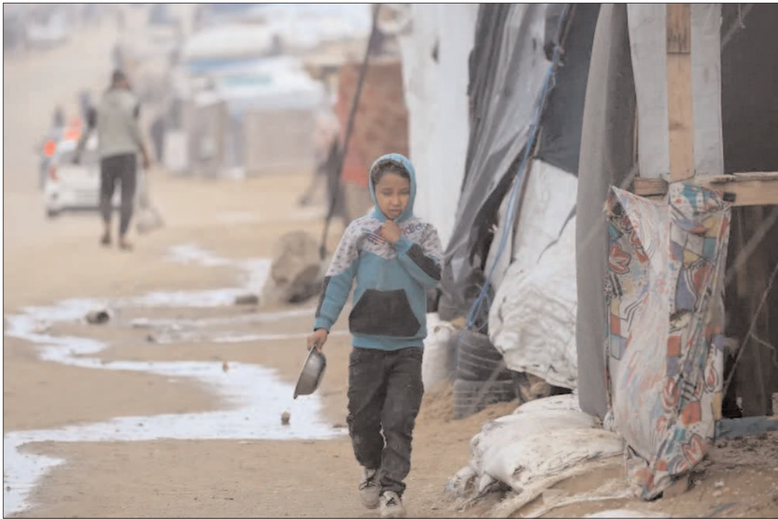
GAZA STRIP: A Palestinian child runs to shelter from the rain at a camp for internally displaced on the beach near the Nuseirat refugee camp.

The president-elect also repeated claims that Panama is "ripping us off". Trump told a crowd of conservative activists: "The fees being charged by Panama are ridiculous, highly unfair." If shipping rates are not lowered, Trump said, "we will demand that the Panama Canal be returned to us, in full, quickly and without question". Trump has also said he did not want the Panama Canal "falling into the wrong hands" and specifically cited China. China is the second-largest user of the Panama Canal after the US, according to data, and also has major investments in the central American country. On Christmas Day, Trump fired off dozens of messages defending his policies and nominations, and repeated suggestions that the US annex Greenland and Canada.