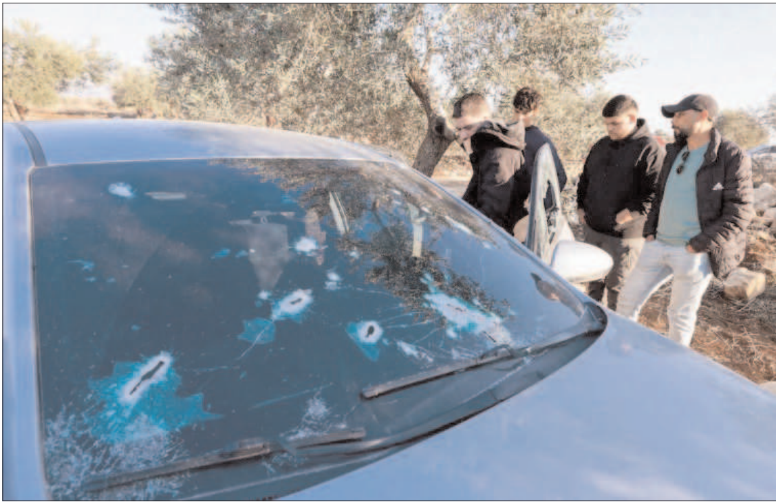
WEST BANK: Palestinians inspecting a bullet-riddled car after an Israeli operation in Jenin area.