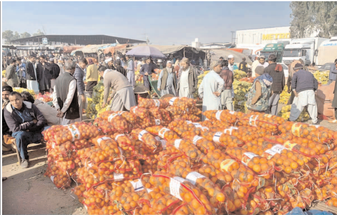
ISLAMABAD: Costermongers busy selling bundles of vitamin-packed citrus fruits as seasonal surge fills markets with fresh harvests, marking arrival of winter in Federal Capital.

The imports from China during July-October 2024-25 were recorded at $5096.881 million against the $3737.618 million during July-October 2023-24, showing an increase of 36.36 per cent.