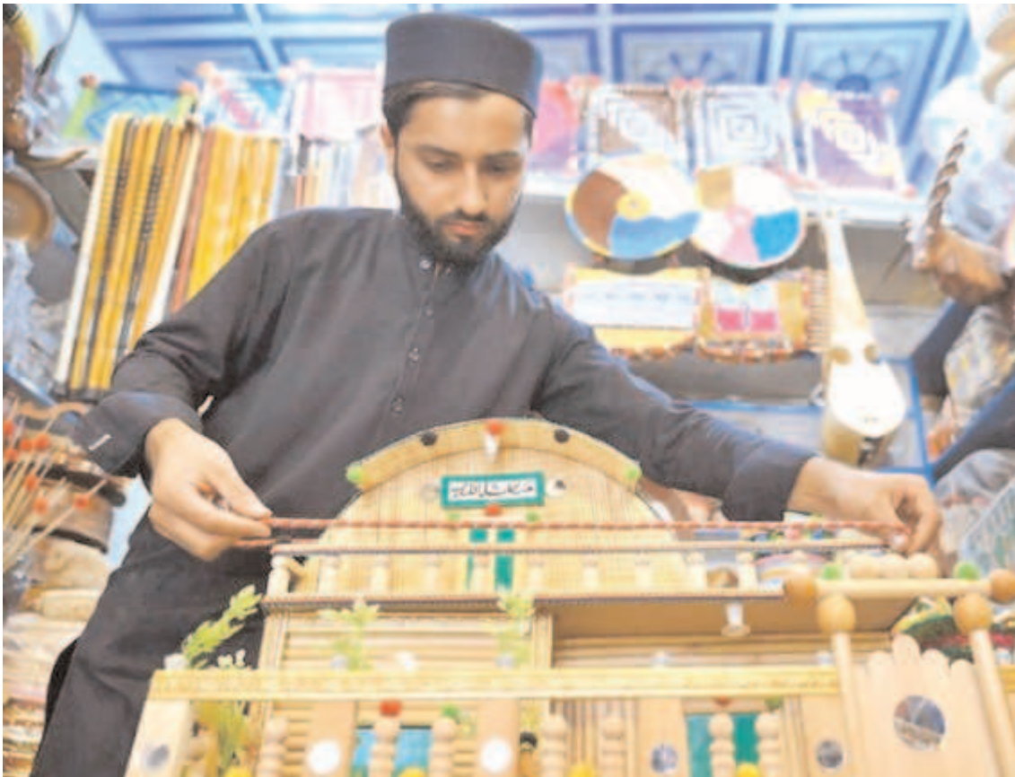
PESHAWAR: An artist giving the final touches to a handmade decorative house in his workshop at Dabgari area.