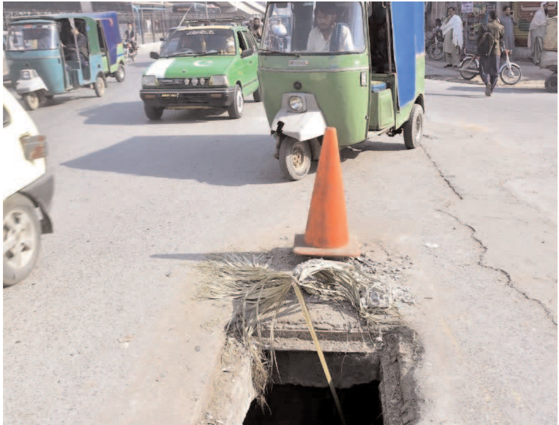
PESHAWAR: View of an open manhole in the middle of the road at Firdous Chowk which may cause any deadly incident.