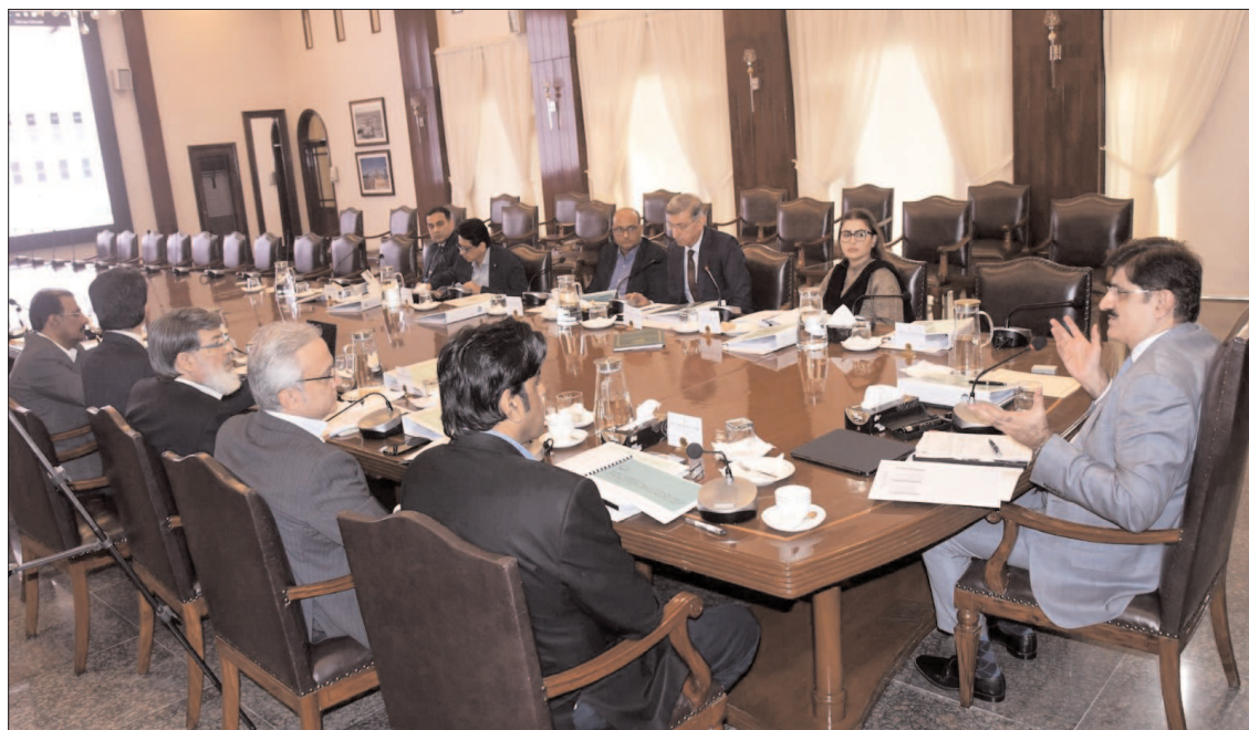
KARACHI: Sindh Chief Minister Syed Murad Ali Shah presides over the 28th meeting of the Thar Coal Energy Board at the CM House.

The CEO of SECMC reported to the meeting that Chinese lenders are willing to support the expansion of the Block-2 mine, increasing its capacity from the current 7.6 million tons per annum (mtpa) to 11.2 mtpa. He stated that a financial close is expected to be achieved by the first quarter of 2025. The expansion will be financed locally, and a term sheet has already been signed with Meezan Bank to arrange the necessary funding. The Federal Finance Minister, the Chief Minister of Sindh, and the State Bank of Pakistan have all played crucial roles in this process.