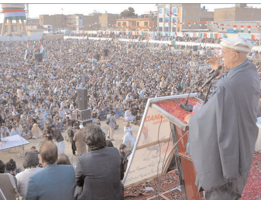
QUETTA: Chairman of PkMAP, Mahmood Khan Achakzai addressing public gathering.