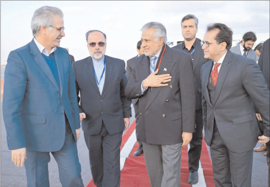
TEHRAN: Deputy Prime Minister, Ishaq Dar arrived in Mashhad, Iran to participate in the 28th meeting of Council of Ministers of the Economic Cooperation Organization.