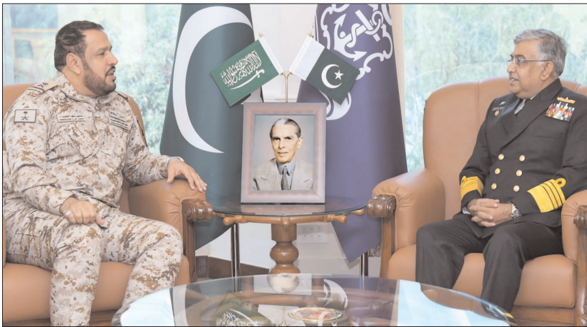
ISLAMABAD: Chief of the Naval Staff, Admiral Naveed Ashraf exchanging views with RSNF West Fleet Commander, Rear Admiral, Mansour Bin Saud Al-Juaid at Naval Headquarters.

Additionally, 1,602 vehicles without fitness certificates were penalised, and 1,023 were seized. During the month, the fitness of 8,000 vehicles was assessed, and 5,000 vehicles meeting technical standards were issued fitness certificates. During the hearing today, the court also sought report on industries operating in the Rahim Yar Khan district. According to the Parks and Horticulture Authority's (PHA) lawyer, there is a shortage of trees as per to the World Health Organization's (WHO) standards. The court remarked that the PHA said the proportion of trees in the city is much less than 71.2%. The LHC then adjourned the hearing till December 3 (today).