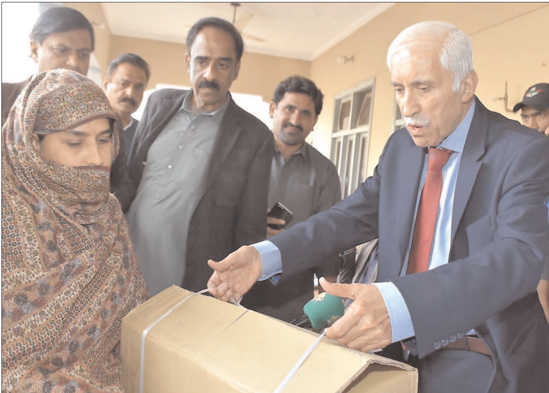
CHINIOT: Federal Minister for Maritime Affairs, Qaiser Ahmed Shaikh, distributing sewing machines among poor ladies.

FAISALABAD (APP): The police have busted over 25 criminal gangs by arresting their 60 active members in addition to 526 Proclaimed Offenders (POs) from different parts of Faisalabad during November 2024. Police spokesman said here on Monday that the police recovered stolen property worth Rs.18,232 million in addition to 123 motorcycles, 19 cattle, 14 mobile phones, 42 pistols (30-bore) and 2 guns from the possession of the criminals and registered 27 cases against them. He further said that the police arrested 477 court absconders and 526 Proclaimed Offenders (POs) including 110 POs of category-A. The police also nabbed 456 drug traffickers and recovered 225,335 kilograms (kg) charas, 5,560 kg heroin, 2,820 kg ice, 25,700 kg bhakki (poppy dust), 660 liters un-distilled wine and 6018 liters liquor from their possession. Similarly, the police arrested 289 illicit weapon holders and recovered 248 pistols, 18 guns, 8 rifles, 10 Kalashnikovs, 4 repeaters and hundreds of bullets/cartridges besides arresting 229 gamblers along with bet money during this period, he added.