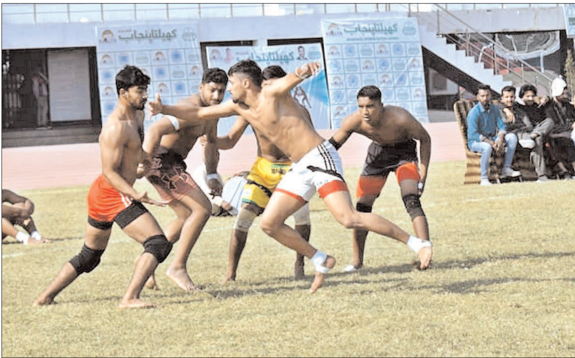
LAHORE: Sports and Youth Affairs The Punjab Games Players in action during Kabaddi match playing between Punjab teams at Nishtar Sports Complex.

Men's Rising Star: Mattia Furlani (ITA).