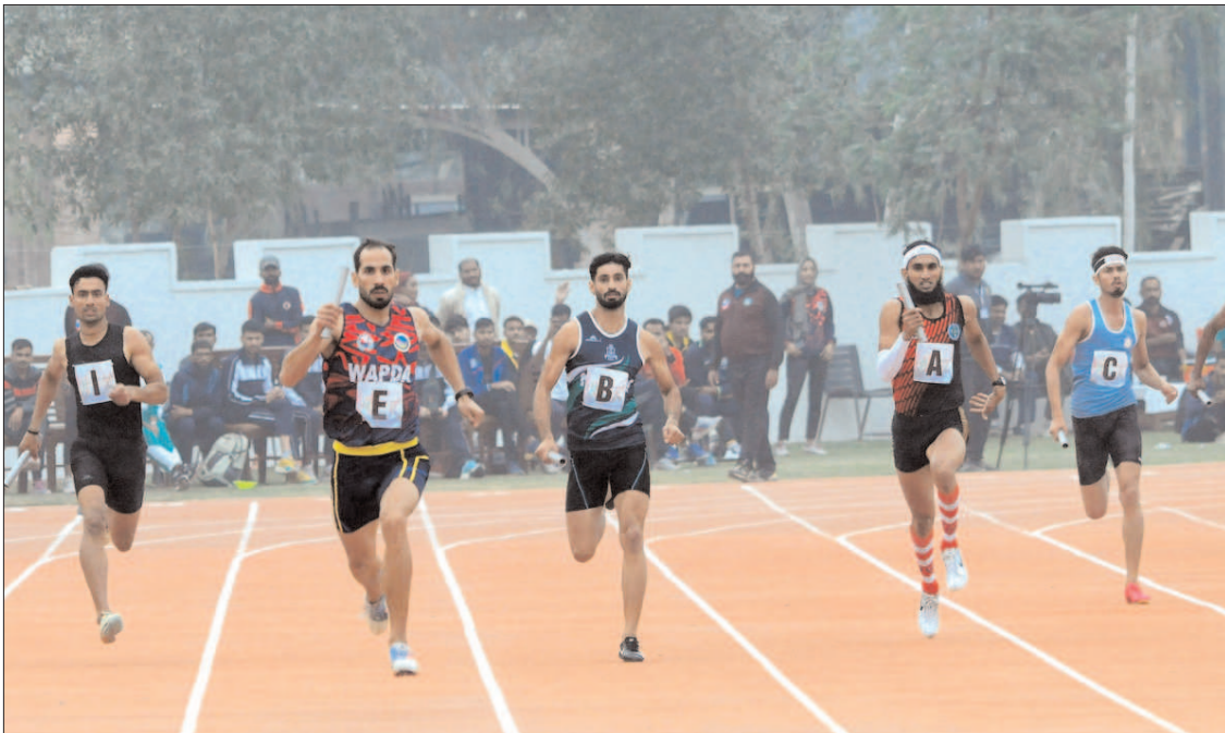
MULTAN: Men athletes participate in the thrilling 400-meter Relay race competition during the last day of the 52nd National Athletics Championship 2024 at Ayub Stadium.