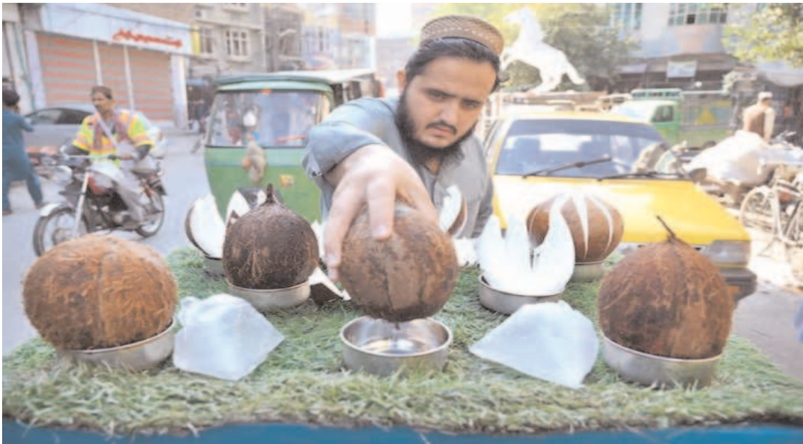
PESHAWAR: A vendor arranging fresh coconuts to catch the attention of passersby and boost sales at Namak Mandi.

Instead of supporting the province's higher education sector, the government has focused its efforts on protests, strikes, and political Dharnas, draining provincial resources.