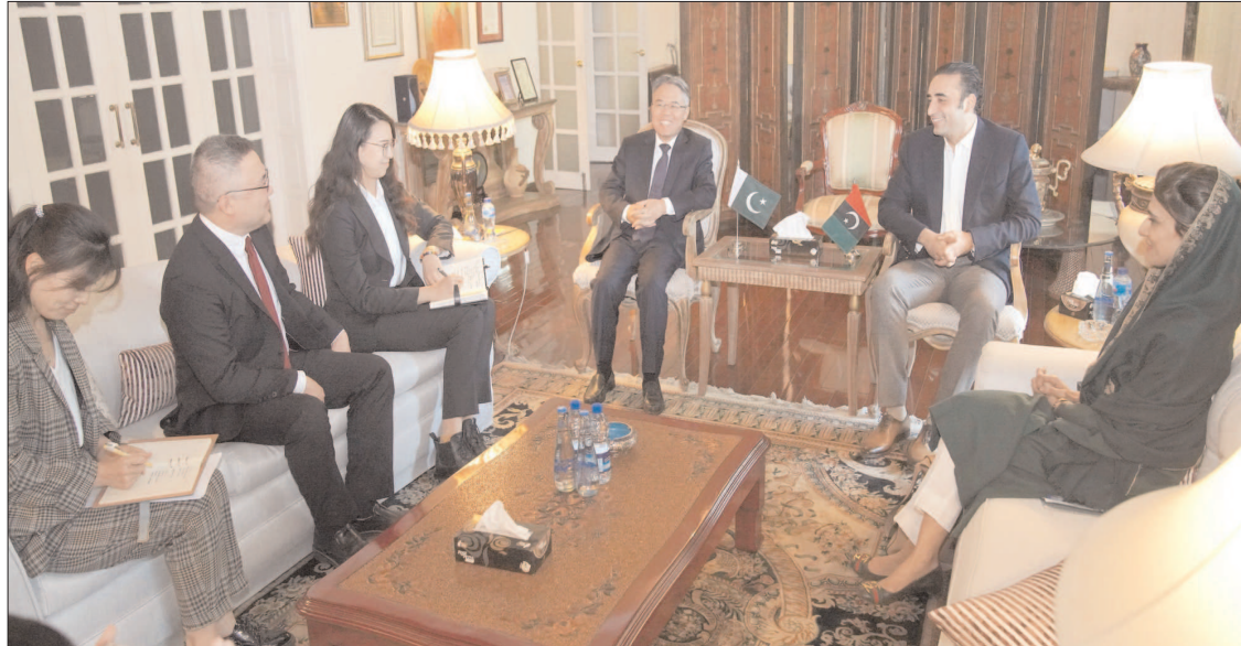
ISLAMABAD: Chinese ambassador to Pakistan, Jiang Zaidong called on Chairman Pakistan Peoples Party, Bilawal Bhutto Zardari.

He also stressed the need for private and public sectors to groom the youth for national and international competition. Concluding his address, Gandapur paid tribute to the sacrifices of the people and security forces in ensuring peace in the province.