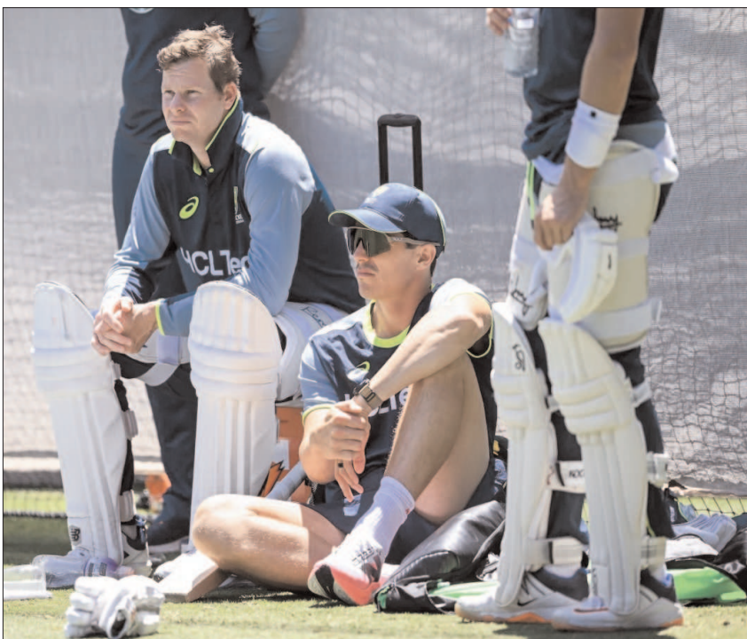
ADELAIDE: Steve Smith of Australia and Pat Cummins of Australia during an Australian Test Squad training session.