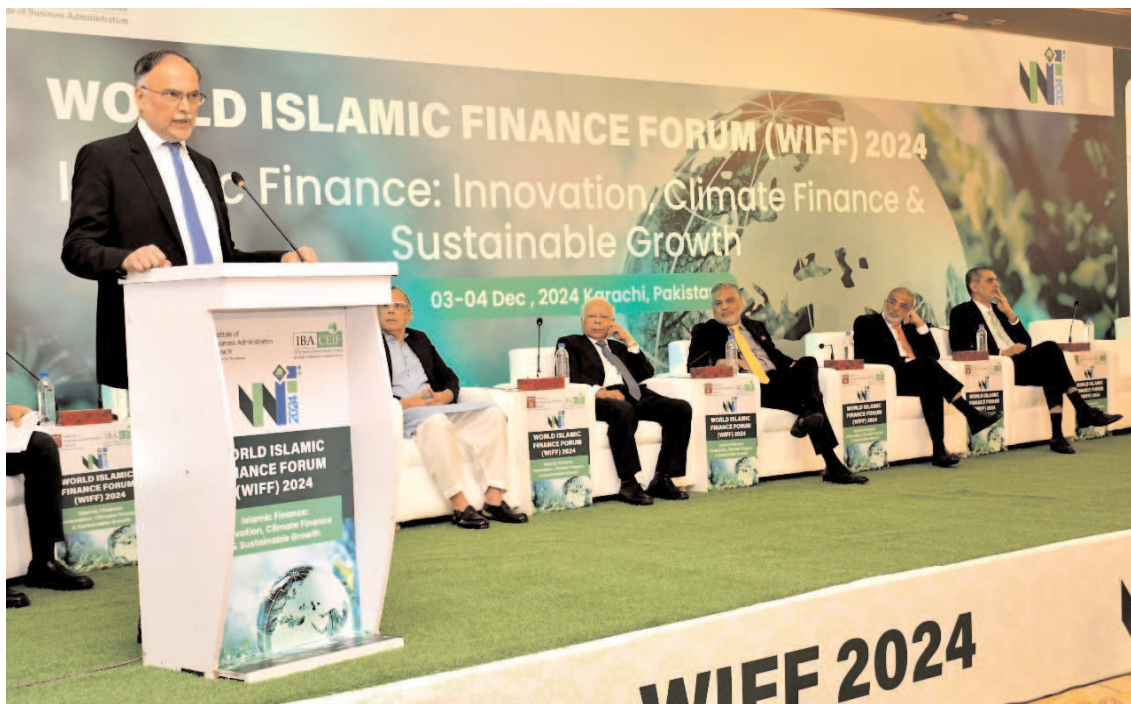
KARACHI: Federal Minister for Planning, Development and Special Initiatives Ahsan Iqbal addressing at 4th World Islamic Finance Forum.