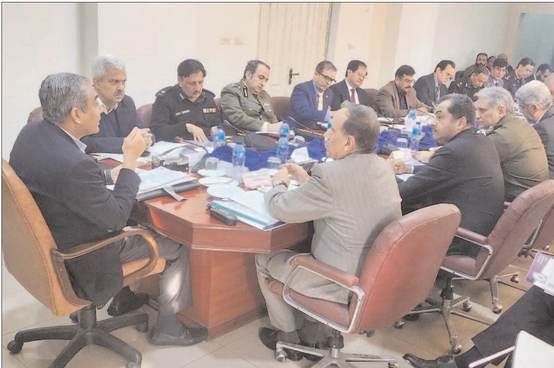
ISLAMABAD: Interior Minister Mohsin Naqvi chairing National Action Plan's Coordination Committee meeting.