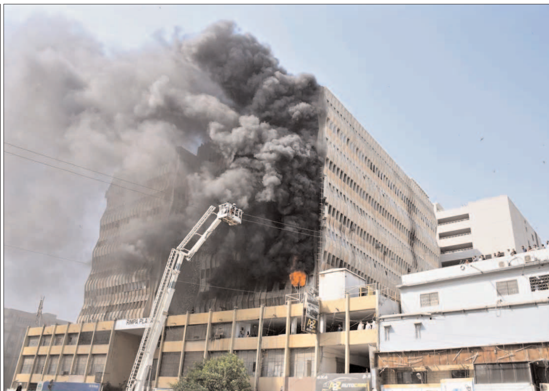
KARACHI: Smoke rises as fire fighters struggle to control a fire which broke out in a multi-story Rimpia Plaza building at MA Jinnah Road.

The provincial cabinet approved interest-free loan project for the establishment of vehicle inspection and certification station. It decided to restart Horse and Cattle Show in Punjab, and approved Rs 1.5 billion for the purpose. It also allowed Punjab Police to train 210 Iraqi police officers and officials. The cabinet approved to provide latest machinery to improve performance of local bodies across Punjab. It also approved to amend Local Government Act and Punjab Local Government Works Rules, besides granting approval to build 3 three-storey towers for government employees in Chaubarji Garden. The chief minister sought a loan plan for allocating plots and houses to government employees, besides approving Foundational Learning Policy Punjab 2024.