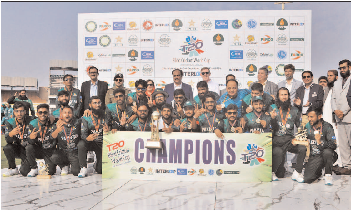
MULTAN: Pakistan Blind Cricket Team poses for a group photo with a trophy after their victory against the Bangladesh team during the 4th Blind T20 cricket World Cup 2024 played at Multan Cricket Stadium.