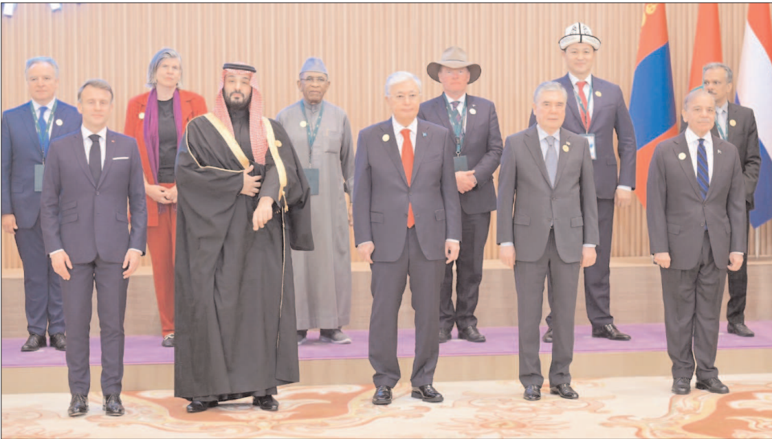
RIYADH: Prime Minister Shehbaz Sharif in family photo of One-Water Summit in Saudi Arabia.

RAWALPINDI: Chief of the Army Staff, General Syed Asim Munir, NI (M), visited troops participating in a field training exercise near Narowal and Sialkot. He was given a comprehensive brief on the objectives and conduct of the exercise, which aimed to refine professional skills and battlefield procedures essential for addressing emerging operational challenges.