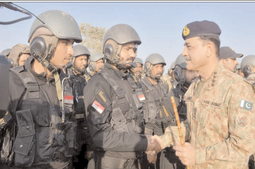
RAWALPINDI: Chief of the Army Staff, General Syed Asim Munir interacting with troops during his visit to field training exercise near Narowal and Sialkot.

He also pointed out four Rangers personnel and a police officer were martyred, but no one from the PTI expressed sympathy with the bereaved families. The PTI miscreants target security forces and police personnel but later claim of make hue and cry of killing of their party workers.