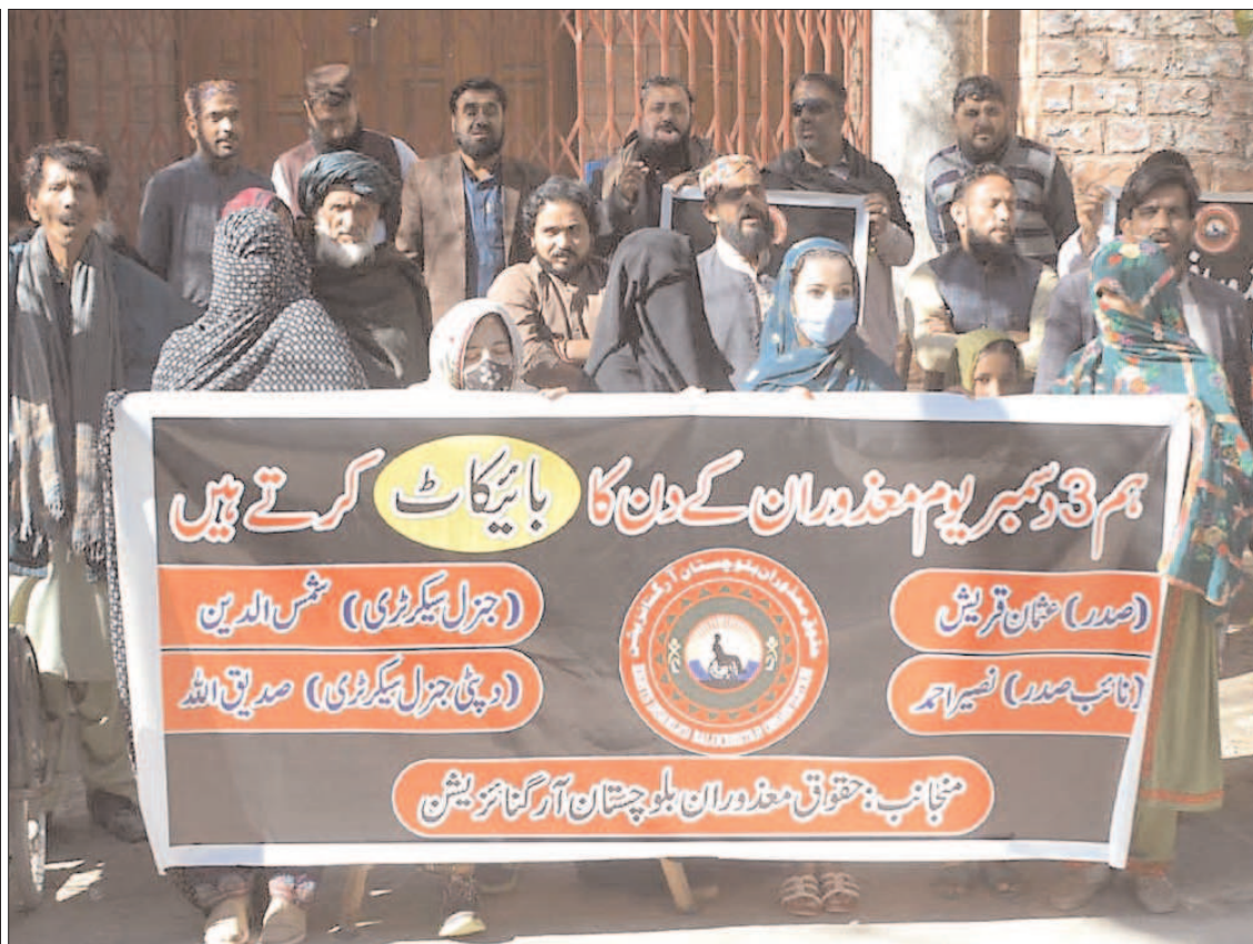
QUETTA: Activists of Haqooq-e-Mazaroon Balochistan holding a banner to mark International Day of Persons with Disabilities.

Besides, special programs on Corruption have also been organized in universities, colleges and schools. The Social Welfare Department has also organized a grand walk on Friday at the District Headquarters Hospital Road in which special persons will also participate.