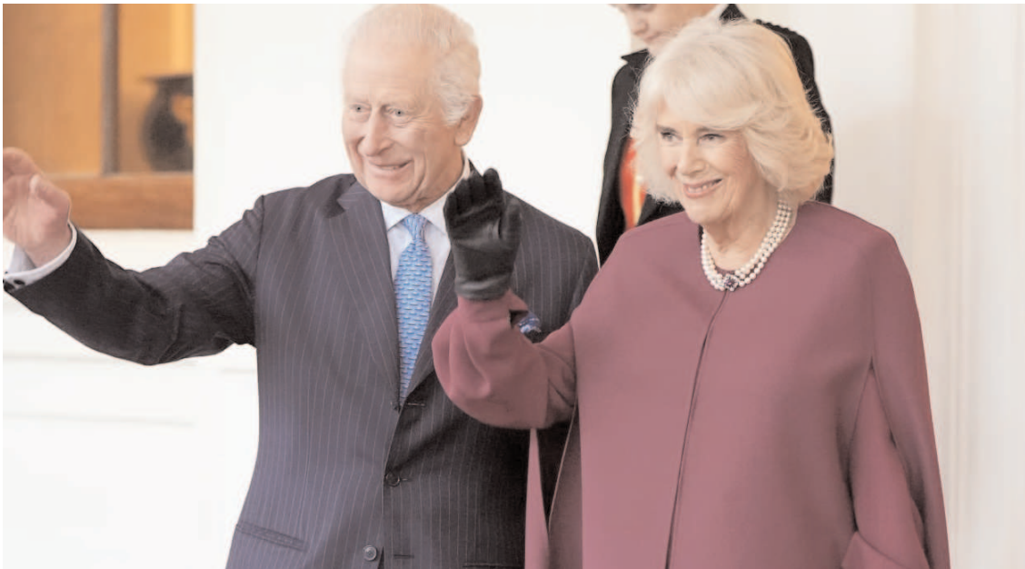
LONDON: King Charles III and Queen Camilla formally bid farewell to the Emir of Qatar Sheikh Tamim bin Hamad Al Thani and his wife Sheikha Jawaher as they leave Buckingham Palace.