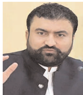
in the meeting.