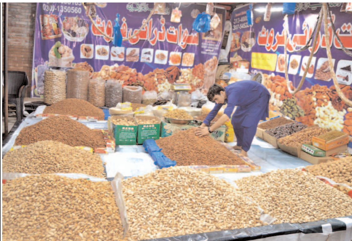
LAHORE: A vendor arranging and displaying dry fruits in his shop at Davies Road.

The price of gold in the international market remained stagnant at $2,640, the Association reported.