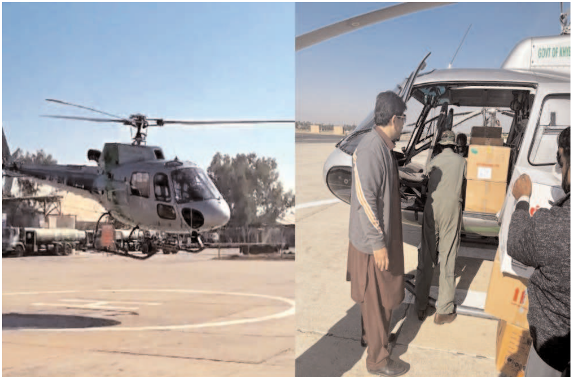
PESHAWAR: Medicines are being despatched for Kurram on the special directives of Khyber Pakhtunkhwa Chief Minister Ali Ameen Khan Gandapur.