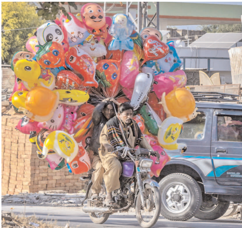
ISLAMABAD: A street vendor on the way on his motorcycle with different kinds of balloons at Tamari Chowk.

The International Ombudsman Summit at Hong Kong, it may be added, is being attended by over 140 Overseas participants, representatives of the UN bodies including a large number of the member institutions of the Asian Ombudsman Association (AOA).