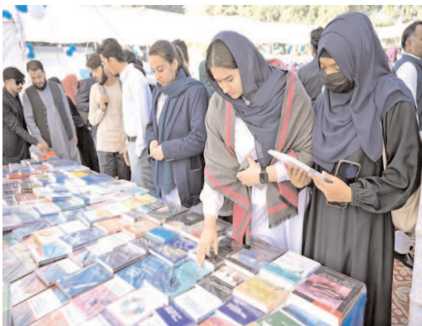
SARGODHA: Students keenly viewing books on stall during Book Fair at University of Sargodha.

The DHO said 290 teams had been formed to immunise anti-polio drops in the district. The deputy commissioner directed to utilize all available resources to make the campaign successful.