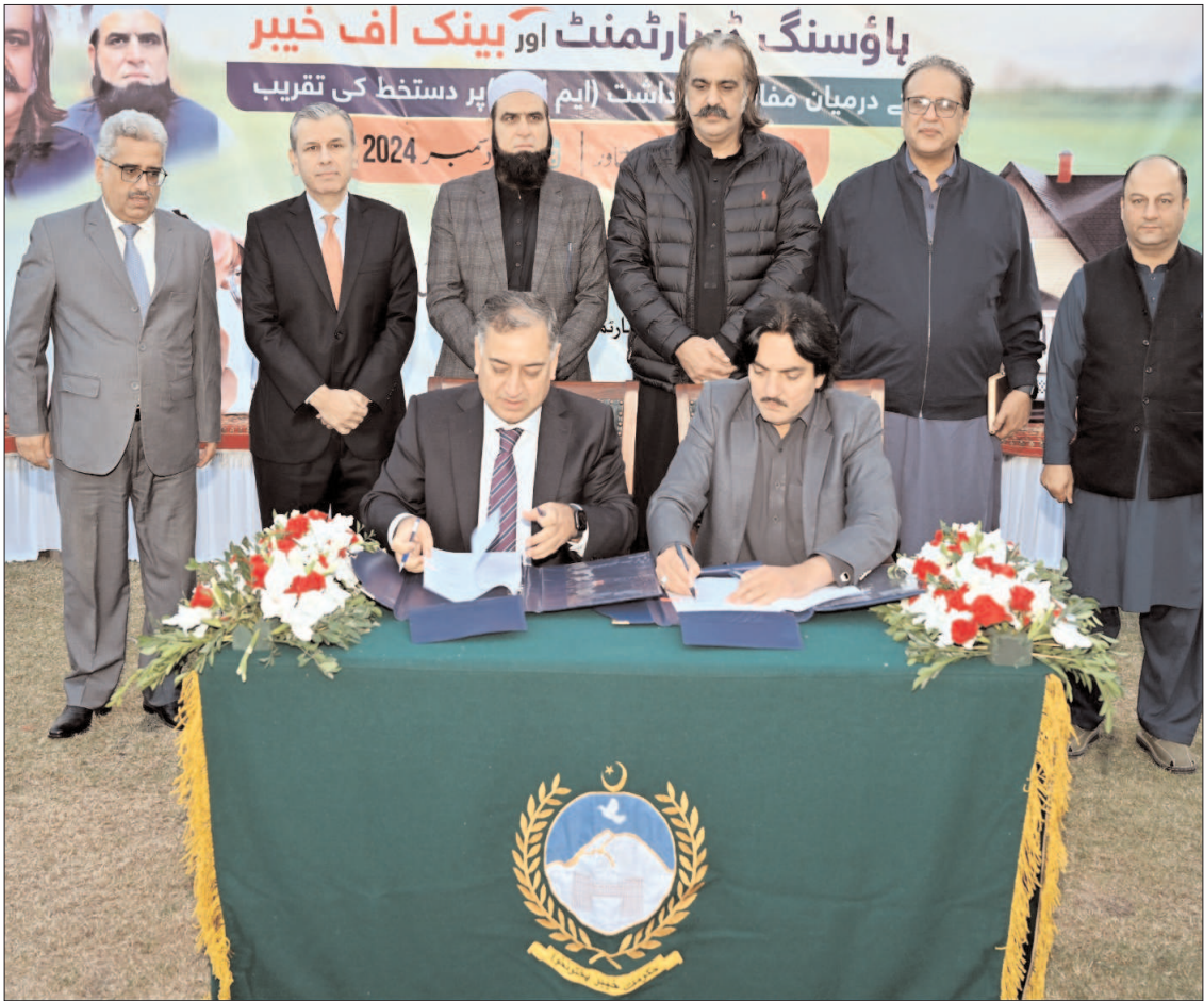
PESHAWAR: Khyber Pakhtunkhwa Chief Minister Ali Ameen Khan Gandapur witnessing the MoU signing ceremony between KP government and Bank of Khyber for implementation of Ehsas Apna Ghar Scheme.

President, PM grieved ISLAMABAD (APP): President Asif Ali Zardari and Prime Minister Shehbaz Sharif on Wednesday expressed their deep grief over the death of former Chief of Naval Staff Admiral Yasturul Haq. In their separately issued statements, the president and prime minister expressed their condolences over the passing of former Naval chief. They lauded the late Yasturul Haq's unforgettable services for the defence and security of the country.