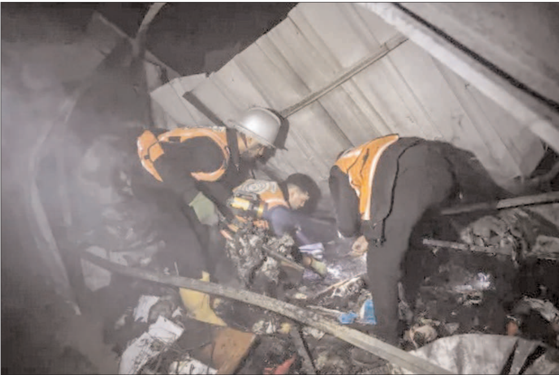
GAZA: Rescuers sift through charred debris after an Israeli strike hit a makeshift camp for displaced Palestinians, in al-Mawasi, Khan Younis.