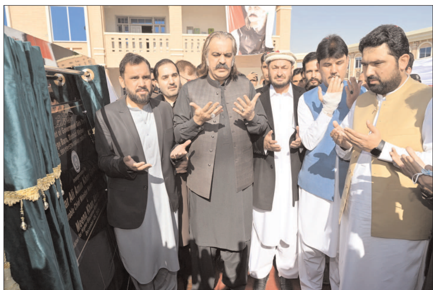
BARA: Chief Minister of Khyber Pakhtunkhwa, Ali Amin Gandapur inaugurating Government Girls Degree College.

He added that although the petitions against the amendment were scheduled for a full court hearing on October 31, 2024, the hearing has yet to be arranged, and no response has been received from the Registrar's office regarding the matter. The senior-most judge urged the Chief Justice to postpone the upcoming meeting of the Judicial Commission until a final ruling is made on the constitutional issues surrounding the 26th Amendment, underlining the importance of resolving these matters before proceeding with judicial appointments.