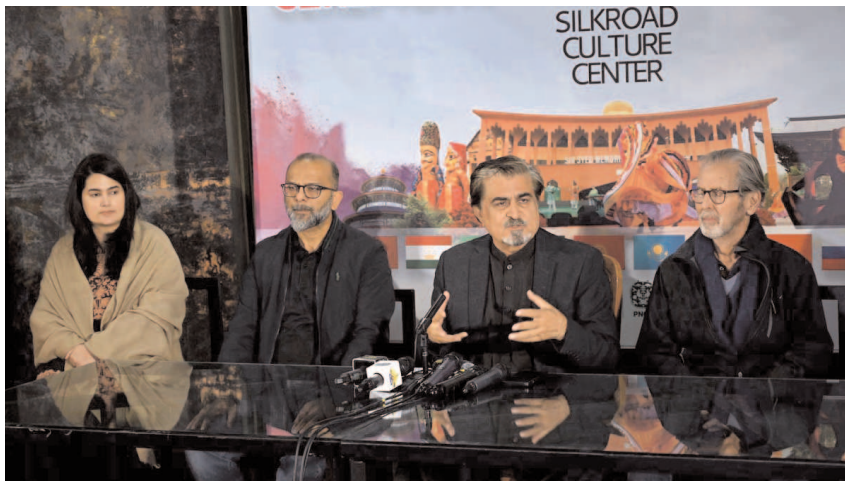
ISLAMABAD: Former Federal Minister of National Heritage Jamal Shah addressing a press conference to brief about Grand Launch of Silk Road Culture Centre Pakistan.

He urged the international community to take urgent measures to prevent Israel from further undermining regional peace and stability, including the prevention of Israeli aggression against Lebanon and other regional countries.