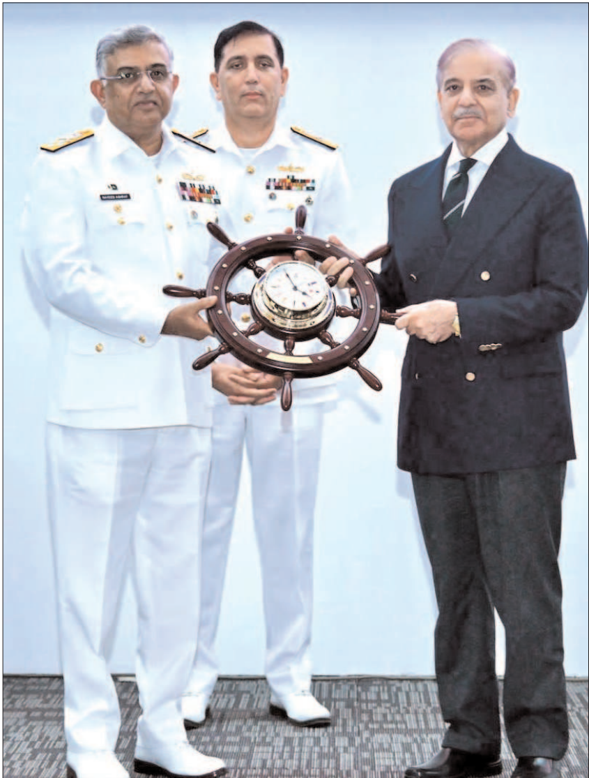
LAHORE: Prime Minister Shehbaz Sharif receiving a souvenir from Chief of Naval Staff, Admiral Naveed Ashraf at closing ceremony of 7th Maritime Security Workshop in Pakistan Navy War College.

Vol. XXXIXI No. 314 Regd. No. 241 JAMADI US SANNI 04 1446 --SATURDAY, DECEMBER 07 2024 PESHAWAR EDITION 12 PAGES PRICE. 30