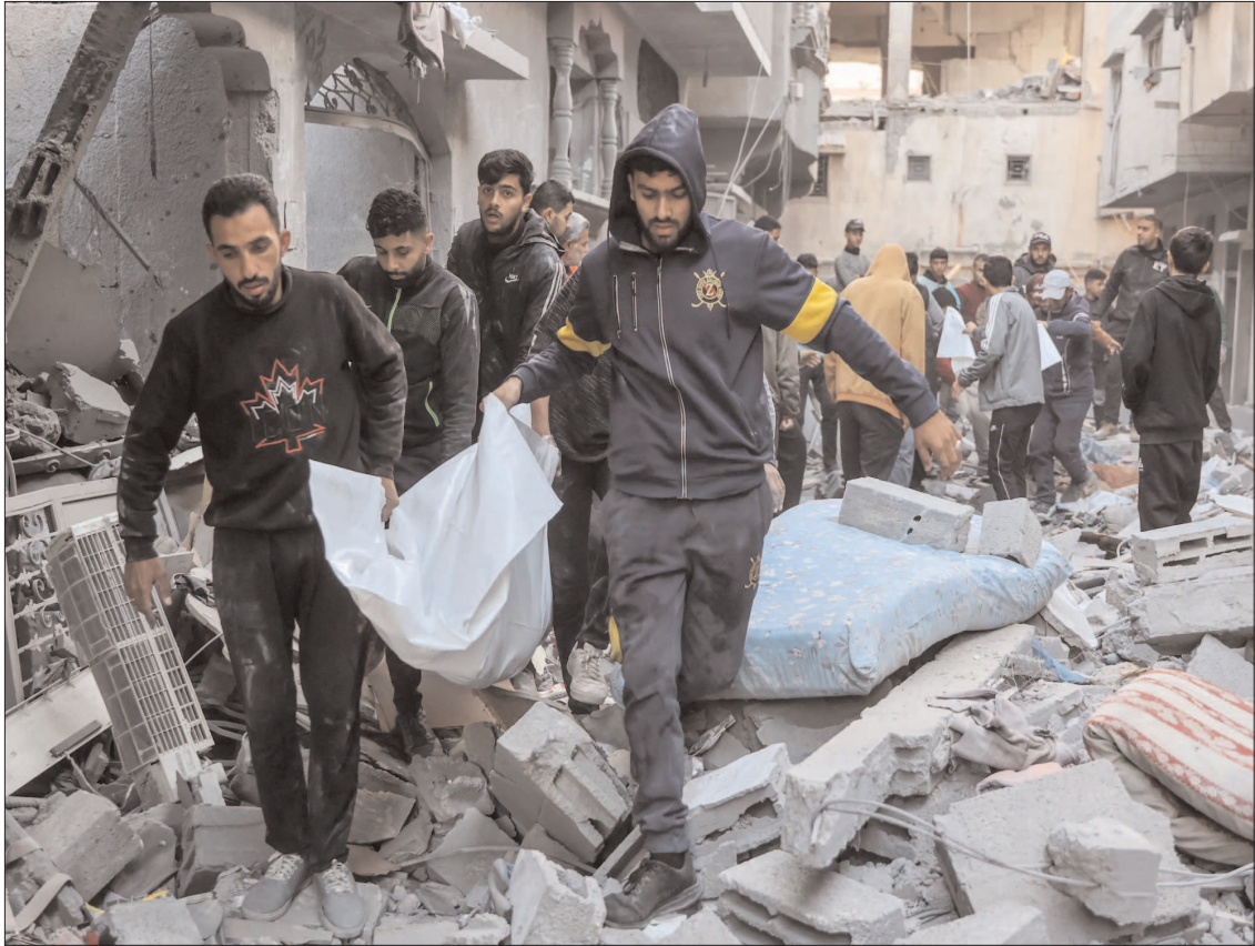
GAZA STRIP: Palestinian men carrying body of a victim of an Israeli strike in Daraj neighbourhood.