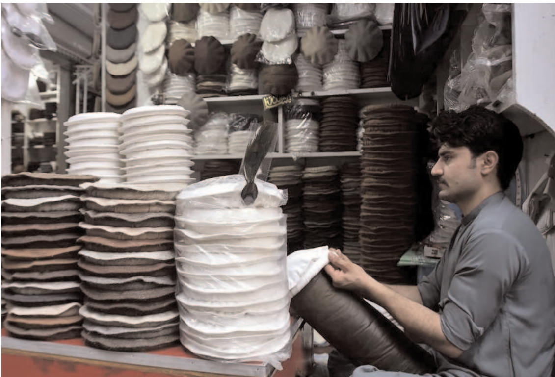
PESHAWAR: A man busy in preparing traditional Chitrali cap at his workplace.