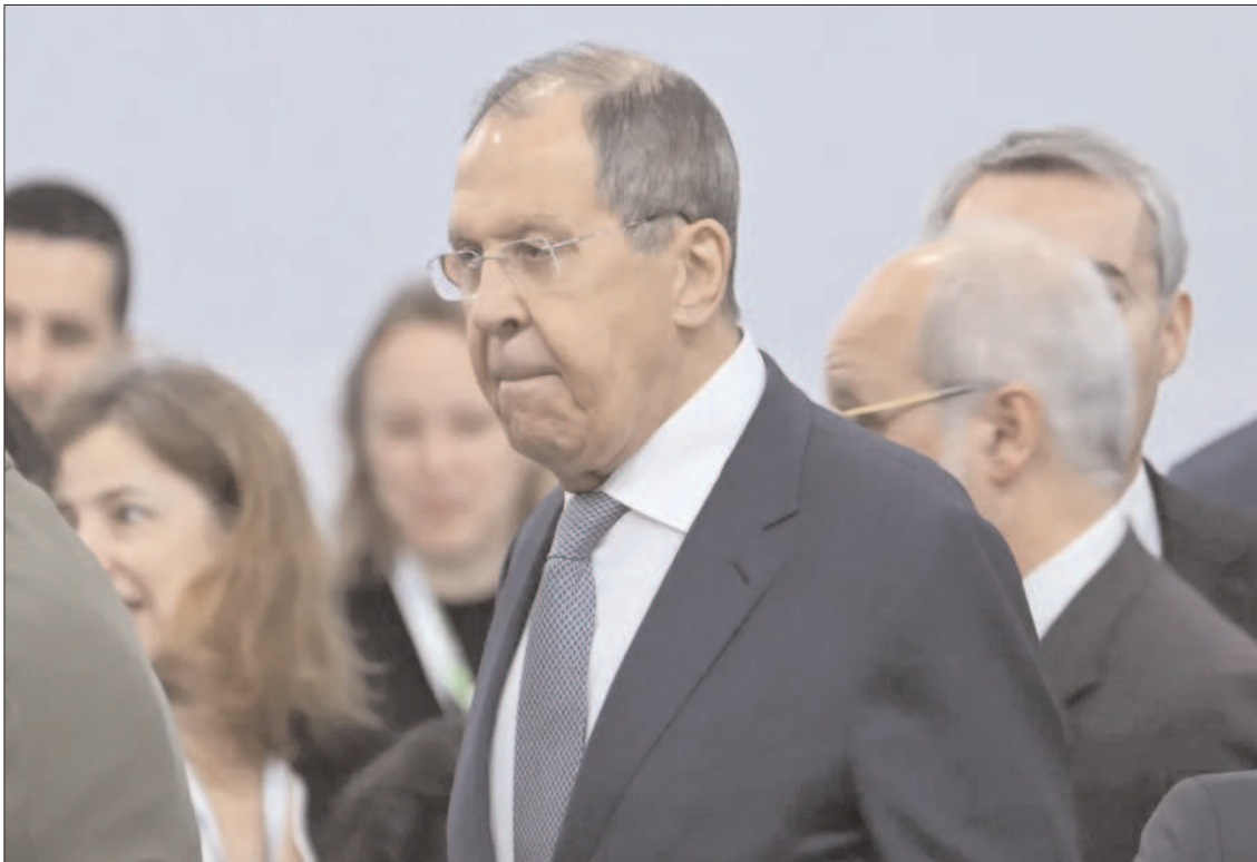
VALLETTA : Russia's Foreign Minister Sergey Lavrov arriving to attend a plenary session of the 31st Organization for Security and Cooperation in Europe (OSCE) Ministerial summit, in Malta.