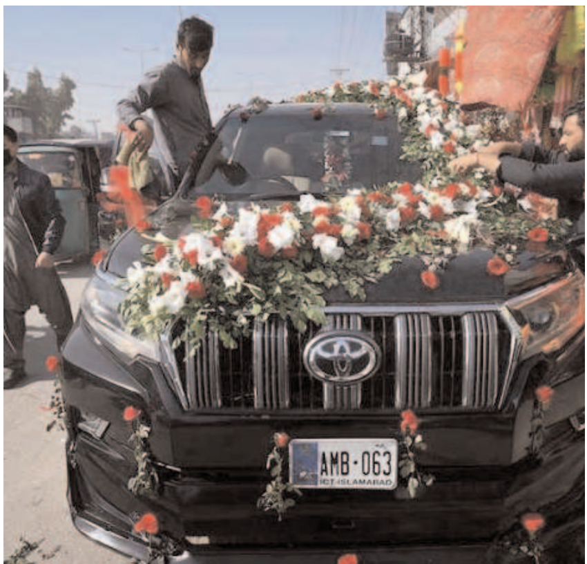
PESHAWAR: Vendors decorate a wedding vehicle with colorful flowers at Tehkal Mor.

F.P. Report PESHAWAR: The Sports Olympiad 2024, hosted by Peshawar Model Hayatabad Boys Campus, wrapped up, with Hayatabad Thunder claiming the championship title. Over the course of nine days, 28 teams from 14 campuses competed in eight different sports. The Olympiad aimed to cultivate healthy competition, support mental growth, and encourage teamwork and friendship among young athletes. It provided participants with an opportunity to showcase their talents, improve their skills, and learn valuable lessons about sportsmanship and collaboration. Hayatabad Thunder's participation in the Olympiad was a resounding success, as they successfully defended their title. The team's outstanding performance reflected their hard work, dedication, and pursuit of excellence. The Sports Olympiad 2024 was hailed as a success, meeting its goals and providing a meaningful experience for everyone involved. The event set a high benchmark for future competitions, and organizers are eager to witness the rise of new talent and champions in the coming years.