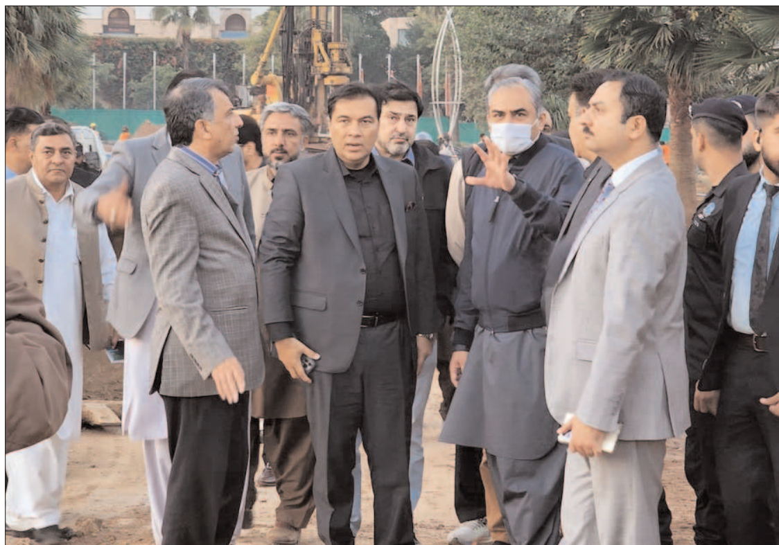
ISLAMABAD: Federal Minister for Interior Mohsin Naqvi visiting Serena Chowk Interchange Project.

Chairman CDA, Deputy Commissioner Islamabad and other senior officers were also present on the occasion.