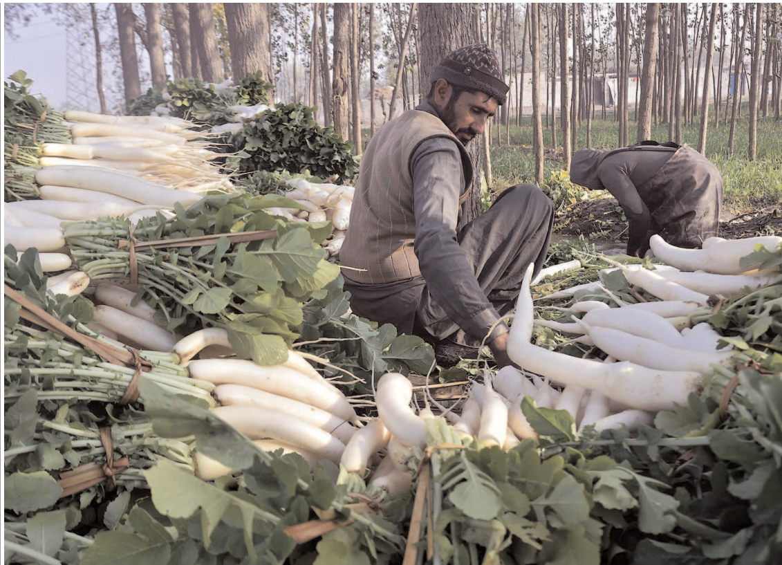
PESHAWAR: Farmer sorting radish after harvesting for selling purpose in a local market.

the development of the areas and addressing its concerns. Governor lauds successful forces operation against militants: Governor Faisal Karim Kundi on Saturday lauded major security operation in different areas of the province in which 22 militants were killed. Governor Faisal Karim Kundi, extended his heartfelt praise to the security forces for their bravery and successful efforts in eliminating the militants. He commended the forces for their unwavering commitment to maintaining peace and stability in the province. The Governor also paid tribute to the six security personnel who laid down their lives during the operation, expressing deep admiration for their courage and sacrifice. He prayed for the elevation of their ranks in the hereafter and for patience and strength for their grieving families.