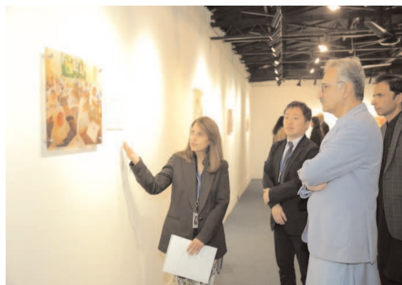
The exhibition will remain open to the public until 8th of December 2024 from 10 am to 4 pm at white gallery in Lok Virsa, Islamabad, allowing visi-

Face recognition cameras have been installed at the entry and exit points of the city which are playing an important role in identifying suspicious elements.