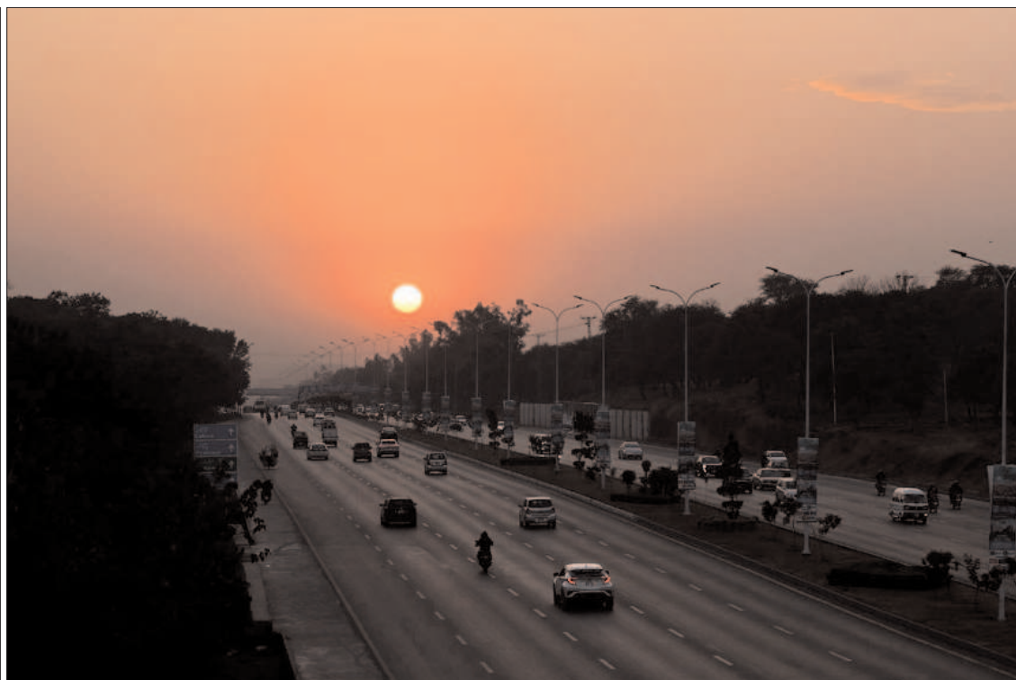
ISLAMABAD: An eye catching view of sunset in the federal capital.