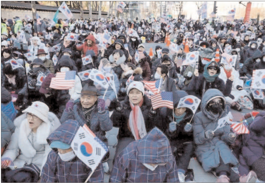
SEOUL: Protesters from conservative groups attend a rally supporting South Korean President Yoon Suk Yeol.

"I think it's the first time in the history of the world when a state is organising an action against a candidate to stop him from running," he said in a TV interview. He also denied knowing any of the influencers or funders mentioned in the reports. The documents released in this highly unusual move were all papers drawn up for a meeting of the security council following the first round of the presidential election. They also reveal that access data for electoral websites was stolen from legitimate users and published online "on cyber-crime platforms originating from Russia".