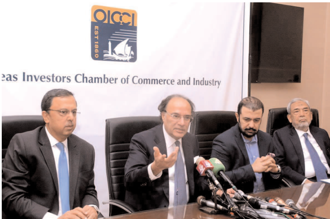
KARACHI: Federal Minister for Finance and Revenue Muhammad Aurangzeb talking to media after meeting Overseas Investors Chamber of Commerce and Industries.