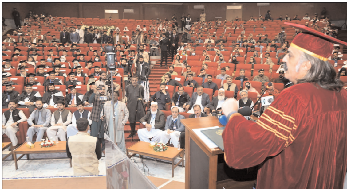
D I KHAN: Chief Minister of Khyber Pakhtunkhwa, Ali Amin Gandapur addressing during convocation of Gomal Medical College.

The election commissioner underscored that voting is more than a right it is a civic duty. He explained that by casting their votes, citizens hold leaders accountable for their actions and decisions. He said that participation in elections promotes good governance and allows the public to challenge policies or practices that go against the public interest.