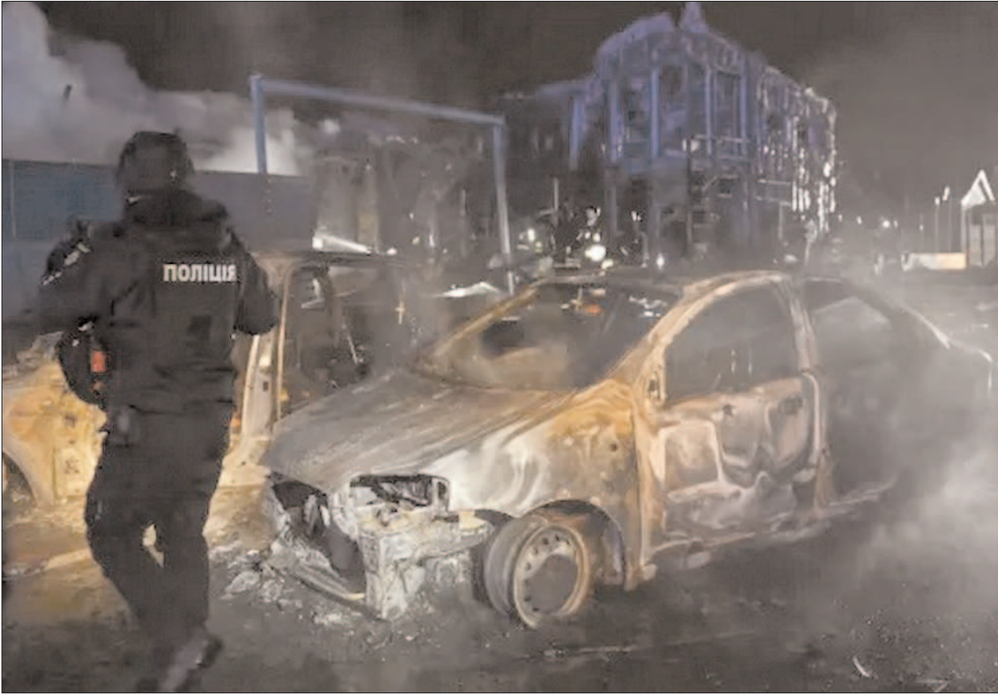
KYIV: A police officer inspecting destroyed cars at the site of the Russian attack in Zaporizhzhia, Ukraine.

Engr Amir Muqam made it clear that Afghan refugees have to return to their country. However, he said that voluntary and dignified repatriation of the Afghan refugees is being encouraged.