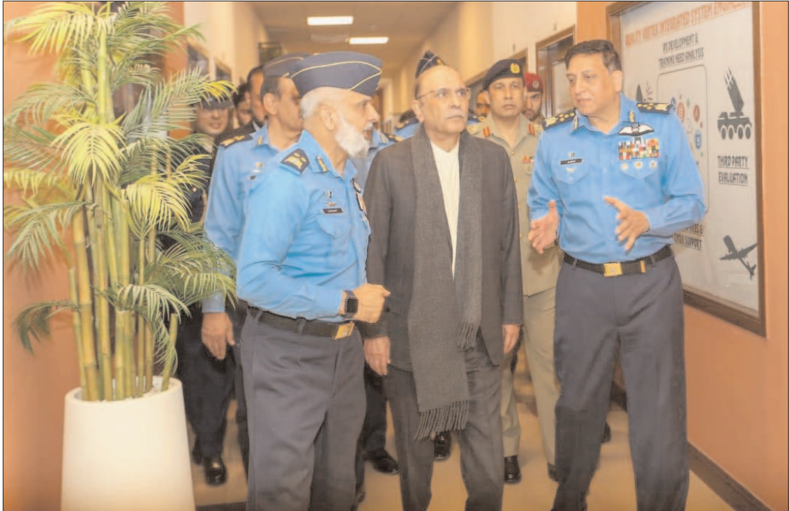
RAWALPINDI: President Asif Ali Zardari being briefed about National Aerospace Science and Technology Park.