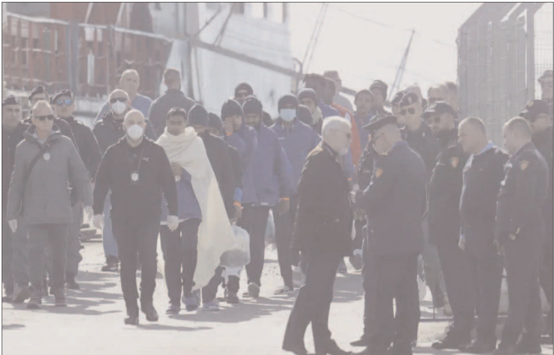
MILAN: Migrants following the authorities after their arrival, as Italy sent 49 people to Albania for processing following earlier court rejections to Albania, in Shengjin.