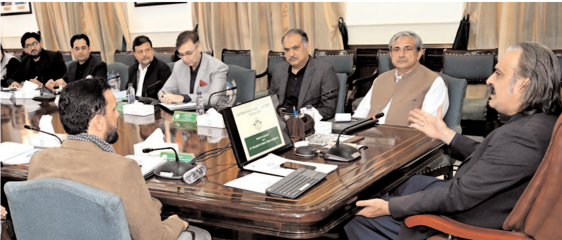
PESHAWAR: Chief Minister Khyber Pakhtunkhwa Ali Amin Khan Gandapur presiding over 41st Board of Director Meeting of Khyber Pakhtunkhwa Education Foundation.