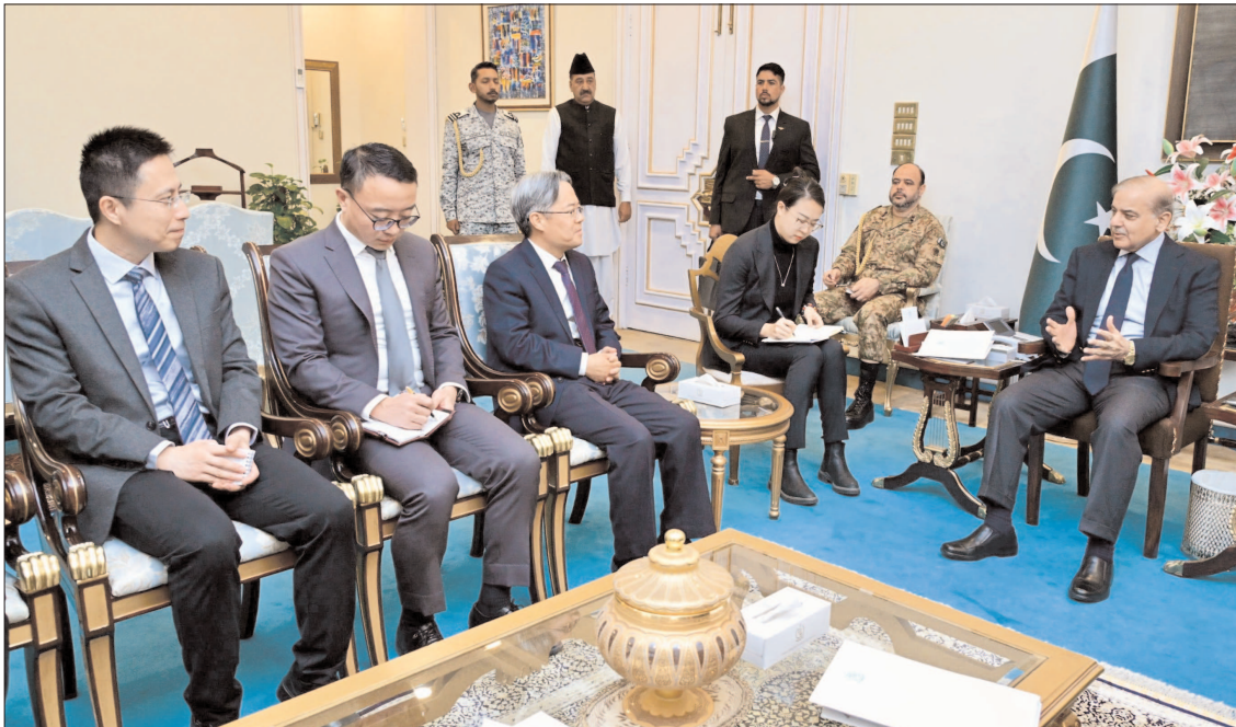
ISLAMABAD: Chinese Ambassador to Pakistan, Jiang Zaidong called on Prime Minister Shehbaz Sharif.