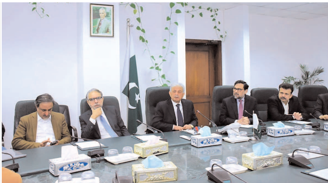
ISLAMABAD: Federal Minister for Industries and Production Rana Tanveer Hussain chairing meeting on sugar prices.

The price of gold in the international market increased from $2,778 to $2,792, the Association reported.