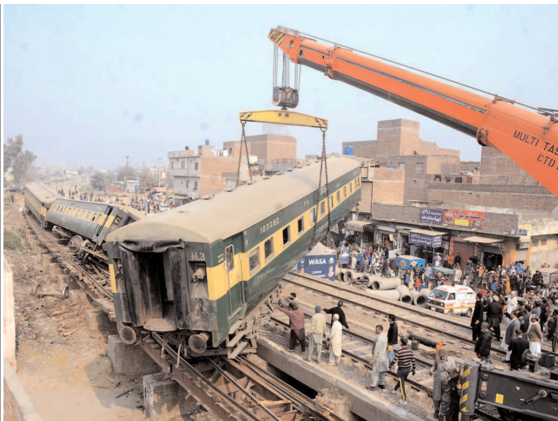
LAHORE: Crane being used to remove derailed coaches of Shalimar Express, which was traveling from Lahore to Karachi, near Shahdara Railway Station.

Subsequently, the court adjourned the hearing until February 7, directing the relevant authorities to submit reports on all discussed matters at the next session.