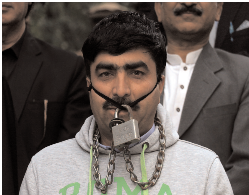
ISLAMABAD: Journalists hold protest against PECA act outside NPC.

All eyes are now on the Supreme Court, which is set to hear the case on February 6. Education experts and faculty members hope that the court's decision will ensure a transparent and non-political appointment process for vice chancellors in KP universities.