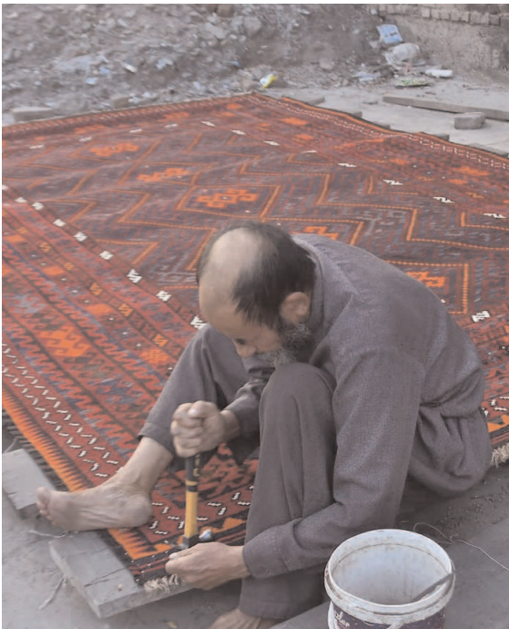
PESHAWAR: A worker giving final touches to a carpet at his workplace in Khyber Bazaar