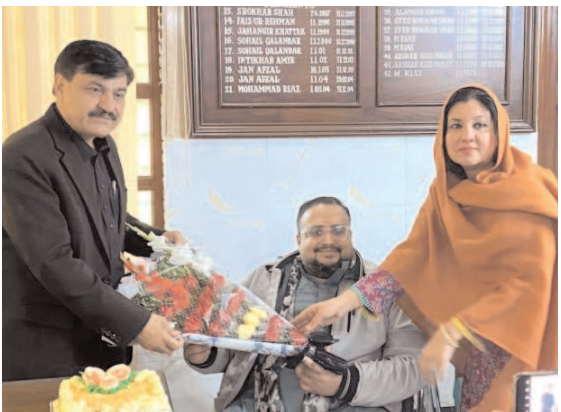
EOC media team.