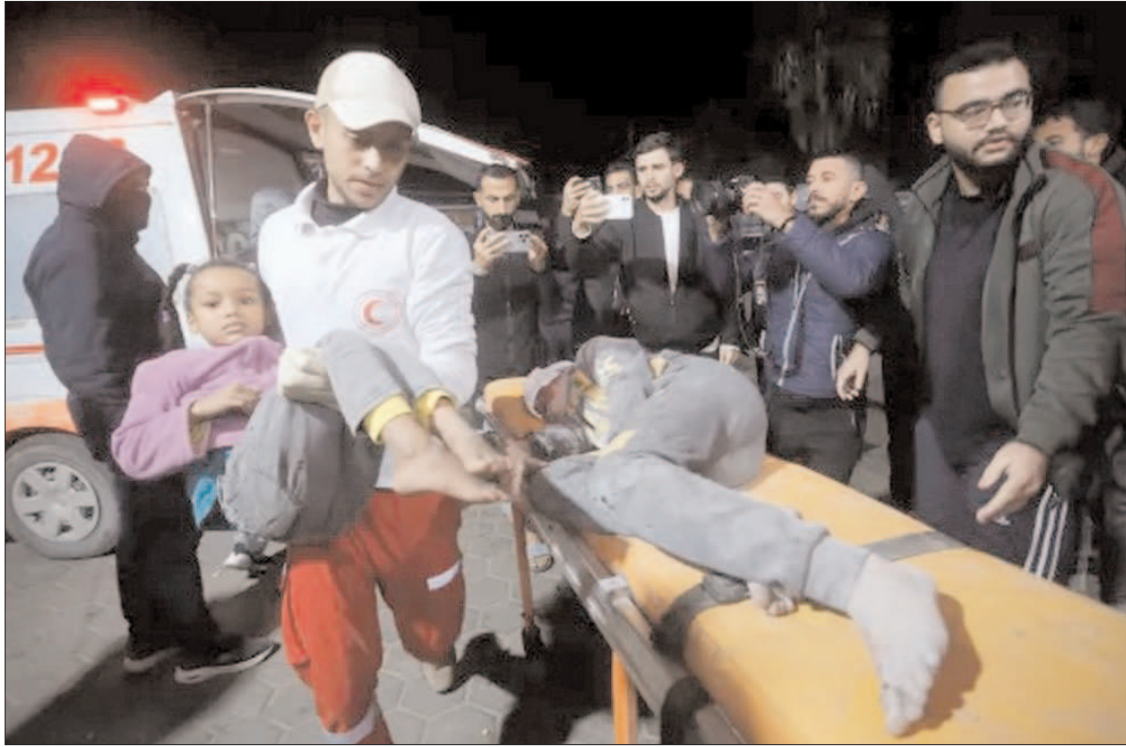
GAZA: Injured Palestinians, including children, are brought to Al-Aqsa Martyrs Hospital for medical treatment after Israel attacked a residential building in Deir el-Balah.

He also mentioned major reforms introduced in the Sehat Card program, which have significantly expanded free treatment coverage. These reforms and better monitoring have enabled the provincial government to save one billion rupees monthly. Steps are being taken to bring all public hospitals on Sehat Card panel, ensure free emergency medicines, and include liver and kidney transplants in the Sehat Card scheme. Additionally, at least two cardiac satellite centers would be established in every region of the province.