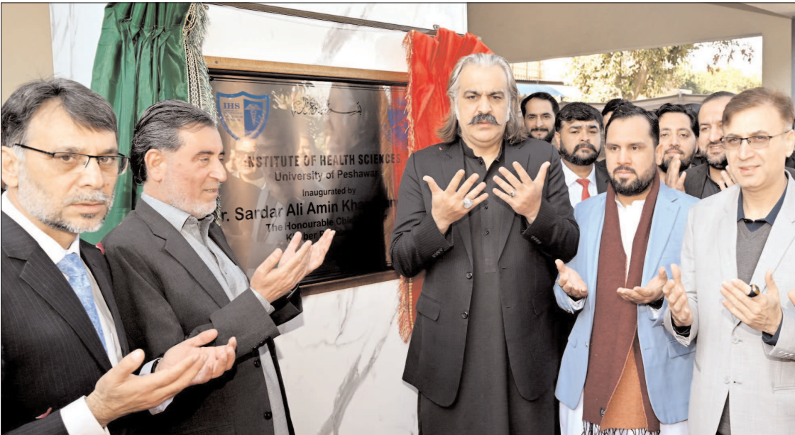
PESHAWAR: Chief Minister of Khyber Pakhtunkhwa, Ali Amin Gandapur offering dua after inaugurating newly established institute of health sciences at University of Peshawar.

The bench observed that decisions regarding trials must be evidence-based and legally sound. It stressed the importance of a clear legal framework to ensure transparency and fairness in the judicial process. Later the bench adjourned hearing of the intra-court appeal against military court trials of civilians until tomorrow (Friday) where Khawaja Haris may resume arguments.