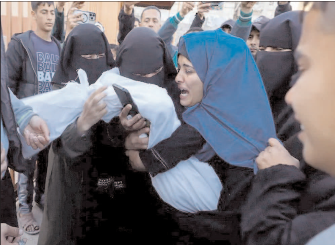
GAZA STRIP: Mourners reacting as they carry the body of a Palestinian child killed in an Israeli strike in Khan Younis.

In September 2023, Azerbaijan retook Karabakh, prompting almost all of the territory's 100,000 Armenians to leave en masse to Armenia. Both sides have since said they want to sign a treaty to end the conflict. But in an interview with Azerbaijani television channels, Aliyev said: "Armenia is effectively a source of threat to the region. The independent Armenian state is essentially a fascist state. For nearly 30 years, this country was governed by bearers of fascist ideology, and they shaped the state in their own image. "Therefore, fascism must be eradicated," he added. "It will either be eradicated by Armenia's leadership or by us. There is no other way." In comments to Armenian state news agency Armenpress, Armenian Prime Minister Nikol Pashinyan said that Yerevan remained intent on peaceful negotiations. "Perhaps Baku is attempting to form 'legitimacy' for escalation in the region," Armenpress cited Pashinyan as saying. Peace talks between the two sides have been fitful and progress has been slow. They have no formal diplomatic ties and their 1,000 km (620 miles) border remains closed and heavily militarised. Azerbaijan has said that Armenia must change its constitution to remove what Baku says are claims to its territory before a treaty can be signed. Armenia says it makes no claim on Azerbaijani lands.