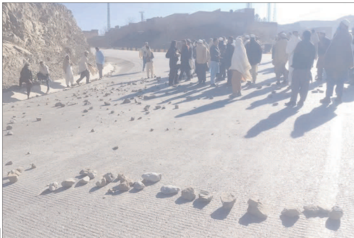
LANDI KOTAL: Workers of Tanzeem-e-Naujawan Qabail block Pak-Afghan highway in protest against arrest of their colleague by police.

These initiatives focused on pre-marital counseling, child marriage awareness, marital counseling for harmony, and promoting birth spacing methods for healthier families.