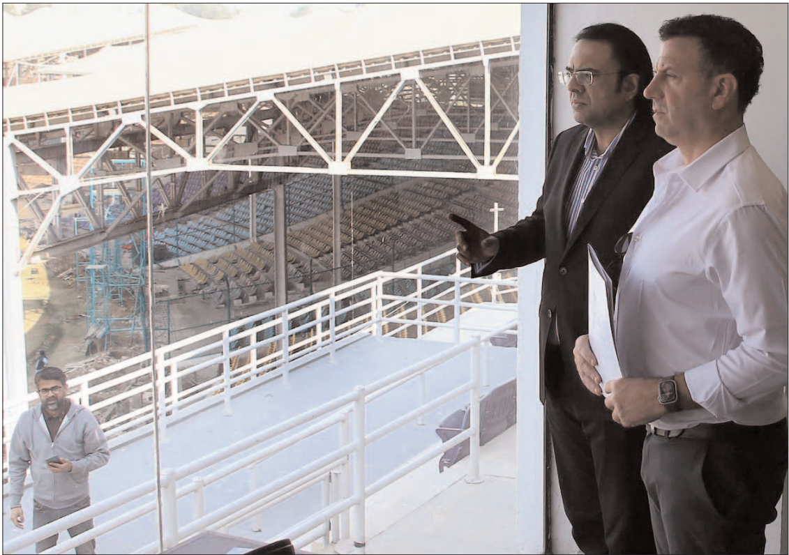
KARACHI: Members from the International Cricket Council (ICC) visited the National Bank Stadium on Thursday to assess the ongoing preparations for the upcoming Champions Trophy 2025 in Pakistan.