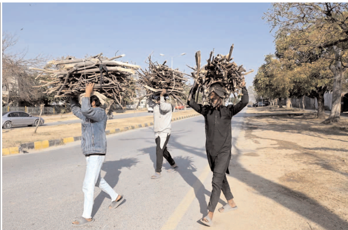
ISLAMABAD: Young boys cross road on their way home, carrying dry branches of wood for domestic use, especially for cooking and heating in Federal Capital.