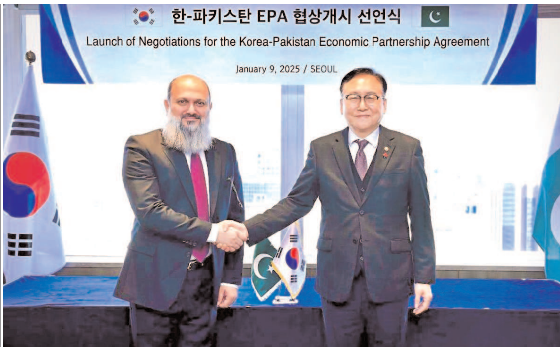
ISLAMABAD: Federal Minister Jam Kamal Khan and Korean Trade Minister Inkyo Cheong shake hands after signing historic declaration to initiate Pakistan-Korea EPA negotiations in Seoul.

The prices of per tola and ten gram silver remained constant at Rs3,350 and Rs2,872.08 respectively. The price of gold in the international market increased by $13 to $2,665 from $2,652, the Association reported.