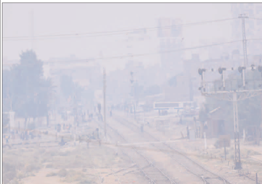
HYDERABAD: A thick fog blankets the entire city, shrouding everything in mystery as the chill of the morning weather causes all to vanish in the mist.