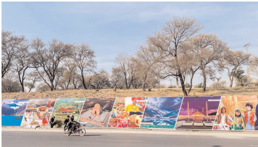
ISLAMABAD: A bike rider passes by posters along Srinagar Highway, showcasing Pakistani culture in preparation for the upcoming Pakistan International Girls Conference, which will host delegates from over 40 countries.

He also said that we have made nominations from the District Judiciary for the appointments in the high court and good news will be received soon.