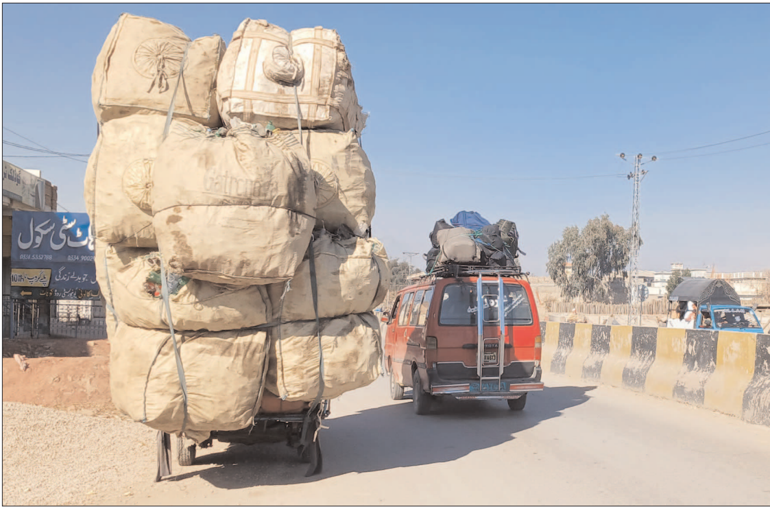
KOHAT: A view of over loaded vehicle at University Road, may cause any incident.

SUKKUR (PPI): Sukkur Electric Power Company (SEPCO) has disconnected 323 electricity connections of various government institutions across 10 districts, including Sukkur, Shikarpur, Khairpur, and Larkana. The power disconnection affects various government institutions, street lights, and public services. Notably, street lights on major roads in Sukkur city, such as Airport Road, Military Road, and Shikarpur Road, have been turned off, causing inconvenience to residents. According to SEPCO's CEO, Ijaz Ahmed Channa, the action was taken due to the Sindh government's failure to pay outstanding dues. The disconnection of electricity supply to government institutions underscores the urgent need for the Sindh government to address these financial obligations to restore essential services in the affected areas. SEPCO, a major electricity provider in Sindh, serves multiple districts, including Sukkur, Shikarpur, Khairpur, and Larkana. SEPCO is responsible for distributing electricity to both private consumers and public sector institutions. Over the years, there have been recurrent issues with unpaid electricity bills from various government institutions.