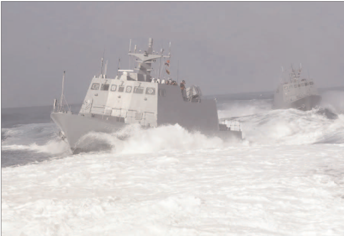
KAOHSIUNG : Two Kuang Hua VI-class missile boats are seen during a simulated attack drill off Kaohsiung City, southern Taiwan.