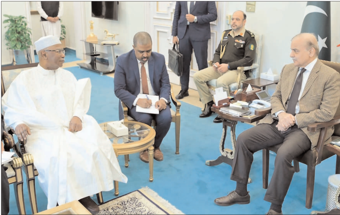
ISLAMABAD: Secretary General of Organization of Islamic Cooperation, Hissein Brahim Taha called on Prime Minister Shehbaz Sharif.