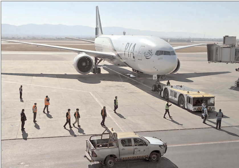
ISLAMABAD: Ground staff stands next to PIA aircraft ahead of take off for Paris.

Appreciating the thoughtful leadership of the Secretary General, the prime minister praised the organization's support in promoting the true identity of Islam at the global level, advocating the common goals of the Muslim world, and promoting mutual respect and understanding between religions, beliefs and cultures.