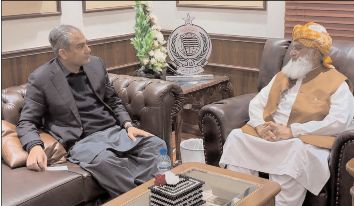
ISLAMABAD: Federal Minister for Interior, Mohsin Naqvi in a meeting with JUI-F chief, Maulana Fazlur Rehman.