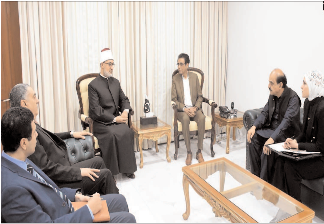
ISLAMABAD: Federal Minister for Education Dr. Khalid Maqbool Siddiqui met with a delegation led by Dr. Nazir Mohamed Ayad Egyptian Grand Mufti of Arab Republic.

ISLAMABAD (APP): Islamabad Traffic Police (ITP) has taken strict action against over 47,000 drivers in the last two weeks for violating traffic rules, as part of ongoing efforts to maintain discipline on the roads and ensure the safety of citizens. A public relation officer told APP on Friday that the ITP's Education Wing and Special Squads have been continuously working to raise awareness and enforce traffic laws. He said during the last two weeks, the ITP took legal action against over 47,000 drivers involved in traffic law violations. Additionally, 1,041 vehicles and motorcycles involved in serious traffic violations were impounded at various police stations. Furthermore, 11,922 citizens were educated about traffic rule violations, and 5,982 citizens were issued warnings. A total of 59 cases were registered against drivers involved in serious violations, he added. The ITP Smart Response Unit and other special units are responsible for maintaining the flow of traffic on highways, improving traffic flow during rush hours, solving parking problems in commercial areas and preventing violations of traffic rules in Islamabad. ITP also organized 58 other activities, including a flower and candy campaign, a Clean and Green Islamabad awareness walk and a Friends of Police badge initiative to promote community policing and raise awareness of traffic rules. These activities saw full participation from traffic police officers, members of civil society and other departments.