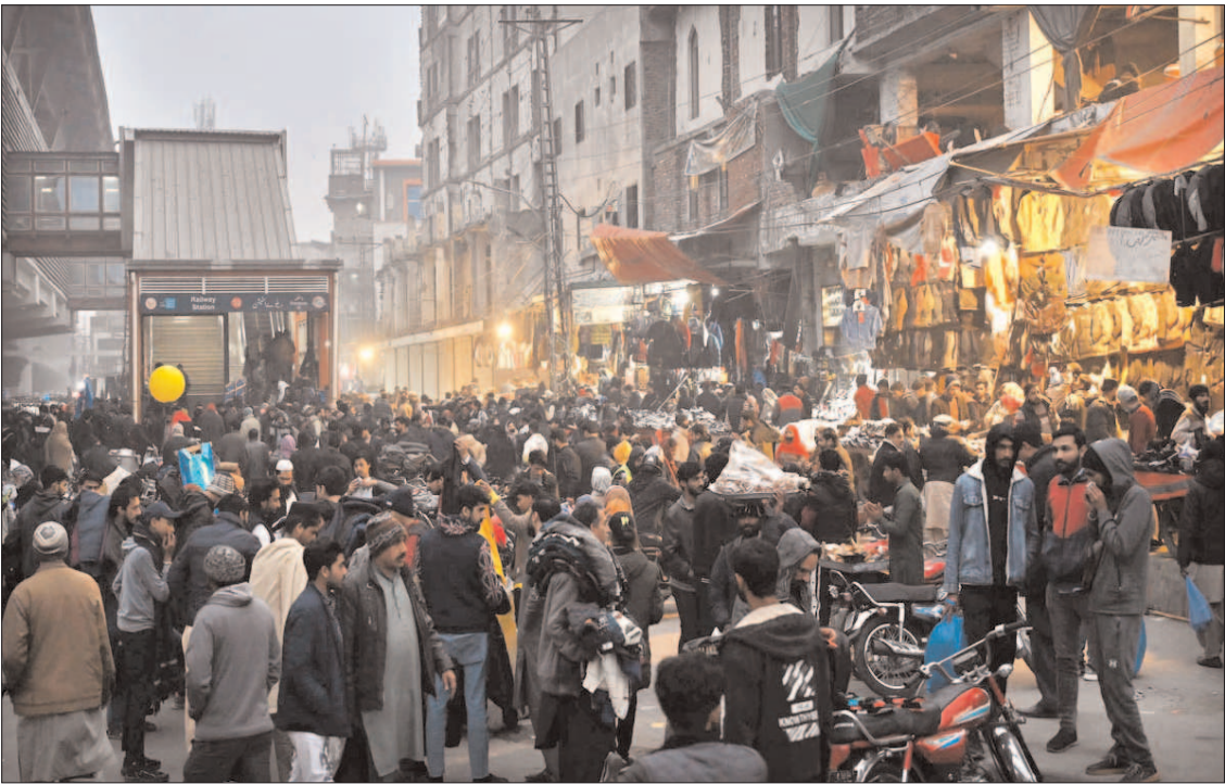
LAHORE: A large number of people on Nicholson Road near the Orange Line Train Station to buy warm clothes as temperatures drop in the City.