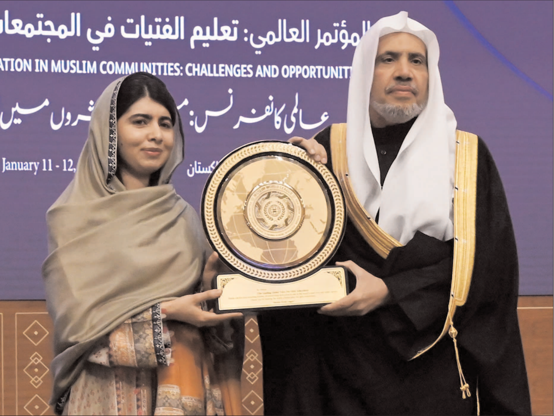
ISLAMABAD: Nobel Peace Prize Laureate Malala Yousafzai receives souvenir from Muslim World League Secretary General Muhammad Bin Abdul Karim Al-Issa