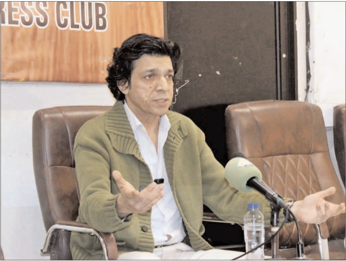
KARACHI: Senator Faisal Vawda addressing a press conference at Karachi Press Club.