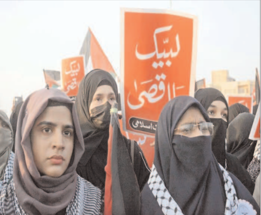
KARACHI: A large number of Participants, including women and children, to express solidarity and raise slogans in support of Palestinians during the Gaza Million March at Sea View.

Lebanese officials have appealed to the international community for funding. The government is working with the World Bank to get an updated damage assessment and hopes to set up a multi-donor trust fund.