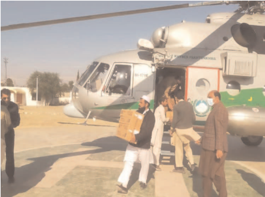
PESHAWAR: Helicopter of Khyber Pakhtunkhwa government delivered the medicines to the Kurram Agency.