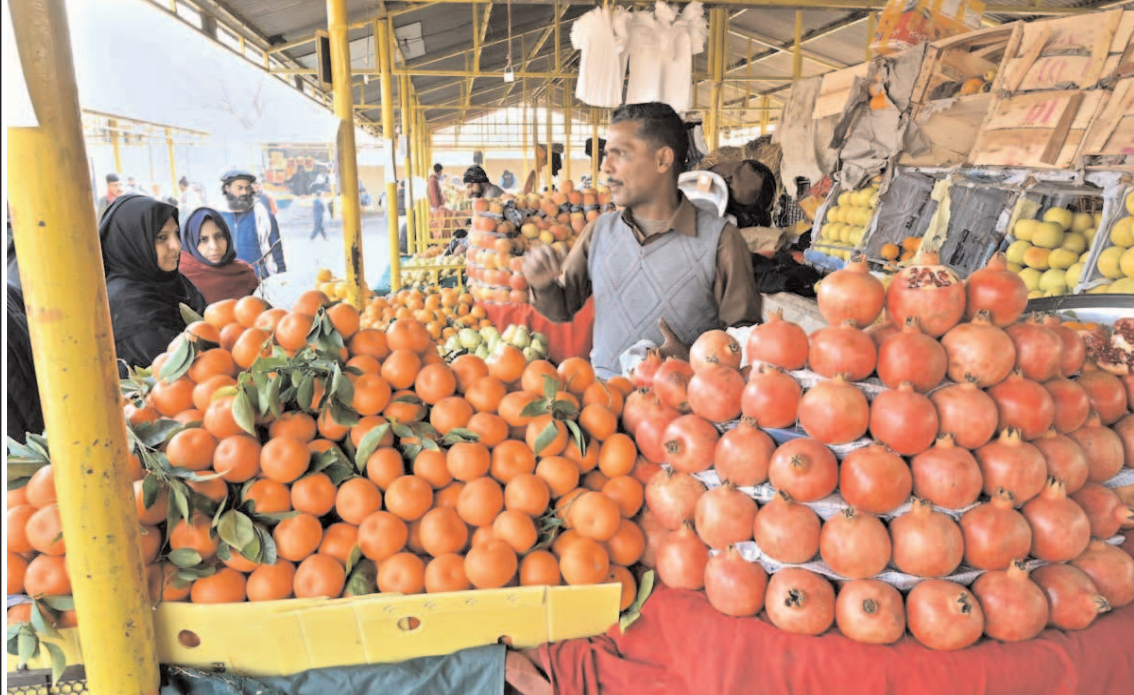
ISLAMABAD: A vendor selling seasonal fruits at stall in weekly Sunday Bazaar Aabpara in Federal Capital.