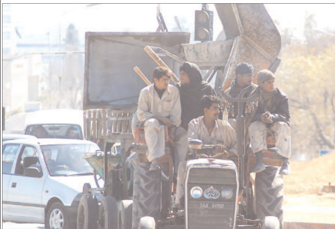
ISLAMABAD: Labourers on the way back after work on a Tractor Trolley.

In case of any complaint, citizens were asked to register their complaints on helpline number 1139, which would be rectified immediately, he added.