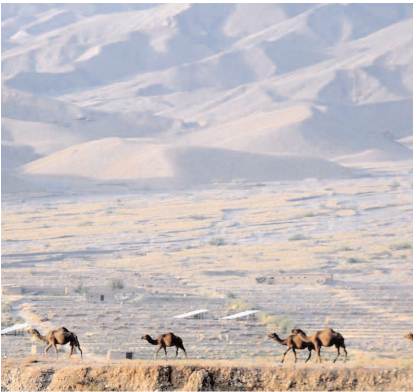
QUETTA: Camels passing through a picturesque mountainous region.

Sarson ka Saag, a timeless winter delight, continues to celebrate Punjab's culinary heritage, connecting families to their traditions and offering both warmth and nourishment during the chilly season.