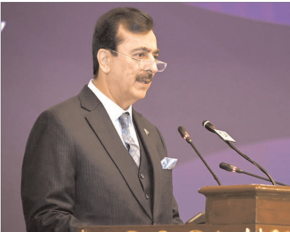
ISLAMABAD: Chairman Senate, Syed Yousaf Raza Gilani addresses the closing ceremony of the International Conference on Girls' Education at Jinnah Convention Centre.

ISLAMABAD (APP): Indus River System Authority (IRSA) on Sunday released 30,000 cusecs water from various rim stations with inflow of 40,000 cusecs. According to the data released by IRSA, the water level in River Indus at Tarbela Dam was 1476.47 feet and was 78.47 feet higher than its dead level of 1,398 feet. Water inflow and outflow in the dam was recorded as 15,900 cusecs and 10,000 cusecs respectively. The water level in River Jhelum at Mangla Dam was 1133.70 feet, which was 83.70 feet higher than its dead level of 1,050 feet. The inflow and outflow of water was recorded 4,200 cusecs and 100 cusecs respectively. The release of water at Kalabagh, Taunsa, Guddu and Sukkur was recorded as 14,600, 14,500, 1,900 and 5,800 cusecs respectively. Similarly, from River Kabul, a total of 13,500 cusecs of water released at Nowshera and 6,400 cusecs released from River Chenab at Marala.