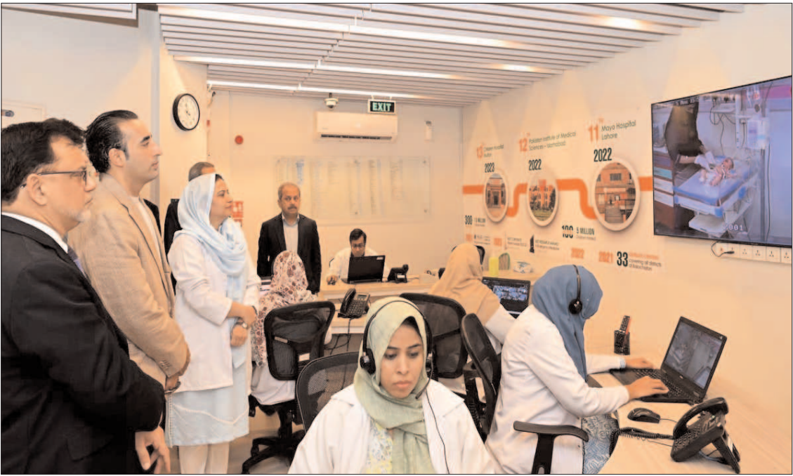
KARACHI: Chairman Pakistan Peoples Party Bilawal Bhutto Zardari visiting at Dr. Ruth Pfau Civil Hospital during the launch ceremony of the report on the lowest level of child mortality rate in government hospitals of Sindh organized by PALIS.