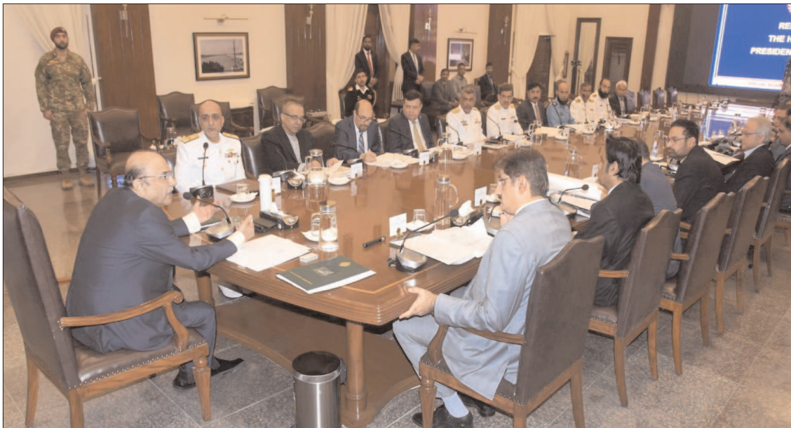
KARACHI: President Asif Ali Zardari chairing a Board of Governors' meeting of Cadet College Petro at CM House.