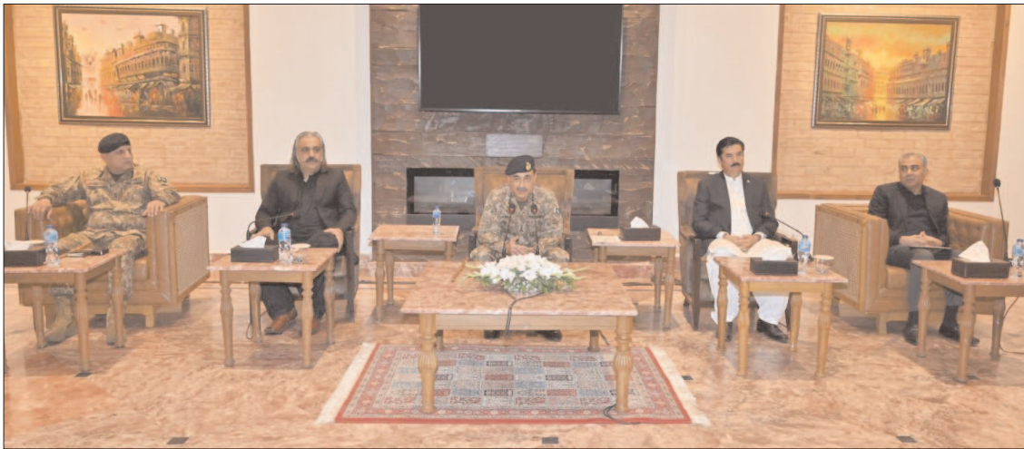
PESHAWAR: General Syed Asim Munir, Chief of Army Staff being briefed about ongoing security situation.