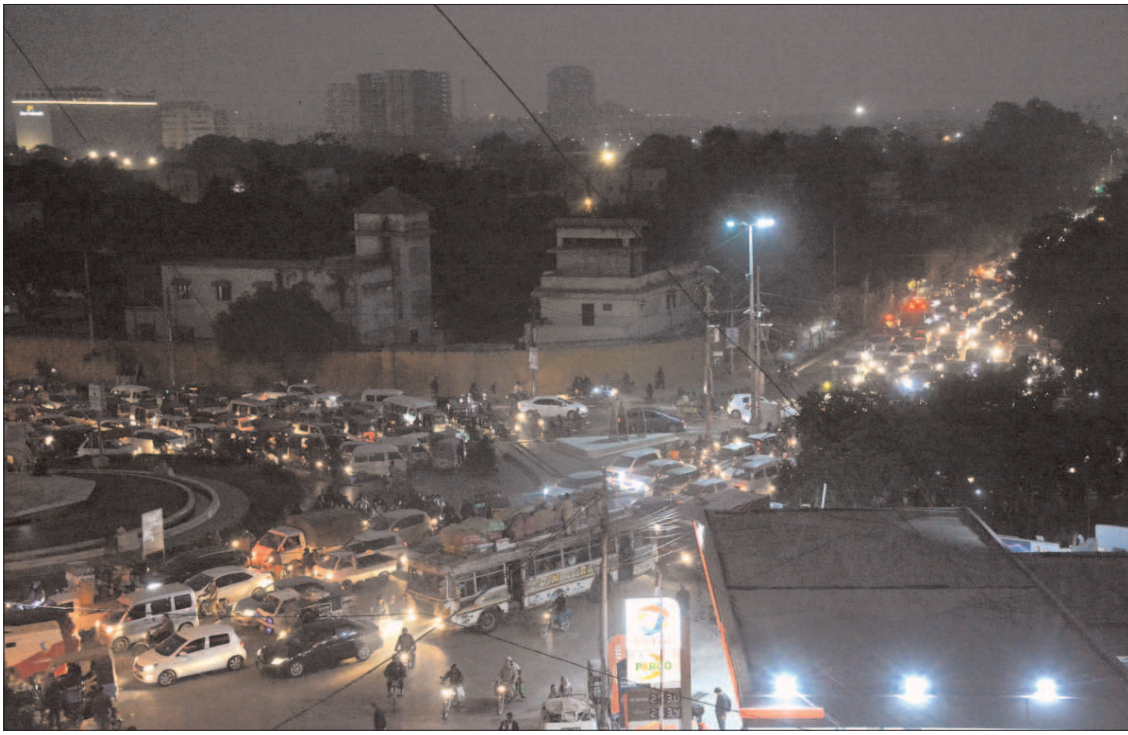
KARACHI: A view of massive traffic jam seen at Karachi Press Club Chowk.