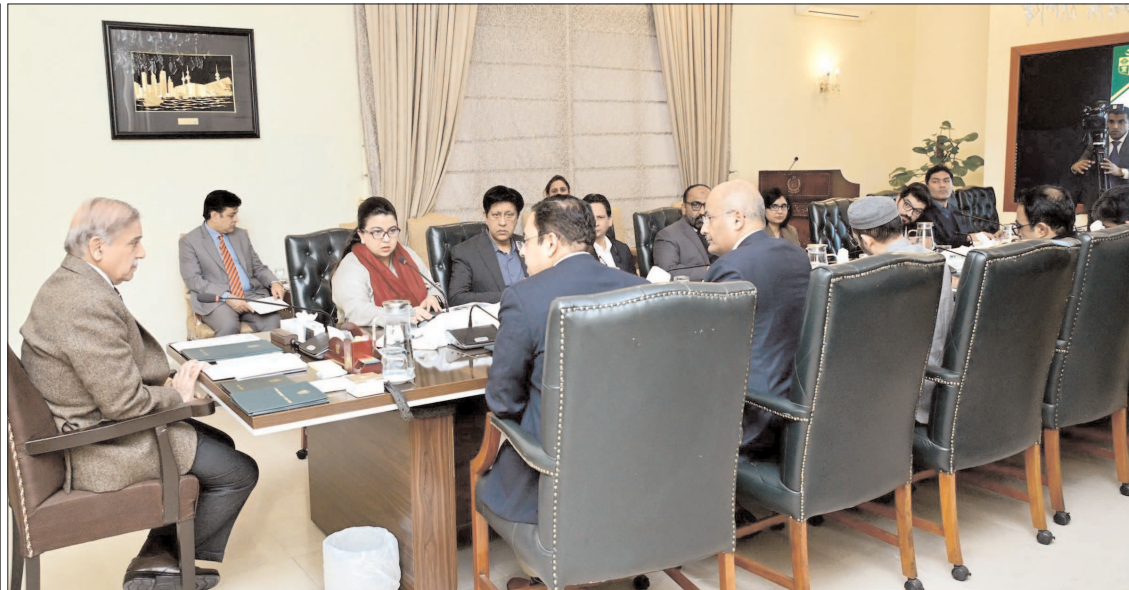
ISLAMABAD: Prime Minister Shehbaz Sharif chairing a meeting regarding IT sector.

the need for a unified front beyond political colours against the extremist philosophy of terrorist groups. Upon arrival, COAS was received by the Corps Commander Peshawar.