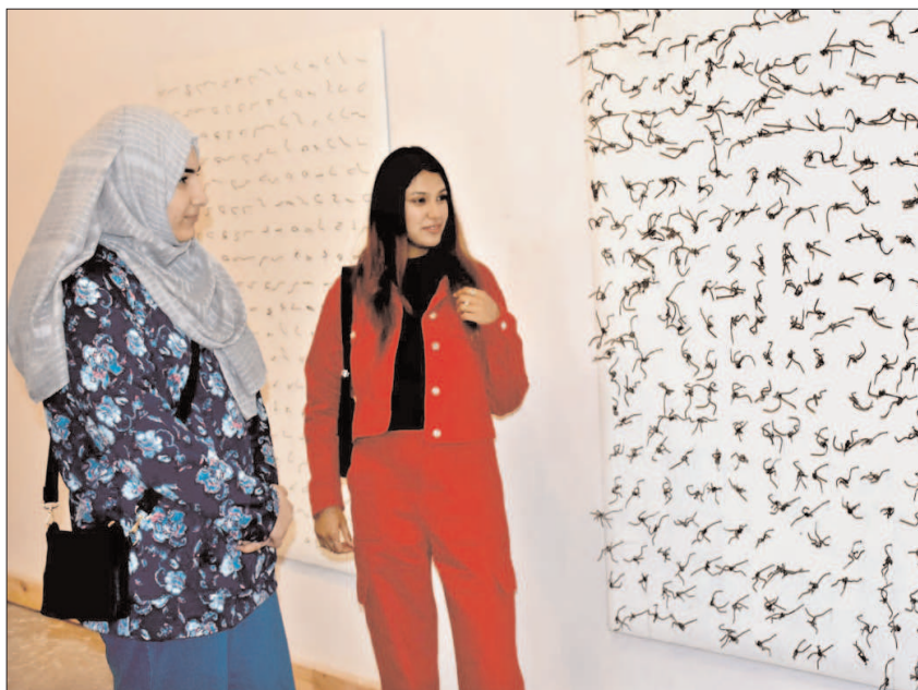
LAHORE: Female students admire the creative art pieces on display at the Master's Degree Show exhibition, held at Shakir Ali Auditorium.