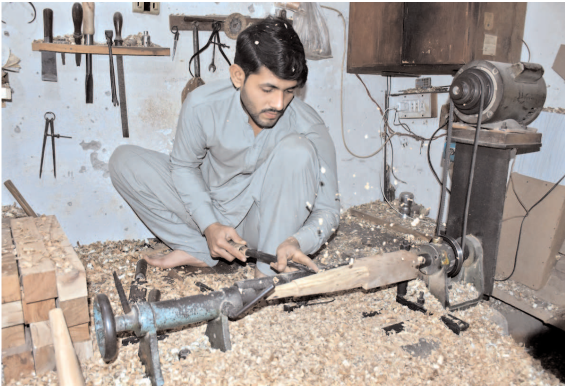
LAHORE: A carpenter crafts traditional bed pieces using an electric machine at Bati Chowk furniture market.