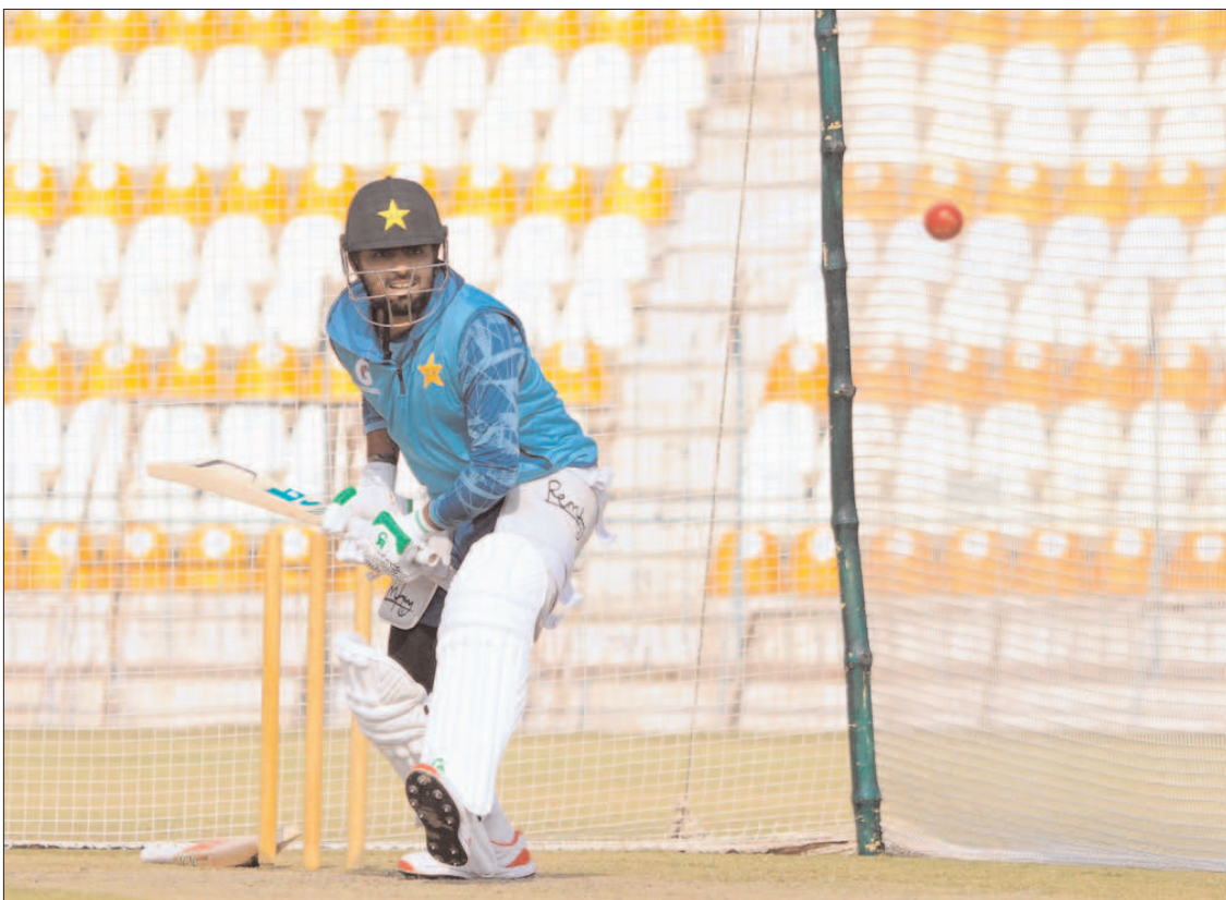
MULTAN: Pakistan's Babar Azam bats in the nets during a practice session ahead of their first Test cricket match against West Indies at Multan Cricket Stadium.