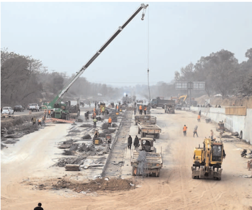
ISLAMABAD: Heavy machinery being used for construction work of Serena Chowk Underpass Project during development work in Federal Capital.

Visitors to the exhibition can experience the profound beauty of traditional calligraphy, exploring its deep connections to the diverse cultural narratives of ECO member nations. The exhibition underscores PNCA's mission to promote creativity, preserve cultural heritage, and encourage regional cooperation. The exhibition is open to the public at the National Art Gallery, PNCA, Islamabad, until January 19.