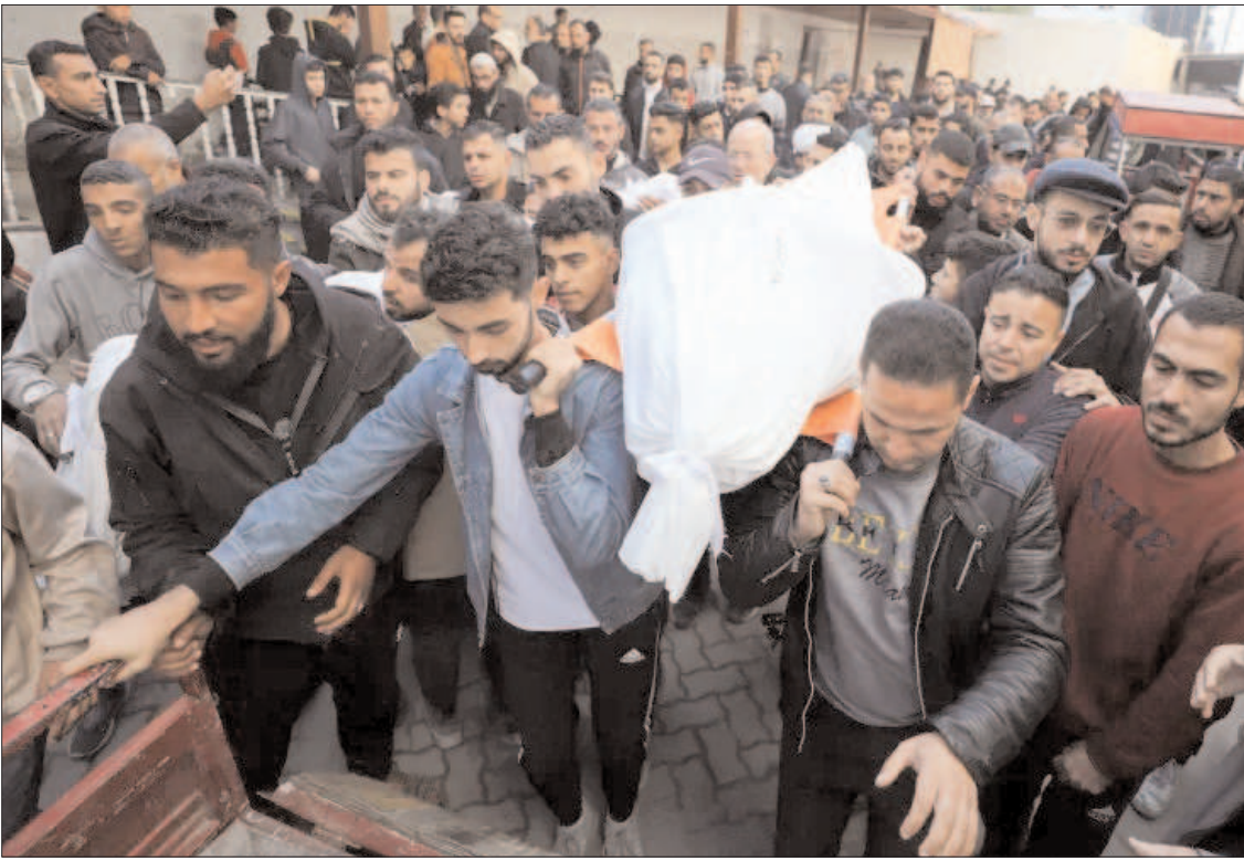
GAZA: Men carrying bodies of Palestinians killed in Israeli strikes at al-Ahli Arab Hospital.