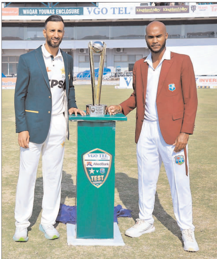
MULTAN: West Indies captain Kraigg Brathwaite and his Pakistan counterpart Shan Masood pose with the Test series trophy at the Multan Cricket Stadium.