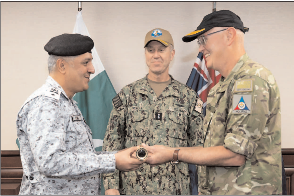
ISLAMABAD: Commander Combined Task Force (CTF) - 150 Commodore Asim Sohail Malik of Pakistan Navy hands over the command to Commodore Rodger Ward of Royal New Zealand Navy at HQ Combined Maritime Forces, Bahrain.

The High Commission and the three Consulates will continue with their efforts to promote bilateral engagement through active dialogue, business linkages and cultural diplomacy, he added.