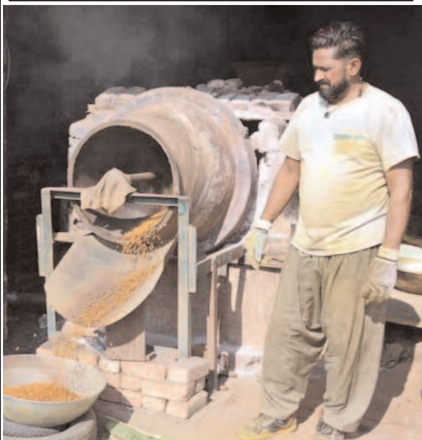
FAISALABAD: A worker busy in roasting grams for customers at his workplace.