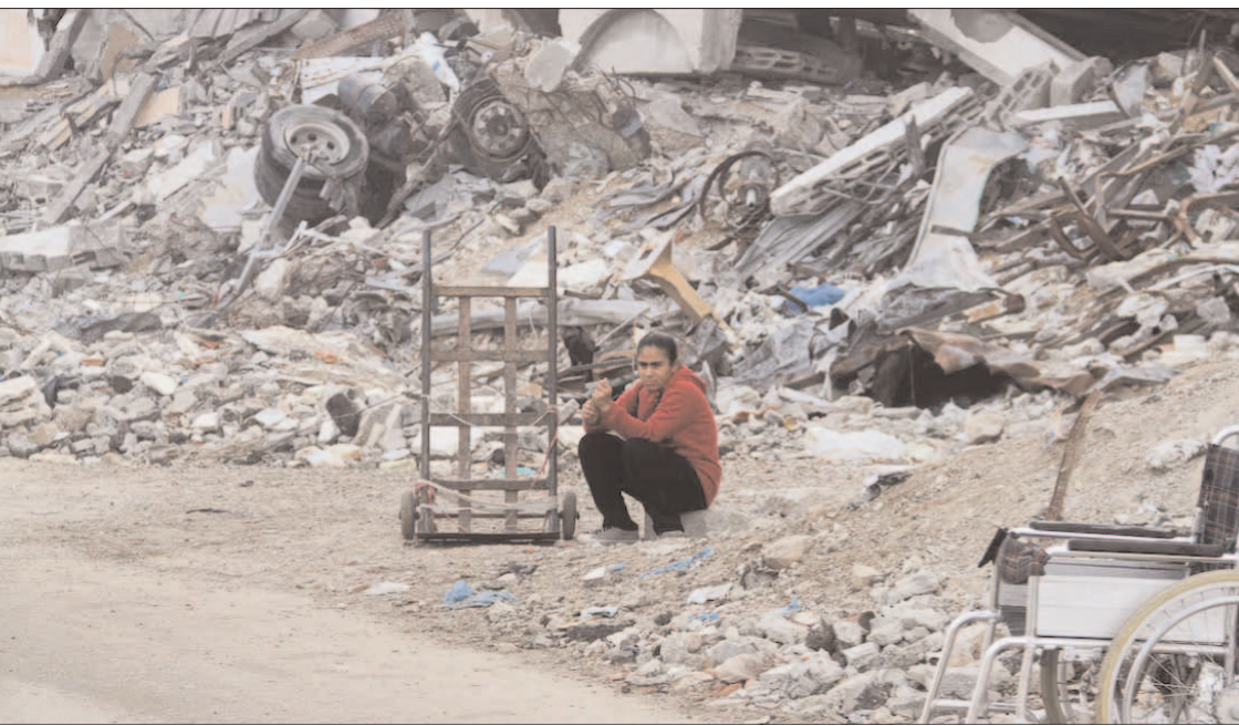
GAZA: A Palestinian girl sits by the rubble of buildings destroyed in previous Israeli strikes, ahead of a ceasefire set to take effect on Sunday, in Gaza City.

MADRID (INP): At least 50 migrants, including 44 Pakistanis, died when a boat carrying illegal migrants from the African country of Mauritania to Spain was involved in an accident. The boat carried 86 migrants, of whom 36 were rescued. Among the deceased, 12 were young residents of Gujrat. The young victims who perished in the Madrid boat accident had embarked on their journey to Europe four months ago. Migrant rights group Walking Borders reported that the boat was en route from West Africa to Spain. The boat, which left Mauritania on January 2, was carrying 86 people, 66 of whom were Pakistani. Only 36 migrants were rescued.