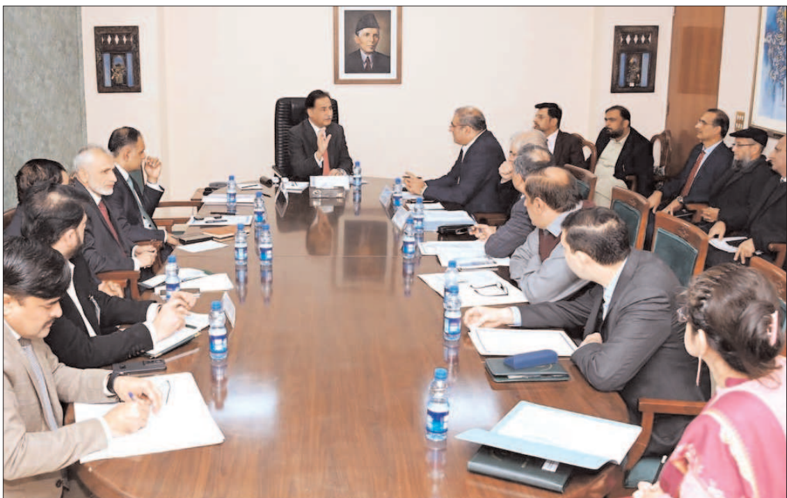
ISLAMABAD: Senior officers of C.D.A briefing Speaker National Assembly Sardar Ayaz Sadiq on construction of family suites at Parliament House.

The Coordinator to the PM also spoke about the importance of incorporating disaster risk financing into the global loss and damage agenda. She stated that this approach signifies a proactive measure to manage the rising costs linked to the climate change.