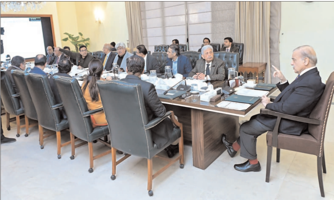
ISLAMABAD: Prime Minister Shehbaz Sharif chairing a review meeting regarding promotion of Small and Medium Enterprises sector.