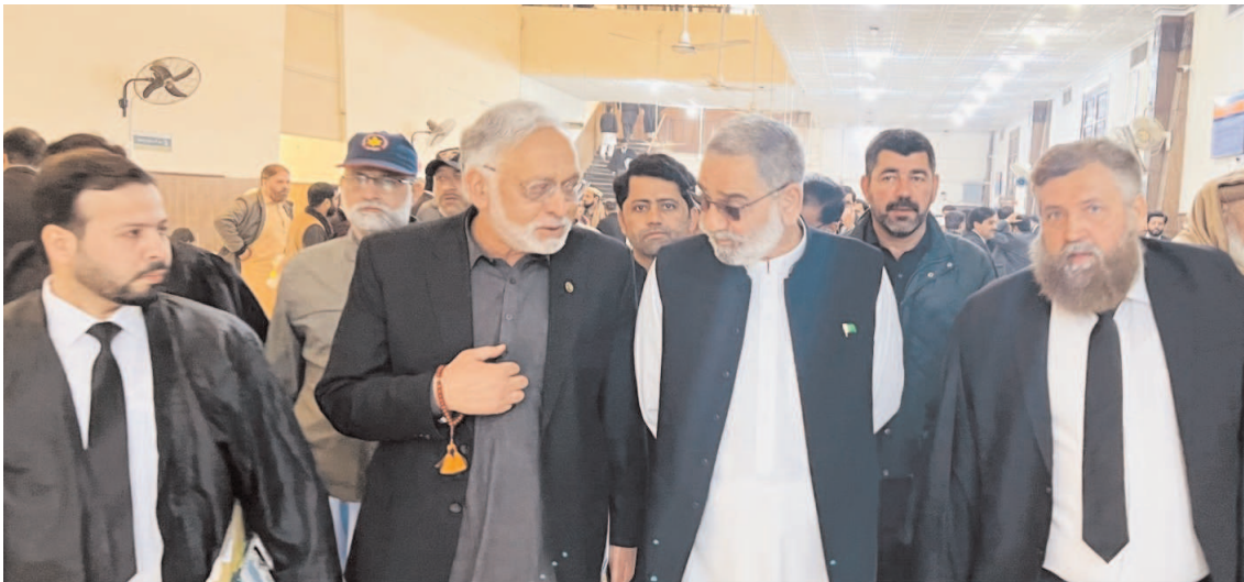
PESHAWAR: Speaker Khyber Pakhtunkhwa Assembly Babar Saleem Swati arriving at Peshawar High Court premises for hearing of case.