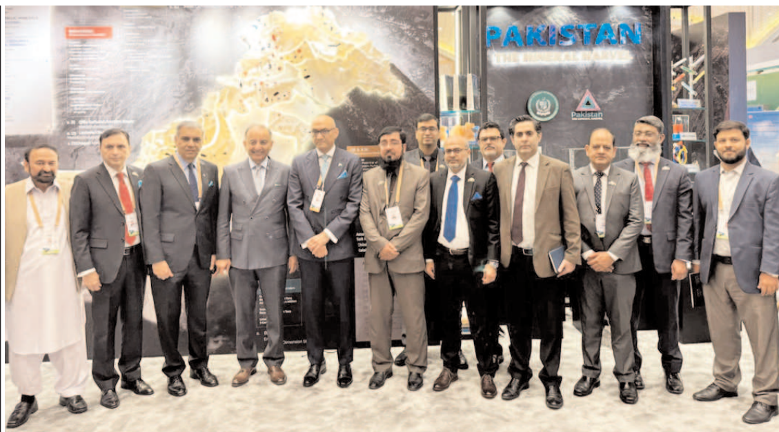
RIYADH: Minister of Petroleum & Water Resources Dr. Musadik Malik and MD & CEO PPL alongwith management of participating companies and visitors at Pakistan Pavilion in Future Minerals Forum 2025.

respectively. The price of the Euro decreased by 11 paise to close at Rs287.13 against the last day's closing of Rs287.24, according to the State Bank of Pakistan (SBP). The Japanese yen went up by 01 paise and closed at Rs1.78, whereas a decline of 34 paise was witnessed in the exchange rate of the British Pound, which was traded at Rs340.74 as compared to the last day's closing of Rs341.08. The exchange rates of the Emirates Dirham and the Saudi Riyal increased by 02 and 06 paise to close at Rs75.91 and Rs74.32, respectively.