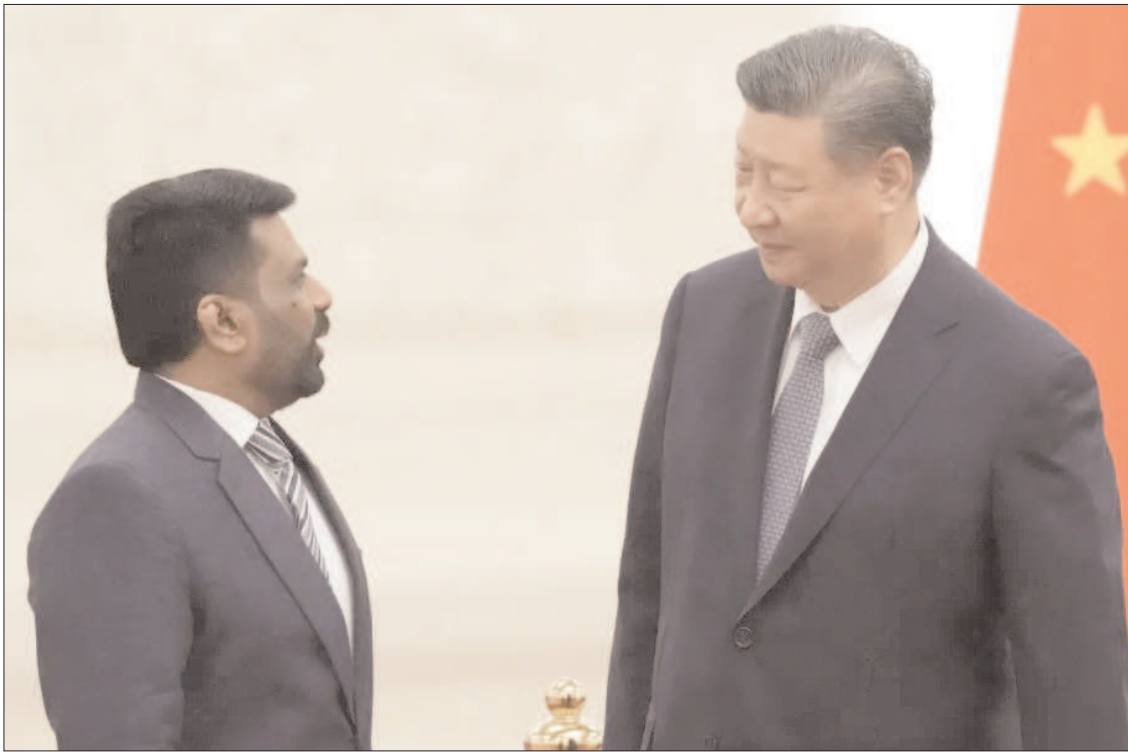
BEIJING: Chinese President Xi Jinping speaking with Sri Lankan President Anura Kumara Dissanayake during arrival ceremonies at the Great Hall of the People in China.