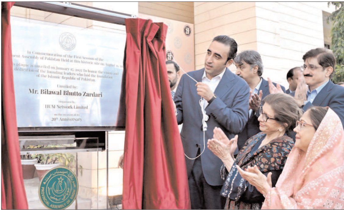
KARACHI: Chairman PPP Bilawal Bhutto Zardari unveiling a special plaque at Sindh Assembly to commemorate holding of country's first Constituent Assembly.