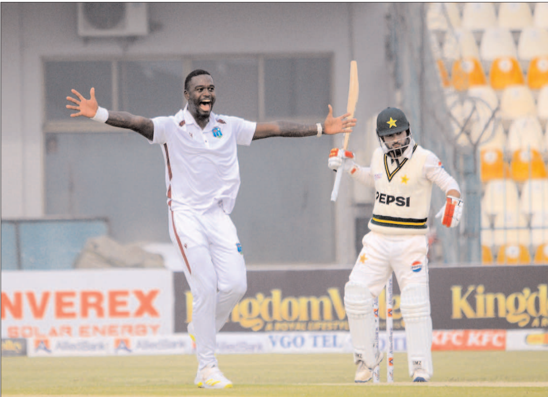
MULTAN: West Indies' Jayden Seales successfully appeals for leg before wicket (LBW) against Pakistan's Kamran Ghulam during the first day of the first Test cricket match between Pakistan and West Indies.

Pakistan hoping to build on their recovery, while the West Indies will look to capitalize on the early breakthroughs provided by bowling attack. The Multan Cricket Stadium, located at the city of saints, witnessed an enthusiastic crowd of spectators who turned up in large numbers despite the cold and foggy weather. Fans cheered passionately for both teams, creating a lively atmosphere with chants and banners supports the players. The city, known for its rich culture and hospitality welcomed the West Indies team warmly, with local supports also appreciating the visitor's performances. Tight security arrangements were in place throughout the venue to ensure a smooth and safe match experience for the players and spectators alike.