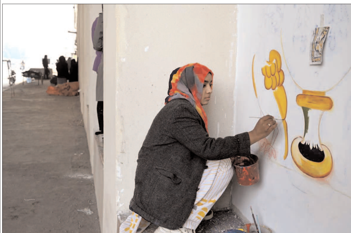
ISLAMABAD: A student creating wall art at Zero Point bridge in the Federal Capital.

He also optimistic that the negotiations would yield a positive outcome, ultimately strengthening the democratic process.