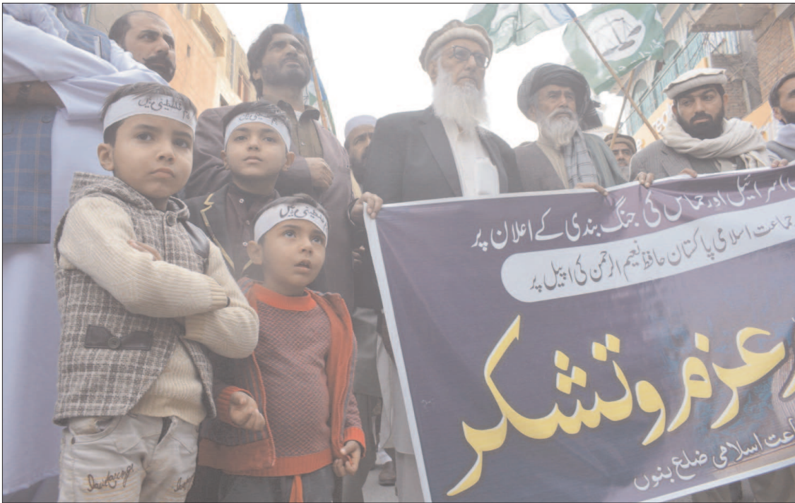
BANNU: Activists of Jamat-e-Islami holding a banner during a rally in support of Israel-Hamas deal for ceasefire in Gaza.

WANA: The Pak-Afghan crossing at Angoor Adda Gate is set to reopen for trade after 15 months of closure, marking a significant milestone for the region's struggling economy. The announcement, made by the Ahmadzai Wazir tribe and the organizers of an ongoing sit-in, aims to restore commercial activities between Pakistan and Afghanistan, offering a lifeline to local traders and businesses. While the decision has been welcomed by various quarters, the sit-in against visa and passport regulations remains in place. Protesters argue that the imposed requirements disproportionately affect tribes residing on both sides of the border, disrupting their lives and hindering long-standing cross-border connections. "We will not end our protest until these restrictions are lifted," declared one of the organizers, emphasizing the hardships faced by tribal communities.