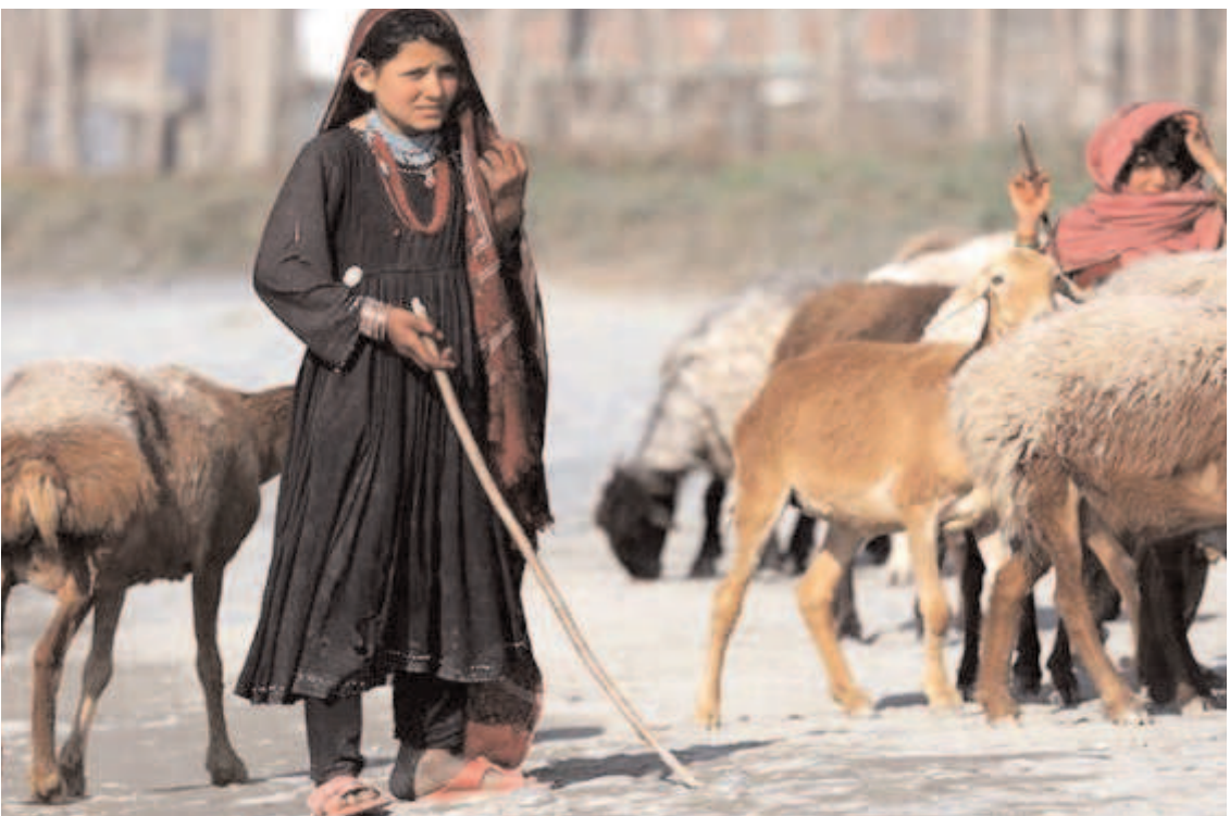
PESHAWAR: Gypsy girls guide their herd of sheep along the roadside at Charsadda Road.

PESHAWAR (APP): Federal Minister for States and Frontier Regions, Gilgit-Baltistan, and Kashmir Affairs, Engr Amir Muqam, on Friday hailed the court verdict in the £190 million corruption case, stating that the person who accused others of being thieves was himself found guilty. Commenting on the PTI founder's conviction, Engr Amir Muqam said that the £190 million theft was proven today. He added that the plundering and robbery of the people of Pakistan's money had been confirmed, says a statement here. Engr Amir Muqam further stated that under the guise of slogans of honesty, the extent of the robbery was revealed. He claimed that Imran Khan had unlawfully used his powers to amass expensive rings, jewelry, and properties worth billions of rupees.