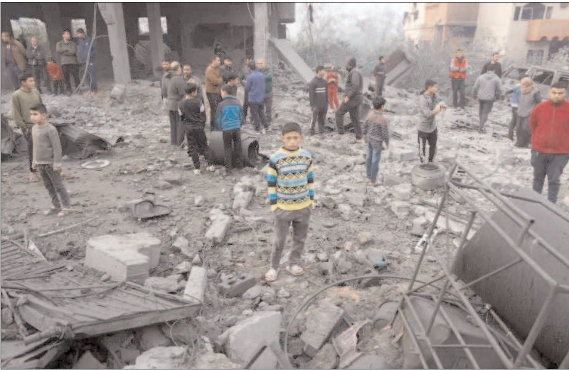
GAZA: Residents inspecting their damaged houses hit by Israeli military.

"We lost a close election under closely contested, hard fought issues, but that doesn't mean that what we did and how we did it hasn't helped change the country for the better," said Steve Ricchetti, a longtime adviser to Biden who served as White House counselor. Ricchetti argued that Biden provided a model for repairing damage caused by Trump, one that will help another president down the line.