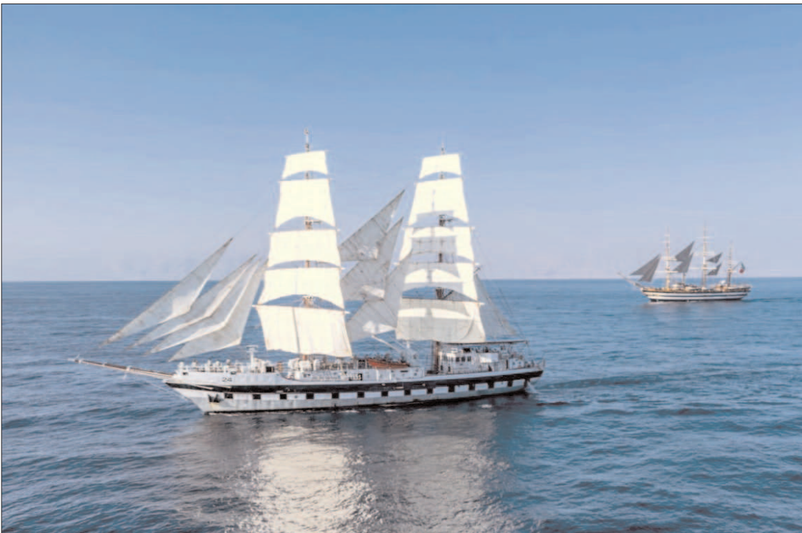
ISLAMABAD: Pakistan Navy sail training ship Raj Naward conducting joint sailing operations with Italian Navy sail ship Amerigo Vespucci in Gulf of Oman.

At Sakhi Sarwar Civil Hospital, the federal minister interacted with patients, inquired about the medical services being provided, and expressed dissatisfaction with the lack of staff, essential facilities, and non-functional equipment. He sought a detailed report and called for immediate steps to address the shortcomings. "The number of doctors is alarmingly low. Increasing medical staff is essential to ensure quality healthcare for the people," he remarked.