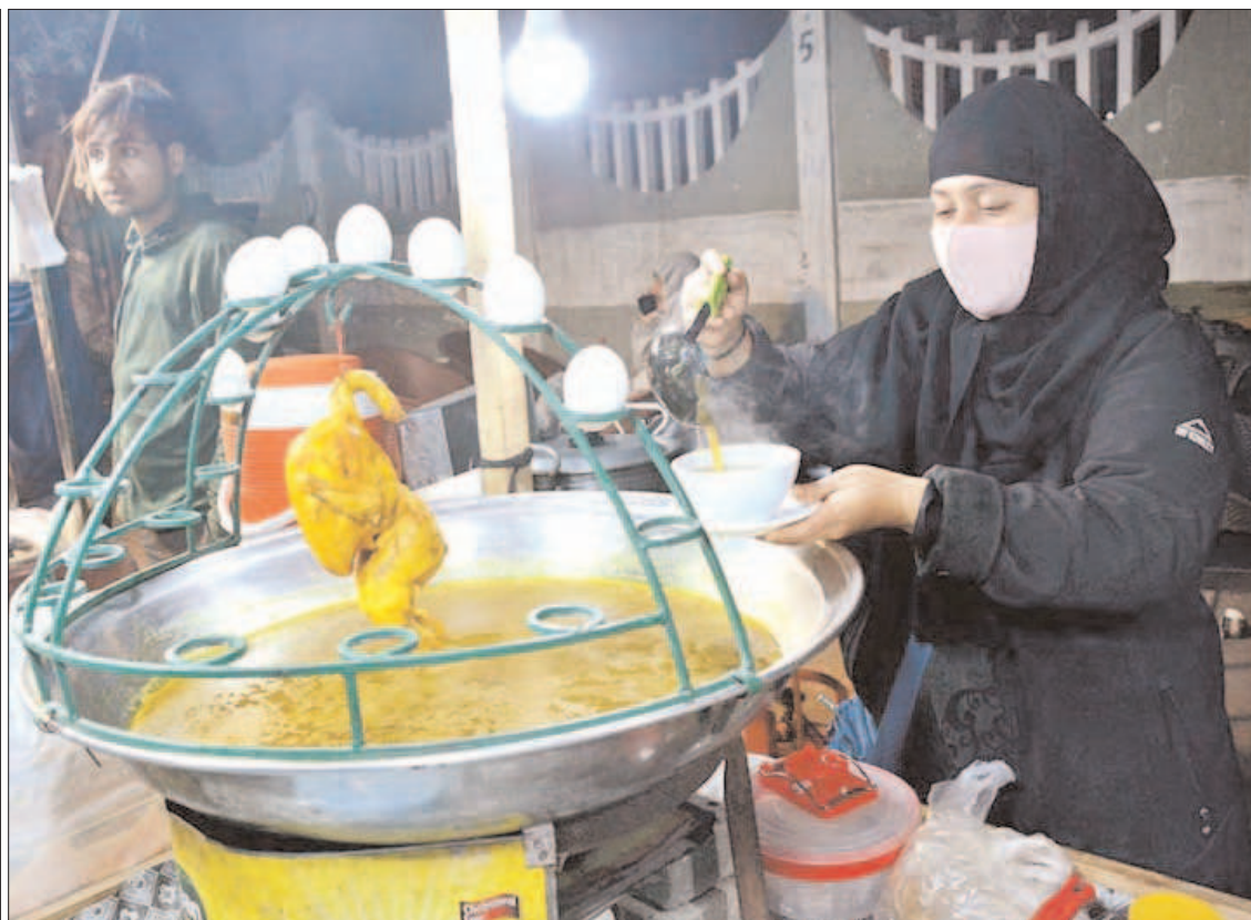
HYDERABAD: A woman vendor displaying chicken soup to attract customers at Latifabad.

However, their group is not in favor of boycotting the polio campaign and will fully participate in it. They appealed to the Chief Minister of Khyber Pakhtunkhwa, Ali Amin Gandapur, to promptly accept their demands and provide them with dignity and financial security.