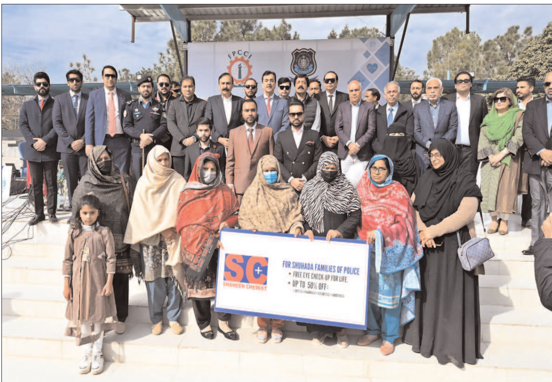
ISLAMABAD: Chairman Senate of Pakistan, Syed Yousaf Raza Gillani in a group photograph with other participants during the opening ceremony of health & Fitness Gala at Police Lines.

ISLAMABAD (APP): Iconic Sindhi and Urdu TV drama actor Gulab Chandio was remembered on his sixth death anniversary on Saturday where fans, fellow artists and family members paying tribute to his remarkable contributions for drama and entertainment industry. Chandio's remarkable contributions to the Pakistani drama industry were remembered and celebrated, as people from all walks of life shared their favorite memories of the actor's impressive performances. His family members and colleagues also paid emotional tributes, recalling his exceptional talent, dedication and passion for his craft. Through his remarkable body of work, Gulab Chandio left an indelible mark on the Pakistani entertainment industry, and his legacy continues to inspire and influence new generations of actors and drama enthusiasts. Gulab Chandio emerged as TV actor in early 80s and started his career in Sindhi dramas. Gulab was a well-known Sindhi actor of Pakistani TV drama industry who was recognized for his excellent delivery of dialogues and famous as villain in most of the plays. Gulab Chandio has shown his talent and acting skills in several dramas including Noori Jan Tumachi, Natak Rang, Gulam Gardish, Zehar Baad, Bewafaiyan, Marvi, Saans Ley Aye Zindagi, Sagar Ka Moti and many more.