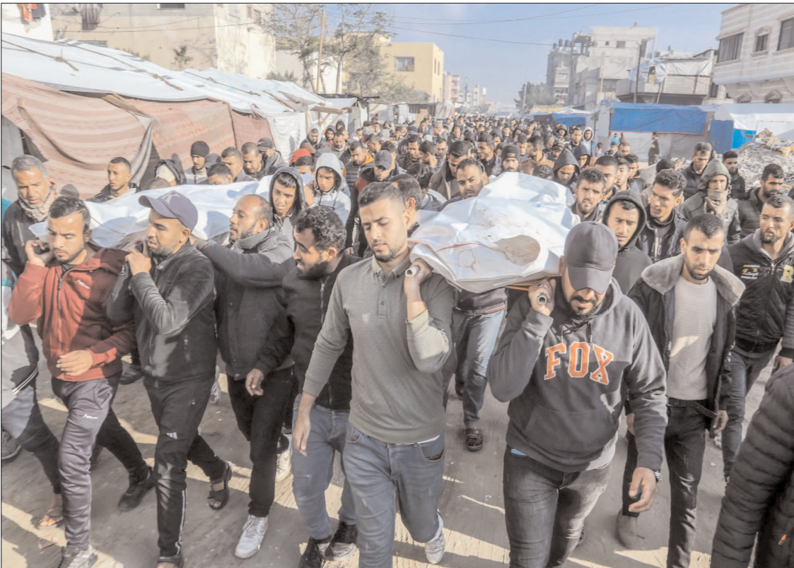
GAZA: Relatives of Palestinians killed in Israeli attacks mourn after an Israeli air strike on tents - despite announcement of a ceasefire agreement - in Khan Younis.

Matters related to Al-Qadir Trust case verdict and PTI's dialogues with the government came under discussion. Sources further said that the PTI legal team gave briefing on Al-Qadir Trust case during the meeting.