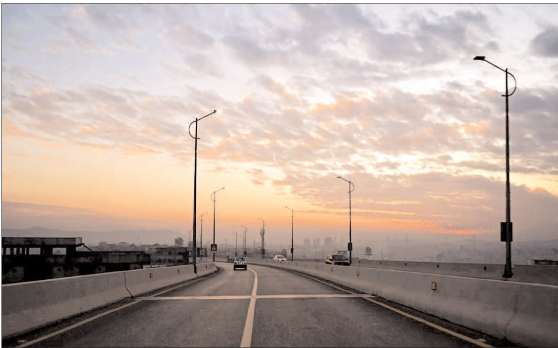
ISLAMABAD: An eye catching view of sunset with scattered clouds over Sirinagar Highway in the federal capital.

"Officers demonstrating exceptional performance will be rewarded, while those failing to meet expectations will face disciplinary actions," IGP said, reinforcing his commitment to accountability and excellence within the Islamabad Police.