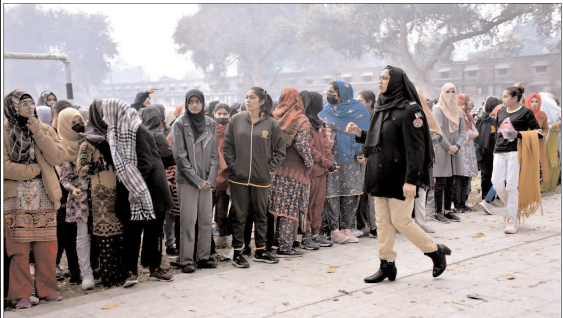
LAHORE: Candidates participate in a physical test, running 1.6 km within 7 minutes as part of the evaluation process.

further stated that Sheikh Waqas Akram has repeatedly talked about sealed envelopes, but these should have been opened when they were brought to the cabinet. Those who brought the founder of PTI into politics should be ashamed, and it is also shameful that a person like Imran Khan was described as Sadiq and Ameen. The Information Minister stated that the consequences they are facing now are the result of their actions. They claim to be spokespersons for higher courts, but how can they say that they will get relief from them? I am concerned about who is advising them on this. Higher courts should take notice of this matter. She also mentioned that the Asset Recovery Unit has wasted millions of rupees in Pakistan, and despite that, it gave them a clean chit. As Prime Minister, how could they have been trustees?