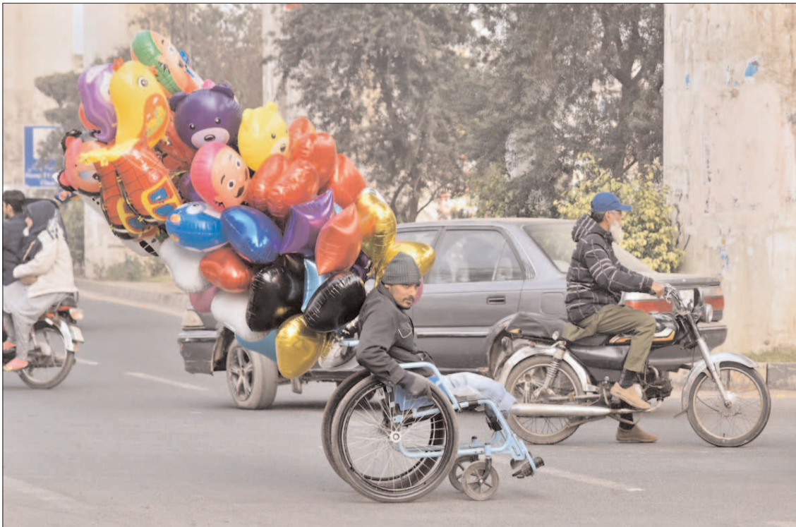
LAHORE: A disable person on the way for selling the colorful balloons while shuttling on the road on wheel chair to earn for livelihood in the City.