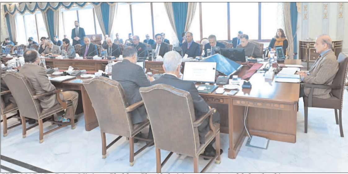
ISLAMABAD: Prime Minister Shehbaz Sharif chairing a meeting of federal cabinet.

Speaking to media outside the Peshawar High Court, he said the PTI would demand the release of all party prisoners, including Imran Khan, and a judicial investigation into the May 9 and Nov 26 incidents. The government and major opposition party PTI's negotiation committees are scheduled to meet again on Jan 2, with National Assembly Speaker Sardar Ayaz Sadiq set to preside over it.