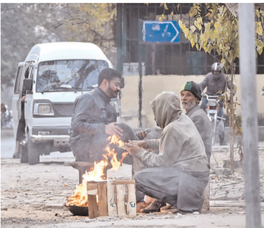
ISLAMABAD: People sitting around fire to keep them warm during cloudy weather in the Federal Capital.

The Benazir Income Support Programme remains a cornerstone of Pakistan's social protection efforts, ensuring financial stability and skill development opportunities for the country's most vulnerable communities.