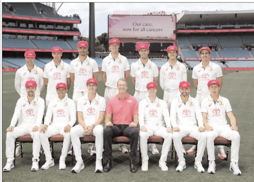
SYDNEY: The Australian players pose with Glenn McGrath ahead of the SCG Test.