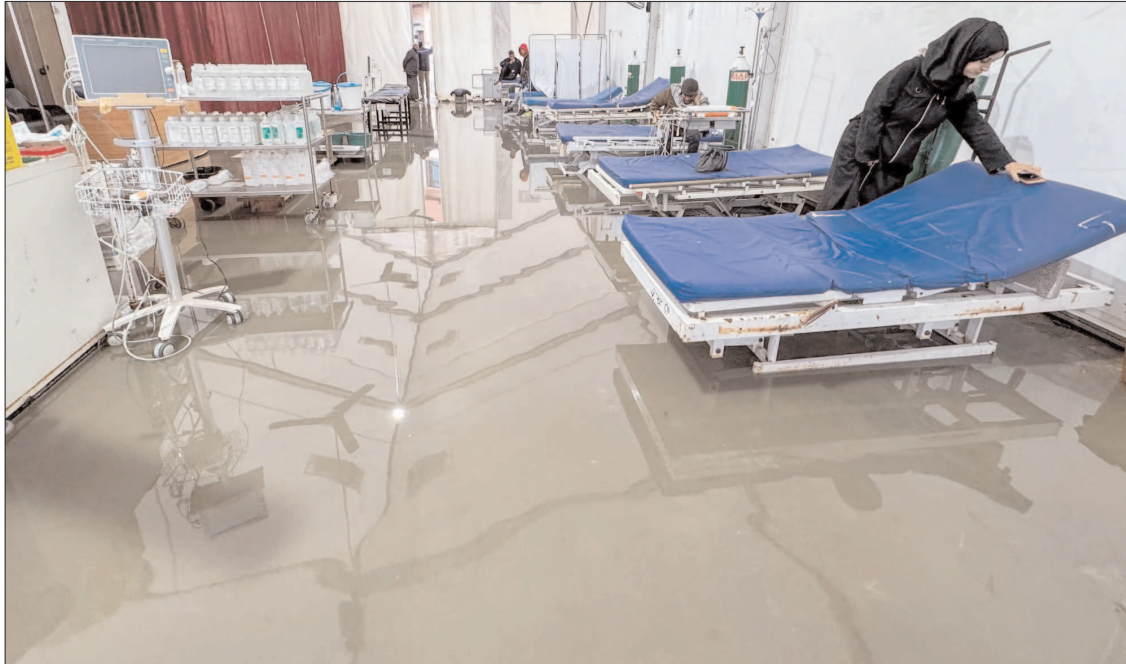
GAZA STRIP: A field hospital flooded following heavy rains in Khan Younis.

He directed the appointment of focal persons for effective coordination with relevant institutions for project implementation. He also instructed the formation of a steering committee at the provincial level to ensure the project runs on sustainable basis. He emphasized including officials from the Finance and P&D departments in the steering committee, as these departments have the capacity to sustain the project permanently.