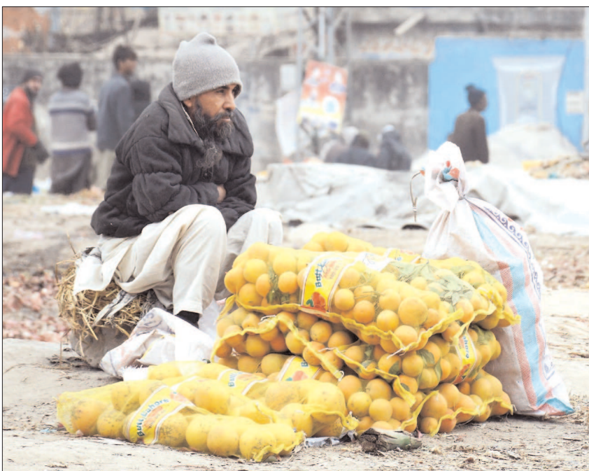
ISLAMABAD: A vendor selling sack of oranges along roadside in the federal capital.

She said that online retailers frequently offer discounts, promotions, and price matching, making it easier for us to discover and purchase products. Online shopping often provides better prices and deals compared to physical stores, she added. She said online shopping enables people with mobility issues or those living in remote areas to access products easily.