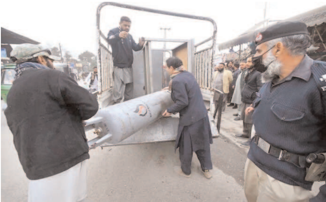
PESHAWAR: Town 1 officials load hotel cylinders from a hostel into a truck during an encroachment operation at Haji Camp near Children's Hospital in Peshawar.

He emphasized that the security of the Traffic Line would not be compromised. He stated that the department is committed to ensuring the smooth flow of traffic in the city and providing facilities and protection to officers and personnel.