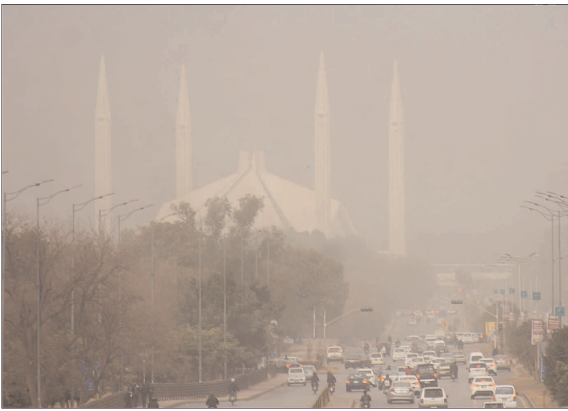
ISLAMABAD: A view of dusty air covered Faisal Masjid during fast wind in capital city.