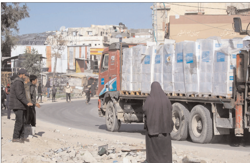
GAZA: A truck carrying much needed humanitarian aid drives through southern Gaza's Rafah