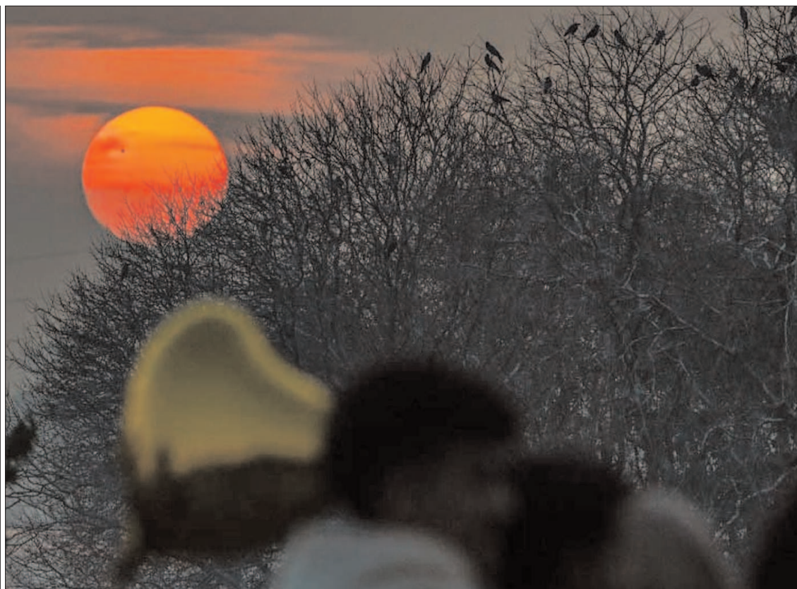
ISLAMABAD: A beautiful view of sunset after cloudy days in capital city.

Highlighting GCU's commitment to financial support, the Vice Chancellor revealed that in 2024 alone, 426 students received Chief Minister Honhaar Scholarships. "Over the last decade, 2,372 students were awarded PEEF Scholarships, 1,640 students benefited from HEC Need-Based Scholarships, and 8172 students received financial assistance through the university's own resources," he said. Twelve students were also awarded sports gold medals.