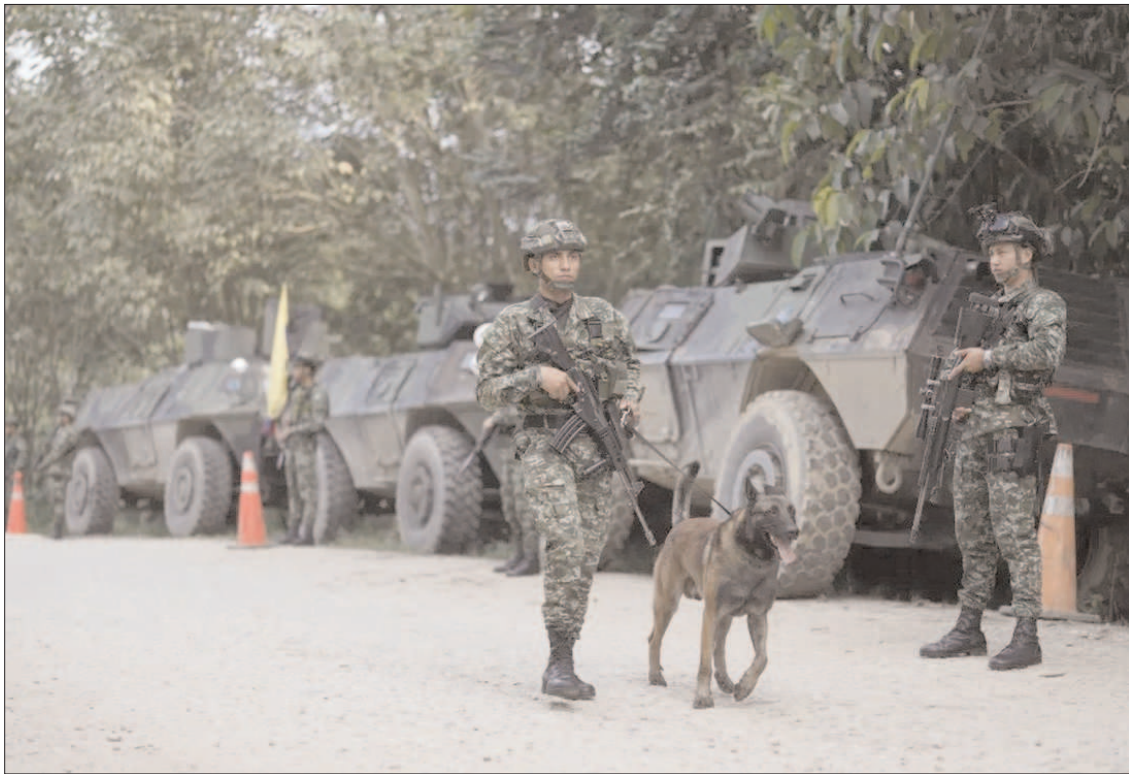
BOGOTA: Soldiers patrolling a road in Tibu in Colombia's northeastern Catatumbo region, where dozens have been killed amid clashes between the National Liberation Army and former members of the Revolutionary Armed Forces of Colombia.

And he appeared to joke about Trump's speech, chuckling as he said, "we heard the inaugural address today. We got a lot more to do." Biden then made the sign of the cross and everyone laughed. He and the first lady then walked across the tarmac to the familiar blue-and-white Air Force plane he flew on as president for the flight to Santa Ynez, California.