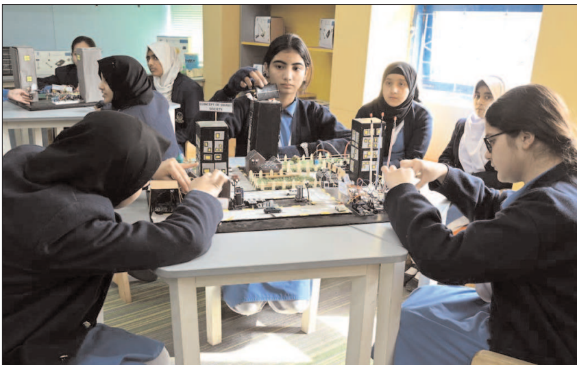
ISLAMABAD: A student works on building robots during a lab session, demonstrating innovative skills at ICG in the federal capital.

Governor Faisal Karim Kundi assured full support from the Khyber Pakhtunkhwa Governor House for all these projects and emphasized ensuring close coordination with international aid organizations. He also promised to highlight these issues on national and international forums.