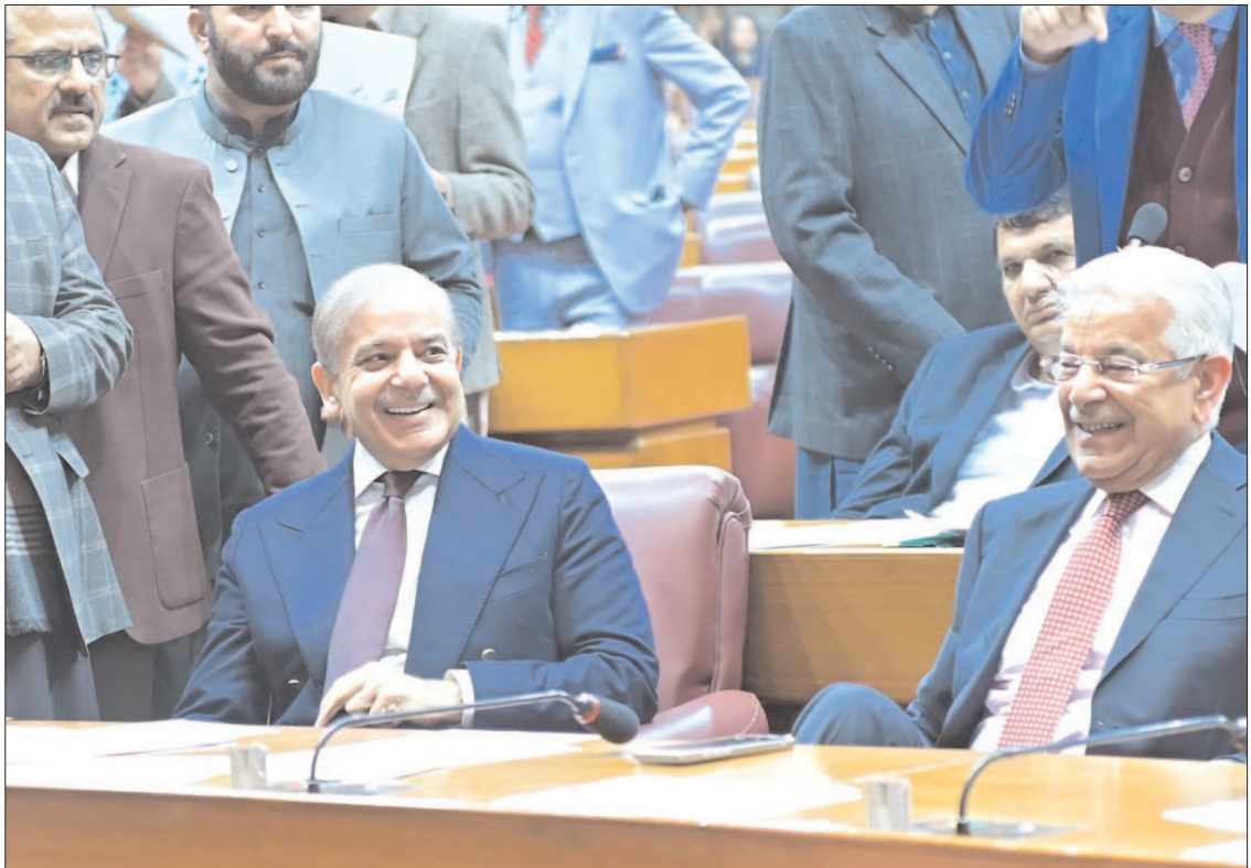
ISLAMABAD: Prime Minister Shehbaz Sharif attending National Assembly session.