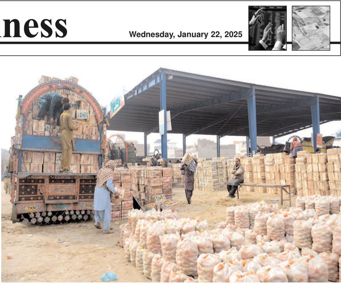
MULTAN: Labourers unloading tomatoes sacks from delivery truck at Vegetable Market.

The price of the Euro increased by Rs1.67 to close at Rs289.00 against the last day's closing of Rs287.33, according to the State Bank of Pakistan (SBP). The Japanese yen remained unchanged and closed at Rs1.78, whereas an increase of Rs1.50 was witnessed in the exchange rate of the British Pound, which was traded at Rs341.53 as compared to the last day's closing of Rs340.03. The exchange rates of the Emirates Dirham and the Saudi Riyal also increased by 05 paise and 04 paise to close at Rs75.91 and Rs74.30, respectively.