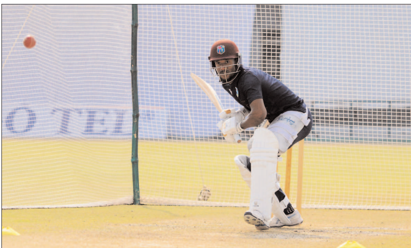
MULTAN: West Indies players attend a practice session ahead of the second Test Cricket Match against Pakistan at Multan Cricket Stadium.