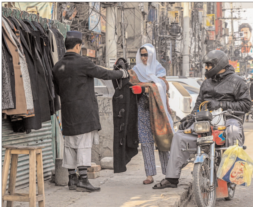
RAWALPINDI: A female customer selects a cozy coat from a vendor at the bustling Raja Bazaar.