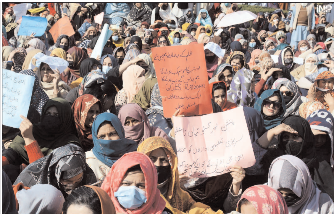
ISLAMABAD: All Government Employers Grand Alliance (ALEGA) Pakistan is protesting in front of Q Block Pak Secretariat in favor of their demands.

This groundbreaking partnership will roll out during the upcoming PSL season, with innovative content and impactful campaigns aimed at engaging the youth and raising awareness on the urgent need to address climate challenges.