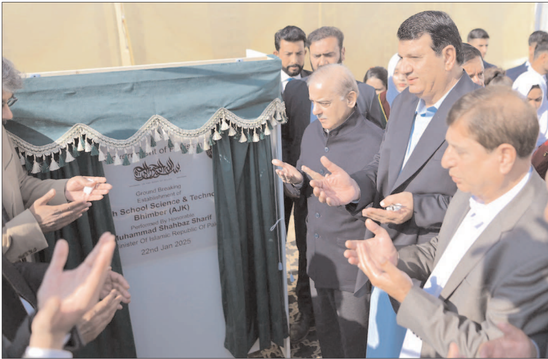
BHIMBER: Prime Minister Shehbaz Sharif lays foundation stone of Danish School.