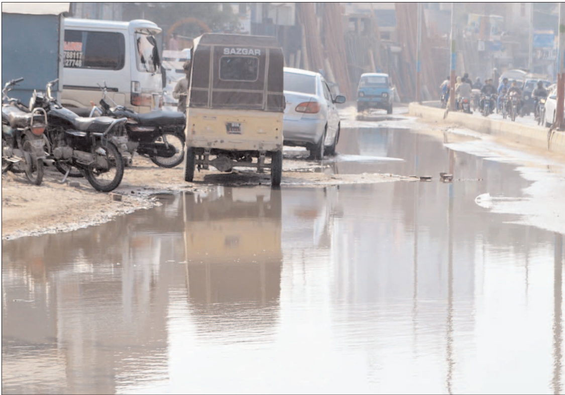
HYDERABAD: A view of accumulated sewerage water on main Makki Road.