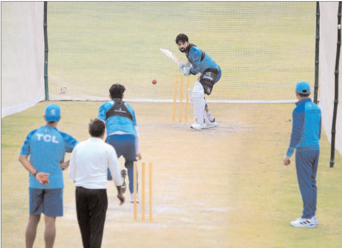
MULTAN: Pakistan's cricket team players attends a practice session ahead of the second Test Cricket Match against West Indies at Multan Cricket Stadium.