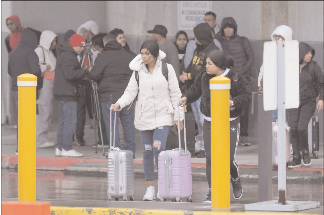
MEXICO CITY: Migrants seeking asylum leave an immigration office in Matamoros, Mexico, after their scheduled meetings were cancelled.