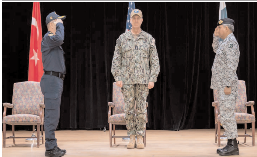
ISLAMABAD: Pakistan Navy assumes Command of Combined Task Force-151, during change of command ceremony held at Bahrain.

Secretary Interior, Chairman PTA, and Chairman PEMRA as ex-officio members. The chairman and five members will be appointed for a five-year term. It is worth noting here that the government has decided to give representation to journalists in the authority, with five members having at least 10 years of experience as journalists, software engineers, lawyers, social media professionals, and IT experts.