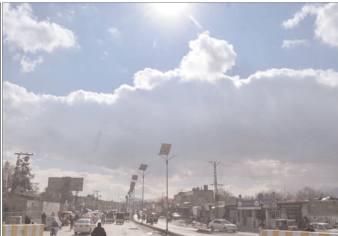
QUETTA: A view of sunny day after couples of cloudy weather in provincial capital.

The Additional Deputy Commissioner reviewed the performance of all Price Control Magistrates. He strictly directed the Price Control Magistrates to conduct field visits on daily basis to ensure implementation of the prices fixed by the district administration. He said that strict action will be taken against the shopkeepers selling essential items at prices higher than the fixed rates.