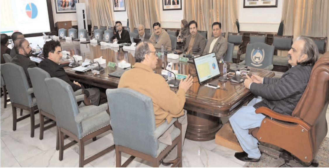
PESHAWAR: Khyber Pakhtunkhwa Chief Minister Ali Amin Khan Gandapur chairing a meeting regarding Peshawar-DI Khan motorway.

He conclude that as residents of this province, it is our responsibility to uplift it, as no one will come from outside to do so. Hence, the government values the services of investors and the business community in the province.