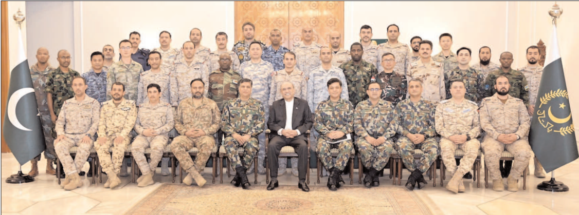
ISLAMABAD: President Asif Ali Zardari in a group photo with participants of 38th Air War Course, currently undergoing training at PAF Air War College Institute.

He made it clear that, those factories manufacturing and selling food items must comply with food safety standards at all cost. The Chief Minister further directed the Halal Food Authority and other concerned departments to improve their monitoring and checking systems. He emphasized that substandard and harmful products pose serious threats to public health, necessitating timely and effective measures for their prevention. He also stressed the need to launch massive public awareness campaign to educate people about avoiding substandard and harmful products. He also directed that a comprehensive plan should be devised to enforce compliance with food safety standards among factories producing edible products. Subsequently, industries failing to comply standards will face heavy fines and bans.