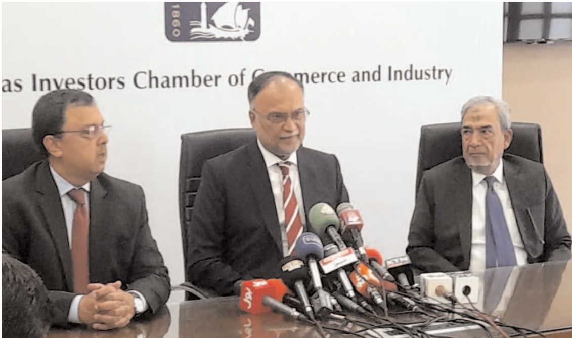
KARACHI: Federal Minister for Planning, Development and Special Initiatives Ahsan Iqbal addressing media after attending session with members Overseas Investors Chamber of Commerce and Industry.

"Our goal is to enhance Pakistan's Human Development Index (HDI) by improving healthcare, education, and population growth rates. This requires a coordinated approach, and the newly established National Economic Transformation Unit will ensure rigorous monitoring and delivery," he added. The minister concluded by emphasizing the government's vision for exponential progress, urging all stakeholders to work together as "Team Pakistan" to achieve a brighter, self-reliant future. "Uraan Pakistan is not just an initiative; it is a mission to redefine our nation's potential," he stated.