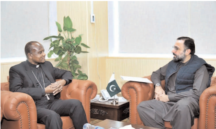
ISLAMABAD: Ambassador Vatican City Archbishop Germano Penemote meeting with Federal Minister for Religious Affairs and Inter-Faith Harmony Chaudhary Salik Hussain.

The civil society has urged the government to expand this initiative to other parts of the country, particularly in rural areas where girls' education is severely impacted by lack of access to transportation.