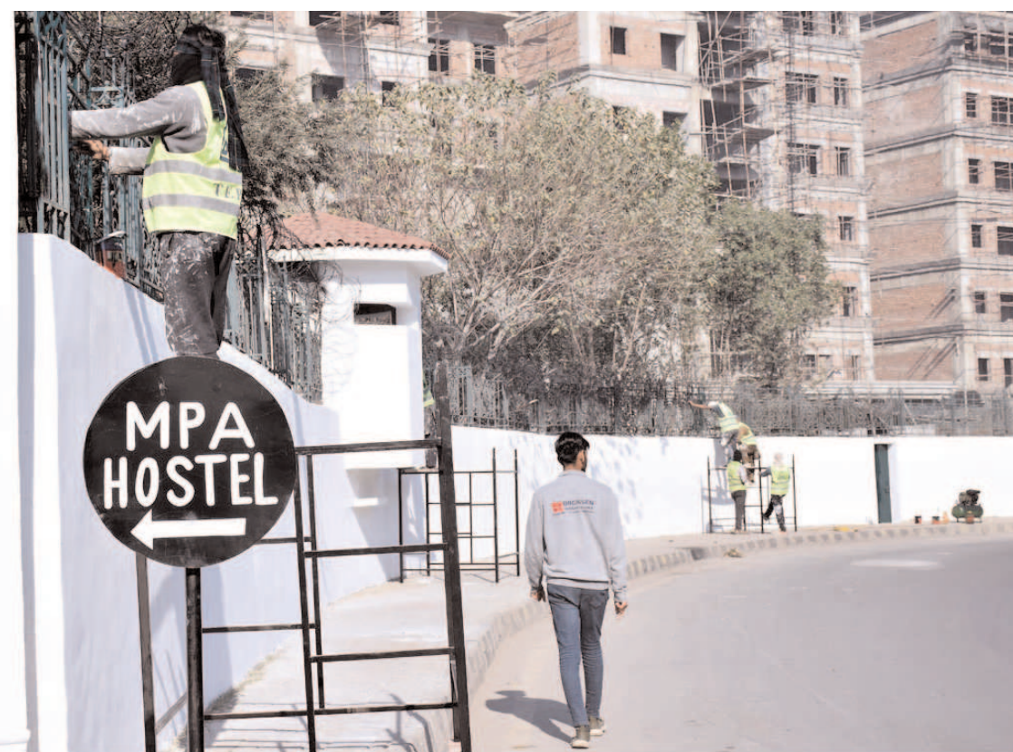
LAHORE: Labourers busy in construction work of MPA Hostel Punjab Assembly.