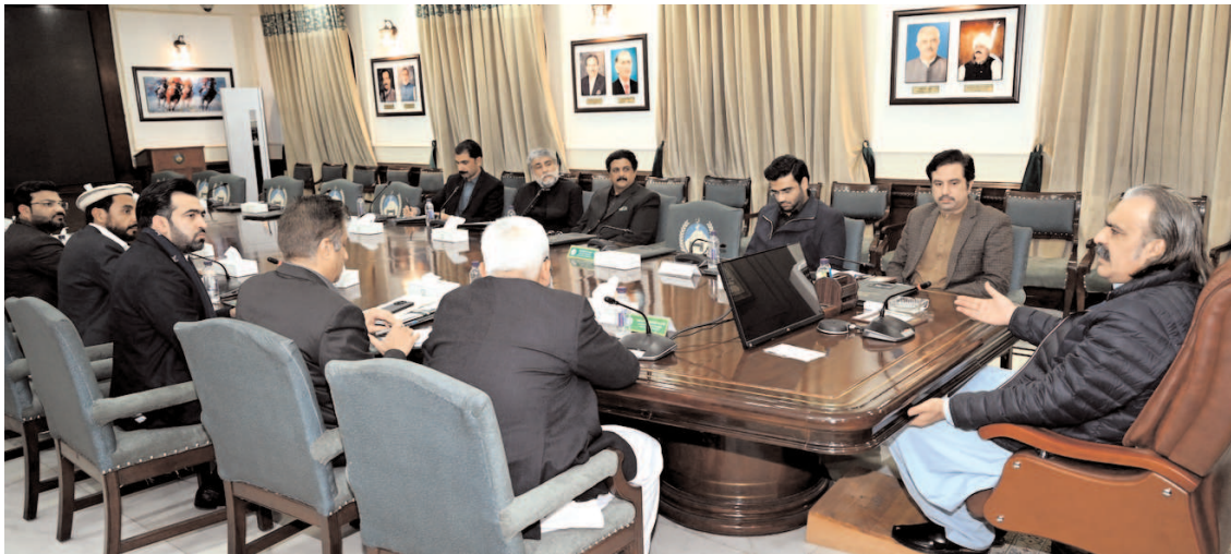
PESHAWAR: Chief Minister Khyber Pakhtunkhwa Ali Amin Khan Gandapur chairing a meeting with delegation of Federation of Pakistan Chambers of Commerce and Industry.