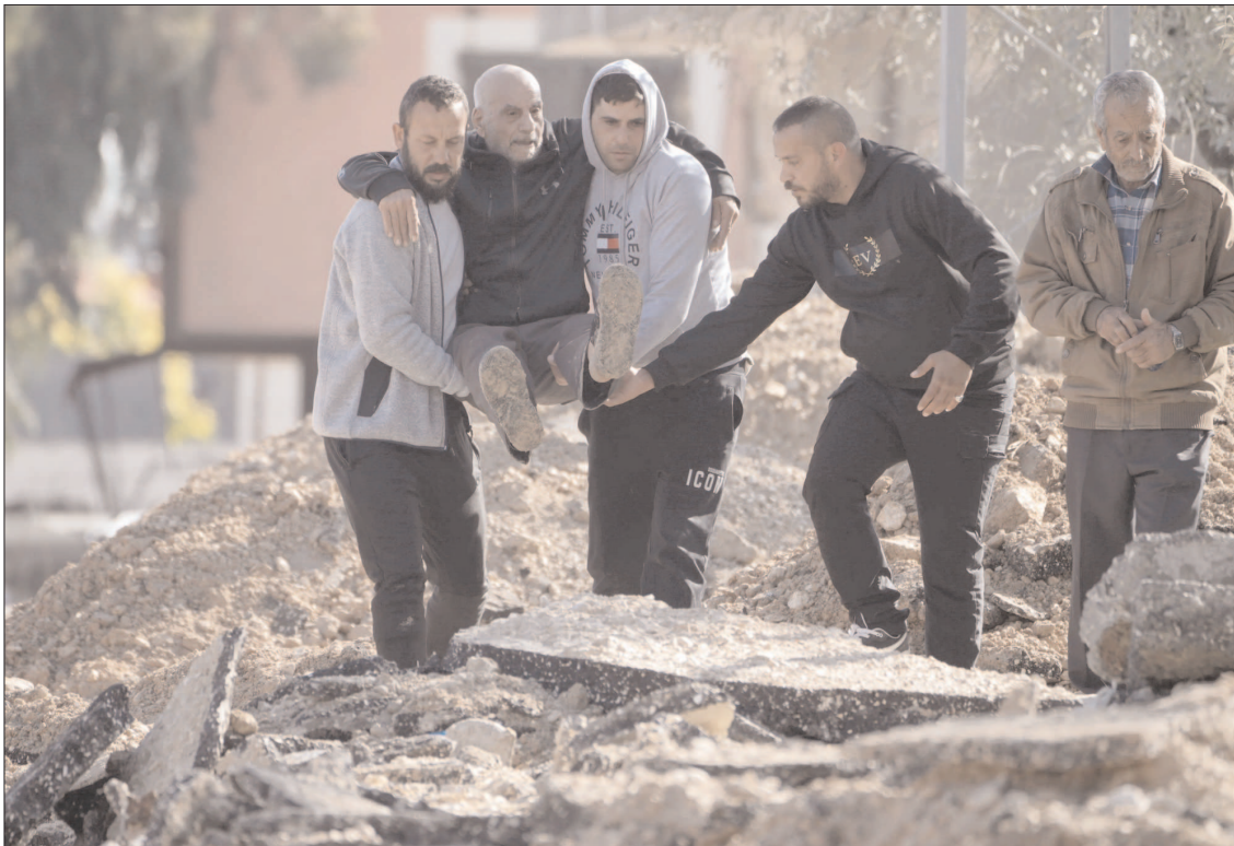
WEST BANK: Palestinians displaced by an Israeli military operation evacuate from refugee camp carrying an elderly man over rubble.