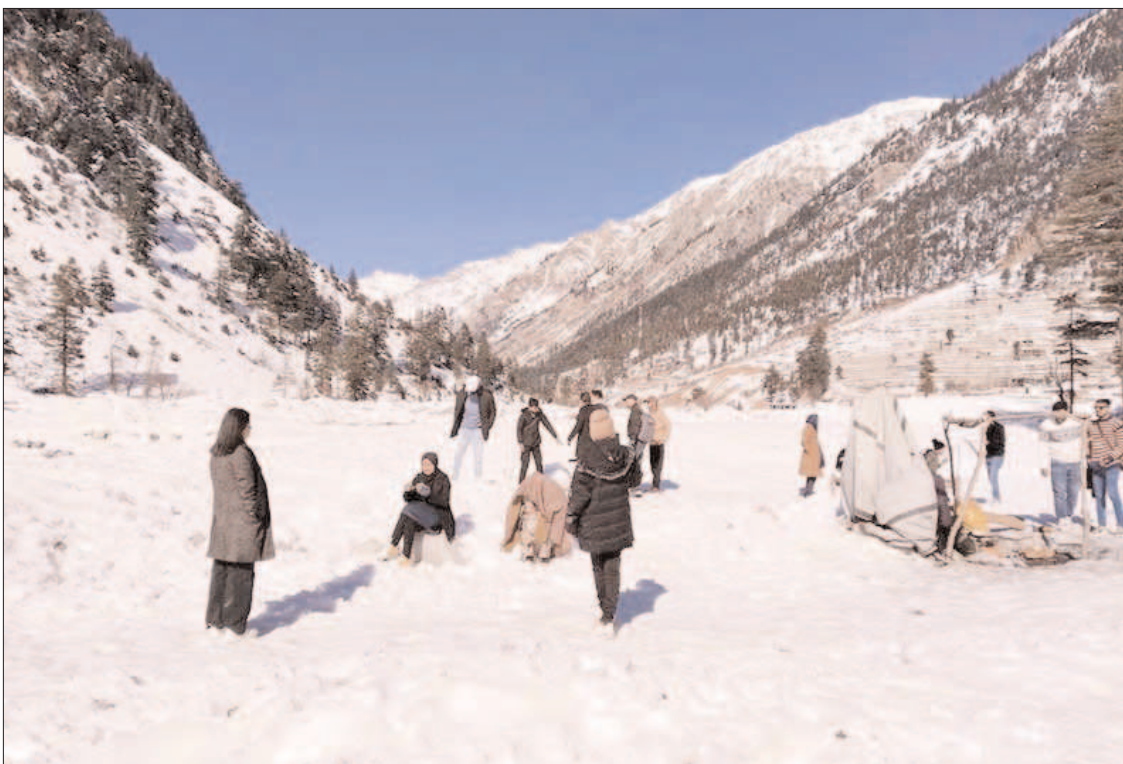
KALAM: Tourists enjoying a day on snow at Panjota Picnic Point during their visit.