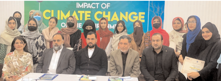
PESHAWAR: Provincial Minister for Higher Education Meena Khan Afridi in a group photo with participants of five-day national workshop.

PESHAWAR (APP): In an ongoing campaign against professional beggars, 68 individuals were detained in Peshawar and transferred to Dar-ul-Kafala. According to a statement issued by the office of Commissioner Peshawar Division here on Saturday, the operation was being conducted under the supervision of Commissioner Riaz Khan Mehsud, as part of Chief Minister Khyber Pakhtunkhwa Ali Amin Gandapur's public agenda. Among those detained were 32 children, 25 women, and 11 men. The Commissioner emphasized that the operation would continue even during weekends to make provincial capital free of beggars.