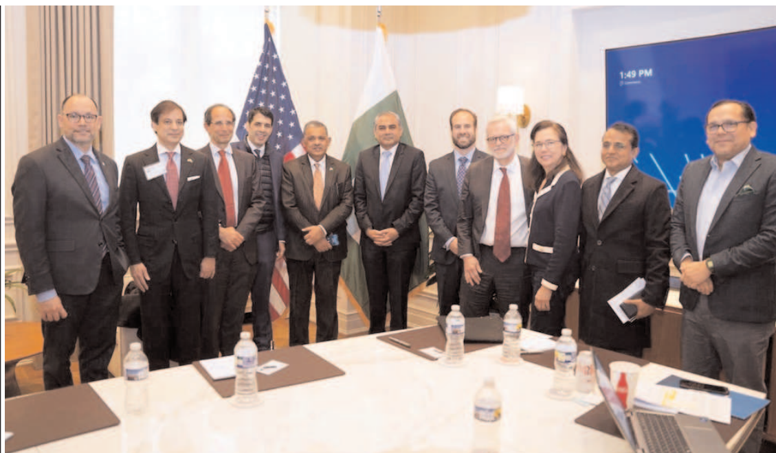
WASHINGTON: Federal Minister for Interior Mohsin Naqvi in a group photo with a high-level delegation from US-Pakistan Business Council.

The PPP is making every effort to uphold the Constitution, ensure the rule of law, and protect freedom of expression, especially concerning amendments to the PECA Act, which could undermine this fundamental right. The People's Trade Forum, following Bhutto's philosophy, continues to serve the business community and advance the party's mission.