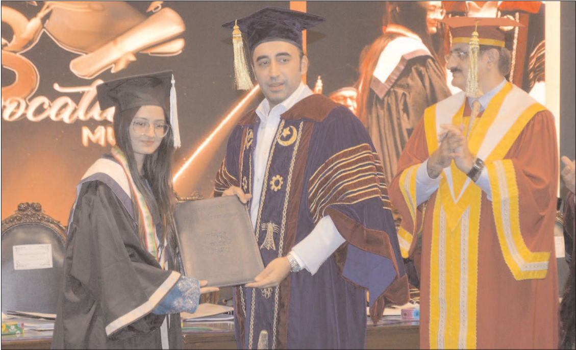
JAMSHORO: Chairman Pakistan People’s Party, Bilawal Bhutto Zardari awarding degrees and medals to students in the convocation of Mehran University of Sindh.