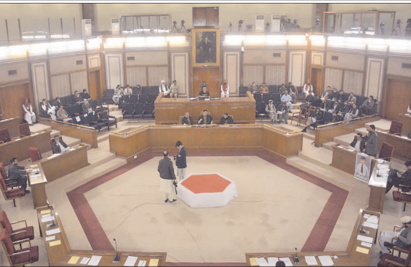
QUETTA: Speaker of Balochistan Assembly, Abdul Khaliq Khan Achakzai chairing session.

One New Year's Day tradition - the classic college football known as the Sugar Bowl - was rescheduled for Thursday afternoon at Caesars Superdome, less than a mile from Bourbon Street and Canal, where the truck attack unfolded. Kickoff for the game between Notre Dame and Georgia was put off for nearly 24 hours while police swept parts of the city looking for possible explosive devices and converged on neighborhoods in search of clues. The city will also host the NFL Super Bowl on Feb. 9, an event that will bring tens of thousands of fans to the area.