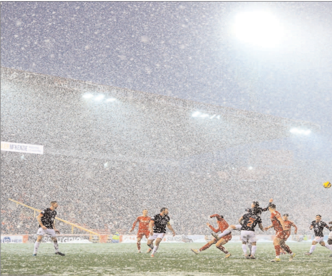
ABERDEEN, SCOTLAND: A general view of match action in the snow during a William Hill Premiership match between Aberdeen and Ross County at Pittodrie, on Thursday, in Aberdeen, Scotland.