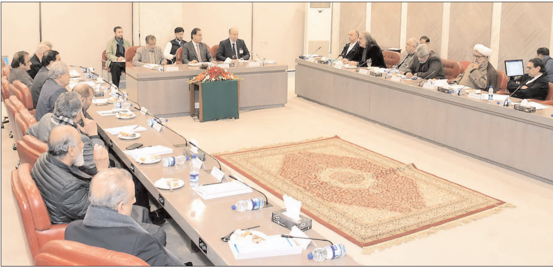
ISLAMABAD: Speaker National Assembly, Sardar Ayab Sadiq chairing second meeting on negotiations between treasury and opposition at Parliament House.