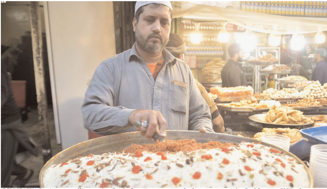
PESHAWAR: A man selling gajar ka halwa (a sweet made from carrots) in Saddar.

ity's success to teamwork and credited the leadership of Chief Minister Ali Amin Khan Gandapur and Food Minister Zahir Shah Toru. Saeed remarked, "Under their visionary leadership, the authority has achieved remarkable progress in establishing cutting-edge facilities and ensuring public health." KP Minister for Food Zahir Shah Toru praised the authority's performance, stating, "The establishment of advanced testing equipments is a significant step towards ensuring food safety. In 2025, we aim to introduce further modern testing equipments to continue improving food standards to ensure public health."