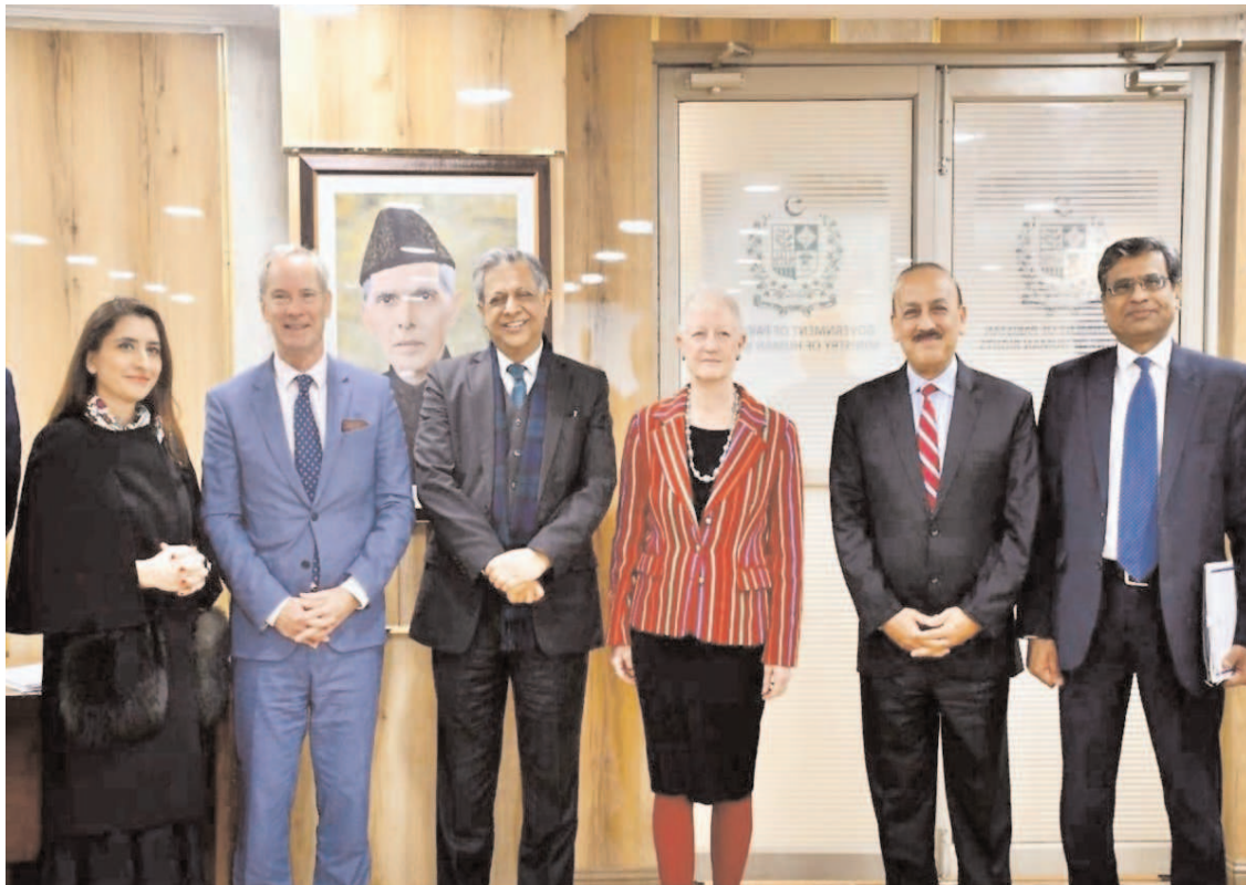
ISLAMABAD: A European Union (EU) delegation led by Ambassador Olof Skoog met with Senator Azam Nazeer Tarar, Federal Minister for Law, Justice, and Human Rights, at the Ministry of Human Rights.