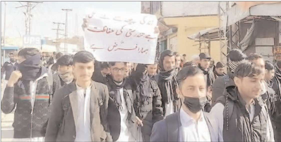
LANDI KOTAL: Students and members of civil society holding narcotics awareness walk.