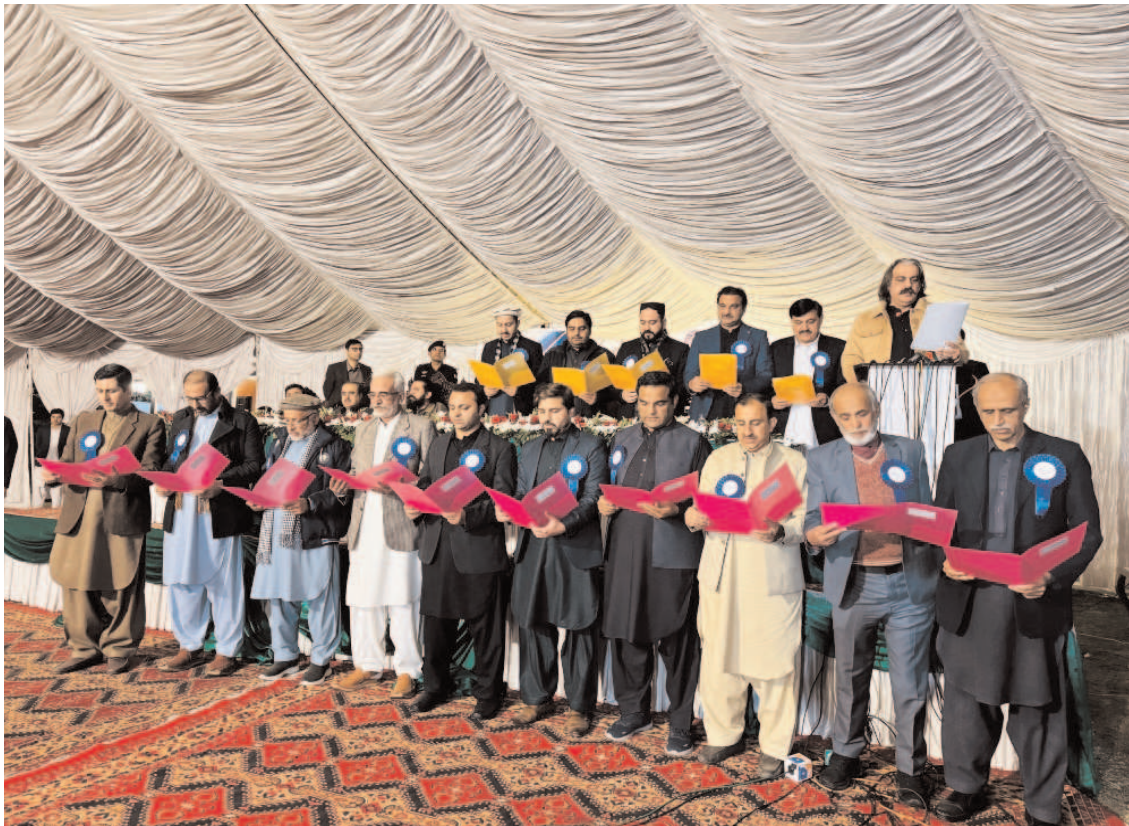
PESHAWAR: Khyber Pakhtunkhwa Chief Minister Ali Amin Khan Gandapur administering oath to the newly elected cabinet of Peshawar Press Club.

Further discussions included the recommendations of the Finance and Planning Committee's meetings, which were likewise presented for final approval. Governor Faisal Karim Kundi, in his address, emphasized the importance of quality education as the key to progress in the modern world. "It is crucial that educational institutions align with modern technology and research to stay relevant," he said.