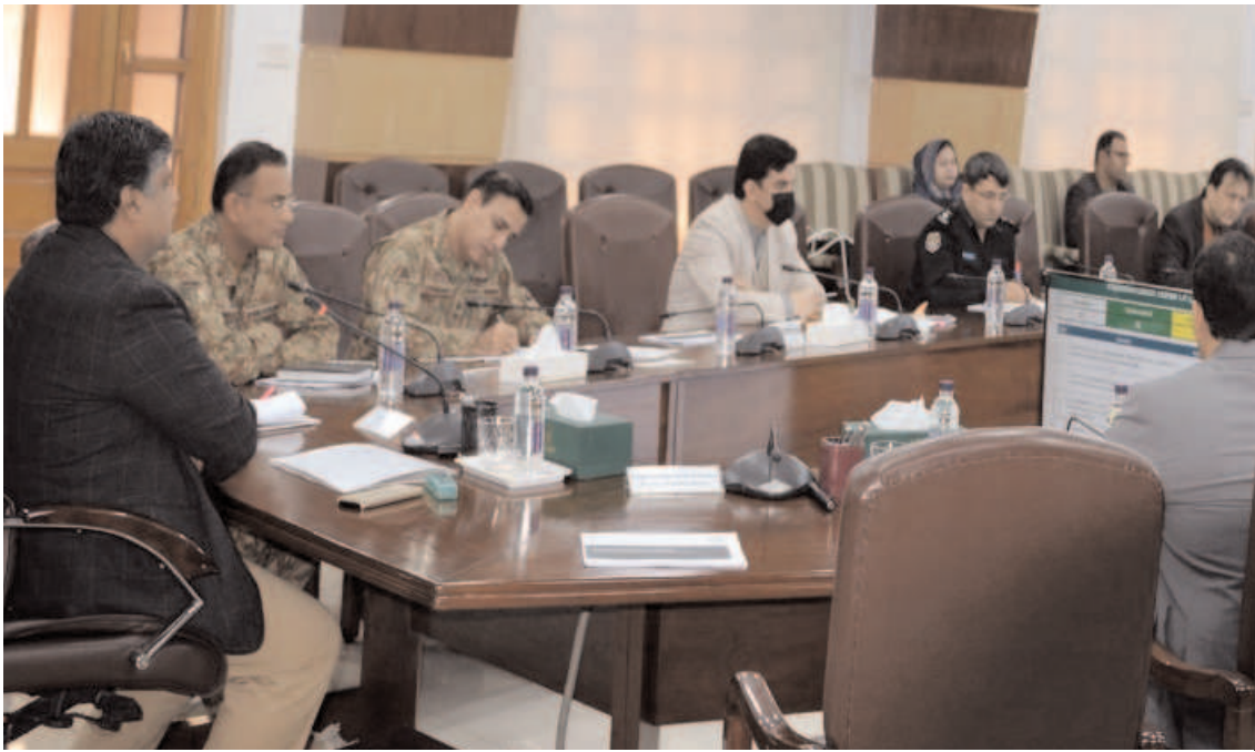
PESHAWAR: Chief Secretary Khyber Pakhtunkhwa, Nadeem Aslam Chaudhary chairing a meeting of the Provincial Task Force on Polio Eradication.