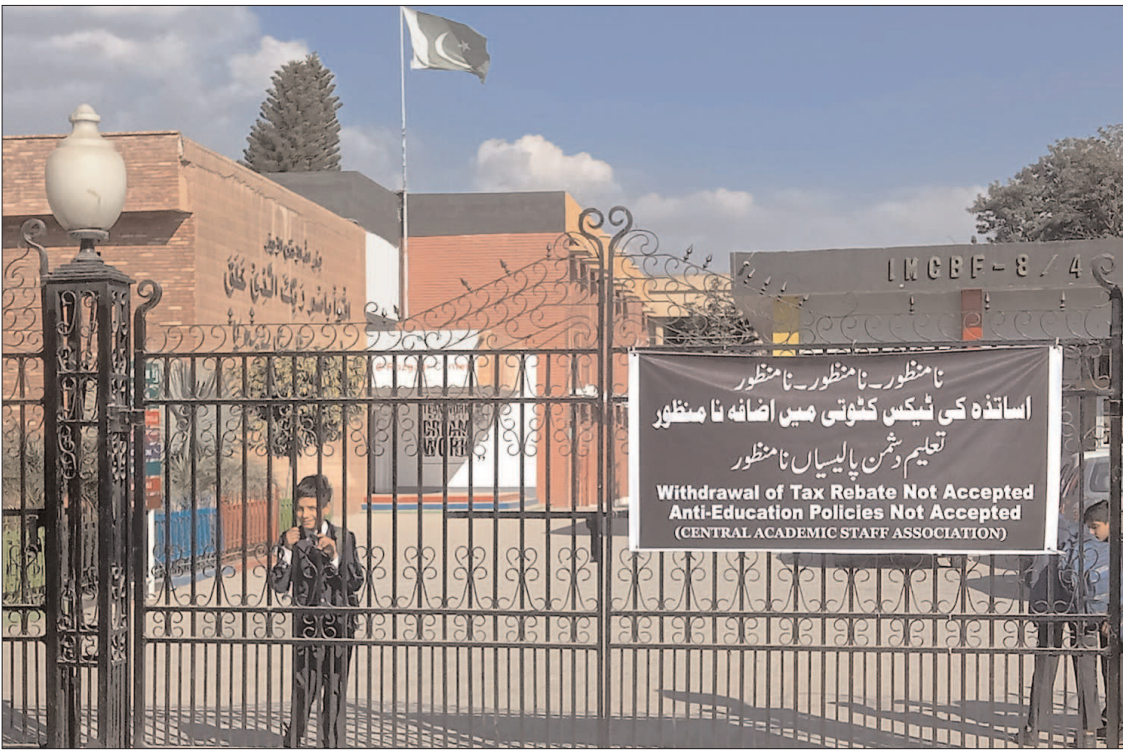
ISLAMABAD: A banner installed on school gate against increase on tax deduction from teachers' salaries.

Briefing about the performance of Anti-Narcotics Force (ANF), it was informed that the conviction rate for drug offenders in the last year was 81%. Similarly, 242 Pakistani nationals and 6 foreigners were arrested for drug smuggling by ANF Khyber Pakhtunkhwa last year. The Chief Minister commended the efforts of the ANF and expressed hope that ongoing measures will yield significant results in the fight against drug addiction.