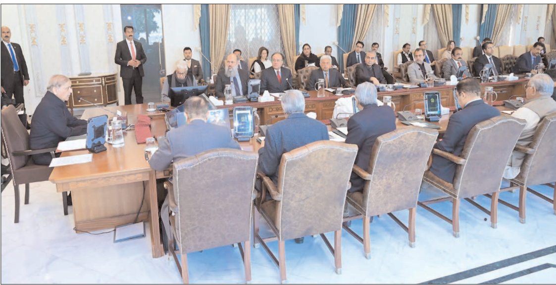
ISLAMABAD: Prime Minister Shehbaz Sharif chairing the federal cabinet meeting.