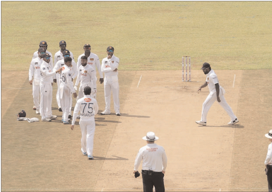
GALLE, SRI LANKA: Sri Lankan team enjoys after taking wicket of Steve Smith of Australia after he was dismissed by Jeffrey Vandersay during day two of the First Test match.