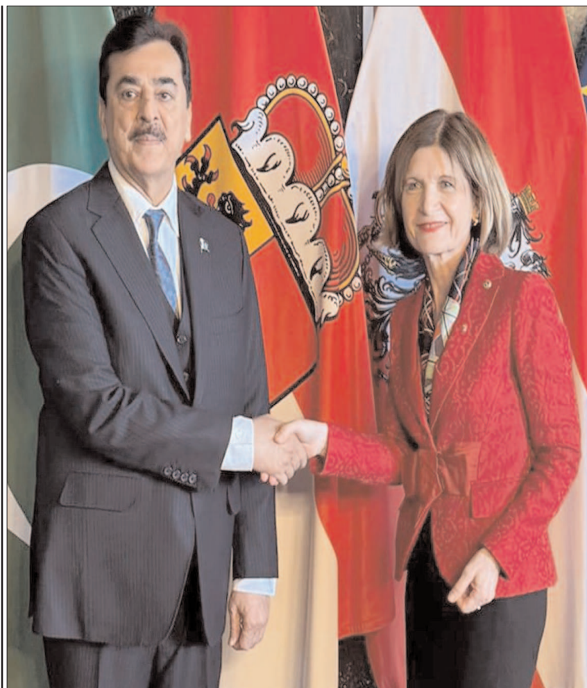
VIENNA: Chairman Senate, Syed Yousaf Raza Gilani shaking hands with Andrea Eder-Gitschthaler, President of Federal Council of Austria.