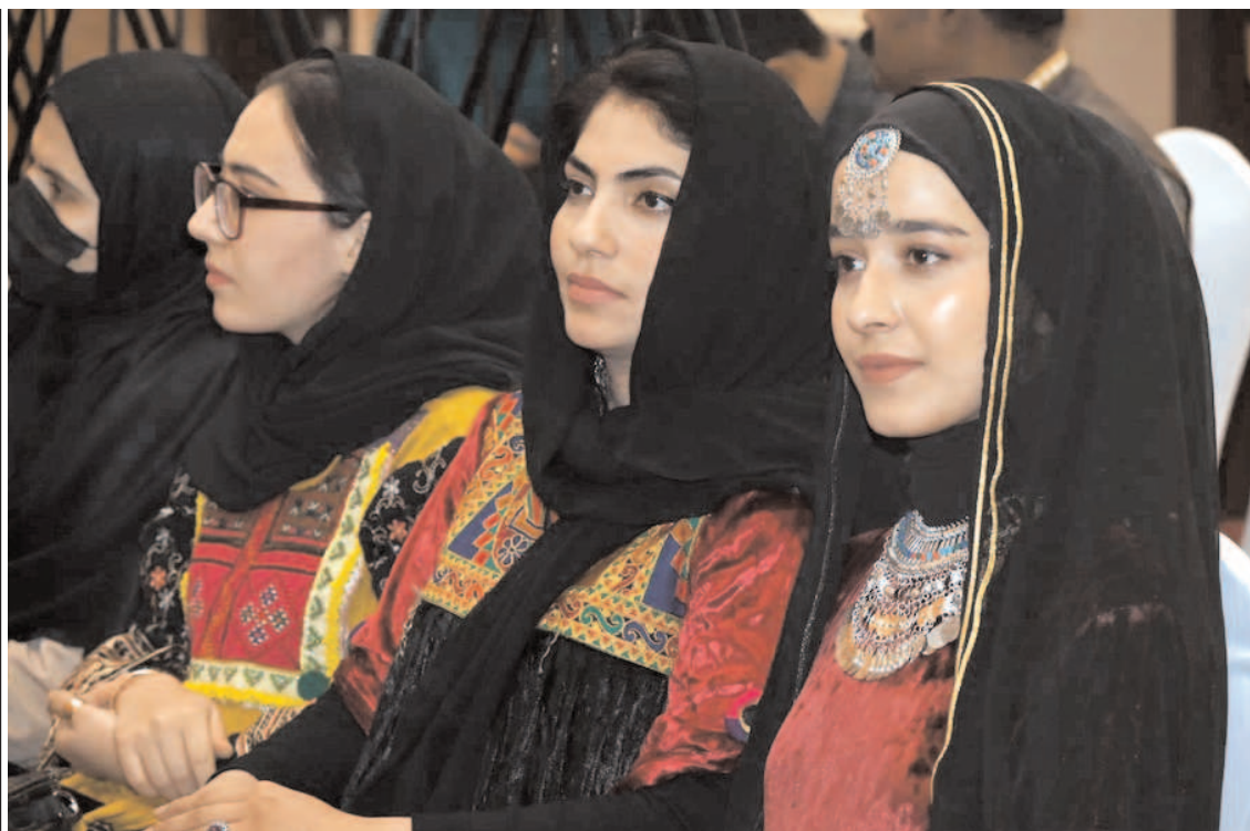
ISLAMABAD: Women attending Migration Media Awards 2025 “Raising Awareness on Migration Through Media Report in Pakistan”.