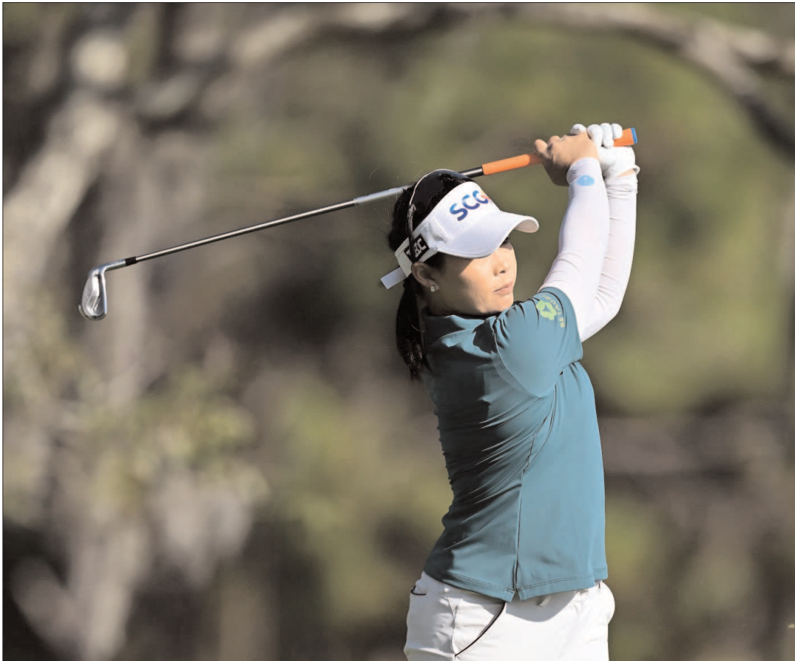
ORLANDO, FLORIDA: Moriya Jutanugarn of Thailand plays her shot from the 13th tee during the first round of the Hilton Grand Vacations Tournament of Champions 2025 at Lake Nona Golf & Country Club on Thursday in Orlando, Florida.

The portal will be continuously enriched with new content and will urge athletes to express their opinions in order to make it a very interactive platform. It is a major tool to empower and engage with athletes the way forward.