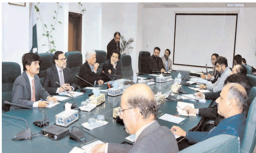
ISLAMABAD: Federal Minister for Industries and Production, Rana Tanveer Hussain chairing a Cabinet Committee meeting on closure of Utility Stores Corporation operations.