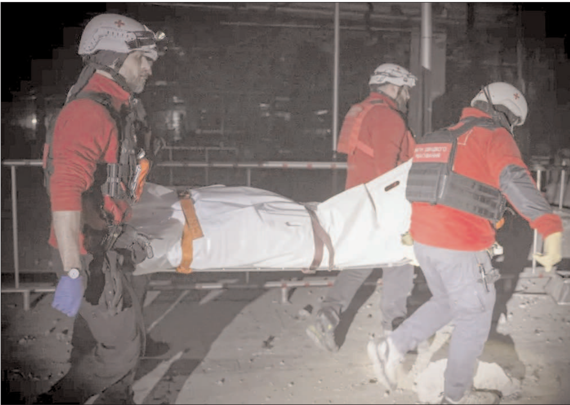
KYIV: Rescuers carrying body of a civilian who was killed when a Russian drone hit a city food factory in Mykolaiv, Ukraine.

That has provoked a contest for influence over Kiribati, an atoll nation that is among the world's most imperiled by rising sea levels. Its proximity to Hawaii and its vast exclusive economic zone - the world's 12th largest - have boosted its strategic importance. Kiribati, one of the world's most aid-dependent nations, relies heavily on international support, with foreign assistance accounting for 18% of its national income in 2022, according to data from the Lowy Institute, an Australian think tank. About 10% of development finance that year came from New Zealand - which contributed 102 million New Zealand dollars ($58 million) between 2021 and 2024, official figures show.