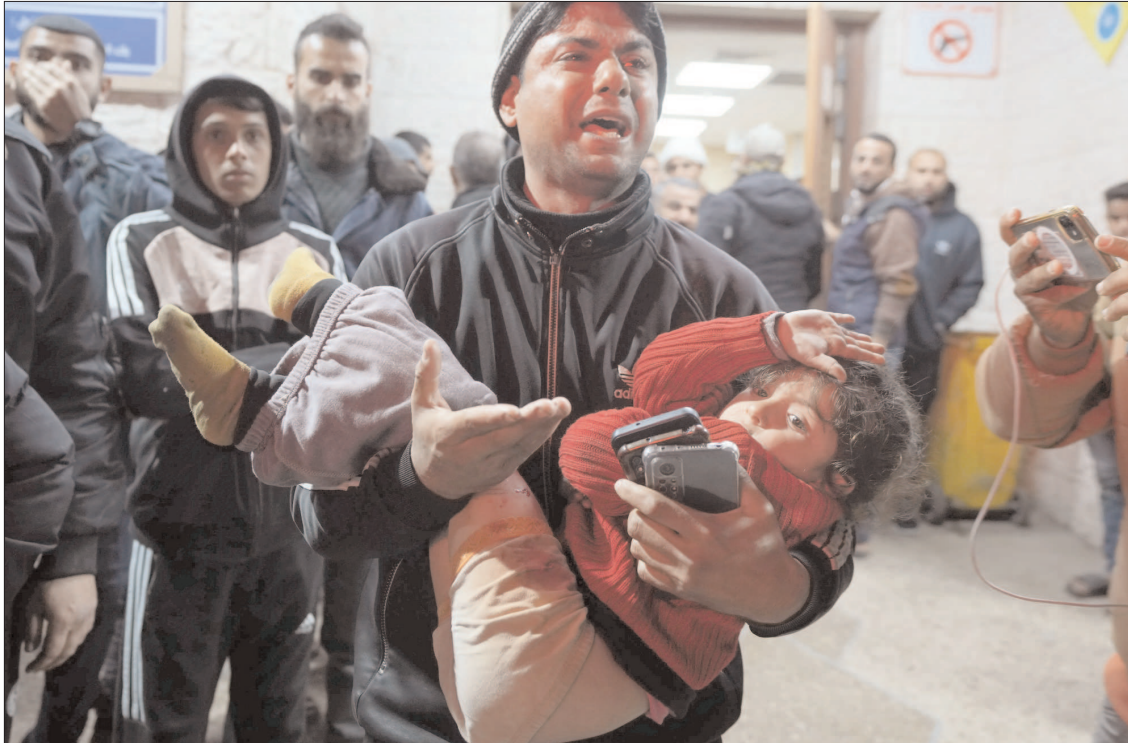
GAZA: A man carrying a wounded girl to Al-Aqsa Martyrs Hospital following Israeli air attacks in Deir el-Balah.