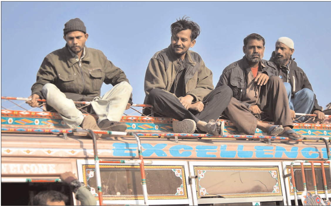
KARACHI: A view of passengers sitting on the roof top of the bus while travelling in city cause any incident.