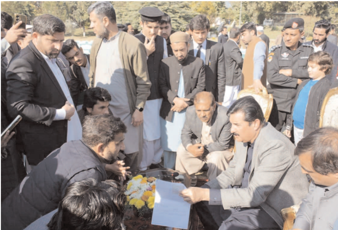
PESHAWAR: Khyber Pakhtunkhwa Governor Faisal Karim Kundi listening to the problems of the people during 2nd Public Day at Governor's House.