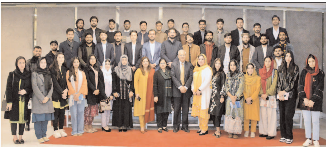
ISLAMABAD: A group photo of the students and faculty members of the Quaid-I-Azam University, Islamabad at Parliament House.

The representatives from Pakistan Environmental Protection Agency (PEPA), Water and Sanitation Agency (WASA), and the Capital Development Authority (CDA) were in attendance.