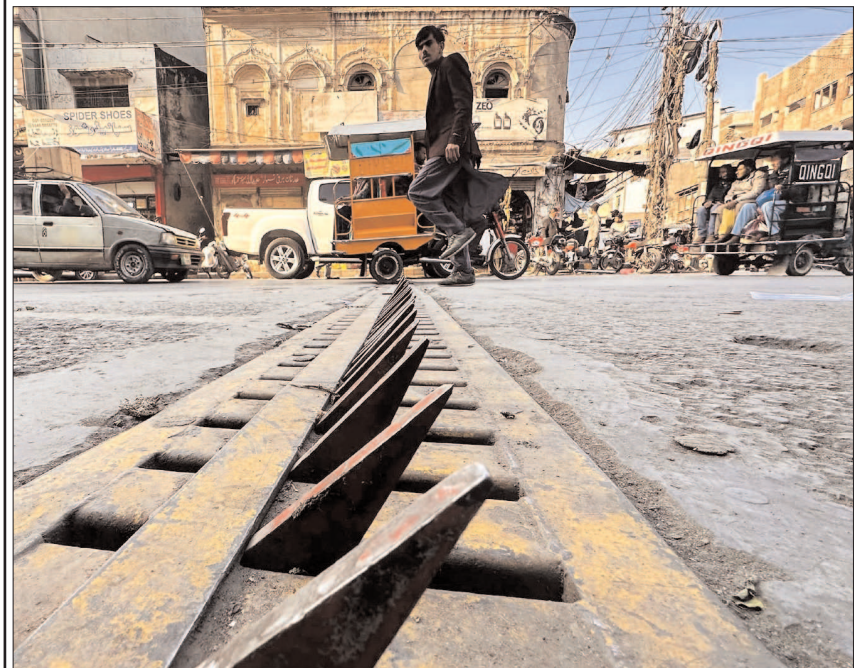
RAWALPINDI: A view of spike barrier install on Dingi Khoi bazaar for indicates on side road for traffic, mostly bikers injured on night time when they cross road wrong side.

He stressed the significance of leveraging technology to provide seamless experiences for travelers.