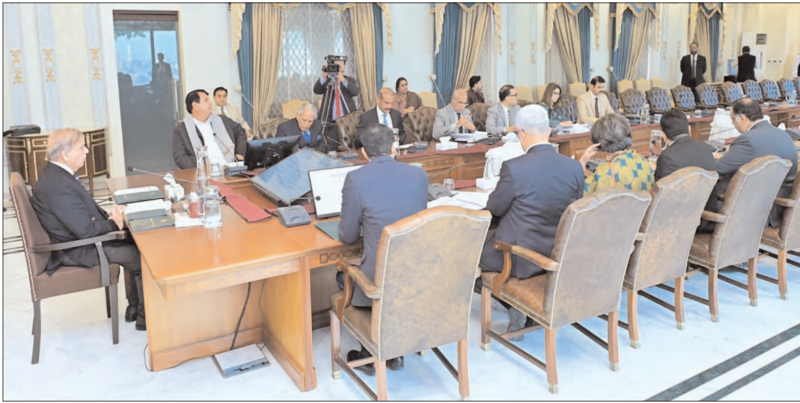
ISLAMABAD: Prime Minister Shehbaz Sharif chairing a meeting on progress upon the measures taken against human trafficking.

Vol. XXXIXI No. 345 Regd. No. 241 RAJAB 07 1446 -- TUESDAY, JANUARY 07 2025 PESHAWAR EDITION 12 PAGES PRICE. 30