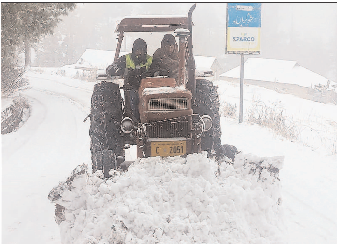
KAGHAN: Workers removing snow with the help of tractor to clear Shogran Road.