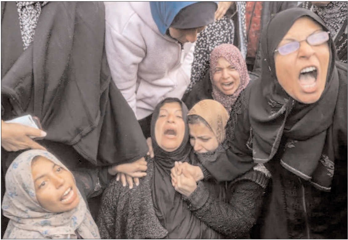
GAZA STRIP: Women mourning their relatives who were killed by Israeli bombardment outside the Al-Aqsa Martyrs Hospital in Deir el-Balah.