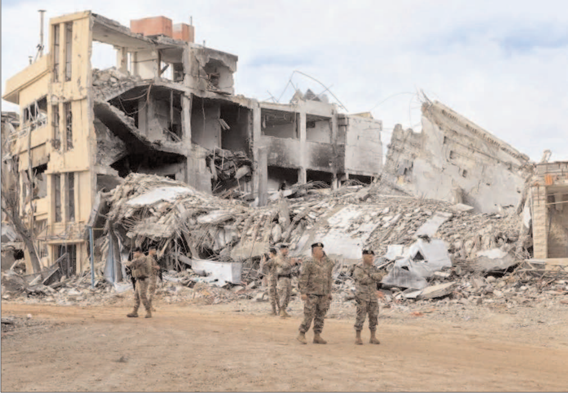
BEIRUT: Lebanese soldiers standing near a damaged site in Khiam village after Israeli strikes.

The French government hasn't linked the tensions with Algiers to the three arrests. French Foreign Minister Jean-Noël Barrot said that France wants "the best relations" with Algeria. But he said Paris has doubts about the Algerian government's commitment to deals agreed in 2022 that were seen as important steps toward mending their relationship.