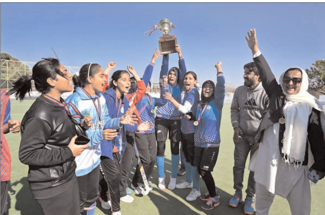
ISLAMABAD: Winning players of Lahore board hockey team lifting trophy after hockey match between Mardan and Lahore Boards the Inter-Board Girls Gala organized by the Federal Board of Intermediate and Secondary Education at Naseer Bunda Hockey Stadium Pakistan Sports Board.

Ruman Raees (Islamabad United), Hasan Ali, Shan Masood and Zahid Mehmood (all Karachi Kings), Abdullah Shafique (Lahore Qalandars), Faisal Akram (Multan Sultans).