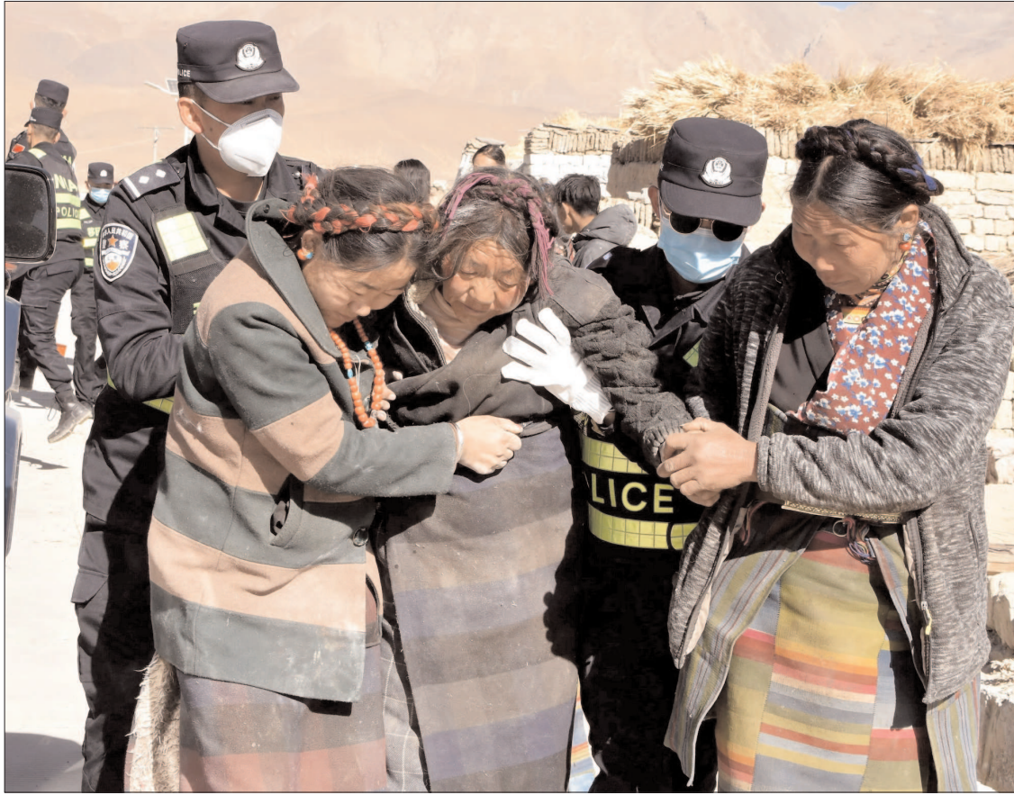
BEIJING: Rescuers transfer injured people in the village of Zhacun, Dingri County, Tibet, China.