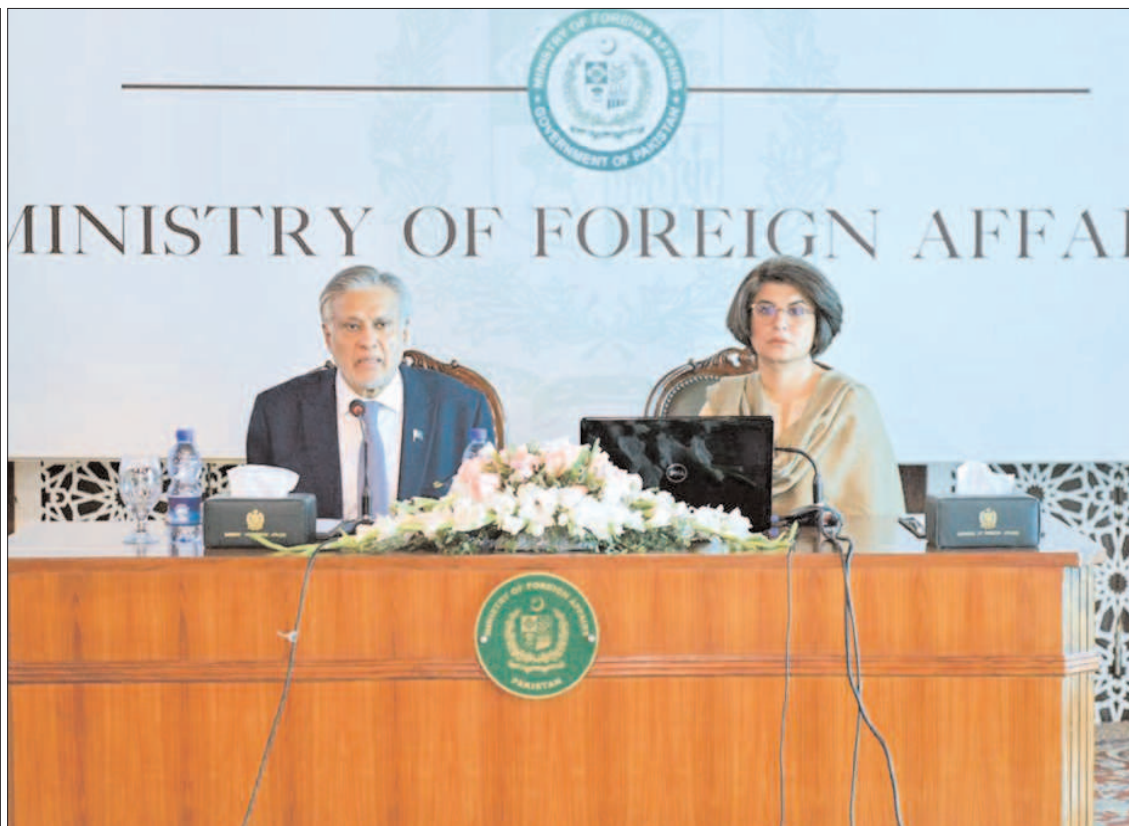
ISLAMABAD: Deputy Prime Minister and Foreign Minister Senator Mohammad Ishaq Dar addressed the trainees of the 52nd Common Training Programme who visited the Ministry of Foreign Affairs.

He informed that the DG has urged the citizens not to invest in illegal housing projects and check status of the schemes at RDA website: www.rda.gop.pk .