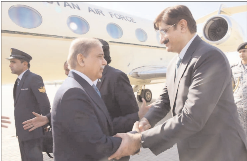
KARACHI: Chief Minister of Sindh, Syed Murad Ali Shah receiving Prime Minister Shehbaz Sharif during arrival at Port City.