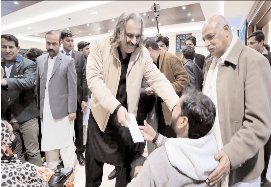
PESHAWAR: Chief Minister of Khyber Pakhtunkhwa, Ali Amin Gandapur distributing cheques among special persons during launching of Financial Assistance Program.