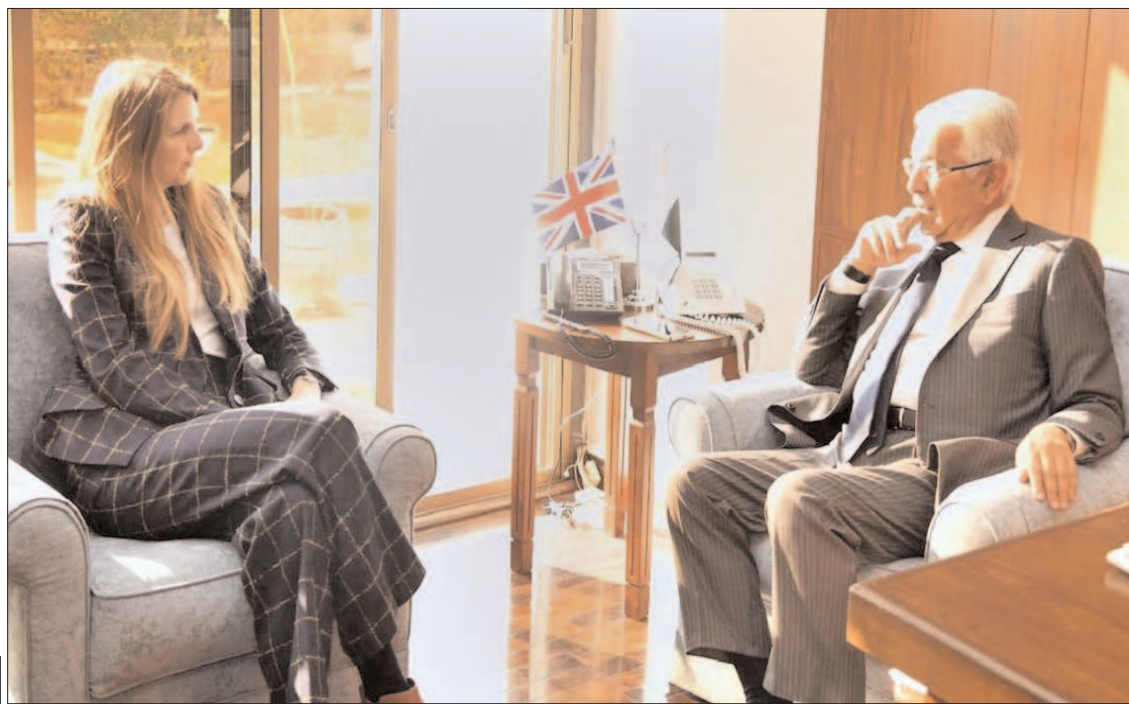
ISLAMABAD: H.E. Ms. Jane Marriott, British High Commissioner called on Minister for Defence, Defence Production and Aviation, Khawaja Muhammad Asif in federal capital.

She also recognized the role of the Rawalpindi Chamber of Commerce and Industry in launching the project, noting the business community's vital contribution to fostering a green economy. "The private sector's participation in sustainability efforts is essential to driving the economic transformation we need," she emphasized. "I encourage businesses of all sizes to adopt green prac-