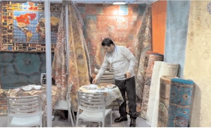
largest international event aimed at attracting long-term customers, where 19 countries are showcasing

KABUL (BNA): The Ministry of Industry and Commerce announced the opening of the largest International Carpet and Flooring EXPO 2025, Istanbul, Turkey. According to the Ministry of Industry and Commerce, the exhibition titled "Carpet and Flooring EXPO 2025" was inaugurated in Istanbul, Turkey, with the presence of representatives from the Ministry, the Consul General of the Islamic Emirate of Afghanistan in Istanbul, the Afghan Trade Attaché in Turkey, and the board members and CEO of the Union of Carpet Producers and Exporters of Afghanistan. This exhibition is the