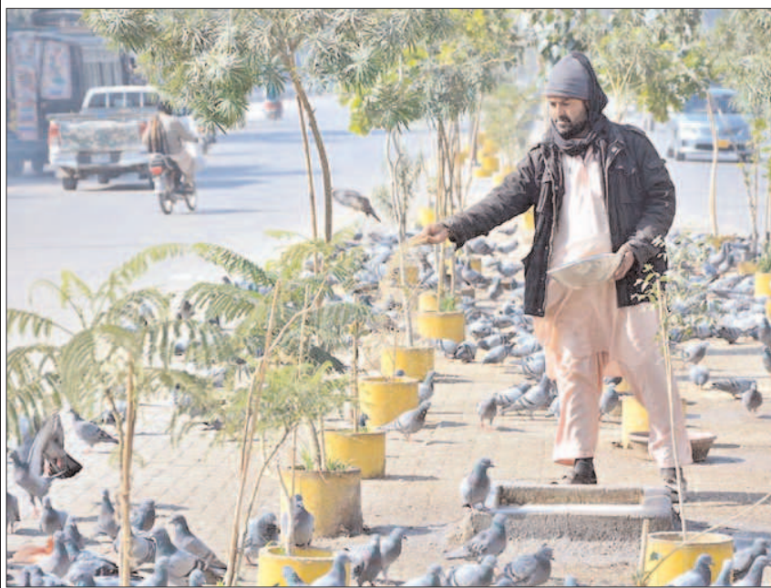
HYDERABAD: A person throwing food for pigeons on footpath at Jail Road.