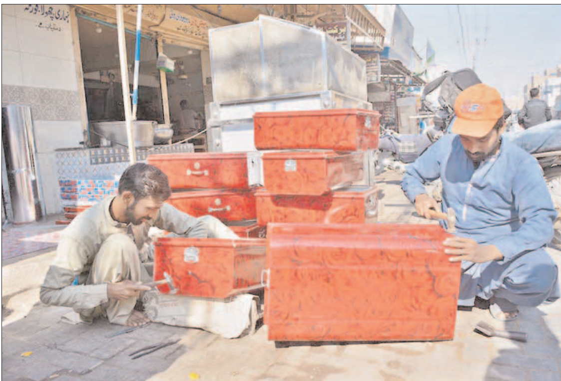
HYDERABAD: Workers busy preparing the metal iron boxes at their workplace.