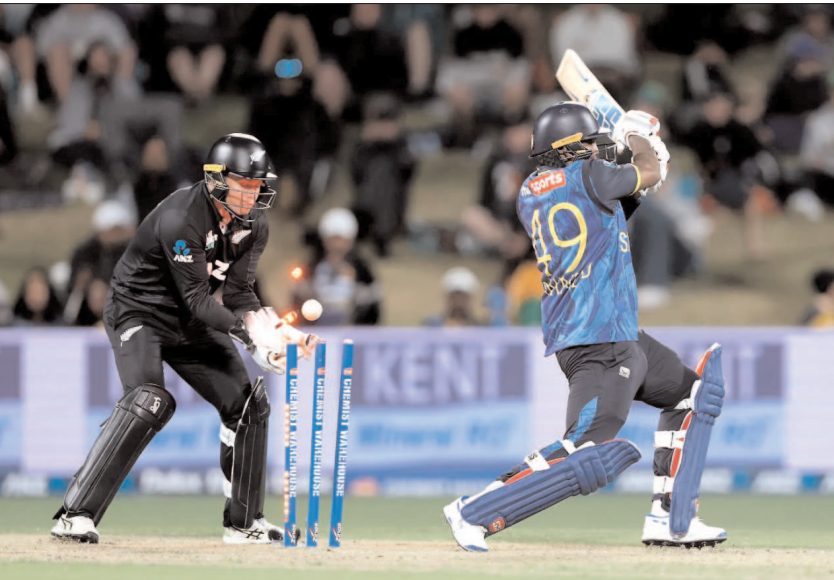
HAMILTON: Wanindu Hasaranga was bowled by Mitchell Santner for 1 off 3.

"He is one of the best cricketers in the T20 format and I really enjoy seeing him batting," he said. "I am very excited to be part of this team, and I want to share the crease with him. He is one of the best players, so I am very excited to play with him."