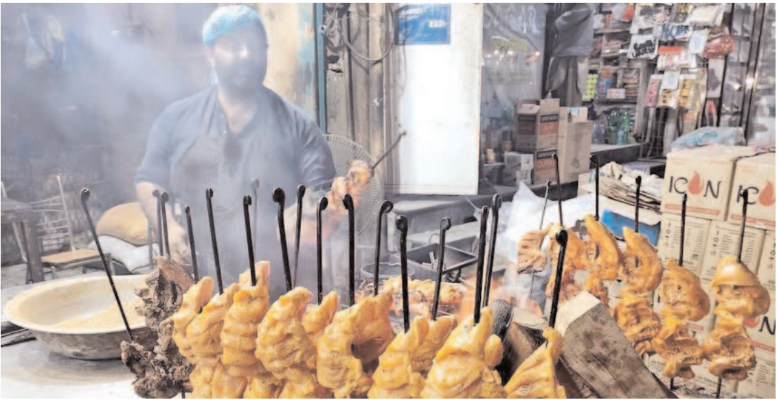
LARKANA: A vendor preparing traditional Balochi Chicken Sajji outside his restaurant.