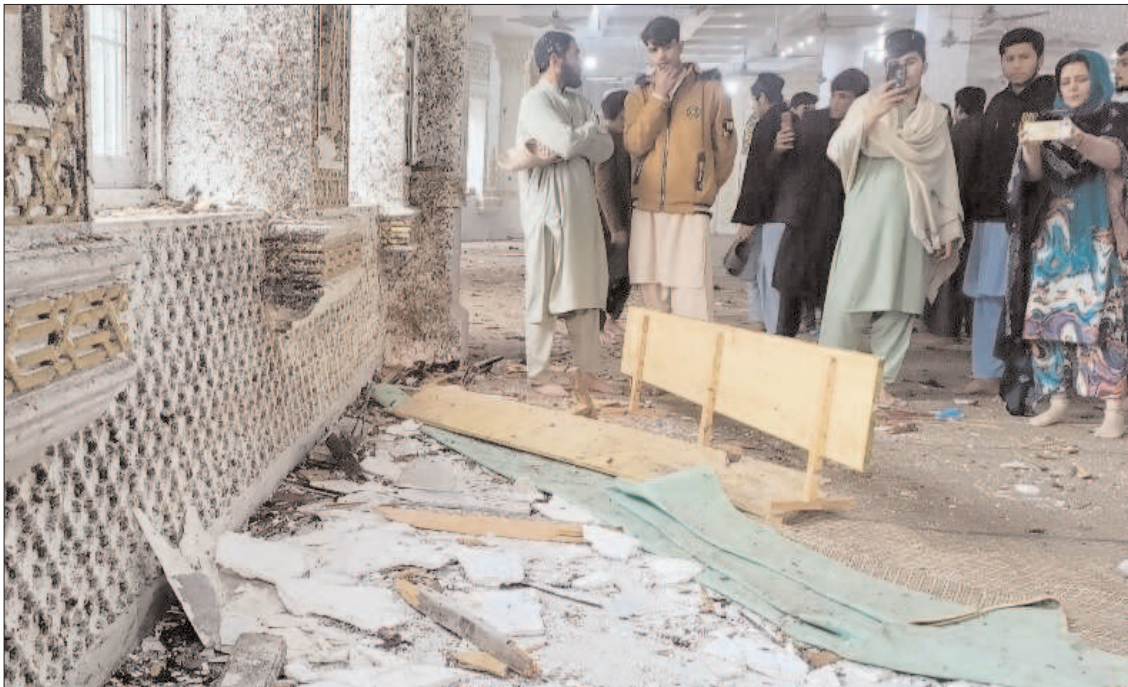
NEWSHERA: People gathered after a suicide blast at Dar-ul-Uloom Haqqania in Akora Khattak.