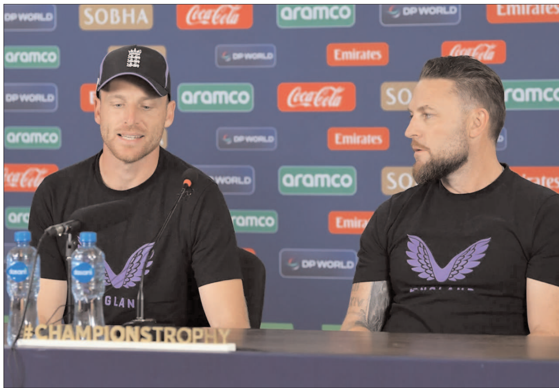
LAHORE: Jos Buttler announced his resignation alongside Brendon McCullum.