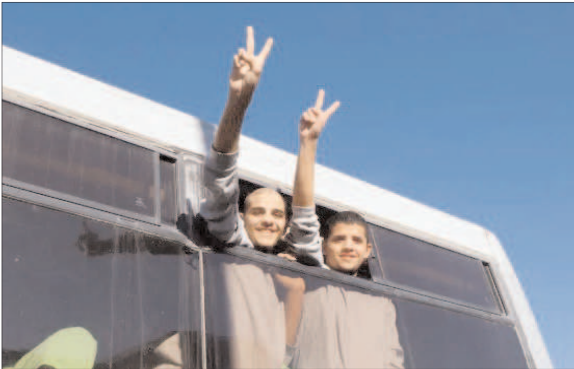
GAZA: Freed Palestinian prisoners flash a peace sign in Khan Younis, after being released from an Israeli jail as part of phase one of the ceasefire deal between Hamas and Israel.