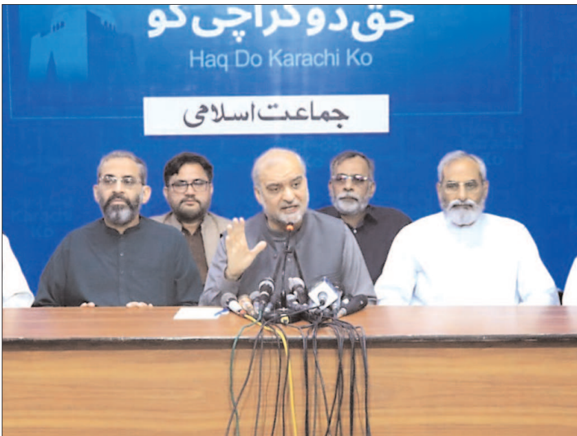
KARACHI: Jamaat-e-Islami Pakistan Ameer Hafiz Naeem Ur Rehman addressing a press conference.

He also participated in the distribution of langar (free meals) among devotees, continuing the tradition of serving the community.