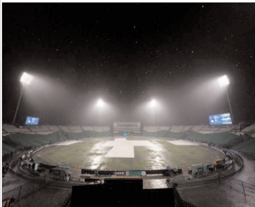
LAHORE: The covers protect the pitch as rain delays play during the ICC Champions Trophy 2025 group match between Afghanistan and Australia.

Rashid Khan chipped in with a 17-ball 19 with two boundaries. Ben Dwarshuis was the best Australian bowler with 3-47. Zampa took 2-48 and Johnson finished with 2-49.