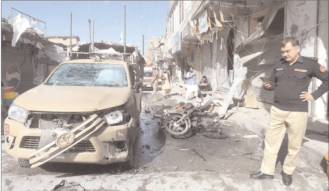
QUETTA: An official inspecting the spot after blast near Jan Muhamamd Road.