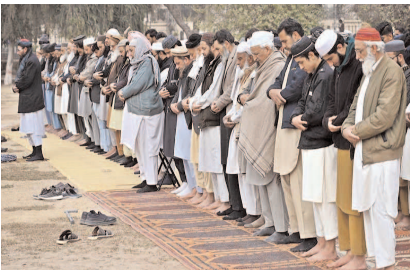
RAWALPINDI: People offering Namaz-e-Istisqa" (prayer for rain) at Allama Iqbal Park.