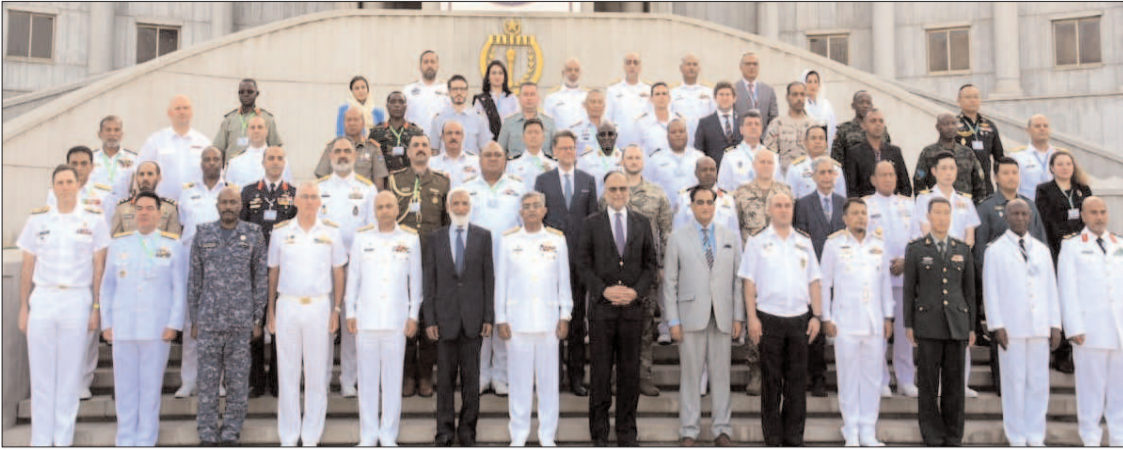
KARACHI: A group photo of participants on concluding session in Aman Dialogue 2025.