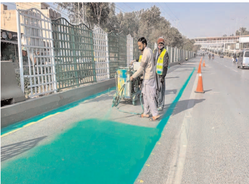
RAWALPINDI: Staffers of Rawalpindi Development Authority (RDA) marking the dedicated bike lane on Old Airport Road.

Cases have been registered against the arrested suspects under the Narcotics Control Act and further investigations are under process.