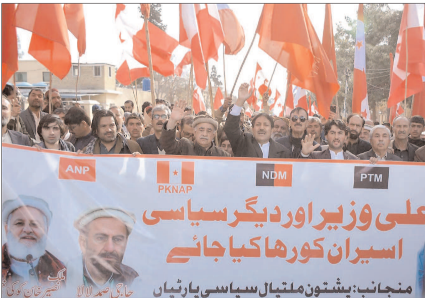
QUETTA: Activists of different political parties holding a protest rally in front of Balochistan Assembly.

The Minister maintained, developmental works are being carried out keeping in view the necessities of the area. He added, beside health, education and communication, agriculture, irrigation and forestry sectors are also among his priorities. He said that it is his mission to make the district of Karak, which is rich in natural resources, an ideal district of the province.