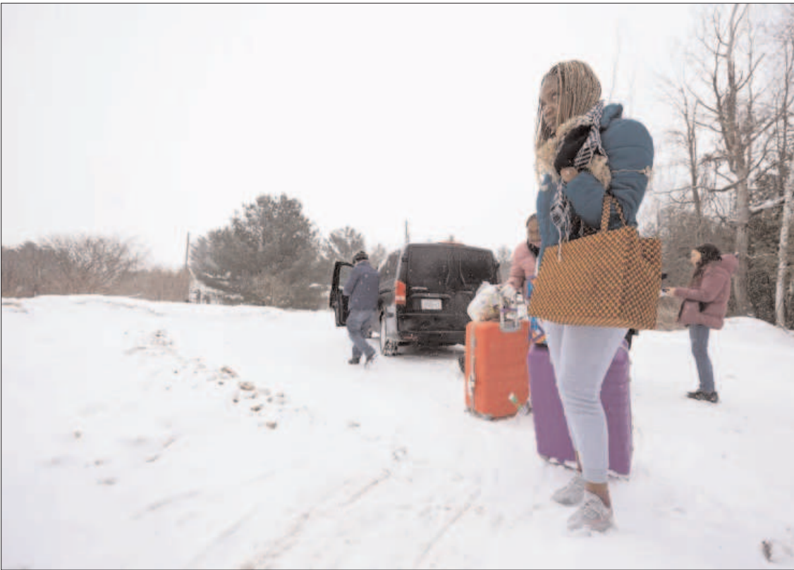
NEW YORK: Two women arrive by taxi to cross into Canada at US border in Champlain.

The DR Congo's President, Félix Tshisekedi, opted to appear at the summit via video link. Prime Minister Judith Suminwa was there in person. There was no immediate response from Suminwa or the Congolese delegation to the joint communique. Kenyan President William Ruto, the current EAC chairperson, stressed military solutions alone could not resolve the crisis. "We must resist the temptation to think that we can somehow shoot or bombard our way into a solution in the face of such a complex situation," he said. Tanzanian President Samia Suluhu Hassan underscored a "collective responsibility" of regional leaders to end the conflict, saying "history will judge us harshly."