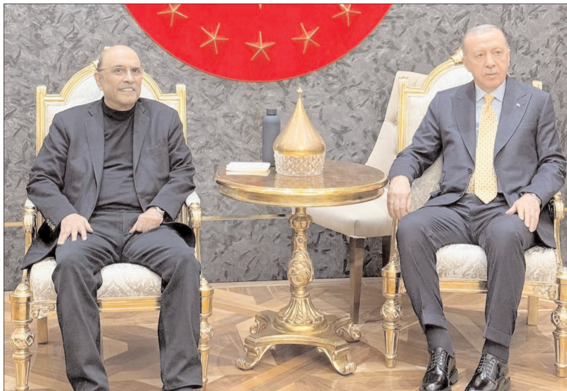
ISTANBUL: President Asif Ali Zardari meeting with Turkish President Recep Tayyip Erdogan, during his brief stop-over airport.