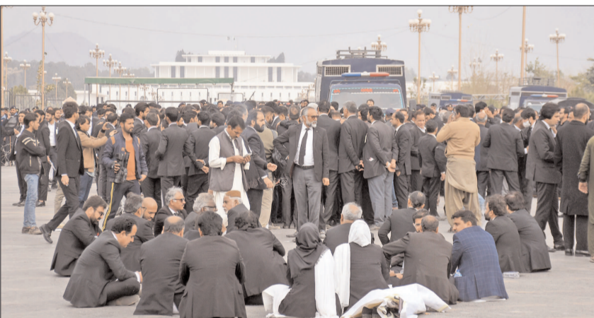
ISLAMABAD: Lawyers holding a protest against 26th Amendment at D-Chowk.

The construction of the Wahga Tourism Corridor was also highlighted as an exceptional initiative. The meeting was attended by senior party leaders, including Senator Pervaiz Rashid, Rana Sanaulлах, Punjab's senior minister Marriyum Aurangzeb, and others.