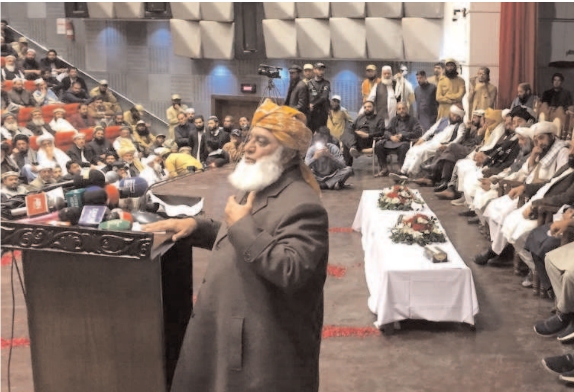
PESHAWAR: Amir Jamiat Ulema-e-Islam (Fazl) Maulana Fazl ur Rehman addressing the gathering of Mushawerti Jirga at Nishtar Hall.